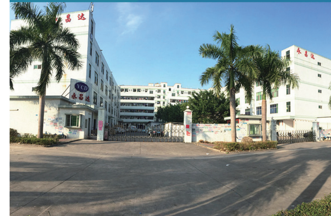
Shenzhen Yong Chang Da (YCD)