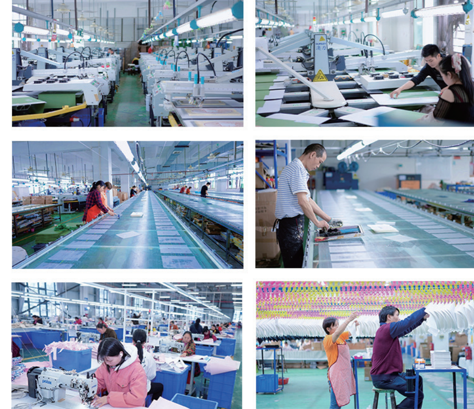
Shenzhen Yong Chang Da (YCD)