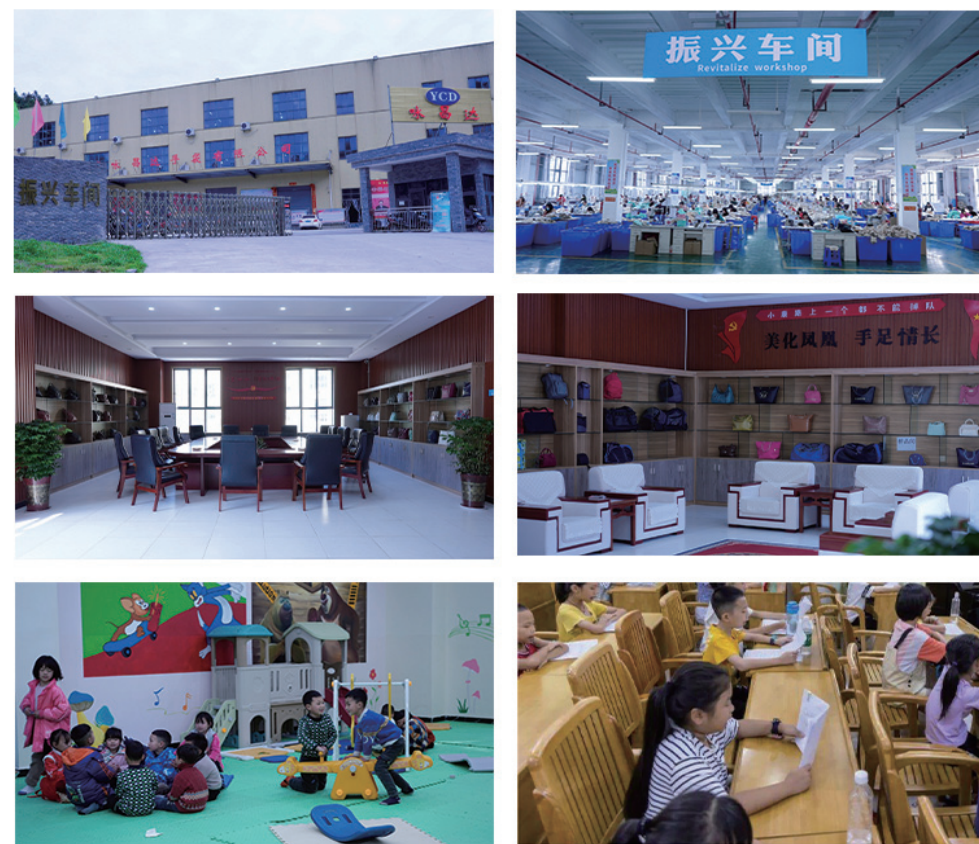
Hunan Fenghuang Yong Chang Da (YCD)