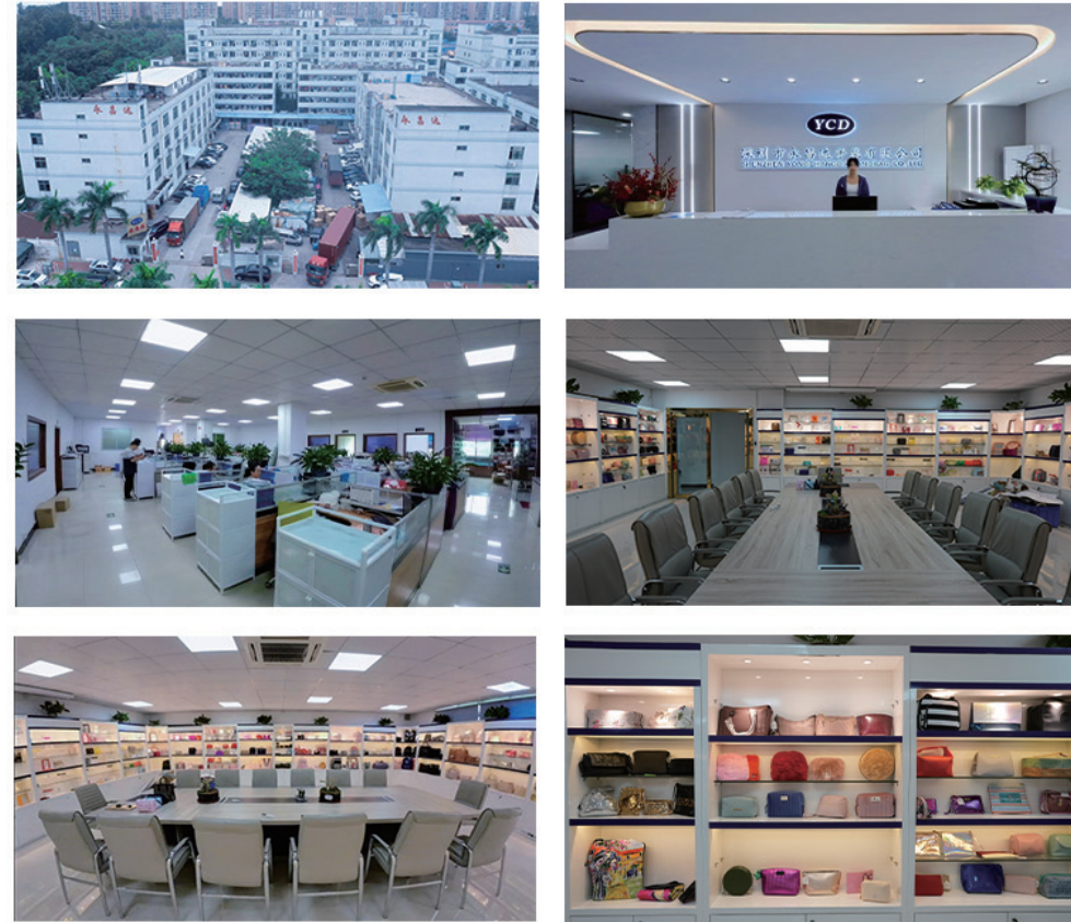
Shenzhen Yong Chang Da (YCD)