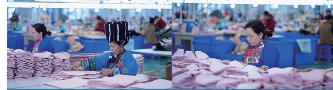
Hunan Fenghuang Yong Chang Da (YCD)

Core philosophy of the company: strict requirements, and achieving the best.