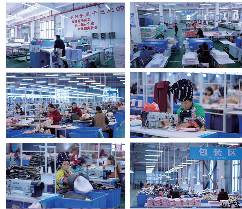
Hunan Fenghuang Yong Chang Da (YCD)