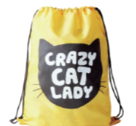
Item: XY-D-001 Material: 210D polyester Size: L38*H46cm