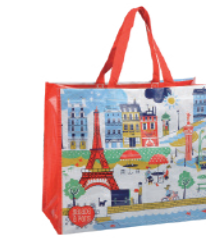
Item: XY-A-005 Material: 120g PP woven Size: L45*H40*D15 cm Handle:2.5*60cm