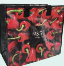
Item: XY-I-004 Material: 140g pp woven Size: L43*H37*D20 cm Handle: 3.5*68cm