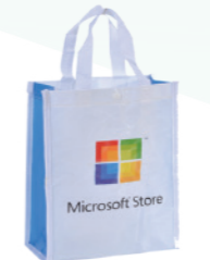
Item: XY-G-001 Material: 120g non woven Size: L45*H40*D19 cm Handle: 2.5*60cm