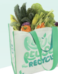
Item: XY-B-002 Material: 90g RPET non woven Size: L45*H39*D21cm Handle: 4*(75+48)cm