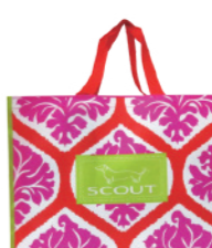
Item: XY-G-006 Material:180g non woven Size: L47*H34*D21.5 cm Handle:3*56cm