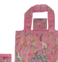
Item: XY-D-003 Material: 190T polyester Size: L45*H(35+28) cm Handle: 6*50cm