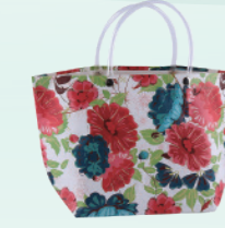
Item: XY-A-002 Material: 120g PP woven Size: L41*H31*D20 cm Handle:55cm*2pcs