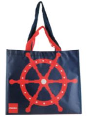
Item: XY-E-002 Material: 120g rPET stitch-bond fabric Size: L45*H39*D21 cm Handle: 3.5*48cm & 3.5*75cm