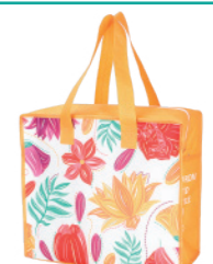
Item: XY-I-002 Material: 90g RPET non woven Size: L43*H38.5*D20 cm Handle: 3*70cm