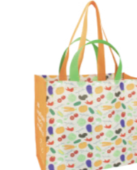
Item: XY-B-005 Material: 90g RPET non woven Size: L45*H39*D21cm Handle: 4*(75+48)cm