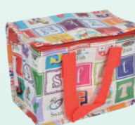
Item: XY-I-006 Material:120g pp woven Size: L22*H15*D14 cm Handle: 3*130cm