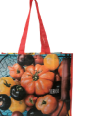
Item: XY-E-003 Material:120g rPET stitch-bond fabric Size: L45*H39*D21cm Handle: 3.5*48cm & 3.5*75cm