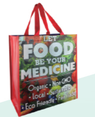
Item: XY-G-008 Material:120g non woven Size: L33*H39*D20 cm Handle:2.5*55cm