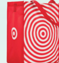
Item: XY-B-001 Material: 80g PET non woven Size: L30.4*H40.6*D19cm Handle: 2.5*60cm