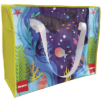
Item: XY-I-001 Material: 160g pp woven Size: L52*H41*D20 cm Handle: 3*76cm