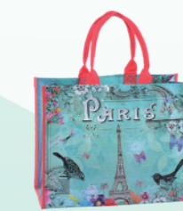
Item: XY-A-008 Material:160g pp woven Size: L41*H31*D20 cm Handle:3.5*55cm