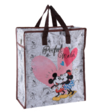
Item: XY-I-003 Material: 130g pp woven Size: L45*H40*D15 cm Handle: 3*50cm