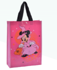
Item: XY-G-002 Material: 120g non woven Size: L30*H41*D10.5 cm Handle:3*44cm