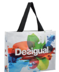
Item: XY-G-007 Material:120g non woven Size: L40*H43*D18 cm Handle:3.5*65cm