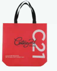
Item: XY-H-001 Material: 100g non woven Size: L33*H28*D8 cm Handle: 2.5*51cm