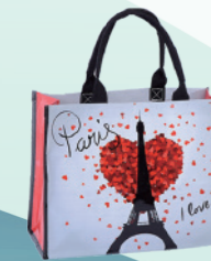
Item: XY-A-007 Material: 160g pp woven Size: L41*H31*D20 cm Handle:3.5*55cm