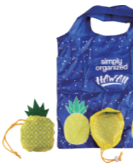
Item: XY-C-006 Material: RPET 210D Size: L37*H37.5 cm L9.5*H10.5 cm Handle: 6*31cm