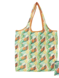
Item: XY-C-003 Material: RPET 190T Size: L50*H(40+5.5)cm