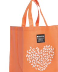
Item: XY-B-006 Material: 80g RPET non woven Size: L33*H37*D22cm Handle: 3*46cm