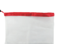
Item: XY-F-003 Material:PET mesh Size: L30.5*H20 cm