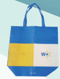
Item: XY-H-003 Material: 100g non woven Size: L40*H33*D16 cm Handle: 2.5*52cm