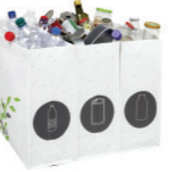
Item: XY-E-004 Material: 160g rPET stitch-bond fabric with double lamination Size: L40*H40*D17.5 cm Handle: 2.5*42cm