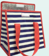
Item: XY-I-005 Material: 120g non woven Size: L22*H22.5*D15.5 cm Handle: 3*43cm