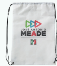
Item: XY-G-003 Material: 110g non woven Size: L35*H49.5cm Handle: 177cm *2pcs