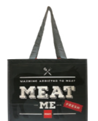
Item: XY-E-005 Material: 120g rPET stitch-bond fabric Size: L45*H39*D21 cm Handle: 3.5*48cm & 3.5*75cm