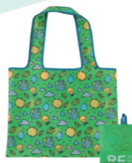
Item: XY-C-001 Material: RPET 210T Size: L45*H35 cm