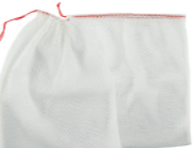
Item: XY-F-002 Material: PET mesh Size: L32.5*H33 cm