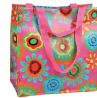
Item: XY-A-004 Material: 140g pp woven Size: L40*H45*D20 cm Handle: 3*45cm & 3*75cm