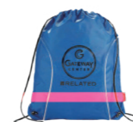
Item: XY-D-002 Material: 210D polyester Size: L40*H45cm