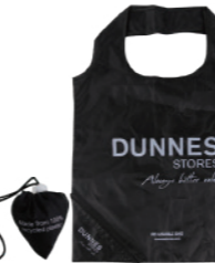
Item: XY-C-005 Material: RPET 190T Size: L37*H37.5 cm L9*H11 cm Handle: 6*58cm