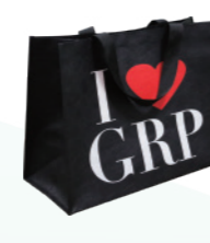
Item: XY-B-009 Material: 90g RPET non woven Size: L40*H30*D17cm Handle: 3*40cm