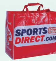
Item: XY-A-001 Material: 120g pp woven Size: L46*H39*D22 cm Handle: 3*34cm