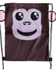
Item: XY-C-004 Material: RPET 210D Size: L32*H40 cm