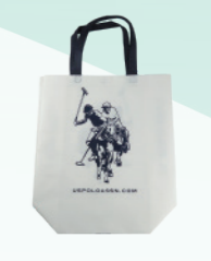
Item: XY-H-002 Material: 100g non woven Size: L39*H37.5*D15 cm Handle: 2.5*54cm