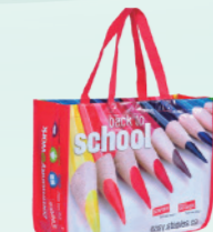
Item: XY-A-003 Material:120g pp woven Size: L40*H45*D20 cm Handle:2.5*60cm