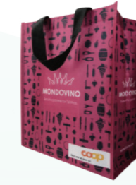
Item: XY-B-008 Material: 90g RPET non woven Size: L27*H32*D18.5cm Handle: 3*38cm