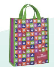
Item: XY-G-009 Material:120g non woven Size: L28*H35*D10 cm Handle:2.5*45cm