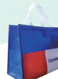
Item: XY-B-003 Material: 80g RPET non woven Size: L40*H32*D18cm Handle: 4*46cm