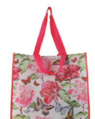
Item: XY-E-006 Material:120g rPET stitch-bond fabric Size: L45*H39*D21 cm Handle: 3.5*48cm & 3.5*75cm