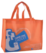
Item: XY-G-004 Material: 120g non woven Size: L40*H45*D20 cm Handle: 3*55cm