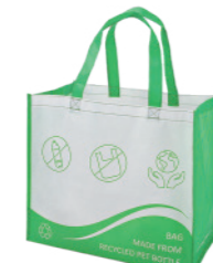
Item: XY-B-004 Material: 90g RPET non woven Size: L43*H37*D25cm Handle: 3*58cm