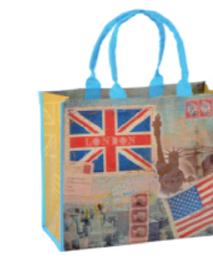
Item: XY-A-006 Material:160g pp woven Size: L41*H31*D20 cm Handle:3.5*55cm