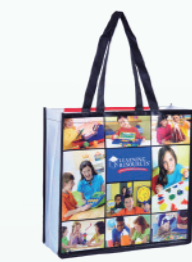
Item: XY-A-009 Material:120g pp woven Size: L41*H31*D20 cm Handle:3.5*55cm