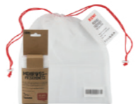
Item: XY-F-001 Material: 28g PET mesh Size: L27.5*H33cm