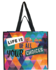
Item: XY-E-001 Material: 120g rPET stitch-bond fabric Size: L45*H39*D21 cm Handle: 3.5*48cm & 3.5*75cm