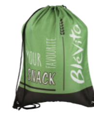
Item: XY-C-002 Material: RPET 210D Size: L33*H44 cm