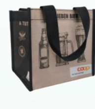
Item: XY-B-007 Material: 90g RPET non woven Size: L20.5*H19*D15.5cm Handle: 3*42cm