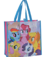
Item: XY-G-005 Material: 120g non woven Size: L35*H34*D14 cm Handle:2.5*50cm