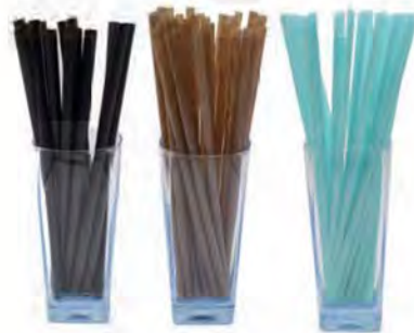
Disposable Injection Products