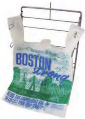
T-shirt Shopping Bags