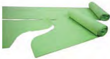
Domestic Bin Liners