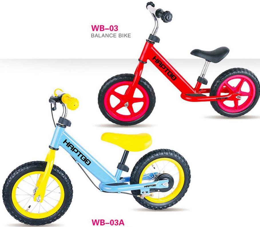
WB-03A BALANCE BIKE