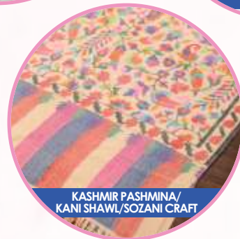
KASHMIR PASHMINA/ KANI SHAWL/SOZANI CRAFT