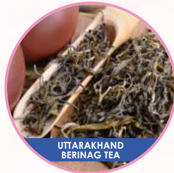
UTTARAKHAND BERINAG TEA