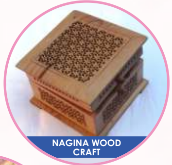
NAGINA WOOD CRAFT