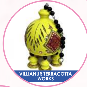
VILLIANUR TERRACOTTA WORKS