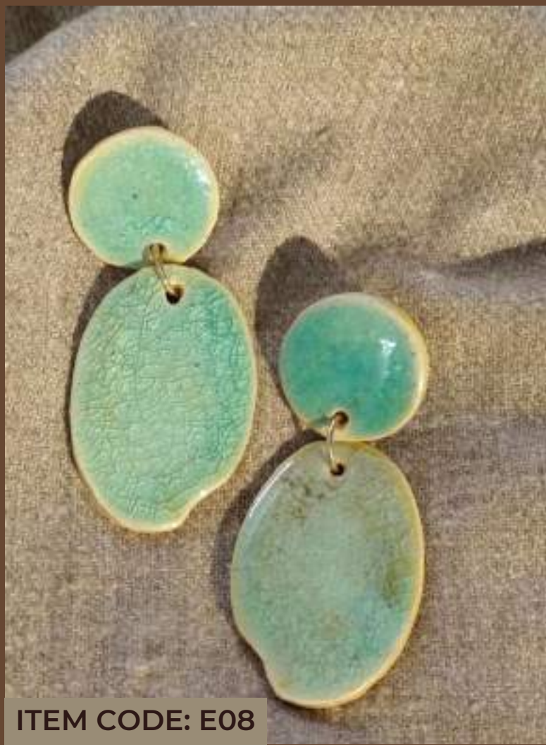
ITEM CODE: E08