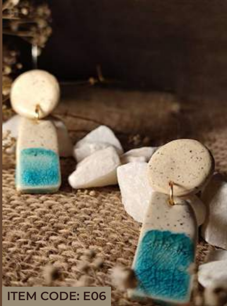
ITEM CODE: E06