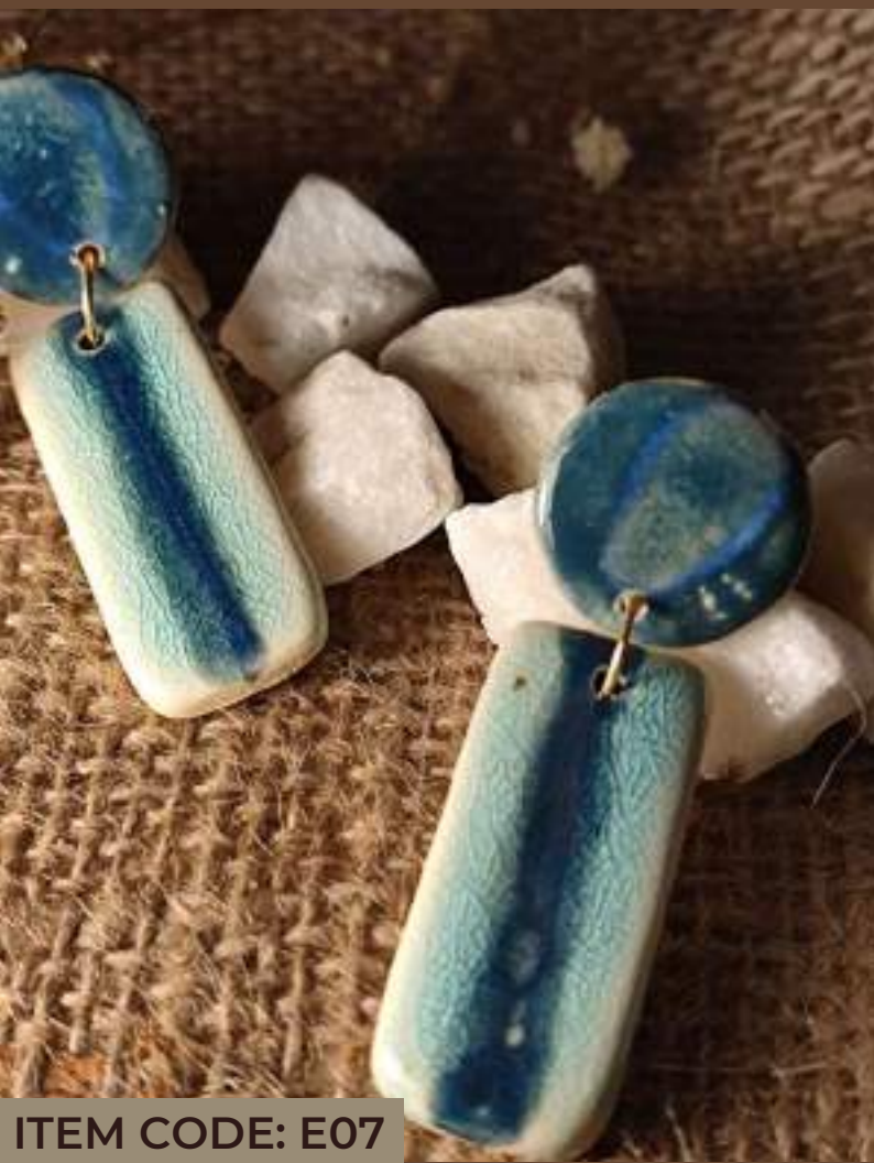
ITEM CODE: E07