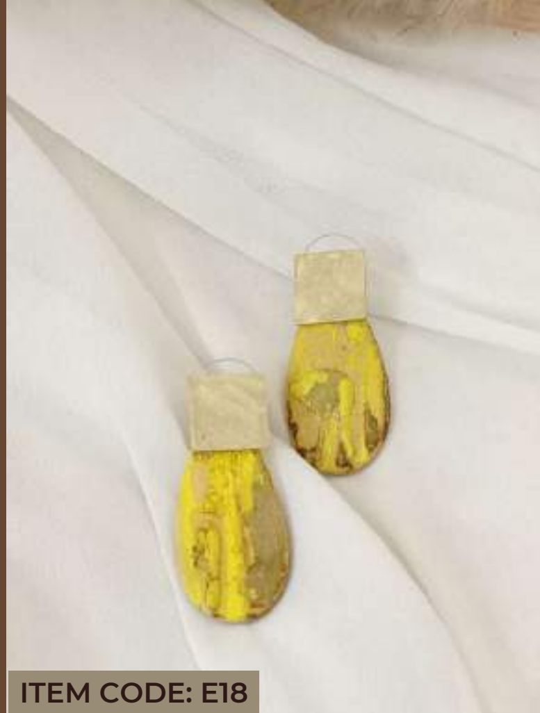
ITEM CODE: E18

A touch of gold and chic with our gold plated brass and ceramic earrings!