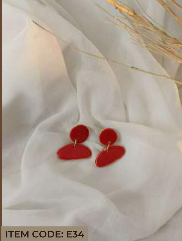
ITEM CODE: E34

Our POP series enables you to uplift boring outfits with bright dollops of colors which bring life to boring outfits.