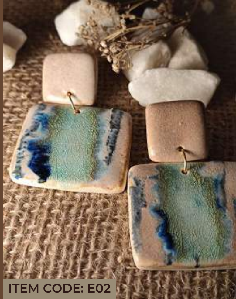
ITEM CODE: E02