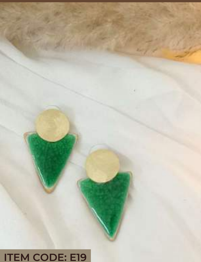
ITEM CODE: E19

A touch of gold and chic with our gold plated brass and ceramic earrings!