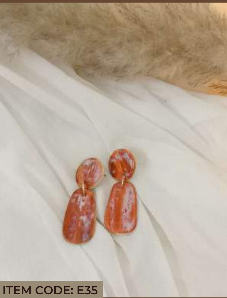
ITEM CODE: E35

Our POP series enables you to uplift boring outfits with bright dollops of colors which bring life to boring outfits.