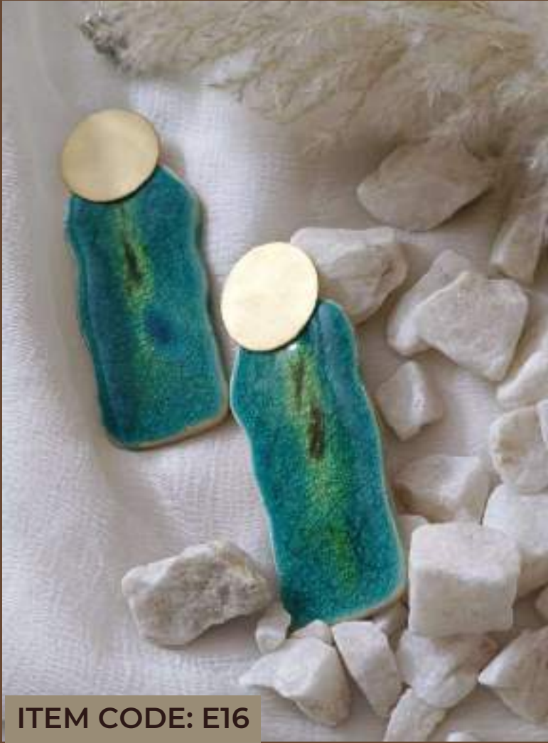
ITEM CODE: E16