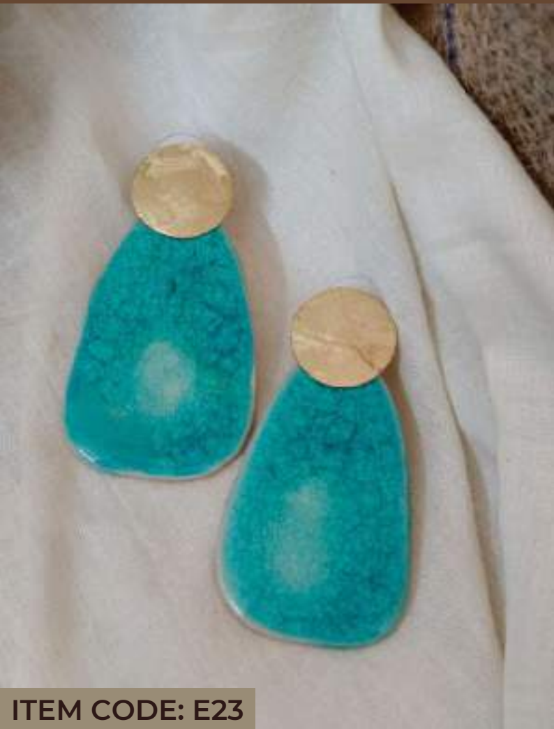
ITEM CODE: E23

Discover boundless colors, designs and textures!