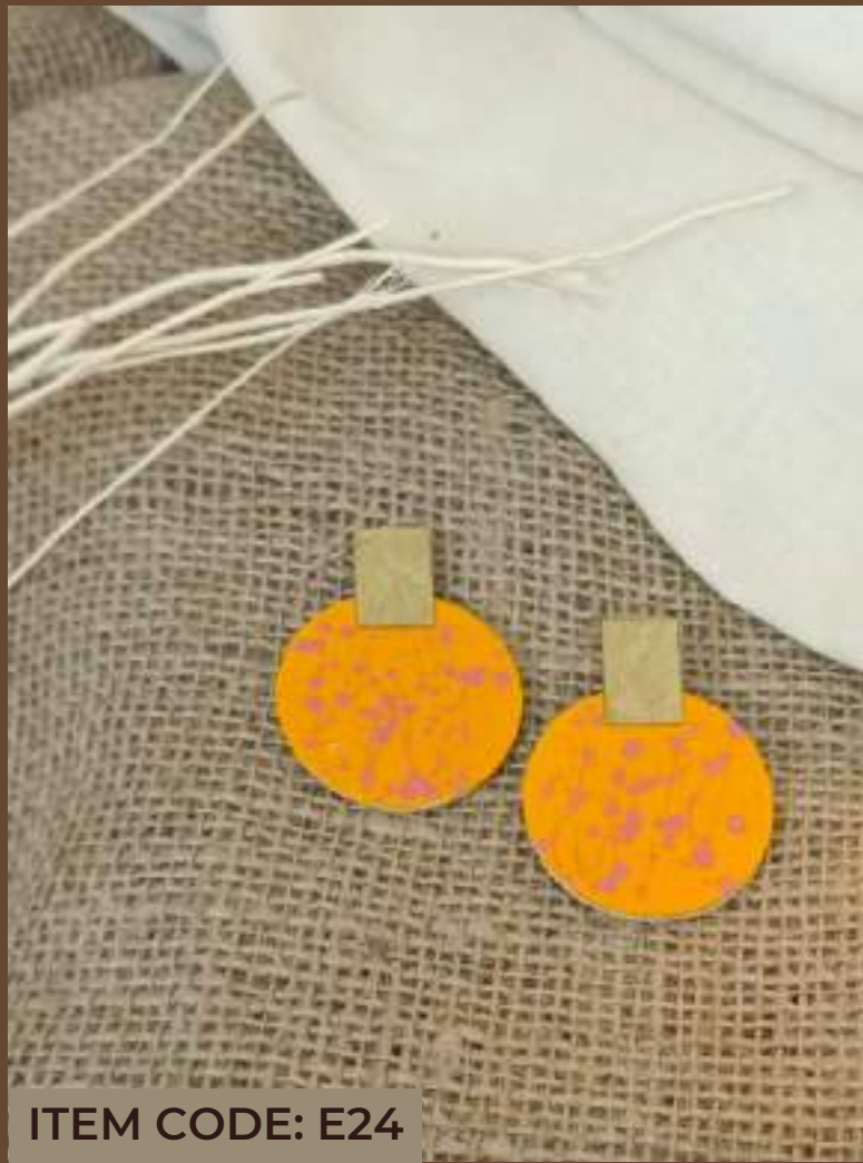
ITEM CODE: E24