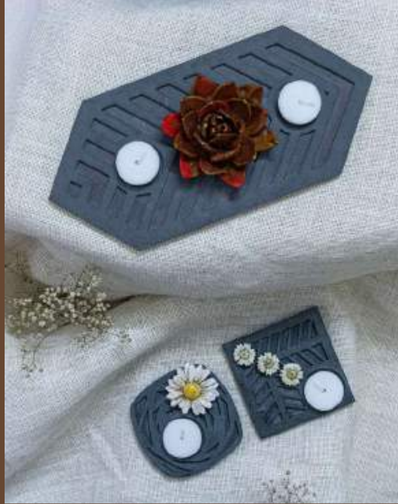
Candle Tray with ceramic flower Use it as a decorative center piece or a tray