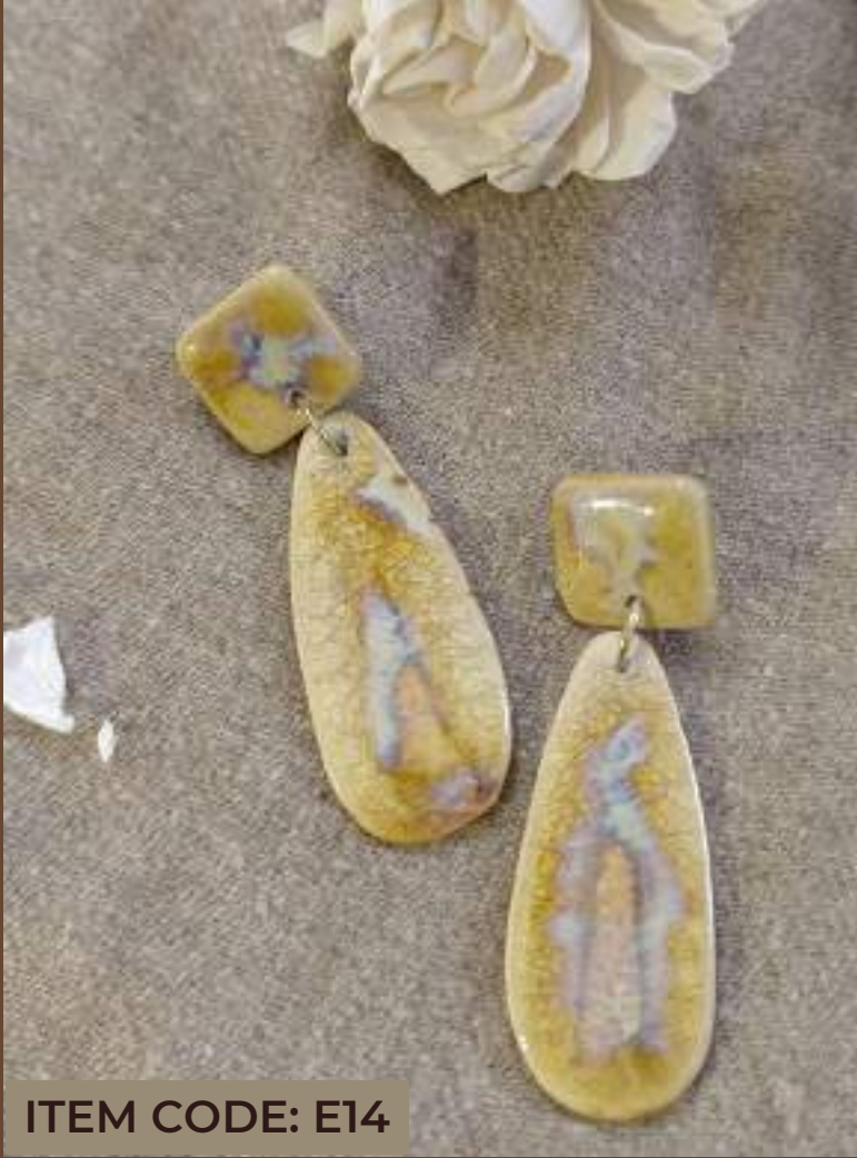
ITEM CODE: E14

Statement is not your thing? We've got you covered! Our pieces make a statement without necessarily being big and bold.