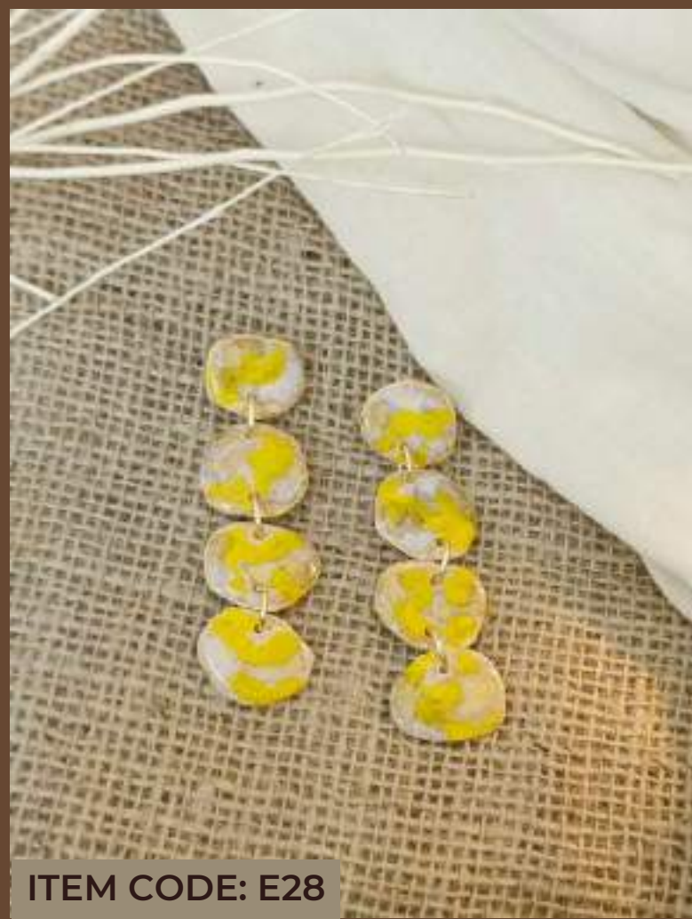
ITEM CODE: E28