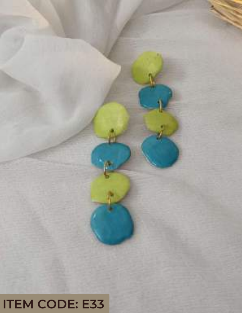
ITEM CODE: E33