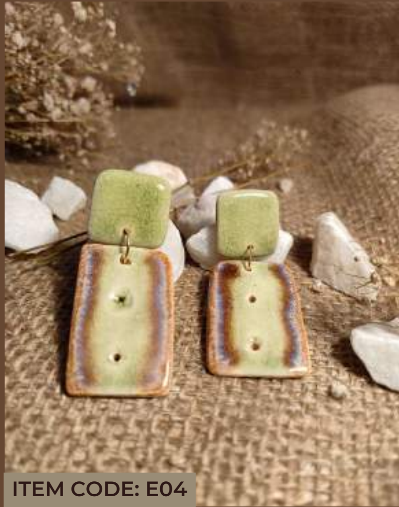
ITEM CODE: E04