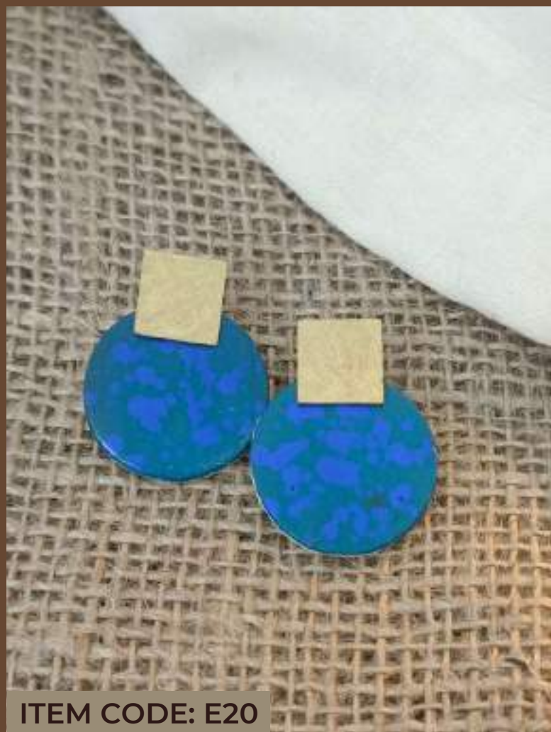
ITEM CODE: E20