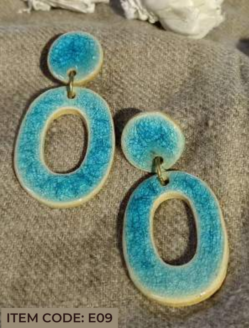
ITEM CODE: E09