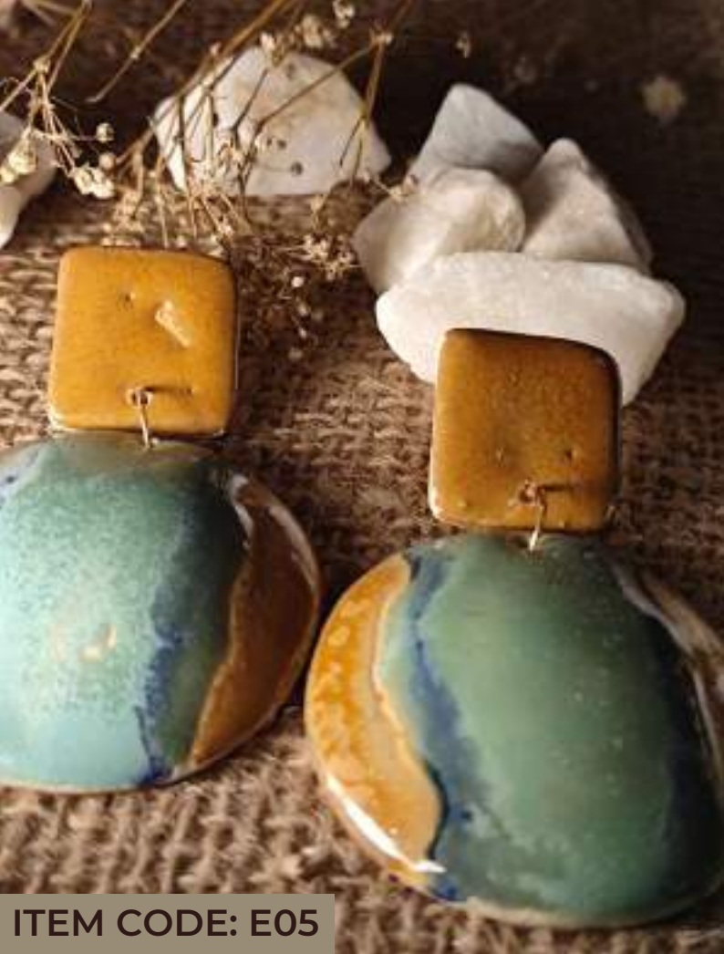
ITEM CODE: E05