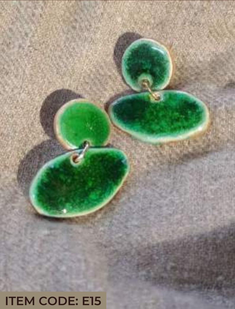
ITEM CODE: E15

Statement is not your thing? We've got you covered! Our pieces make a statement without necessarily being big and bold.