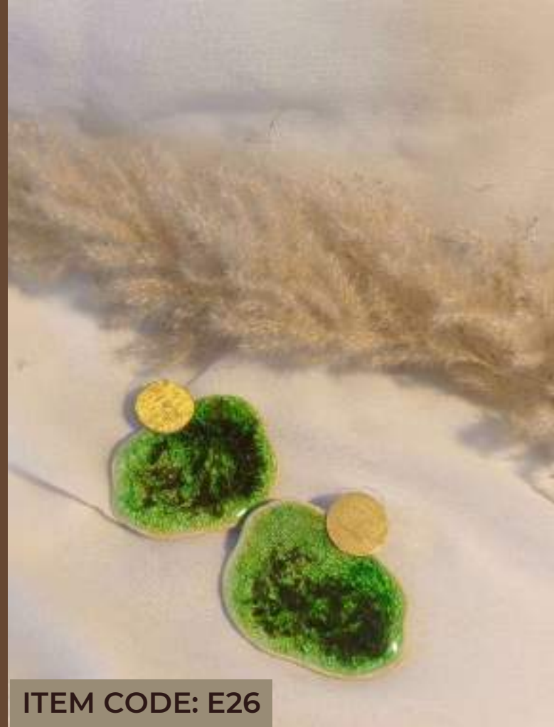
ITEM CODE: E26

Choose from a variety of shapes, glazes & shape factors