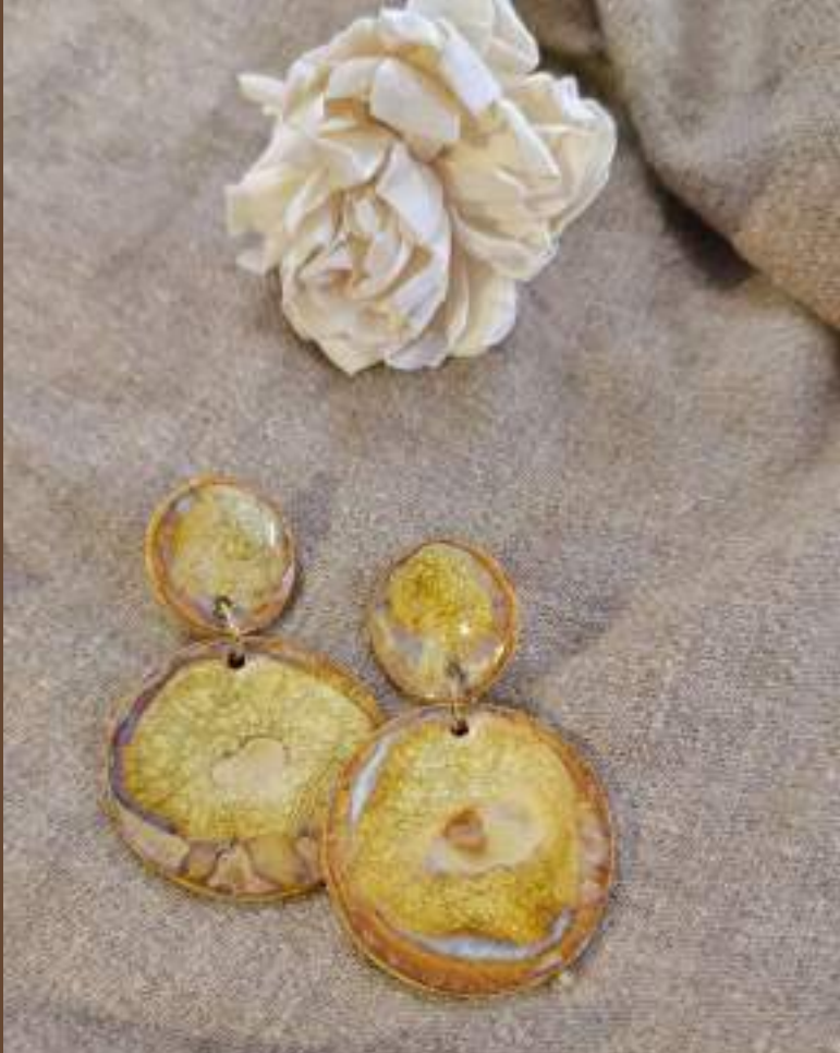
ITEM CODE: E12