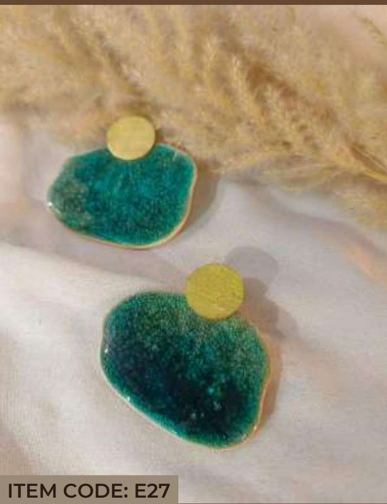
ITEM CODE: E27

Choose from a variety of shapes, glazes & shape factors