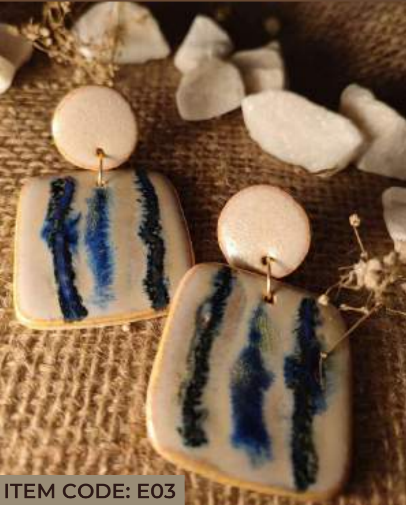
ITEM CODE: E03