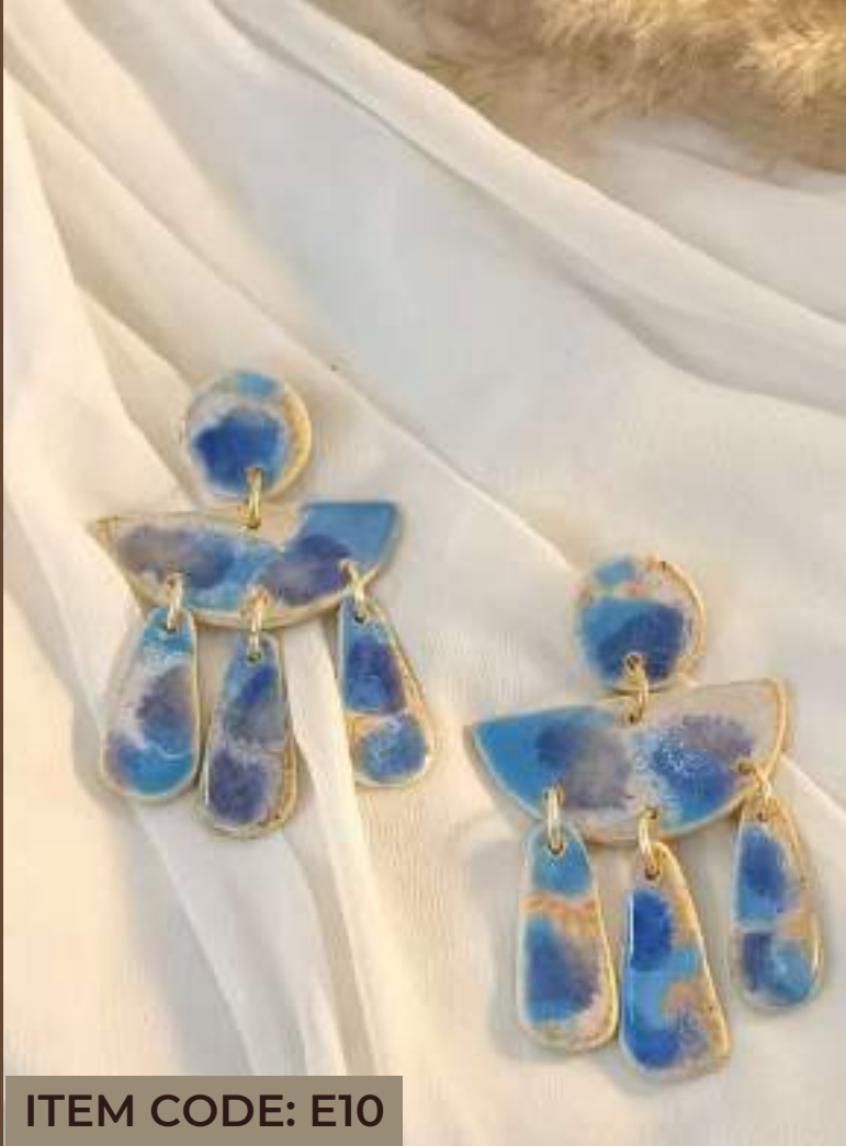
ITEM CODE: E10

Be spoilt for choice with our gamut of stylish earrings.