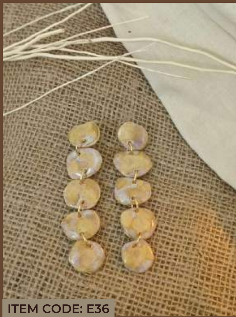
ITEM CODE: E36