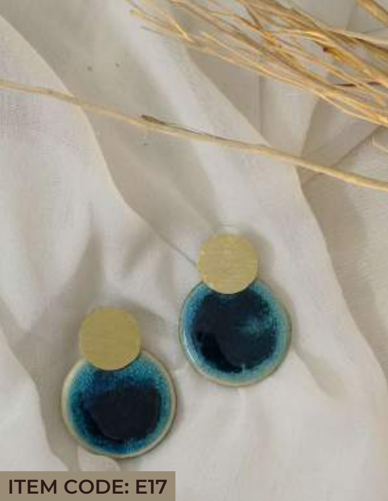
ITEM CODE: E17