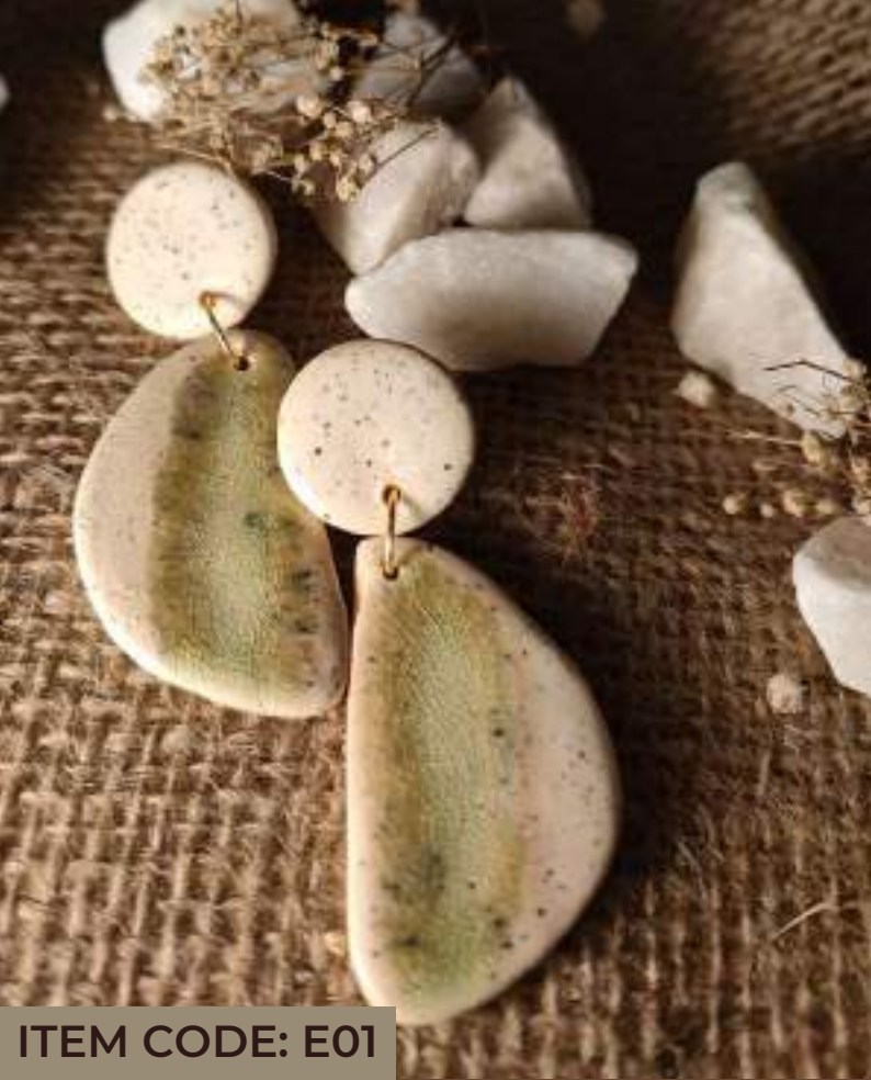
ITEM CODE: E01