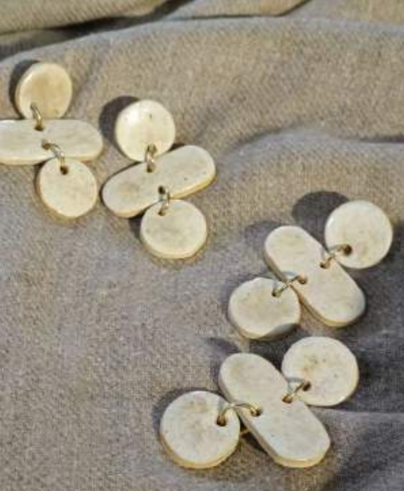
ITEM CODE: E11

Be spoilt for choice with our gamut of stylish earrings.