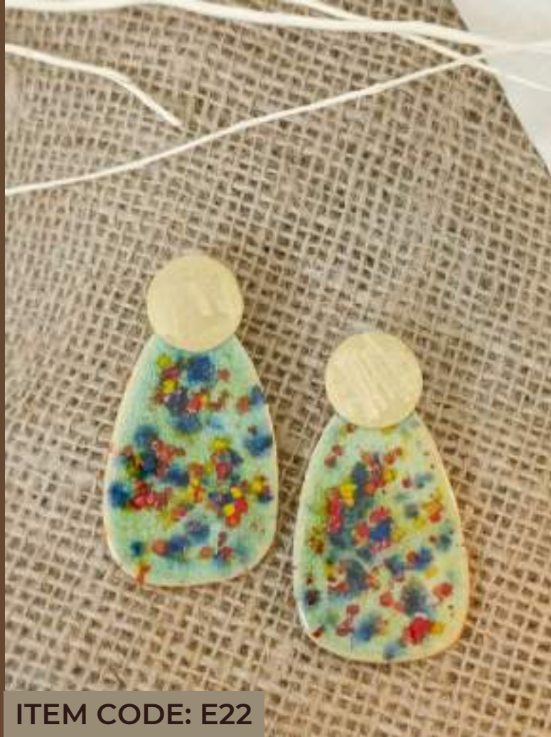
ITEM CODE: E22

Discover boundless colors, designs and textures!