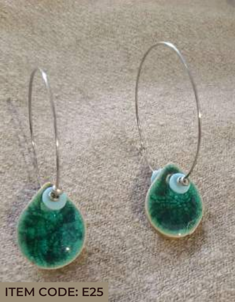
ITEM CODE: E25