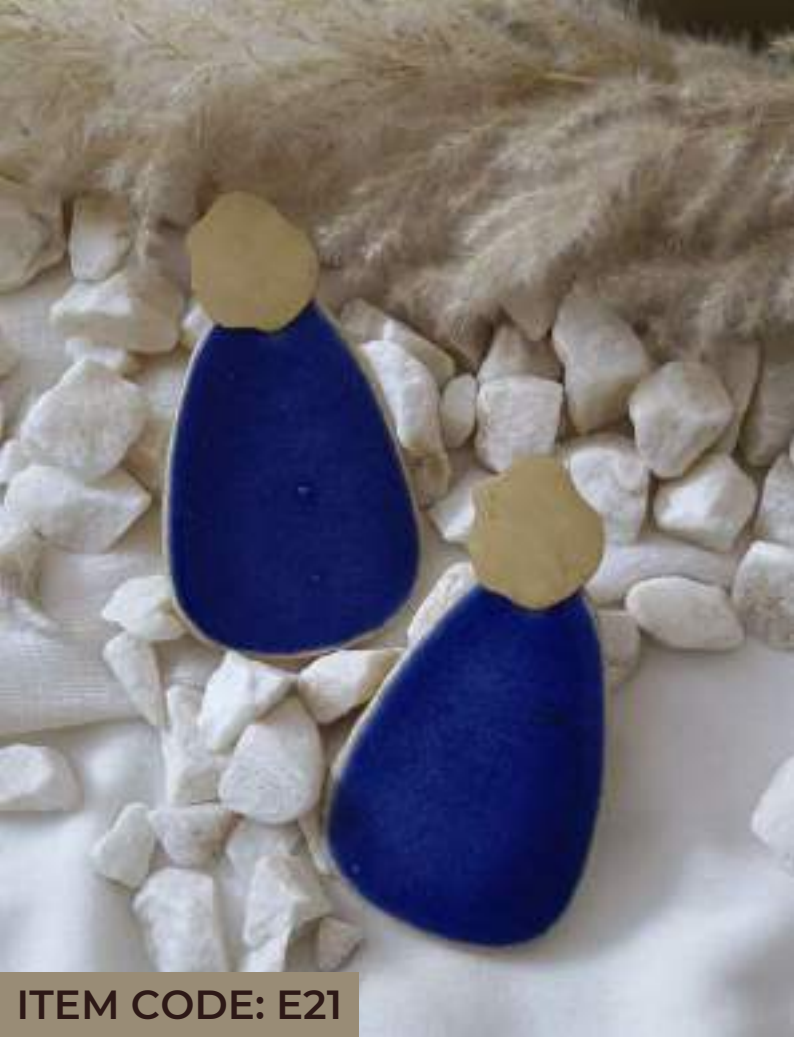
ITEM CODE: E21