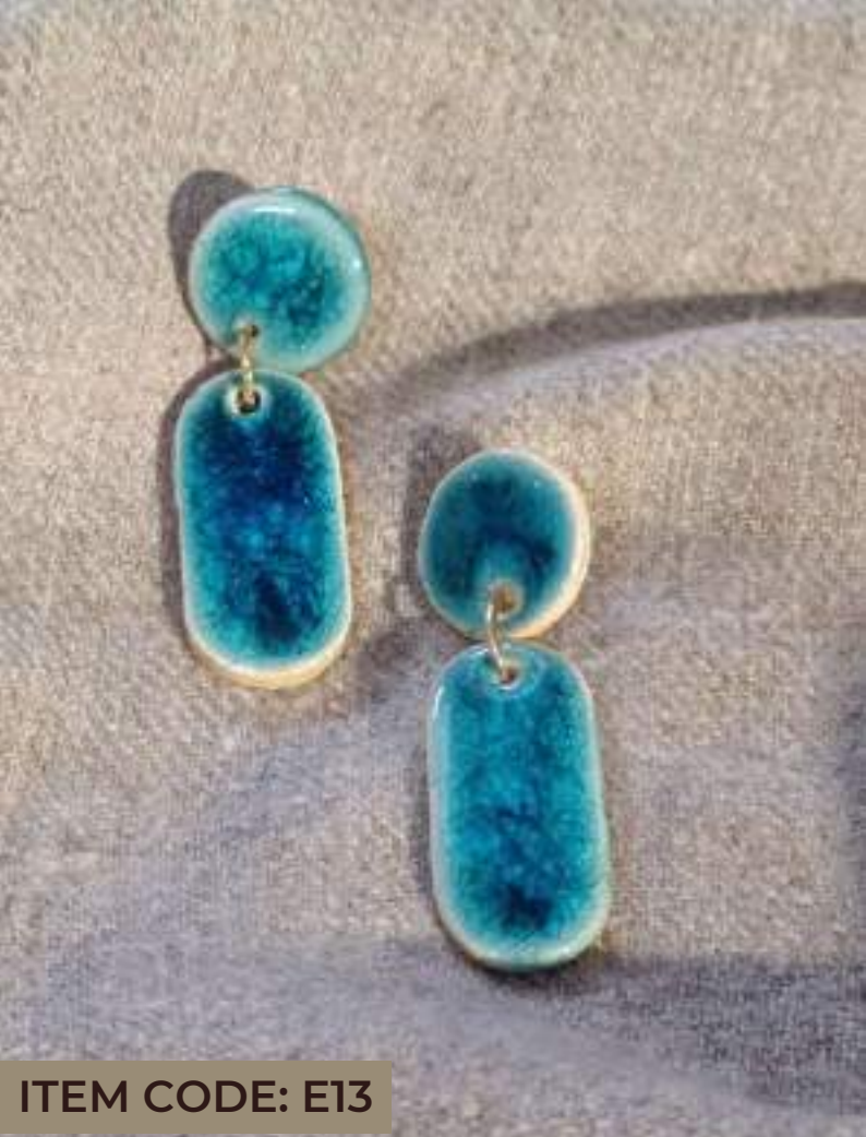
ITEM CODE: E13