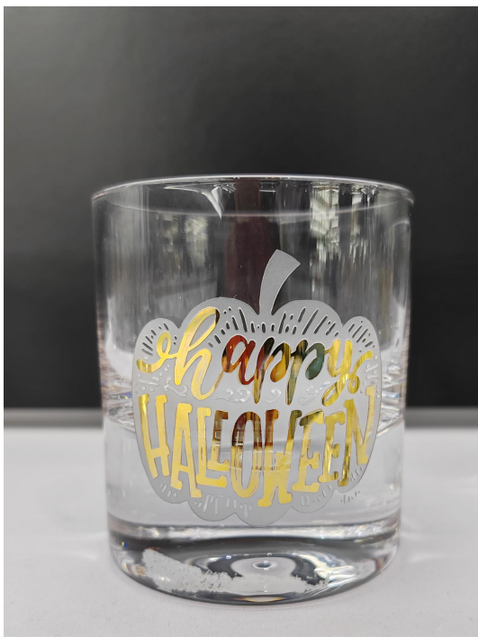
ITEM NO.: WX135-159