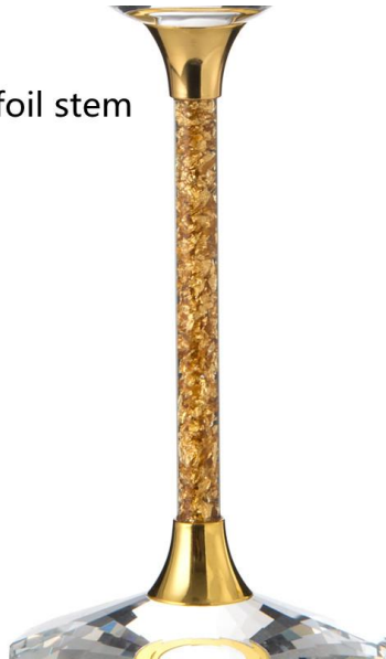
Gold foil stem