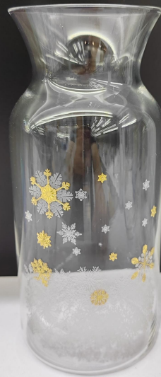
ITEM NO.: WX135-054