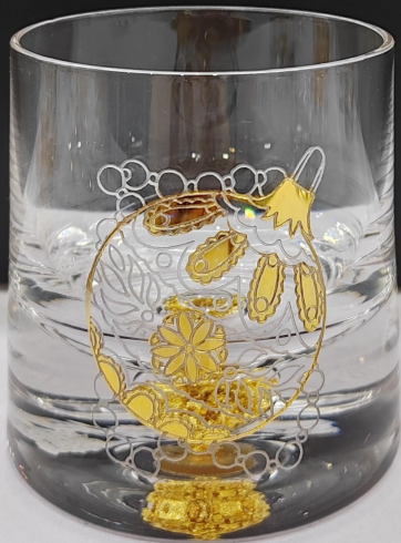
ITEM NO.: WX135-184