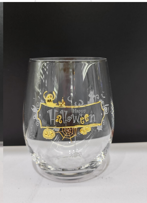
ITEM NO.: WX135-137