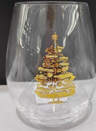
ITEM NO.: WX135-142