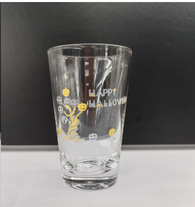
ITEM NO.: WX135-145