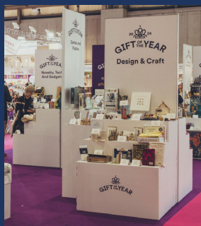
Product promotion in feature areas

Learn more about these and many more opportunities to help you make the most of your presence at Spring Fair! If you would like to explore additional options or discuss any of these opportunities, please contact our team.