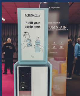
Hydration area sponsorships