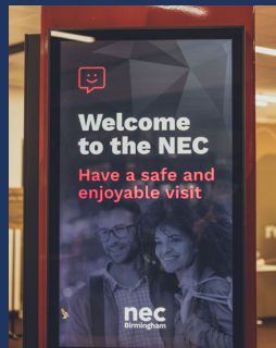
Digital screens around the NEC