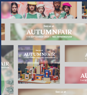
Sectorised webpage adverts