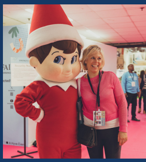
Exclusive licensed character sponsor