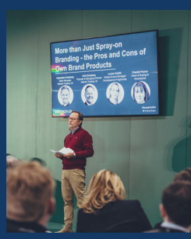
Sponsor a keynote speech session