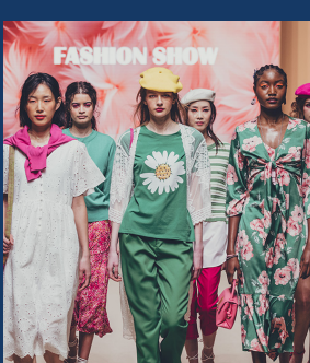
Create a catwalk scene