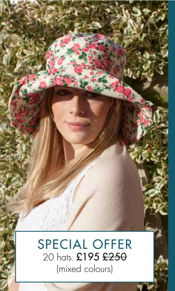
Also available in Pink, as shown on the model