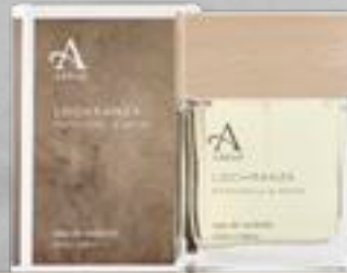
Eau De Toilette 100ml