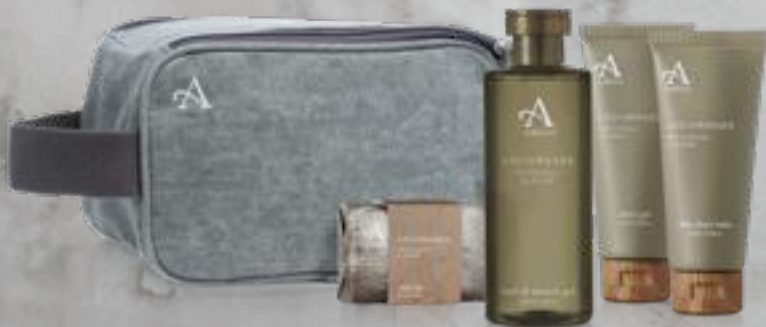
Mens Wash Bag Lochranza

Crisp, clean, mineral freshness. A balanced fragrance of Sea Salt, Labdanum, Myrrh, Clary Sage, Patchouli and Rockrose.