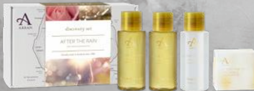
Discovery Set After the Rain

A selection of our two mens fragrances; one warm and woody, the other clean and crisp. Each representing the landscape of these two coastal locations - dramatically different and perfectly captured.