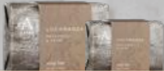
Soap 100g & 200g

A warm fragrance with a woody base of patchouli and vetiver, enhanced by the freshness of lemon and grapefruit. Earthy and enigmatic.