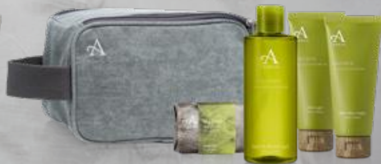
Mens Wash Bag Machrie