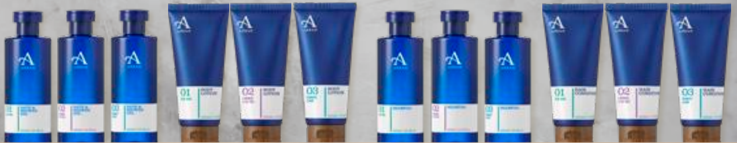
Bath & Shower Gel 300ml