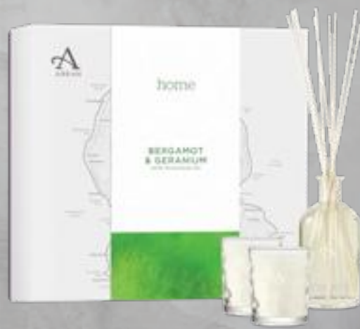
Home Fragrance Set Bergamot & Geranium 1 x 100ml, 2 x 8cl