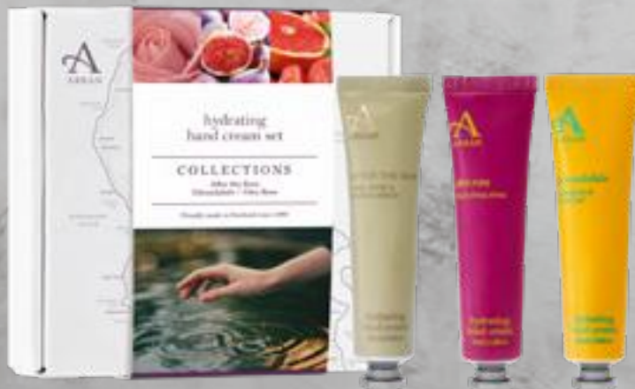
Hydrating Hand Cream Trio

A warm embrace of honeyed-fruit, crushed green leaf and the softness of coconut.