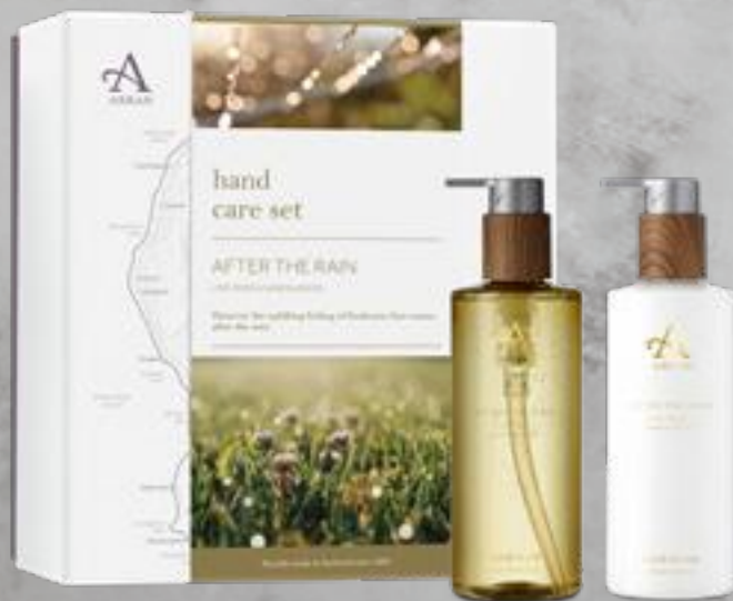
Hand Care Duo Hand Wash and Hand Cream 2x 300ml

Available in; After the Rain, Glenashdale, Glen Rosa, Glen Iorsa and Imachar.