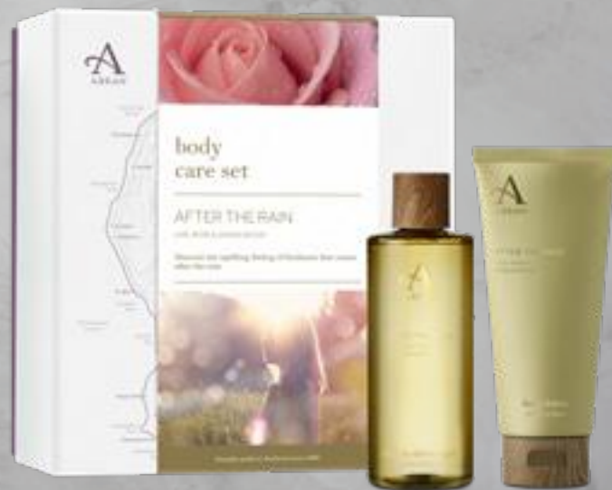
Body Care Duo Bath & Shower Gel and Body Lotion 300ml + 200ml

Available in; After the Rain, Glenashdale, Glen Rosa, Glen Iorsa and Imachar.