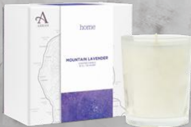
Limited Edition Scented Candle Mountain Lavender 1 x 35cl

Designed to bring you both a cooling and calming sensation.