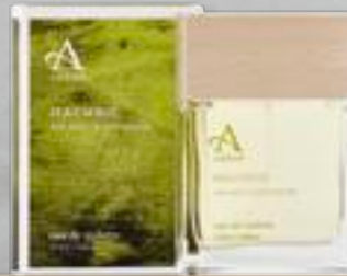
Eau De Toilette 100ml