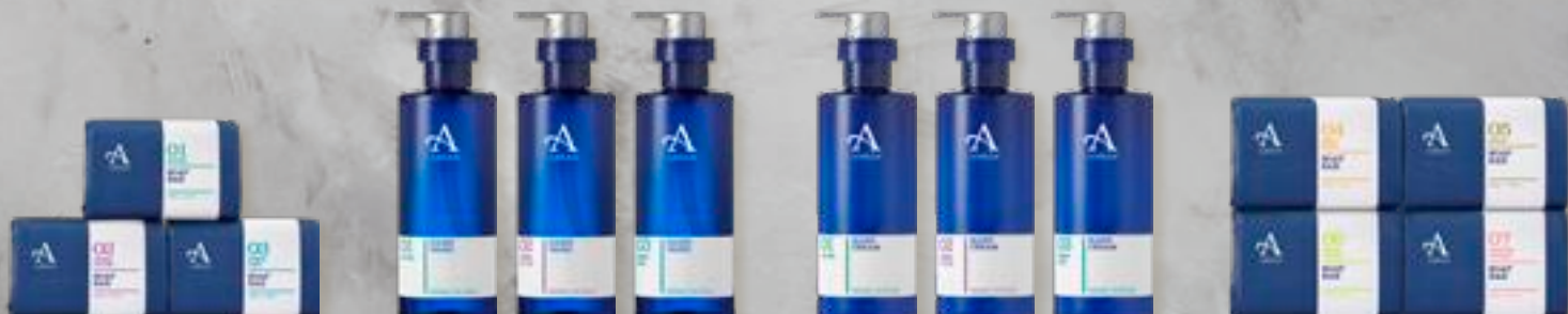
Soap 125g & 300g