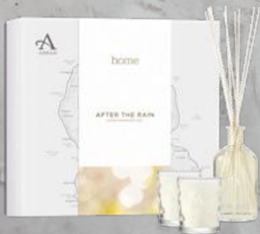
Home Fragrance Set After the Rain 1 x 100ml, 2 x 8cl

Each sets contains two scented 8cl candles plus a 100ml reed diffuser. Available in our two most popular HOME fragrances; After the Rain and Bergamot & Geranium.