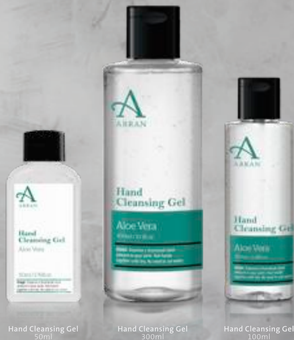
Hand Cleansing Gel 50ml