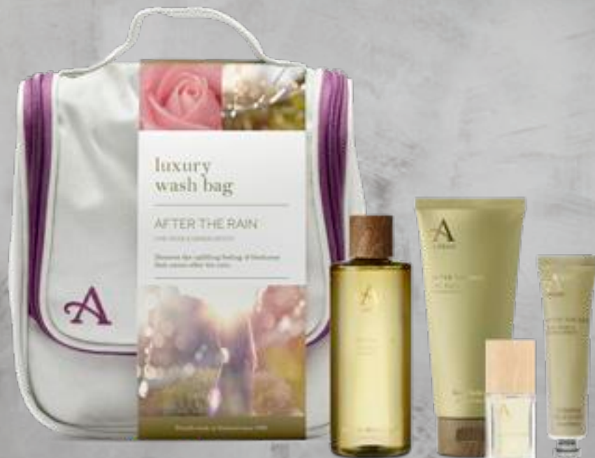
After the Rain Female Wash Bag Bath & Shower Gel , Body Lotion, Hydrating Hand Cream and Eau de Parfum

Made from durable cotton canvas with a water-resistant inner, this expertly crafted Wash Bag contains a full-sized Bath & Shower Gel, Body Lotion, Hydrating Hand Cream and Eau De Parfum in our most-loved fragrance, After the Rain.