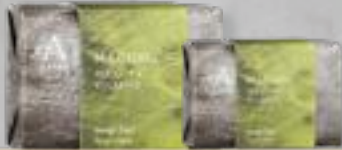
Soap 100g & 200g

Clean and crisp; Machrie is a balance of sea salt and clary sage stirred with the woody earthiness of rockrose.