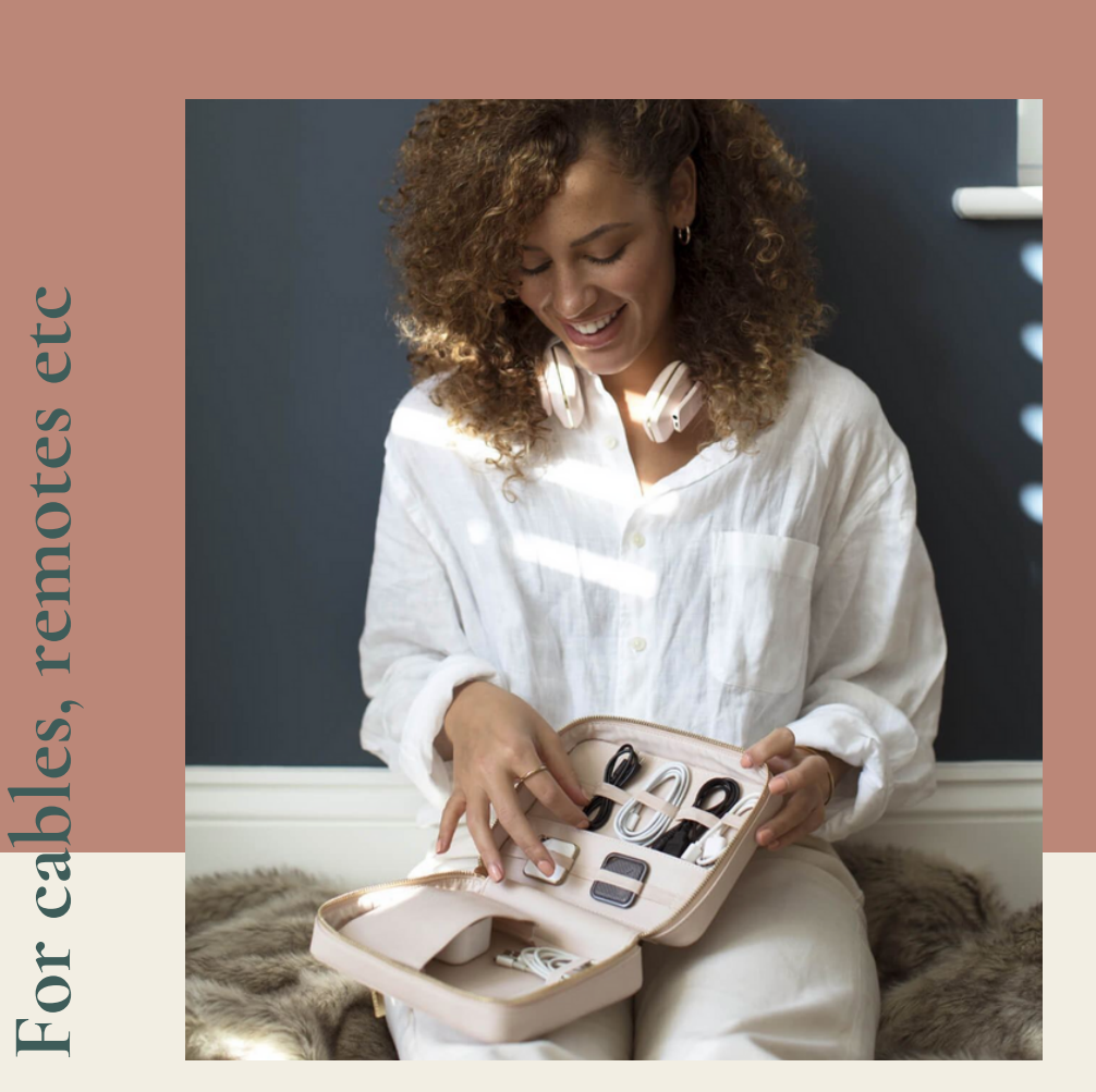
For at home & on the go