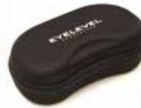
ZIP CASE MEDIUM