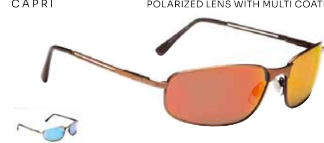
POLARIZED LENS WITH MULTI COATING