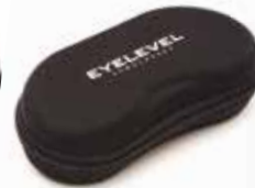
ZIP CASE LARGE