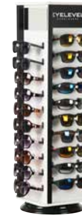
EYELEVEL COUNTER 40