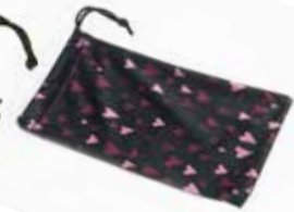
HEART PRINTED POUCH