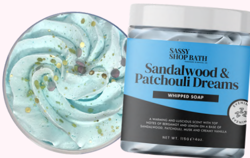
SANDALWOOD & PATCHOULI DREAMS

USE AS HAND WASH, MOISTURE-RICH BODY WASH AND SHAVING FOAM.