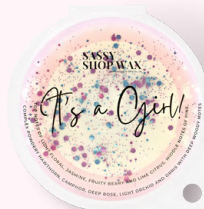
IT'S A GIRL