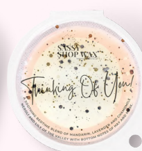
THINKING OF YOU