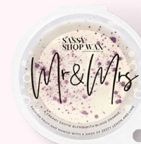
MR & MRS