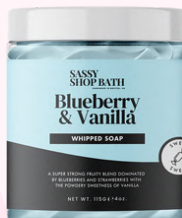
BLUEBERRY & VANILLA