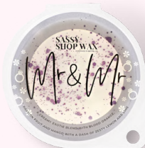
MR & MR