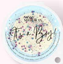
IT'S A BOY