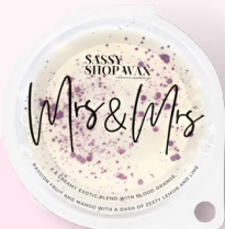
MRS & MRS