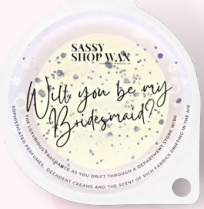
WILL YOU BE MY BRIDESMAID?