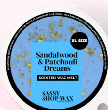
SANDALWOOD & PATCHOULI DREAMS