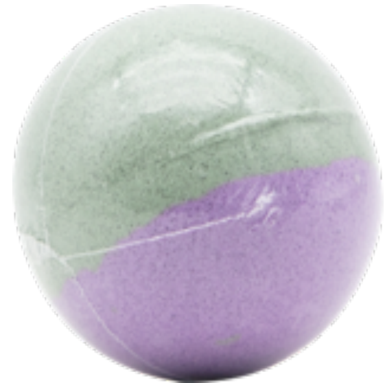
Item No. : ED23F404 Contents: 150g Bath Fizzer