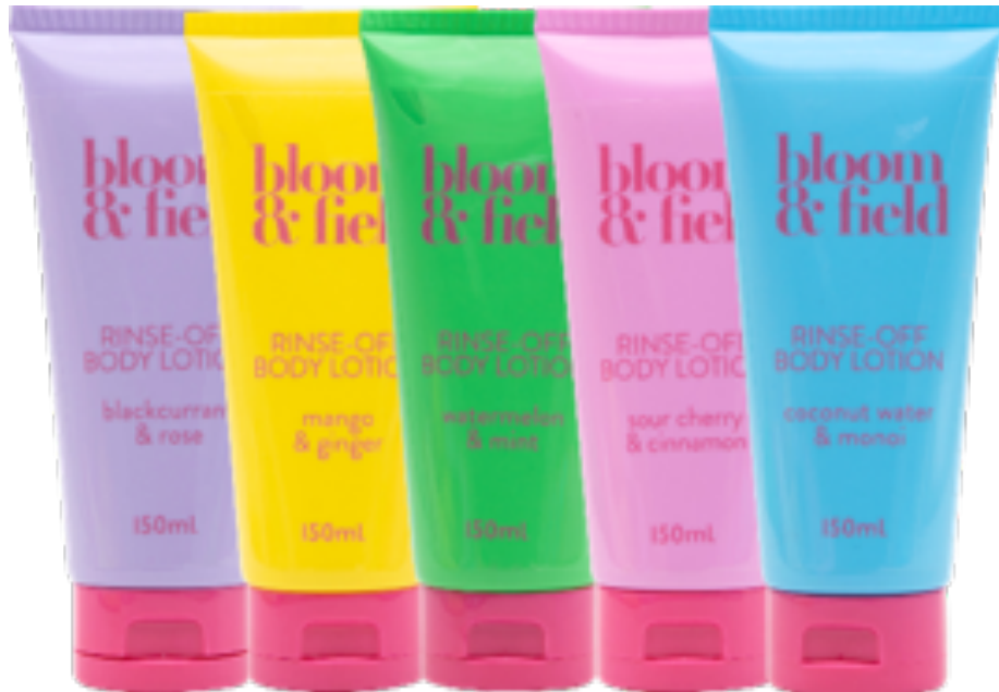
Item No. : ED23F304 Contents: 150ml Rinse-off Body Lotion Tube