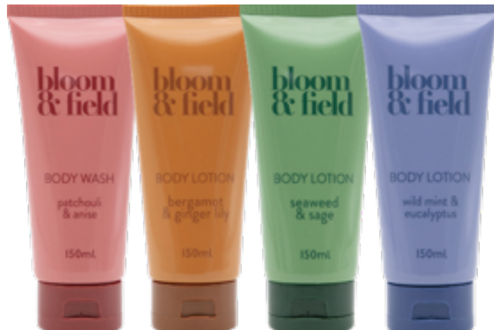
Item No. : ED23F402 Contents: 150ml Body Lotion Tube