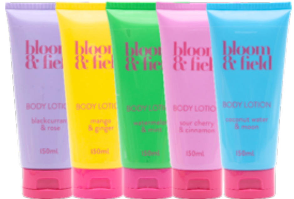
Item No. : ED23F302 Contents: 150ml Body Lotion Tube