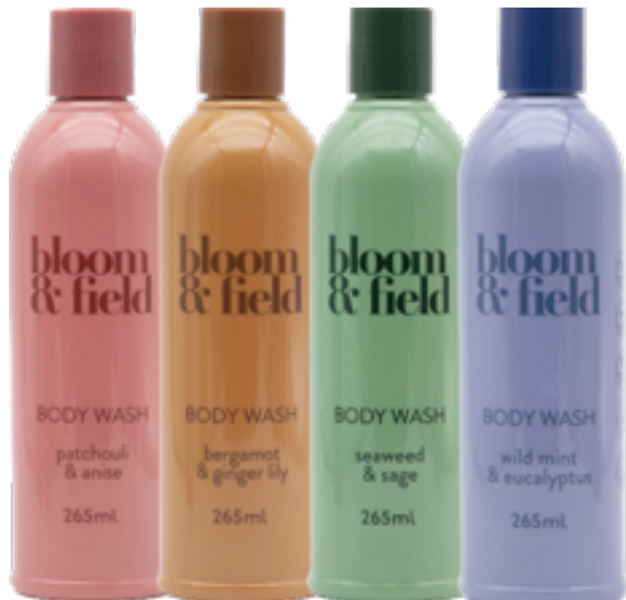
Item No. : ED23F401 Contents: 265ml Body Wash Disc-top Cap Bottle