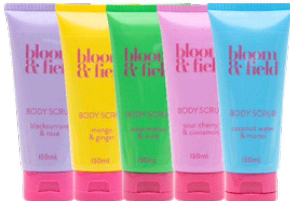
Item No. : ED23F303 Contents: 150ml Body Scrub Tube