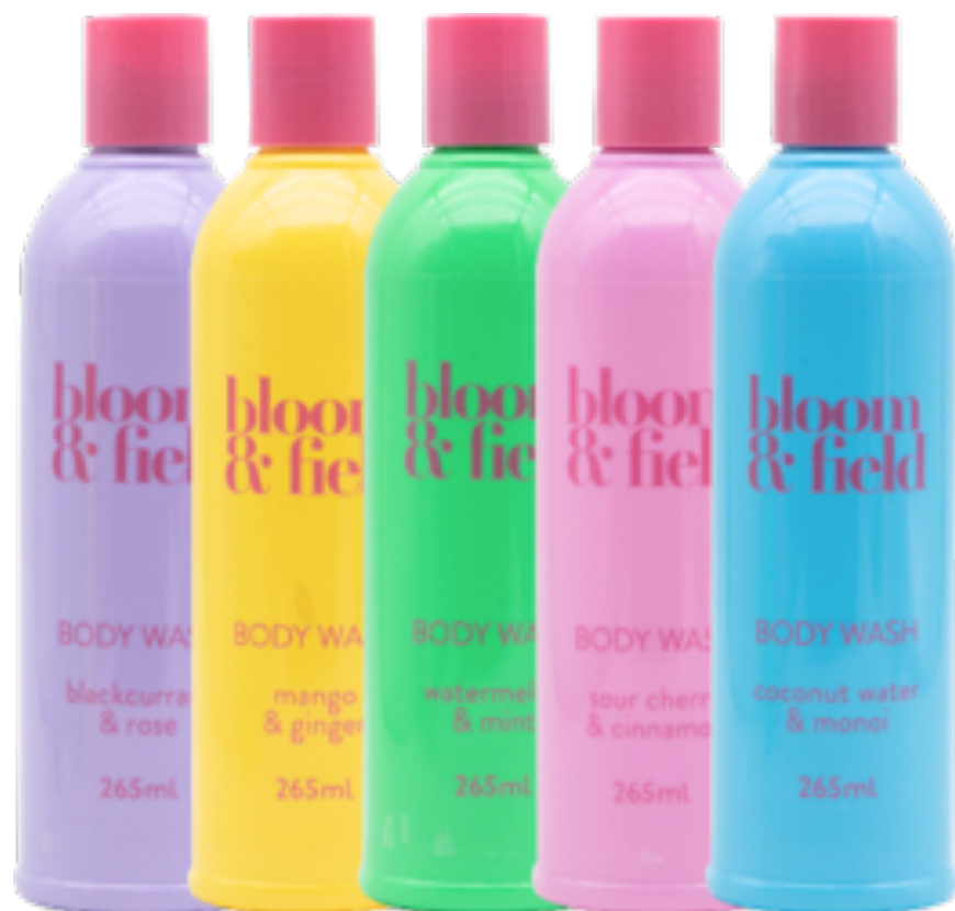
Item No. : ED23F301 Contents: 265ml Body Wash Disc-top Cap Bottle