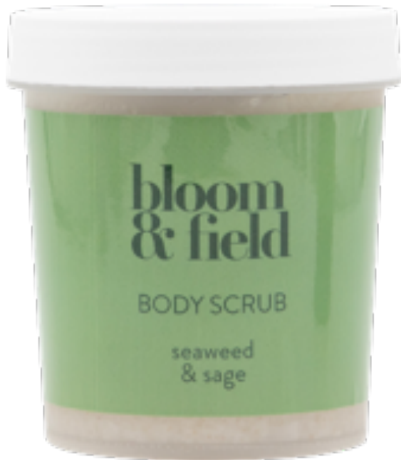
Item No. : ED23F403 Contents: 240ml Body Scrub Plastic Tub