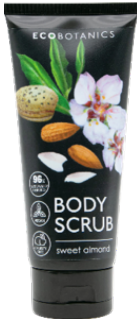
Item No. : ED23F003 Contents: 150ml Body Scrub Tube