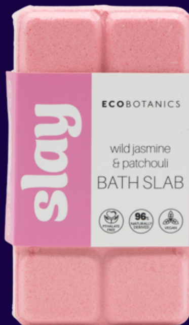
Item No. : ED23F105 Contents: 120g Bath Slab Plastic wrap and paper sleeve