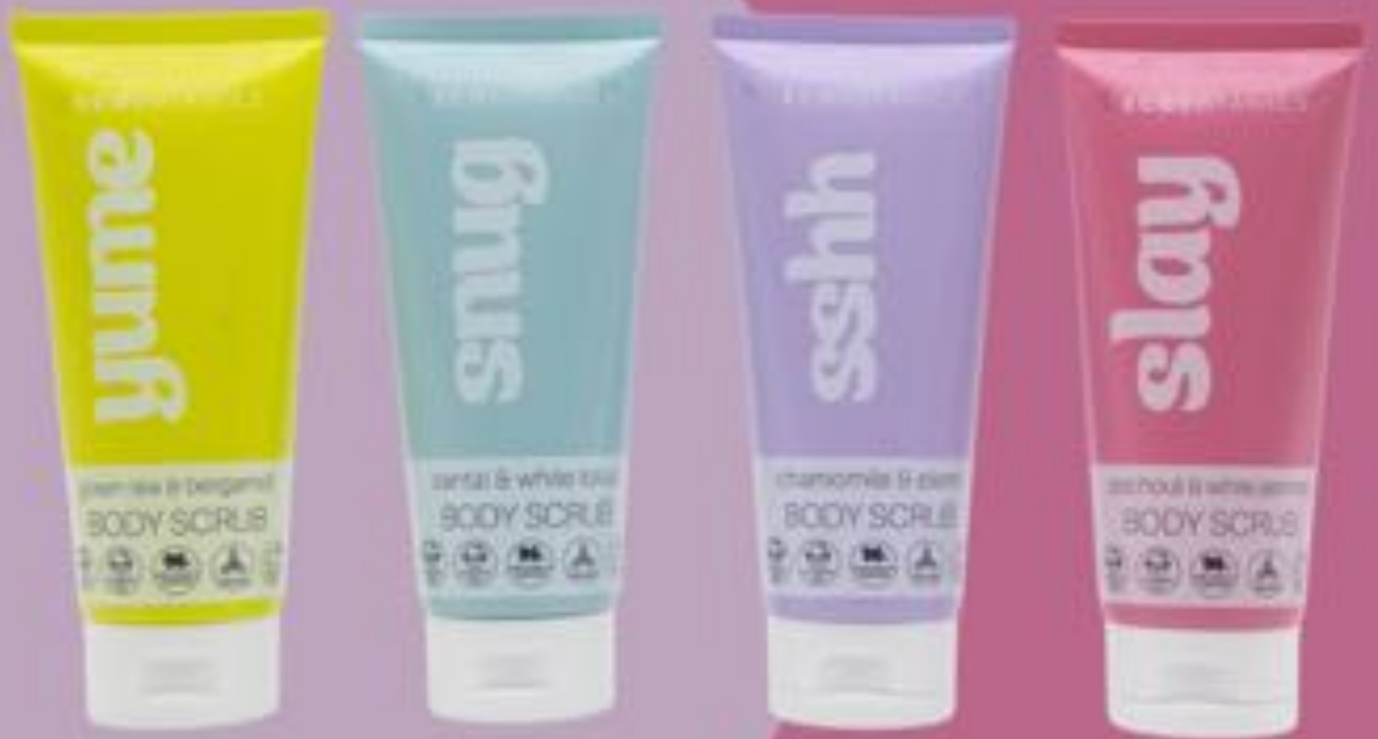
Item No. : ED23F101 Contents: 150ml Body Scrubh Tube