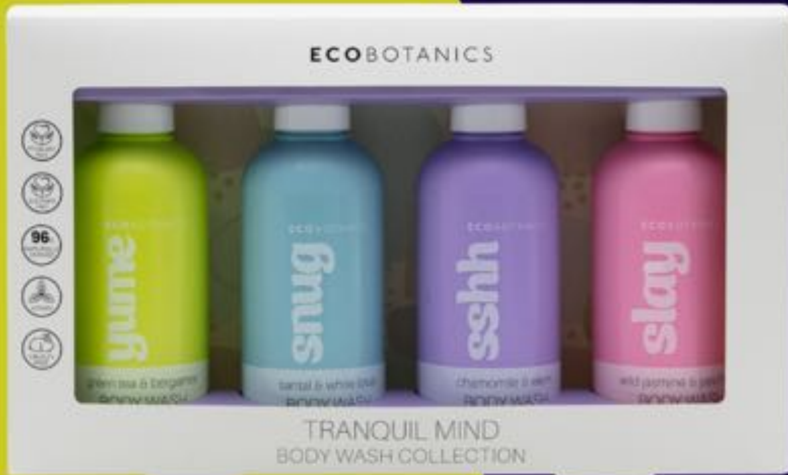
Tranquil Mind Body Wash Collection

Item No. : ED23F1107 Contents: 4 x 200ml Body Wash, , Box with window