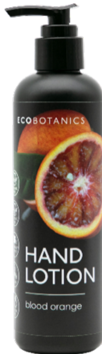
Item No. : ED23F002 Contents: 250ml HandLotion Bottle with pump