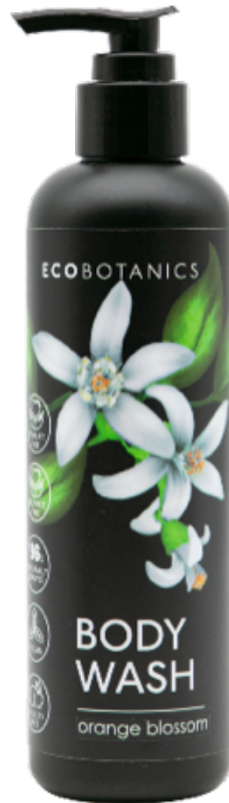
Item No. : ED23F004 Contents: 250ml Body Wash Bottle with pump