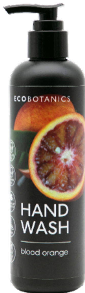
Item No. : ED23F001 Contents: 250ml Hand Wash Bottle with pump