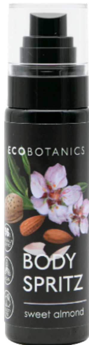
Item No. : ED23F007 Contents: 100ml Body Mist Bottle with spray