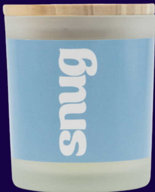
Item No. : ED23F104 Contents: 140g Candler Glass Jar