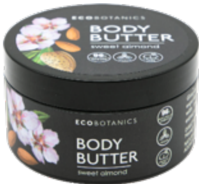
Item No. : ED23F006 Contents: 200ml Body Butter Jar