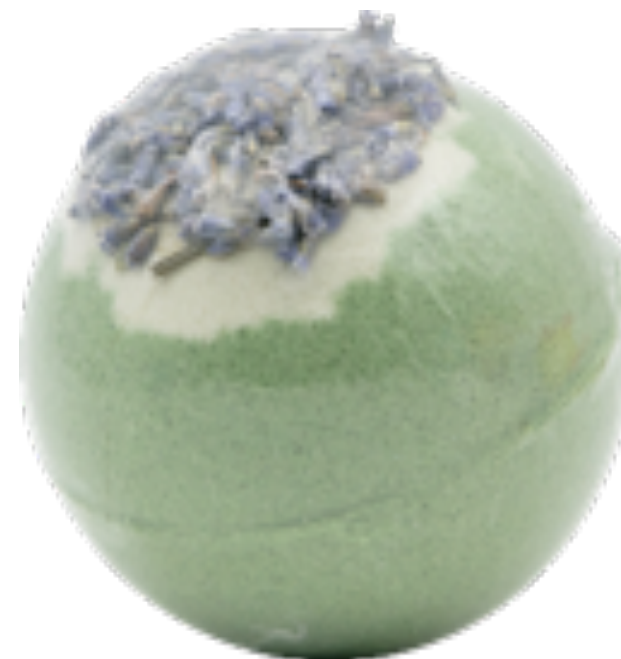
Item No. : ED23F008 Contents: 150g Bath Fizzer Clear wrap