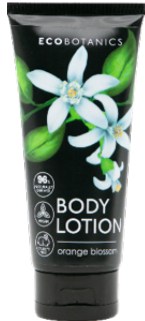
Item No. : ED23F005 Contents: 150ml Body Lotion Tube