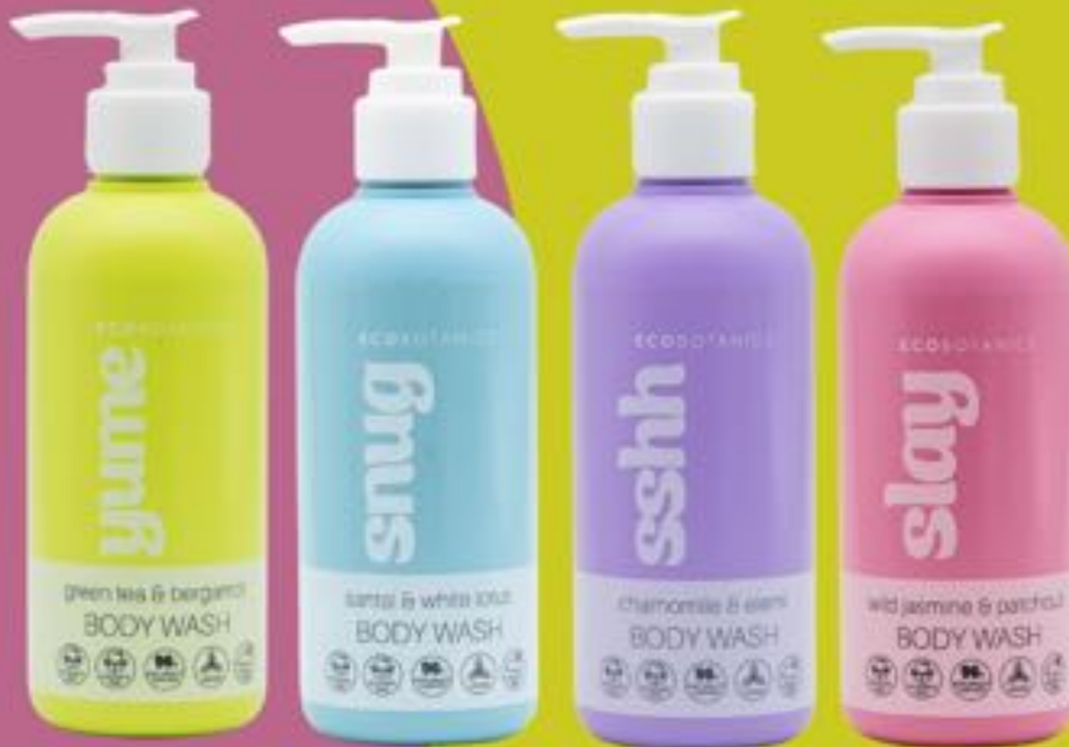
Item No. : ED23F102 Contents: 200ml Body Wash Bottle with pump