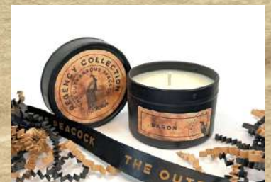
Medium Tin - 80g