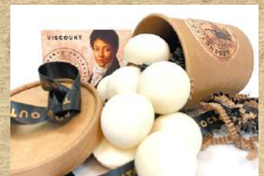
Wax Melts - 12g