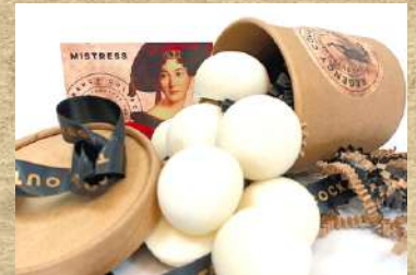
Wax Melts - 12g