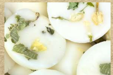
Wax Melts Box Of 50