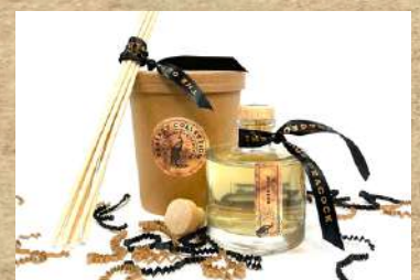
Reed Diffuser - 100ml