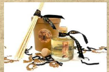
Reed Diffuser - 100ml