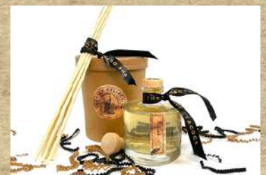
Reed Diffuser - 100ml

The Duke brings a raw, yet reserved sensuality to our Regency Collection.