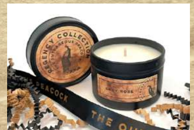
Medium Tin - 80g