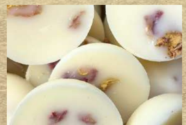
Wax Melts Box Of 50