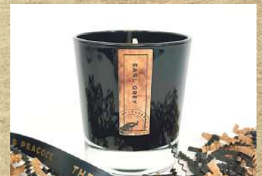
Large Candle - 220g