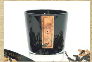
Large Candle - 220g