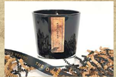
Medium Candle - 160g