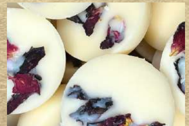
Wax Melts Box Of 50