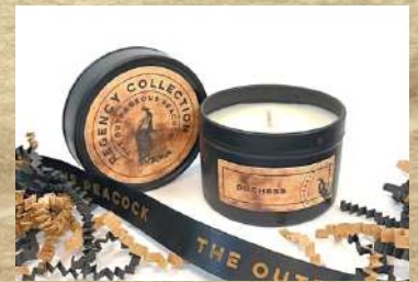
Medium Tin - 80g