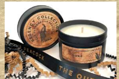
Medium Tin - 80g