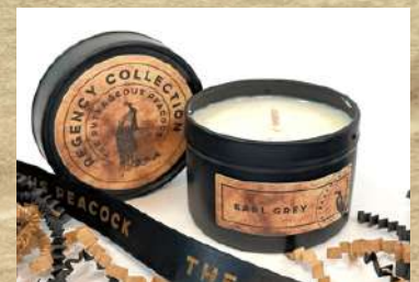
Medium Tin - 80g