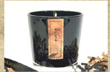
Medium Candle - 160g