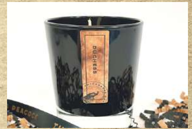
Large Candle - 220g

This seductive fragrance is further enriched by the entanglement of hedgerow blackberries that fill the air with a fragrant fruity scent to tempt you into a heart of rose petals enveloped in smooth liquid amber.