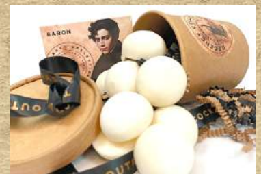
Wax Melts - 12g