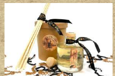
Reed Diffuser - 100ml

Meet the Earl Grey, a gossip a flirt and possibly a Regency rake. Enveloping the fragrance of black tea, bergamot and citruses.