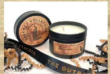
Medium Tin - 80g