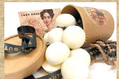
Wax Melts - 12g