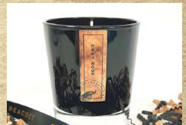
Large Candle - 220g

The contrast of crisp winter rose and spiced pink peppercorns with juicy hints of cassis bring us an ultra-feminine fragrance.