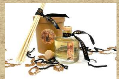
Reed Diffuser - 100ml

The Viscount is the fragrance that is not afraid of saying what it thinks.