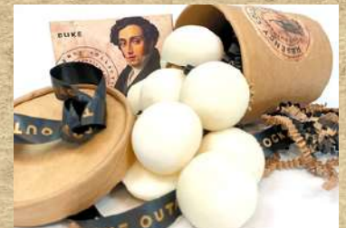
Wax Melts - 12g