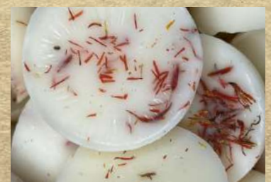
Wax Melts Box Of 50