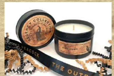
Medium Tin - 80g