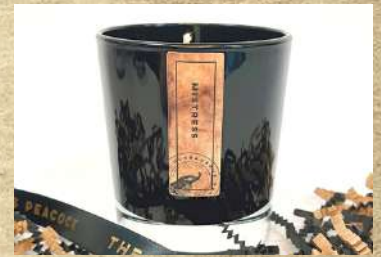
Large Candle - 220g

A unique fragrance blooming with notes of cactus flower, jasmine and desert rose. A solar accord radiates warmth throughout the composition whilst dry orris root gives a rich earthy depth.