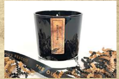
Medium Candle - 160g