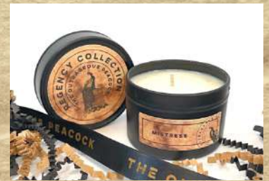
Medium Tin - 80g