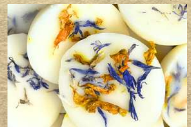
Wax Melts Box Of 50