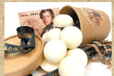
Wax Melts - 12g