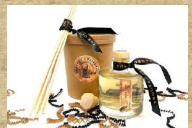
Reed Diffuser - 100ml