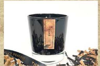
Medium Candle - 160g