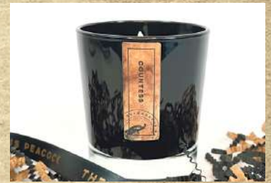
Large Candle - 220g

Super floral Jasmine, exuberant orange flower, tender tuberose, a touch of honey and calming vetiver.