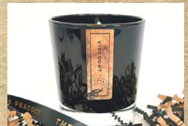
Large Candle - 220g