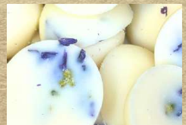
Wax Melts Box Of 50