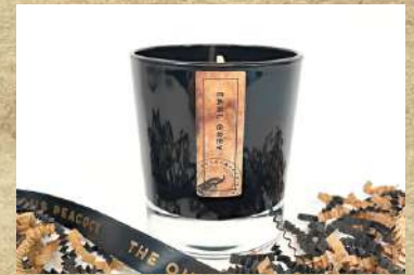
Medium Candle - 160g