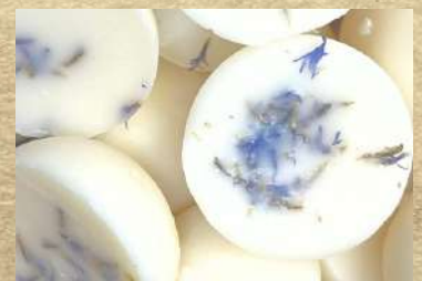
Wax Melts Box Of 50