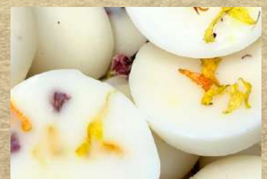
Wax Melts Box Of 50