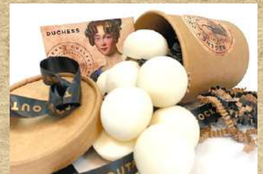
Wax Melts - 12g