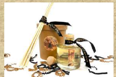
Reed Diffuser - 100ml