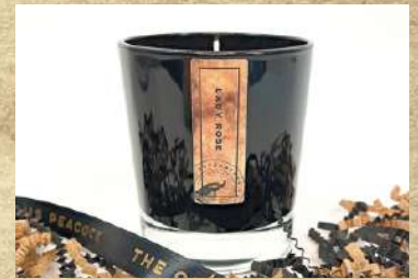
Medium Candle - 160g