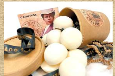
Wax Melts - 12g