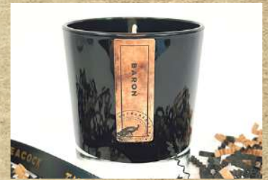
Large Candle - 220g