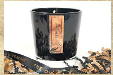
Medium Candle - 160g