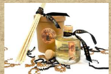
Reed Diffuser - 100ml

The Baron brings a powerful yet mysterious scent contrasting the smoky character of gunpowder and tea with damp soil.