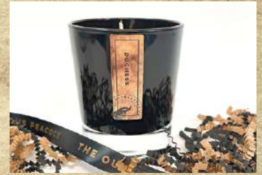
Medium Candle - 160g