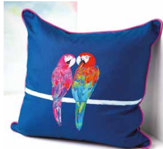
PERCY & PENELOPE