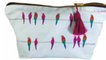
PERCY & PENELOPE