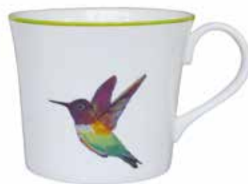
FLOSSY & AMBER