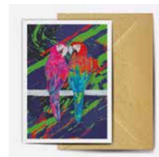
PERCY & PENELOPE