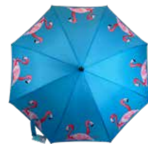
FLOSSY & AMBER