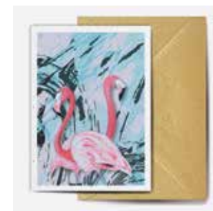
FLOSSY & AMBER