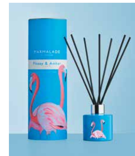
FLOSSY & AMBER REED DIFFUSER