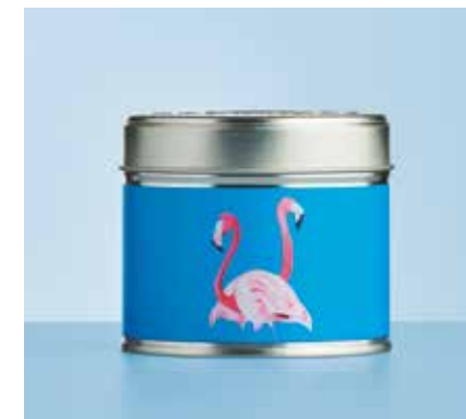
FLOSSY & AMBER MEDIUM TIN CANDLE