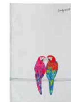
PERCY & PENELOPE