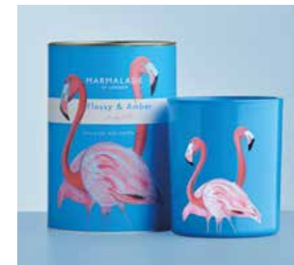
FLOSSY & AMBER GLASS CANDLE