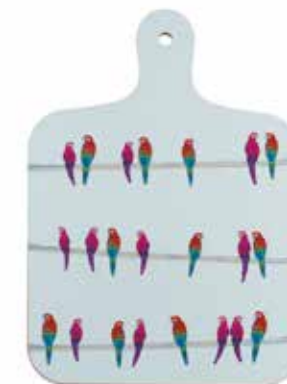
PERCY & PENELOPE