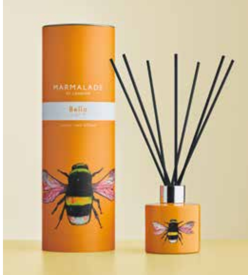
BELLA REED DIFFUSER