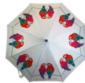
PERCY & PENELOPE