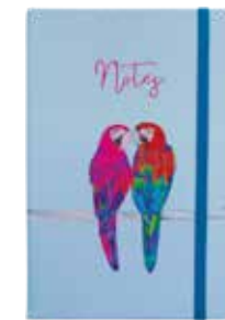
PERCY & PENELOPE