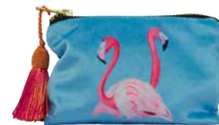
FLOSSY & AMBER