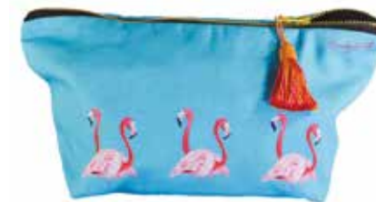
FLOSSY & AMBER