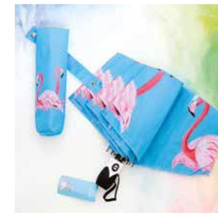
FLOSSY & AMBER