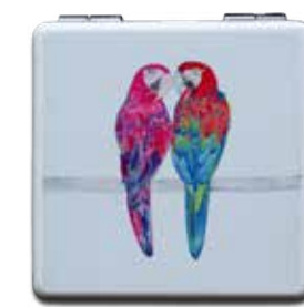
PERCY & PENELOPE