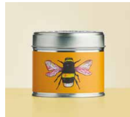
BELLA MEDIUM TIN CANDLE