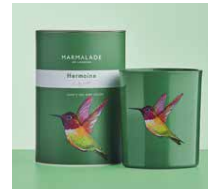
HERMIONE GLASS CANDLE