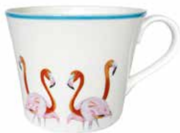
FLOSSY & AMBER