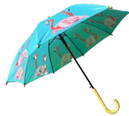
FLOSSY & AMBER