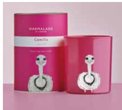
CAMILLA GLASS CANDLE