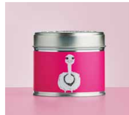
CAMILLA MEDIUM TIN CANDLE