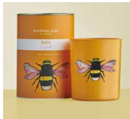
BELLA GLASS CANDLE