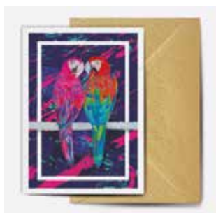
PERCY & PENELOPE