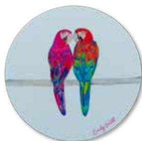
PERCY & PENELOPE