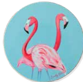
FLOSSY & AMBER