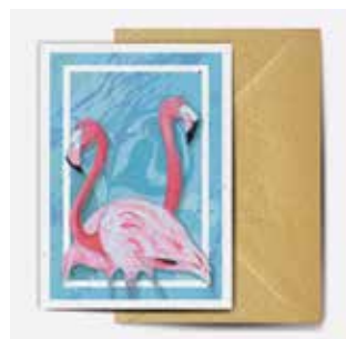
FLOSSY & AMBER