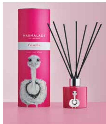
CAMILLA REED DIFFUSER