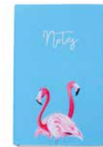
FLOSSY & AMBER