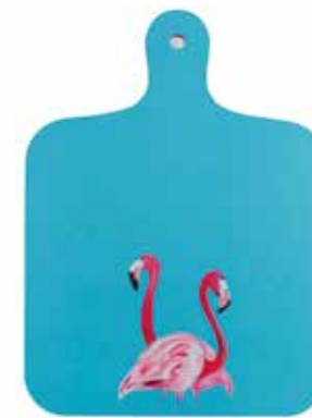
FLOSSY & AMBER