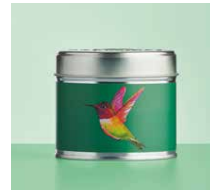
HERMIONE MEDIUM TIN CANDLE