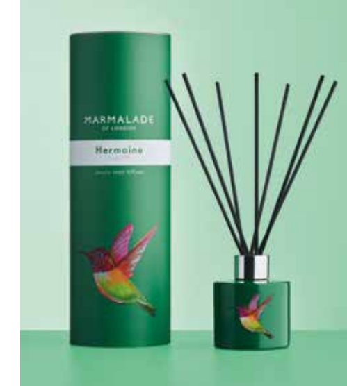
HERMIONE REED DIFFUSER