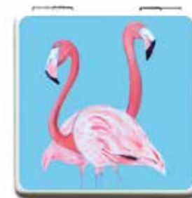
FLOSSY & AMBER