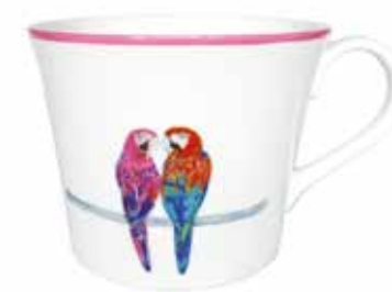
PERCY & PENELOPE