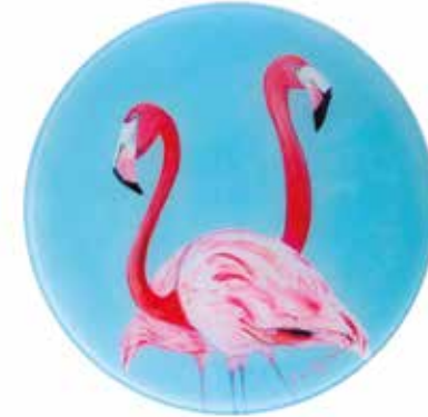
FLOSSY & AMBER