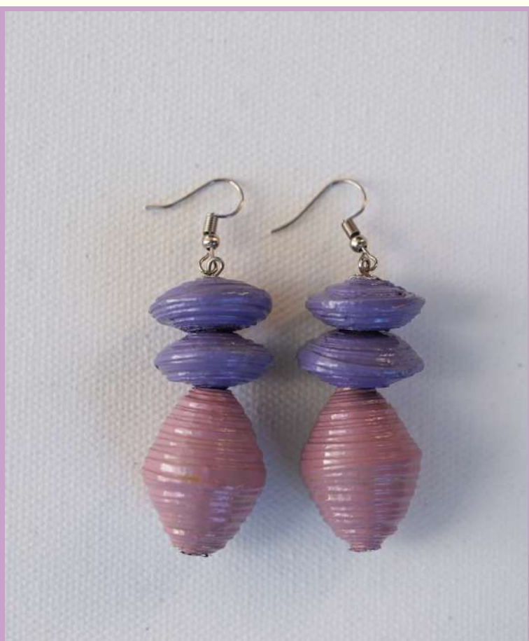
Midi drop in violet & lilac Code: MIDI3BVL