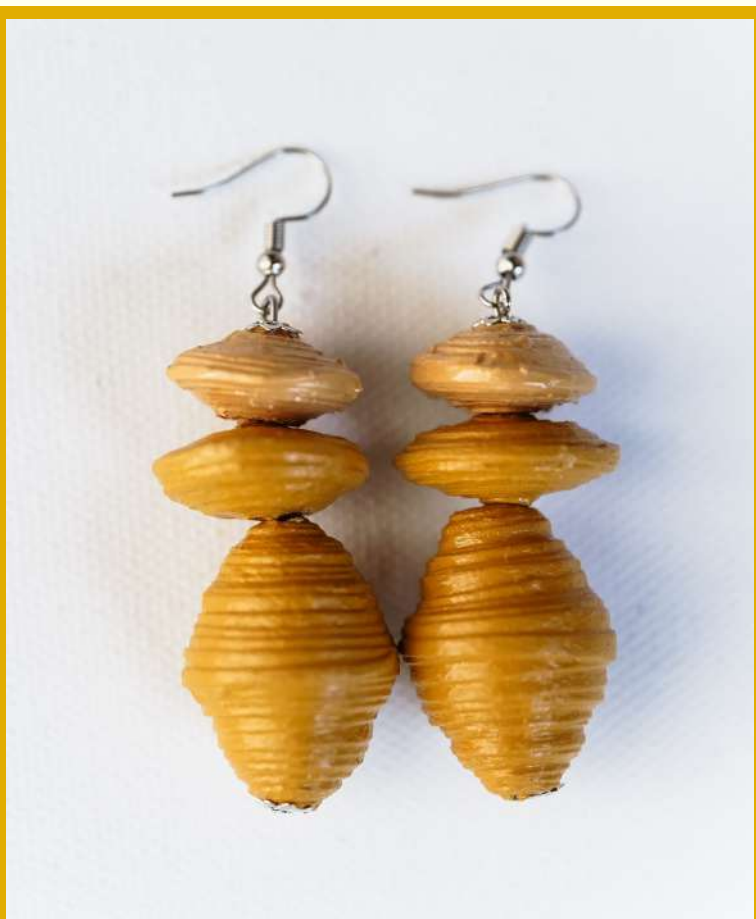
Midi drop in nude & yellow ochre Code: MIDI3BNYO