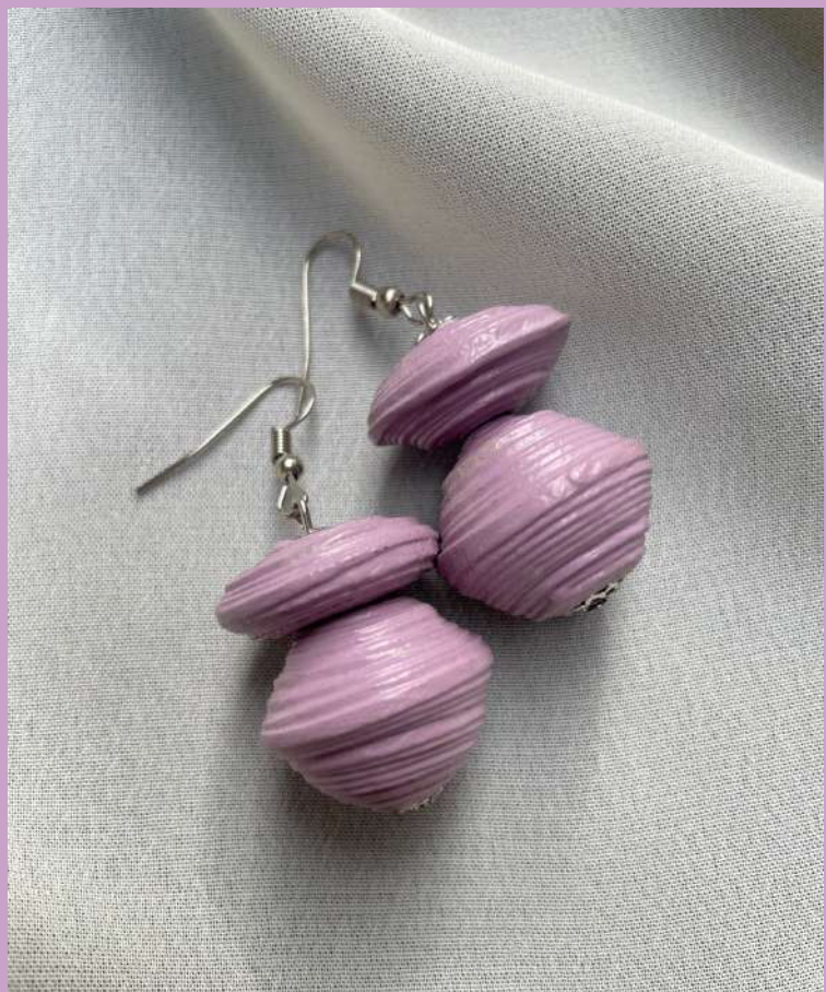
Mini drop in lilac Code: MINI2BL