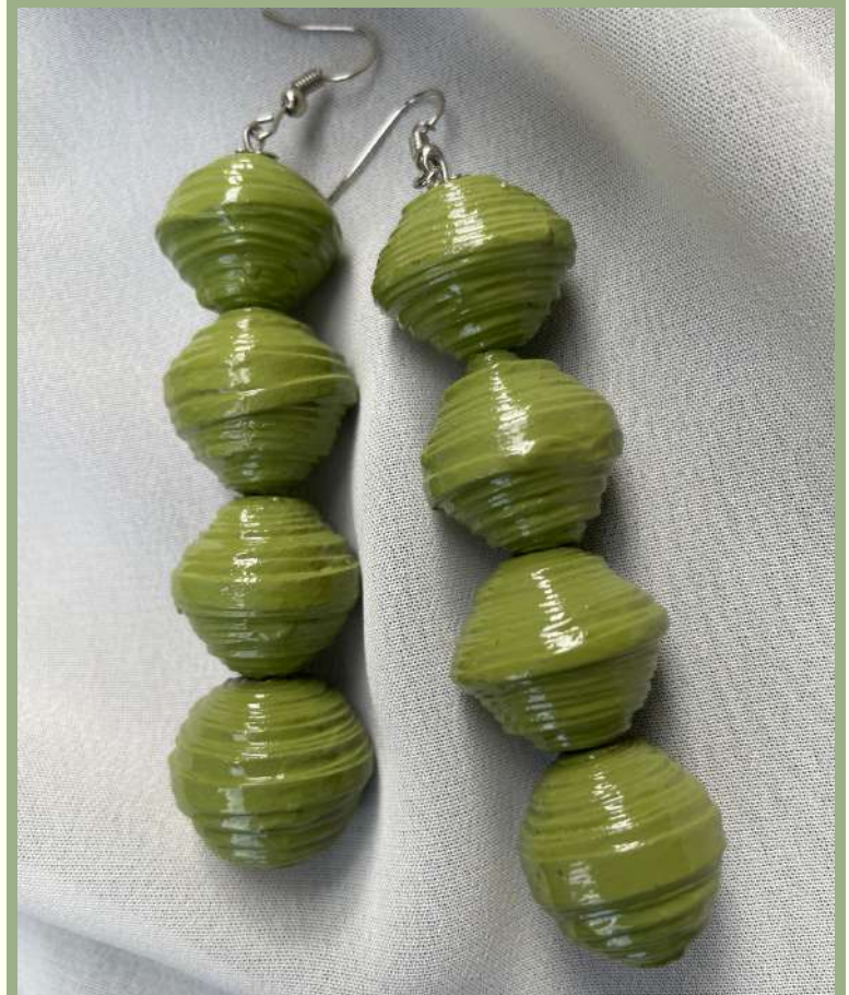
Long drop in sage green Code: LONG4BSG