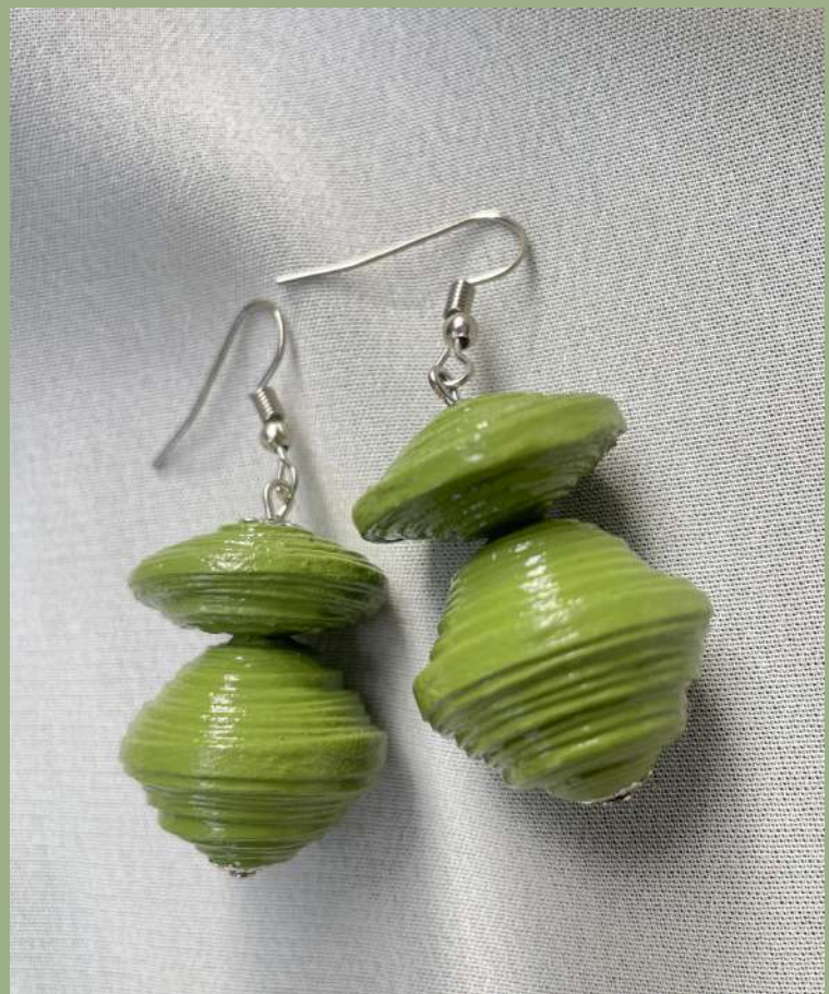
Mini drop in sage green Code: MINI2BSG