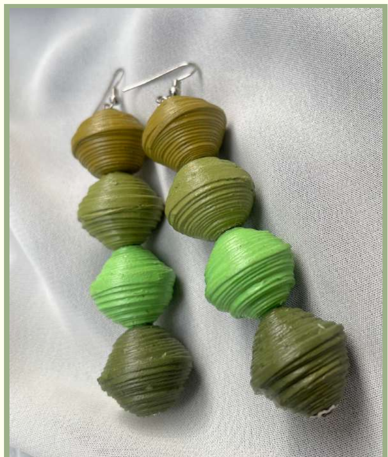
Long drop in green ombré Code: LONG4BGO