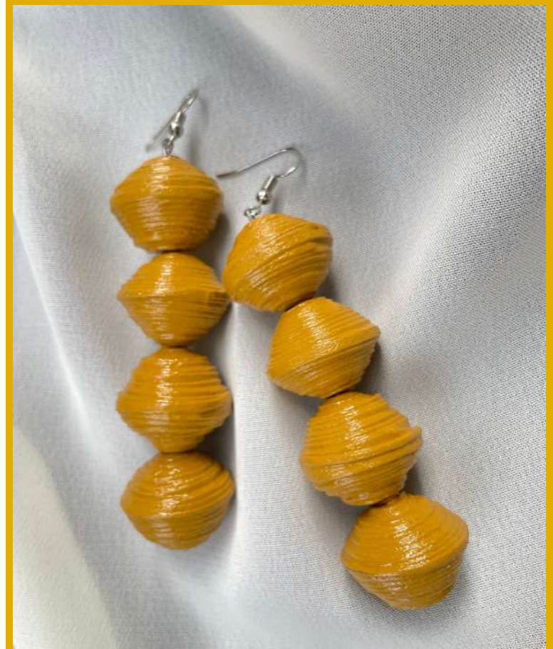
Long drop in yellow ochre Code: LONG4BYO