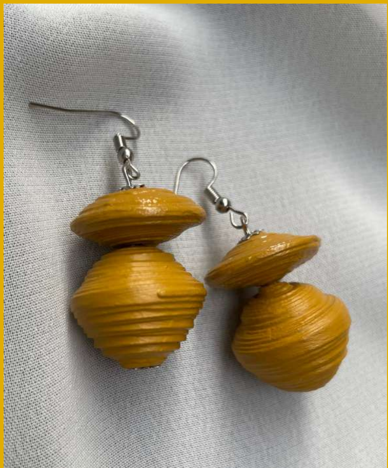
Mini drop in yellow ochre Code: MINI2BYO