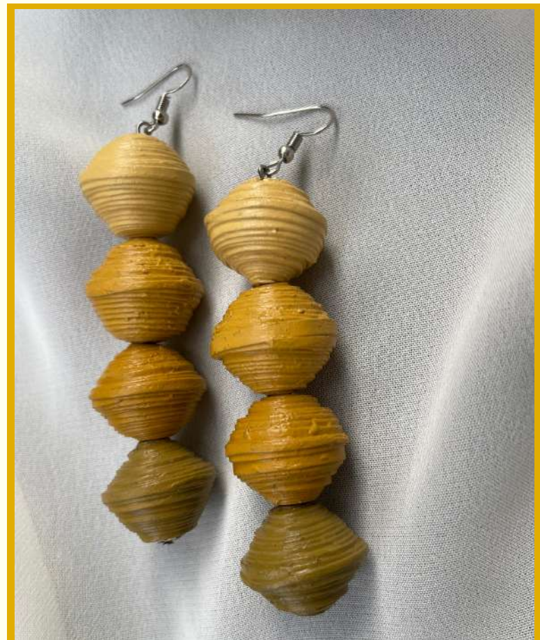
Long drop in yellow ochre ombré Code: LONG4BOO