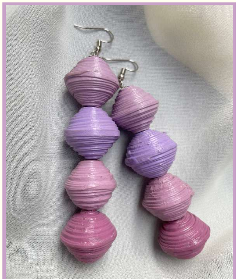
Long drop in lilac ombré Code: LONG4BLO