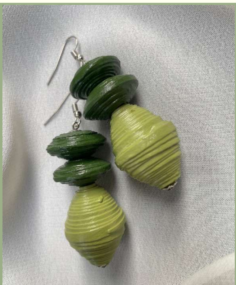
Midi drop in ivy & sage green Code: MIDI3BISG