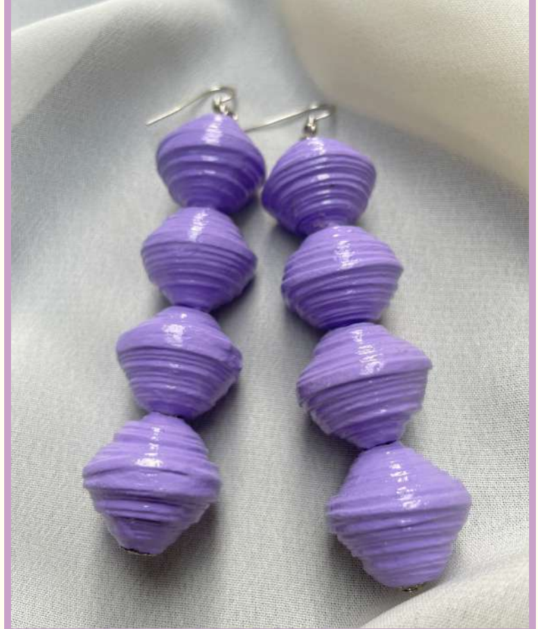
Long drop in lilac Code: LONG4BL