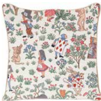
CCOV-ALICE Alice in Wonderland

English architect and designer, Charles Voysey (1857-1941), produced a wide range of designs for textiles and wallpaper. His patterns are characterised by bold, repeating patterns and natural forms. Signare have created two designs based on Voysey's original work.