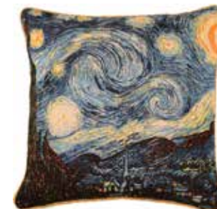
CCOV-ART-VANGOGH-1, Starry Night