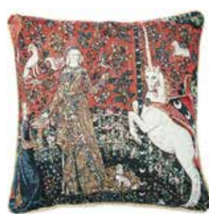
CCOV-ART-LU-TA Sense of Taste