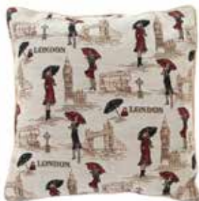
CCOV-MSLN Miss London