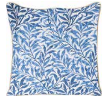
CCOV-WIOW, Willow Bough