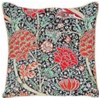
CCOV-CRAY, The Cray