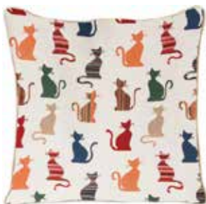
CCOV-CHEKY Cheeky Cat