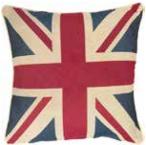
CCOV-UJ Union Flag