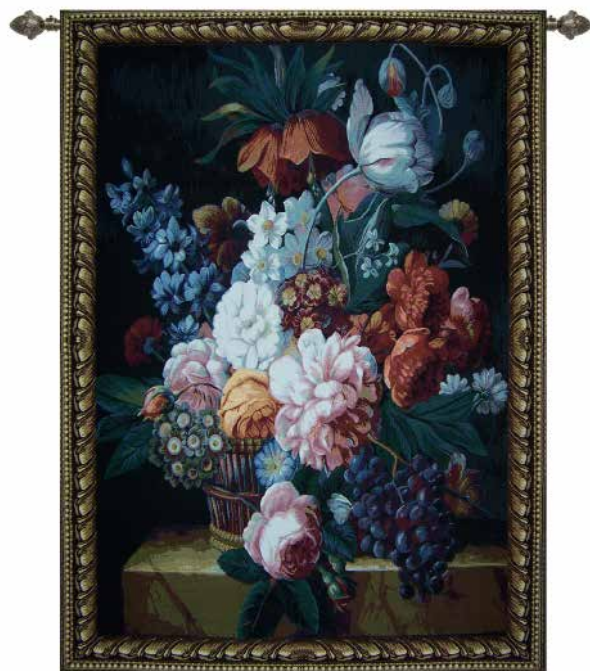
WH-FGP (100cm x 138cm) WH-Flowers and Grapes