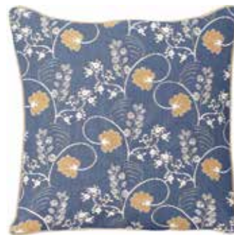
CCOV-AUST Austen Blue