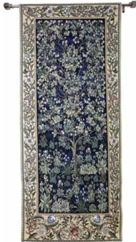
WH-WM-TLBL-2 (68cm x 160cm) Tree of Life Blue 2