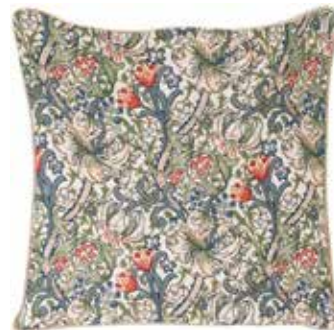
CCOV-GLILY, Golden Lily