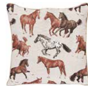
CCOV-RHOR Running Horse