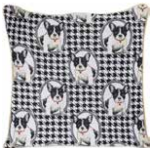
CCOV-FREN French Bulldog