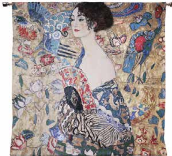
WH-GK-LF (100cm x 100cm) Lady with Fan