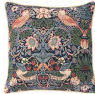
CCOV-STBL, S'Thief Blue

Strawberry Thief design is instantly recognisable as the work of the decorative arts revivalist William Morris. It reproduces in glorious detail an original tapestry created by Morris in the late 19th century. The picture of a thrush stealing fresh strawberries is said to have been inspired by the Morris family's attempts to grow fruit at their Oxfordshire home.