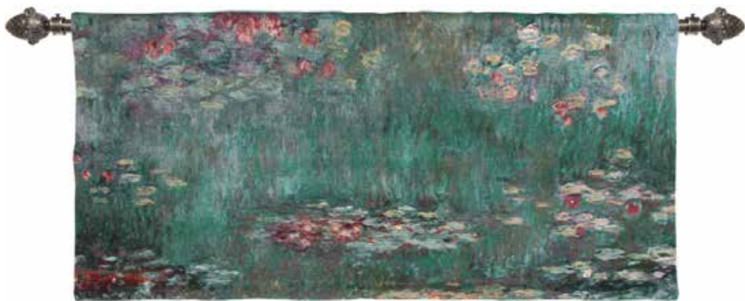
WH-CM-WL (148cm x 69cm) Water Lily

Monet purchased a house and gardens in Giverny, France during the 1880s, which he used as inspiration for a number of his paintings. This included designing the layout for the plants, trees, lakes and even installing a Japanese bridge. Two of his most famous paintings are included in our Signare tapestry collection. The detail and colour he imbued each picture with are an endless joy today.