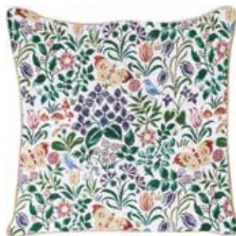
CCOV-SPFL Spring Flowers