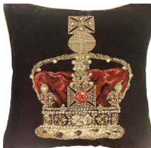
CCOV-PN-CRWBK Crown Black