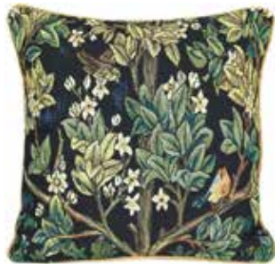
CCOV-ART-MORRIS-2 Tree of Life-Blue