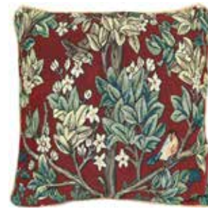
CCOV-ART-MORRIS-3 Tree of Life-Red