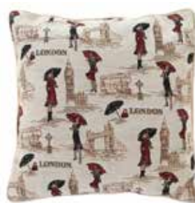
CCOV-MSLN Miss London