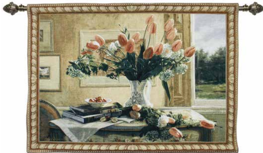
WH-TULIPVS (136cm x 98cm) Tulips in a Vase