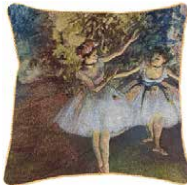
CCOV-ART-ED-BLR-2 Two Dancers on a Stage