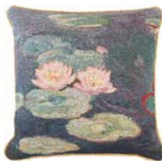
CCOV-ART-MONET-2, Water Lily