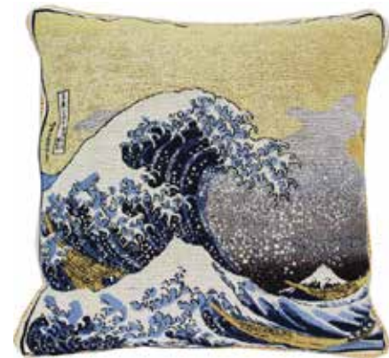
CCOV-ART-JP-WAVE Great Wave off Kanagawa