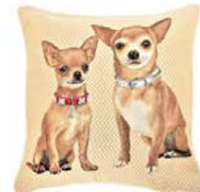
CCOV-PN-CHIBG Chihuahua Beige