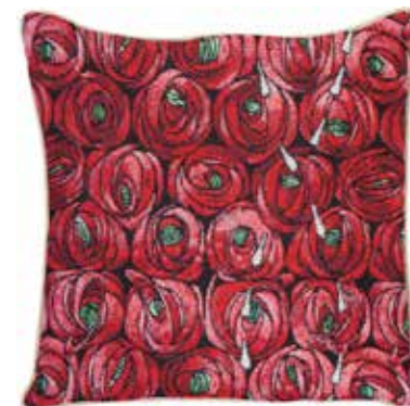
CCOV-RMTD Rose & Teardrop