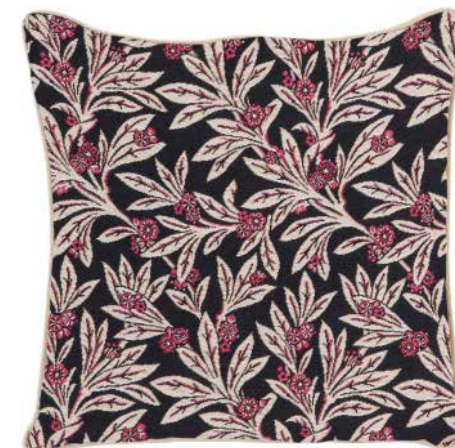
CCOV-GFERN Golden Fern