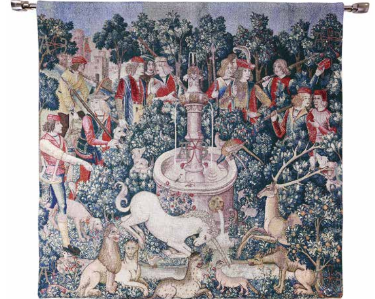
WH-HU (100cm x 100cm) The Unicorn is Found