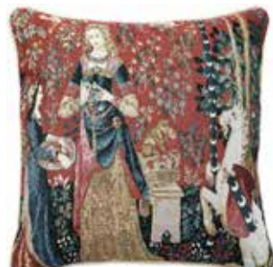
CCOV-ART-LU-SM Sense of Smell