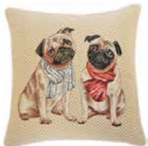
CCOV-PN-CHIBG Chihuahua Beige