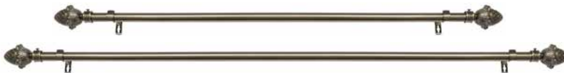
WH-ROD-120 Wall Hanging Rods (Size 2) Extends from 120cm to 180cm