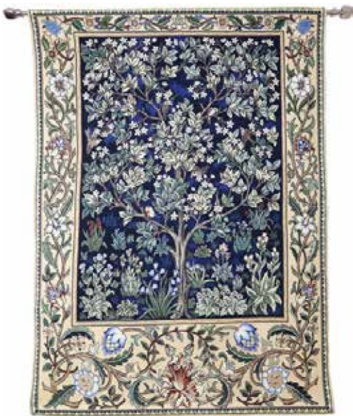
WH-WM-TLBL-1 (103cm x 138cm) Tree of Life Blue 1

The Tree of Life is a symbol of the abundance and continuity of life. It was inspired by a decorative technique known as Mille Fleur (French for 'Thousand Flowers'), meaning to create a background with many flowers, plants and other ornamental elements.