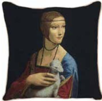
CCOV-ART- LDV-ERMINE Lady with an Ermine