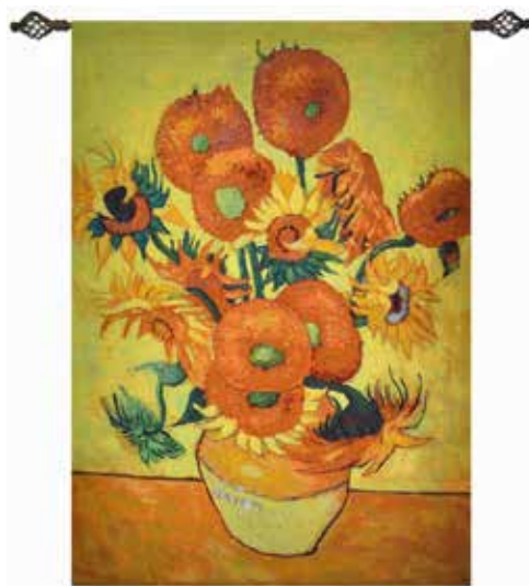
WH-VG-SF (95cm x 139cm) Sun Flower