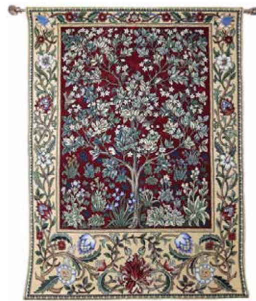
WH-WM-TLRD-1 (103cm x 138cm) Tree of Life Red 1