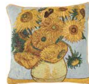
CCOV-ART-VANGOGH-3, Sun Flower