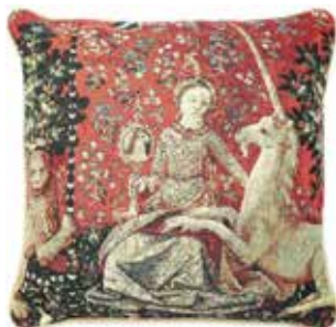
CCOV-ART-LU-SI Sense of Sight