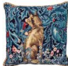
CCOV-ART-MORRIS-6 The Fox