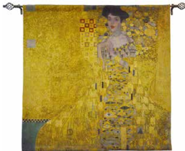
WH-GK-WGD (100cm x 100cm) Woman in Gold