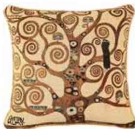
CCOV-ART-KLIMT-2 Tree of Life