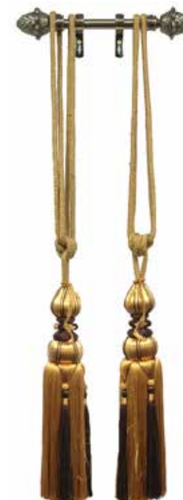
WH-TASS Wall Hanging Tassel

Add a touch of style to your wall hanging tapestry with these golden hanging tassels.