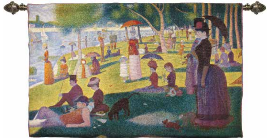
WH-GS-LGJ (173cm x 68cm) A Sunday Afternoon on the Island of La Grande Jatte

Georges Seurat (1859-1891, French Painter)