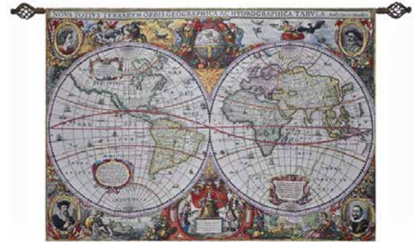
WH-MAP-1 (140cm x 99cm) WH-Map-1