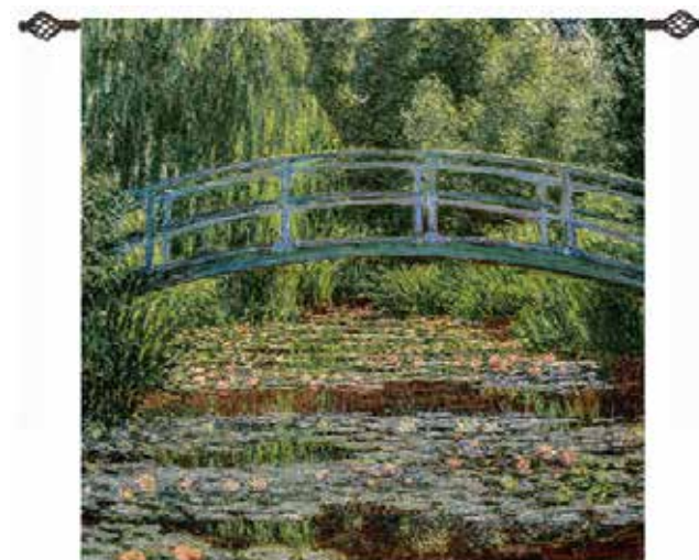
WH-CM-JB-SMALL (73cm x 68cm) Japanese Bridge