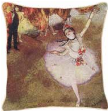
CCOV-ART-ED-BLR-1 The Star