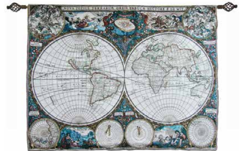
WH-MAP-2 (139cm x 109cm) WH-Map-2