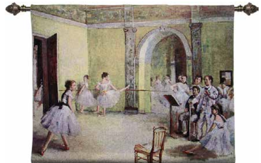
WH-ED-BA (89cm x 69cm) Degas's Ballet Class