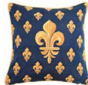
CCOV-PN-FDLBL Fleur-de-lis Blue