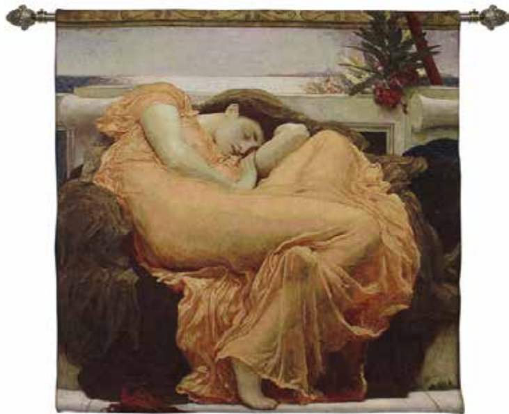
WH-FL-FLAM (100cm x 100cm), Flaming June

Frederic Leighton (1830-1896, English Painter)