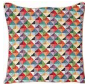
CCOV-MTRI Multi' Triangle