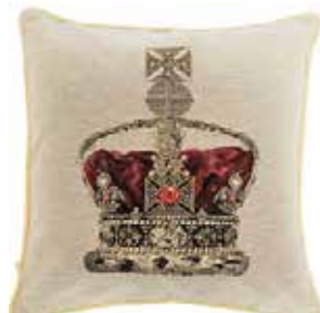
CCOV-PN-CRWWT Crown Beige