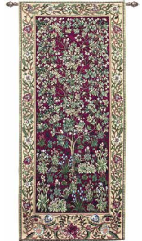
WH-WM-TLRD-2 (68cm x 160cm) Tree of Life Red 2