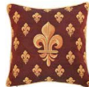
CCOV-PN-FDLRD Fleur-de-lis Red