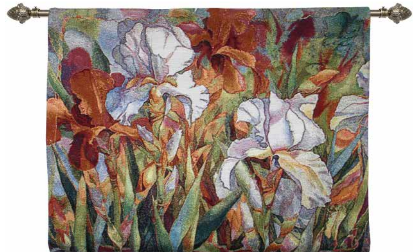
WH-FL Size: 68cm x 51cm & 138cm x 105cm White Beauties