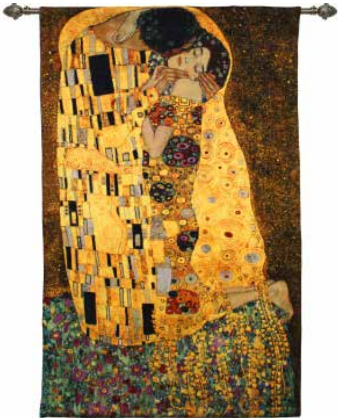
WH-GK-KS (90cm x 138cm) The Kiss