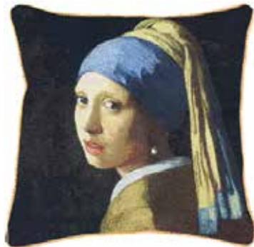
CCOV-ART-JV-GIRL Girl with a Pearl Earring