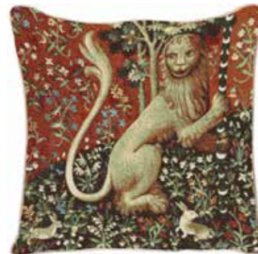
CCOV-ART-LU-LION Lady and Unicorn-Lion

The artwork currently resides in the Thermes de Cluny in Paris.