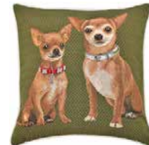
CCOV-PN-CHIOL Chihuahua Beige