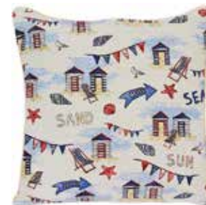
CCOV-BHUT Beach Hut