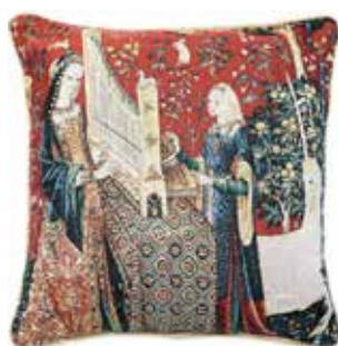
CCOV-ART-LU-HE Sense of Hearing