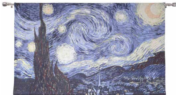
WH-VG-SN (120cm x 82cm) The Starry Night

The Dutch Post-Impressionist painter, Vincent van Gogh, is one of the most famous and beloved artists of all time. He created over 2000 pieces of art but never found fame during his lifetime, dying at just 37 after struggling with mental illness and poverty.