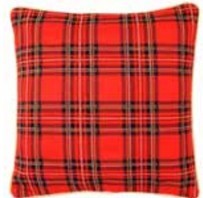
CCOV-RSTT Royal Stewart Tartan