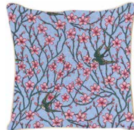
CCOV-BLOS Almond Blossom and Swallow

This pattern was inspired by an 1878 wallpaper Almond Blossom and Swallow , designed by Walter Crane (1845–1915), one of the leading exponents of the Aesthetic Movement and the first President of the Arts and Crafts Exhibition Society. Crane's wallpaper designs were often narrative and show the influence of Japanese art on British culture. This wallpaper pattern was exhibited at the International Exhibition held in Paris in 1878, where it was awarded a gold medal. The original design is now housed at the V&A.