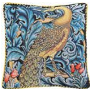
CCOV-ART-MORRIS-7 The peacock