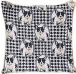
CCOV-FREN French Bulldog