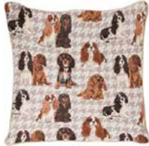
CCOV-KGCS King Charles Spaniel