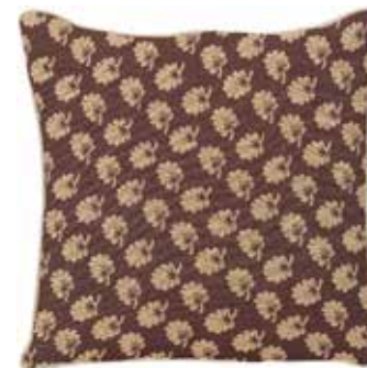
CCOV-JANE Jane's Oak

Jane Austen, one of the world's most famous authors, spent most of her life in Hampshire where its countryside and people influenced many of her novels. This design was inspired by an oak leaf motif from a pelisse coat thought to have belonged to Jane Austen. Oak leaves were a popular national symbol at the time.