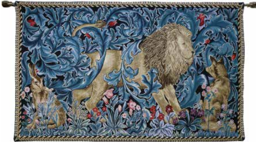
WH-WM-LNFST (139cm x 87cm), Lion and the Forest

Morris created hundreds of textile patterns during his lifetime, teaching himself about embroidery and becoming an expert in the process of how to dye materials.