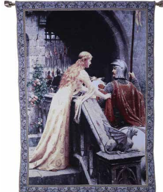
WH-EB-GS (98cm x 139cm) God Speed