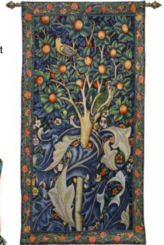
WH-WM-WP (69cm x 139cm) Woodpecker in Fruit Tree

Woodpecker in Fruit Tree tapestry was woven in 1877 and depicts a woodpecker sitting in a tree decorated with flowers and leaves. It is unusual in that it was designed completely by William Morris himself.