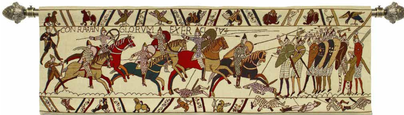
WH-BT-HB (151cm x 45cm) Bayeux Tapestry Hastings Battle