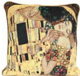
CCOV-ART-KLIMT-4 Gold Kiss