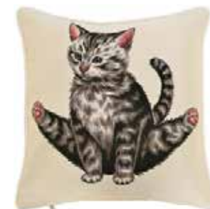
CCOV-PN-YOGAC1 Yoga Cat 1