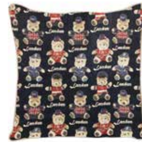
CCOV-LNBE London Bear