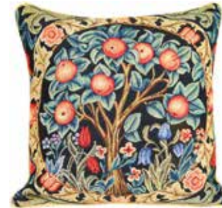
CCOV-ART-MORRIS-1 Orange tree