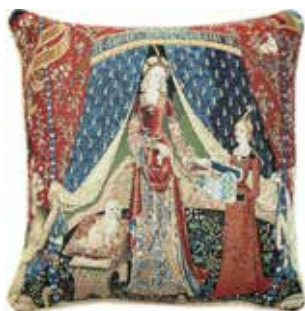
CCOV-ART-LU-DE A Mon Seul Desir