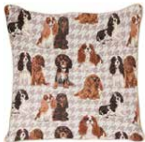
CCOV-KGCS King Charles Spaniel