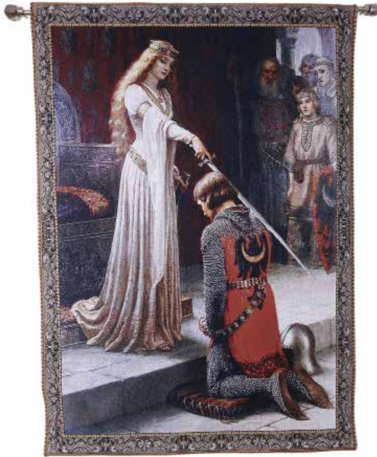
WH-EB-AC (100cm x 139cm) Accolade