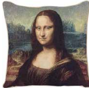
CCOV-ART- LDV-MONA Mona Lisa