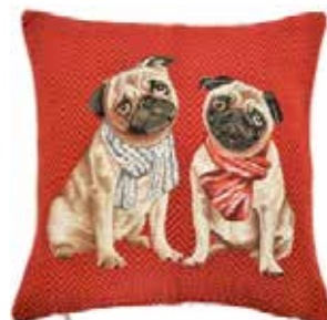
CCOV-PN-CHIBG Chihuahua Beige