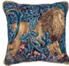
CCOV-ART-MORRIS-5 The Lion