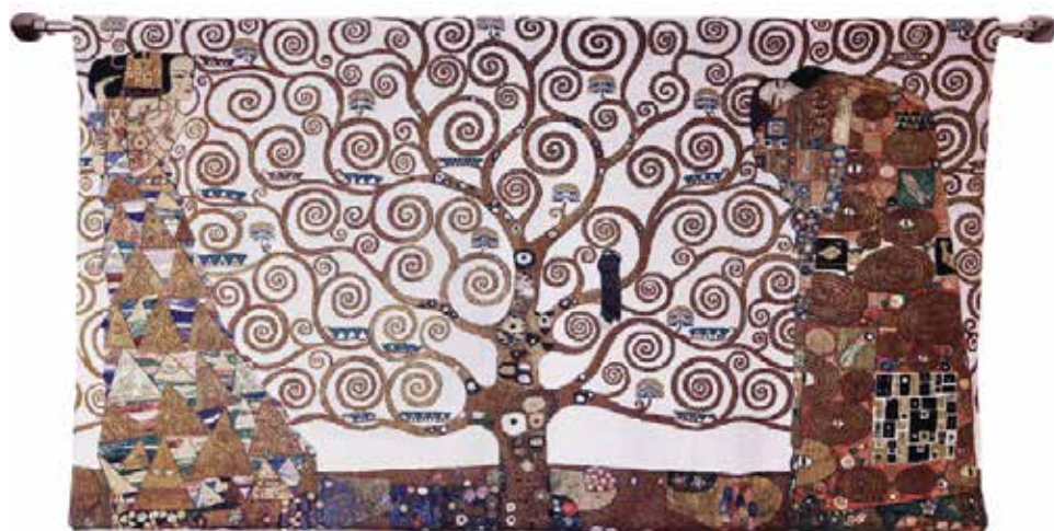
WH-GK-TL-1 (138cm x 82cm) Tree of Life-Whole

The tree of life has been used by many cultures to symbolise the connection between heaven and the underworld. The sacred tree having many religious or philosophical connotations. Klimt's The Tree of Life was painted in 1909 in the style of Art Nouveau. It was commissioned as a series of three mosaics to be displayed in the Palais Stoclet in Brussels, Belgium. This Stoclet Frieze also included a standing female figure and an embracing couple.