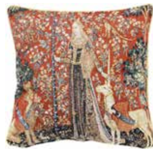
CCOV-ART-LU-TO Sense of Touch