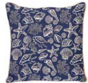
CCOV-SHELL Sea Shell