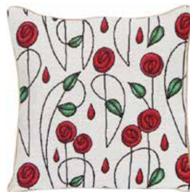
CCOV-RMSP Simple Rose

Mackintosh used stylised roses throughout his career, and this design is one of the most developed; each one of the twenty roses being completely unique.