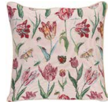
CCOV-JMTWT Marrel's Tulip White