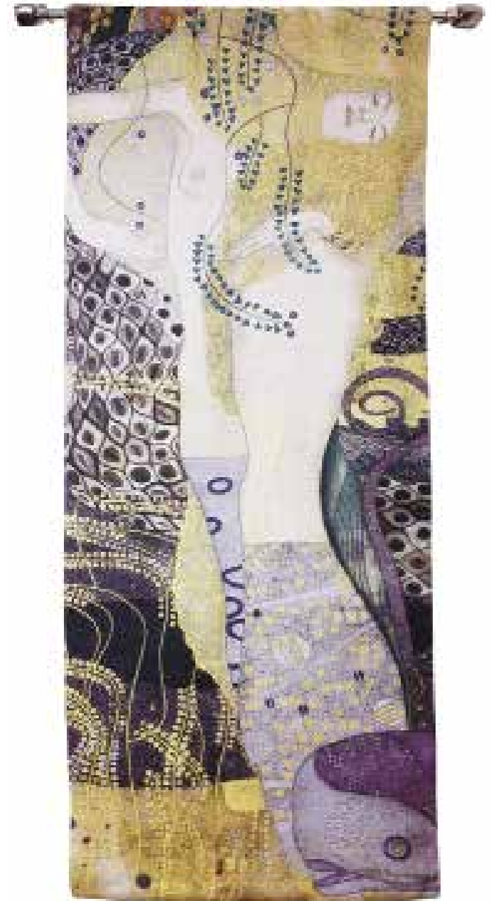
WH-GK-SSPT (68cm x 173cm) Portrait of Sea Serpent