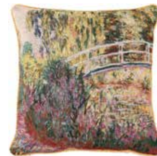
CCOV-ART-MONET-3, Japanese Bridge