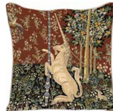
CCOV-ART-LU-UNI Lady and Unicorn-Unicorn