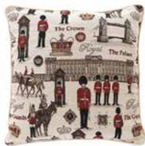
CCOV-RGD Royal Guard