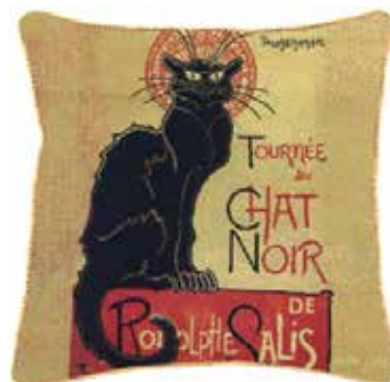
CCOV-ART-TS-CHAT Tournée du Chat noir