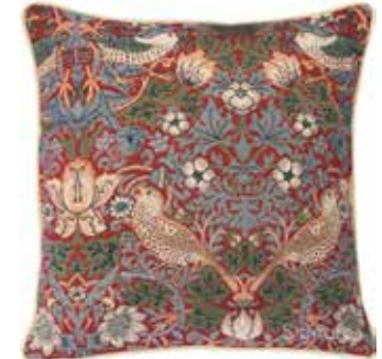
CCOV-STRD, S'Thief Red