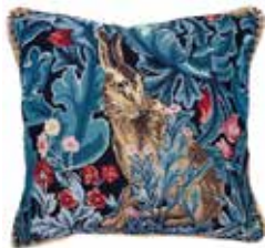
CCOV-ART-MORRIS-4 The Hare