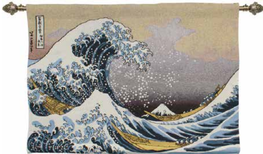
WH-JP-GWK (100cm x 69cm), Great Wave off Kanagawa