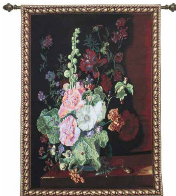
WH-JVH-HOLL (101cm x 139cm) Hollyhocks and Other Flowers in a Vase