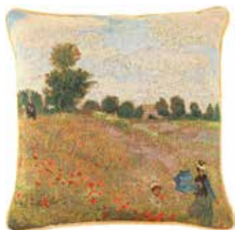
CCOV-ART-MONET-1, Poppy Field