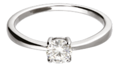
MOISSANITE RING GH COLOUR. 0.5 CARAT* SOLITAIRE