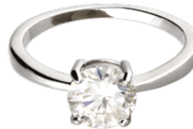
MOISSANITE RING GH COLOUR. 1.5 CARAT* SOLITAIRE