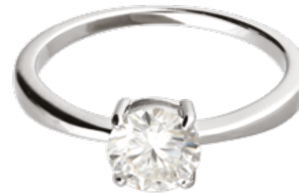
MOISSANITE RING GH COLOUR. 1 CARAT* SOLITAIRE