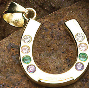
Code: H5027/Y Exclusive to CME