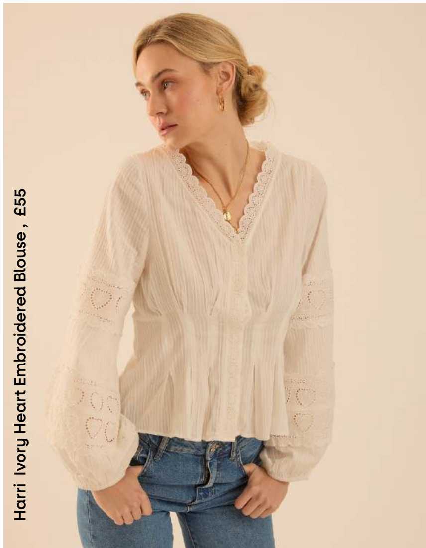
Harri Ivory Heart Embroidered Blouse , £55

DRESS UP YOUR DENIM WITH OUR STAND-OUT BLOUSES