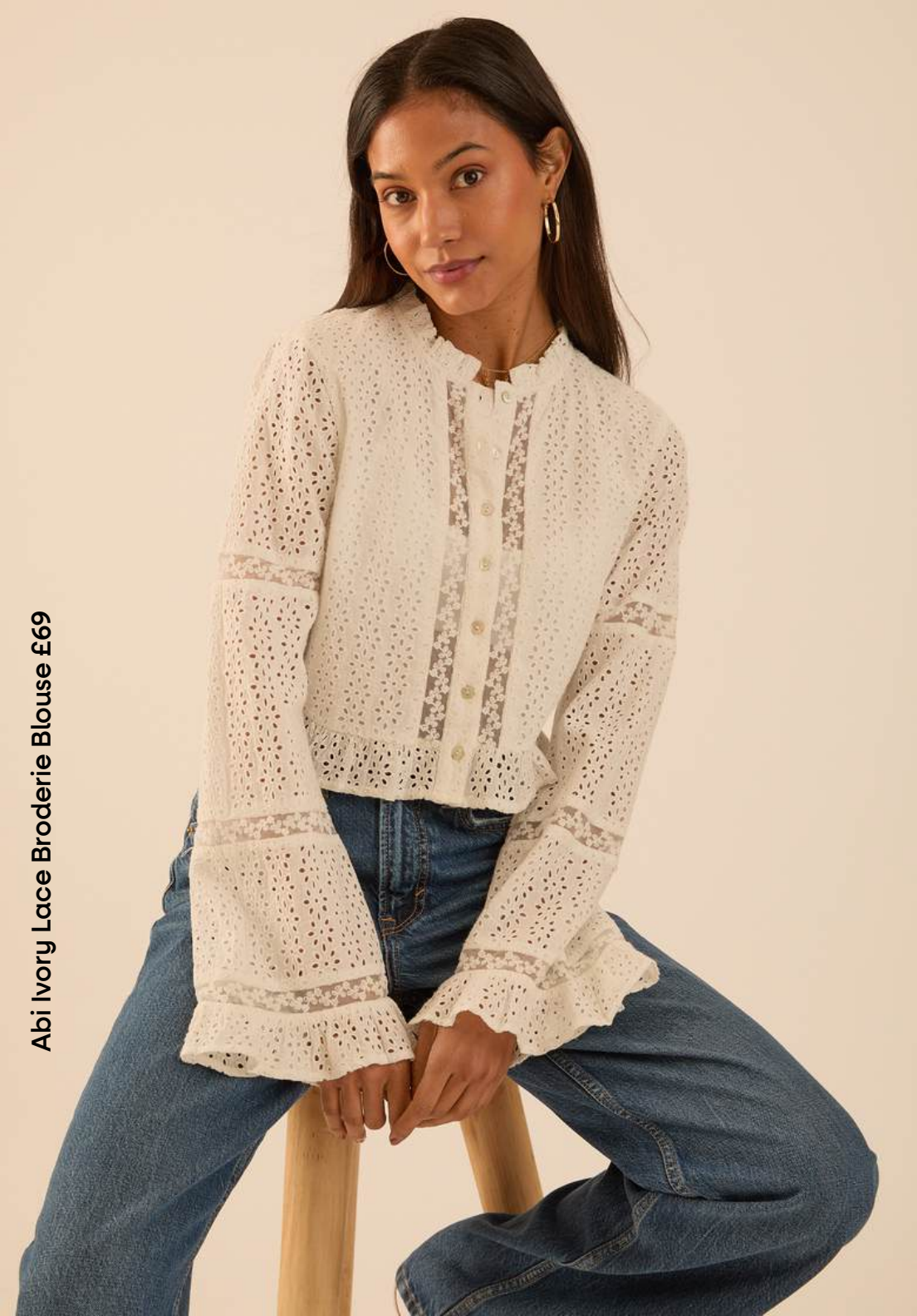
Abi Ivory Lace Broderie Blouse £69