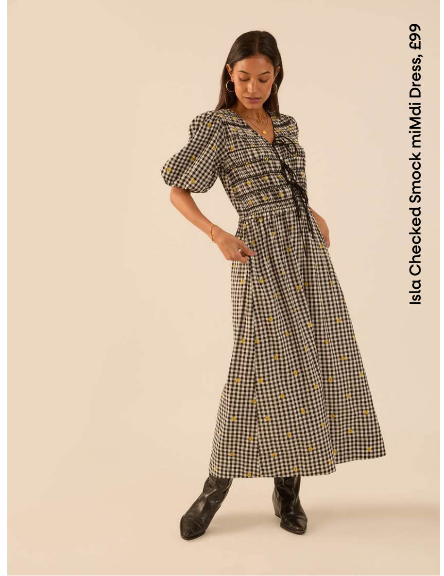
Isla Checked Smock miMdi Dress, £99