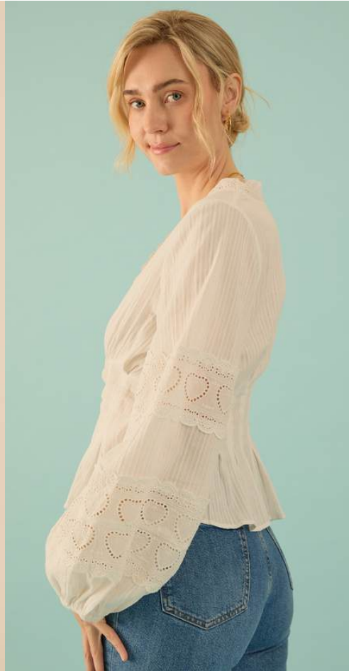
LEFT: Harri Blue Embroidery Heart Cami Top, £45 RIGHT: Harri Ivory Embroidered Heart Blouse, £55