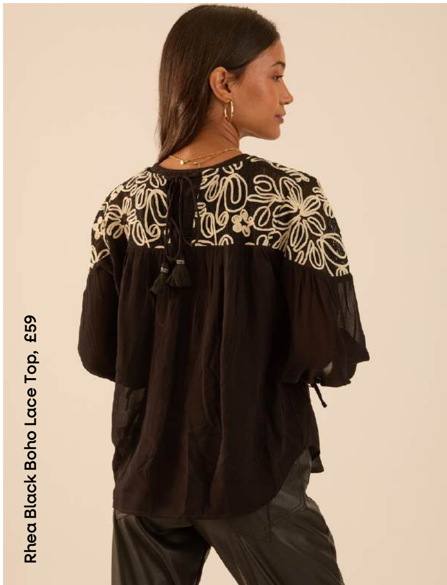
Rhea Black Boho Lace Top, £59

THE DEVIL'S IN THE DETAIL. OUR SIGNATURE DETAILS TAKE YOUR EVERYDAY TO EXTRAORDINARY.