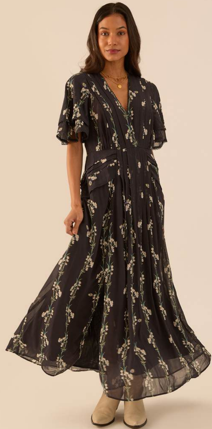
Sophia Black Print Lace Trim Midi Dress: £99