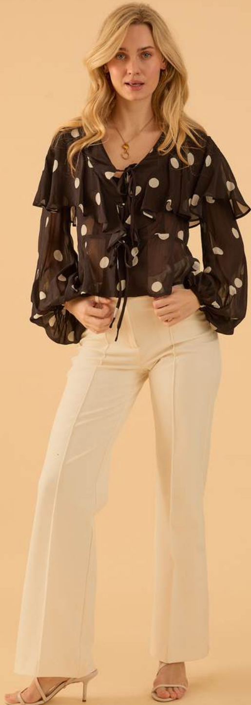
Saphi Spot Print Frill Blouse, £69