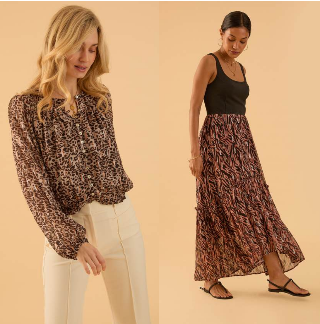
LEFT: Sienna Print Blouson Blouse, £69