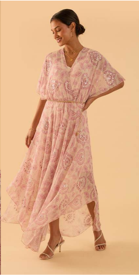
Mali Embellished Drape Dress, £129