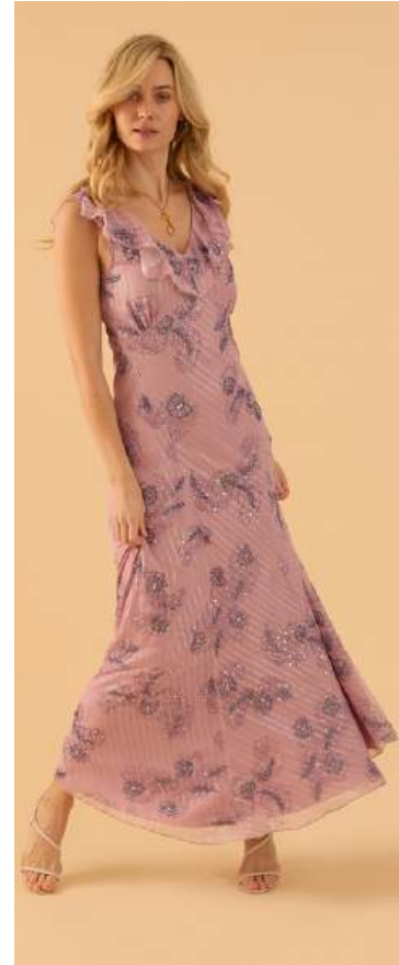
Amelia Pink Ruffle Maxi Dress, £129

BEST-DRESSED GUEST CREDENTIALS GUARANTEED