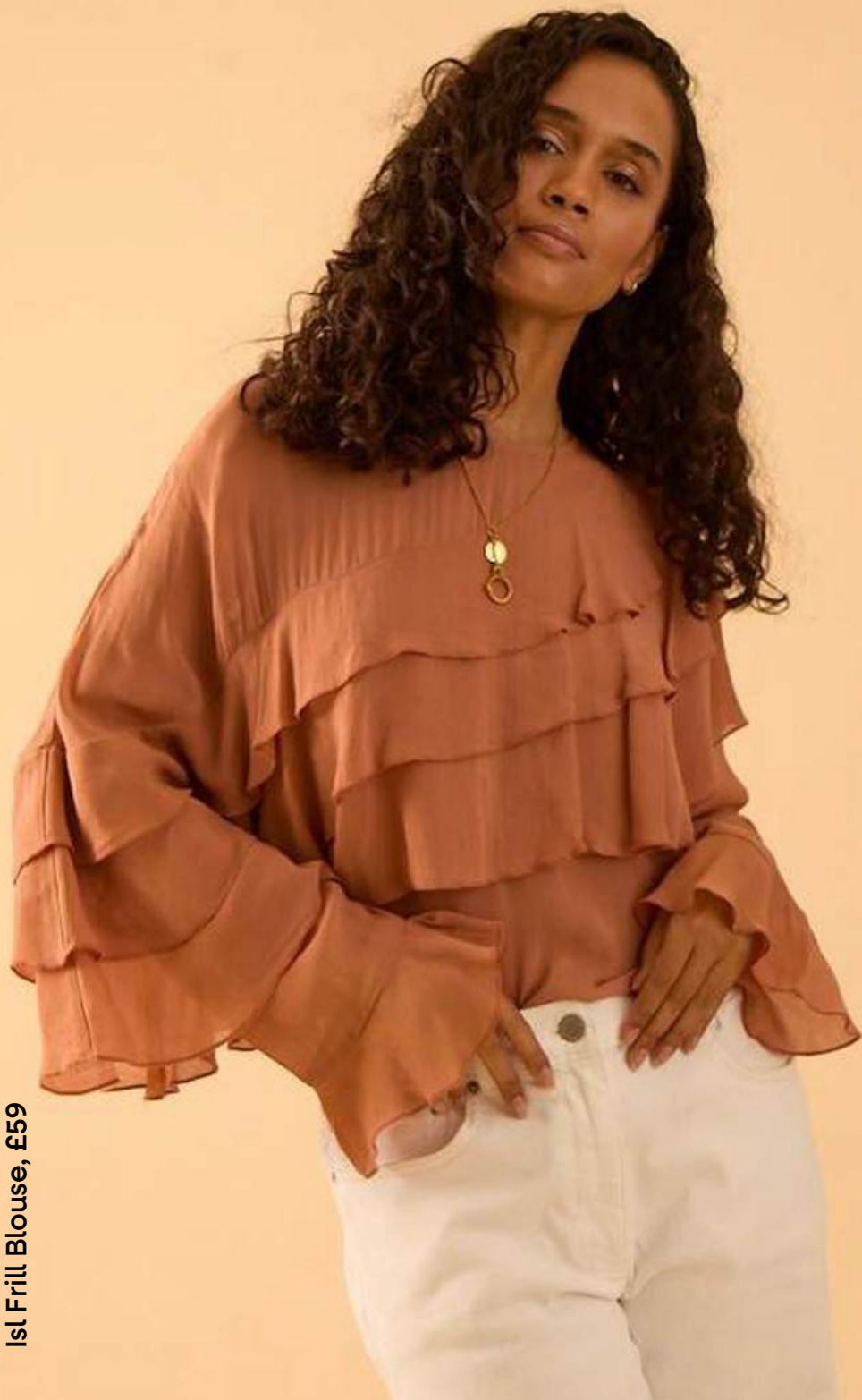
Isl Frill Blouse, £59