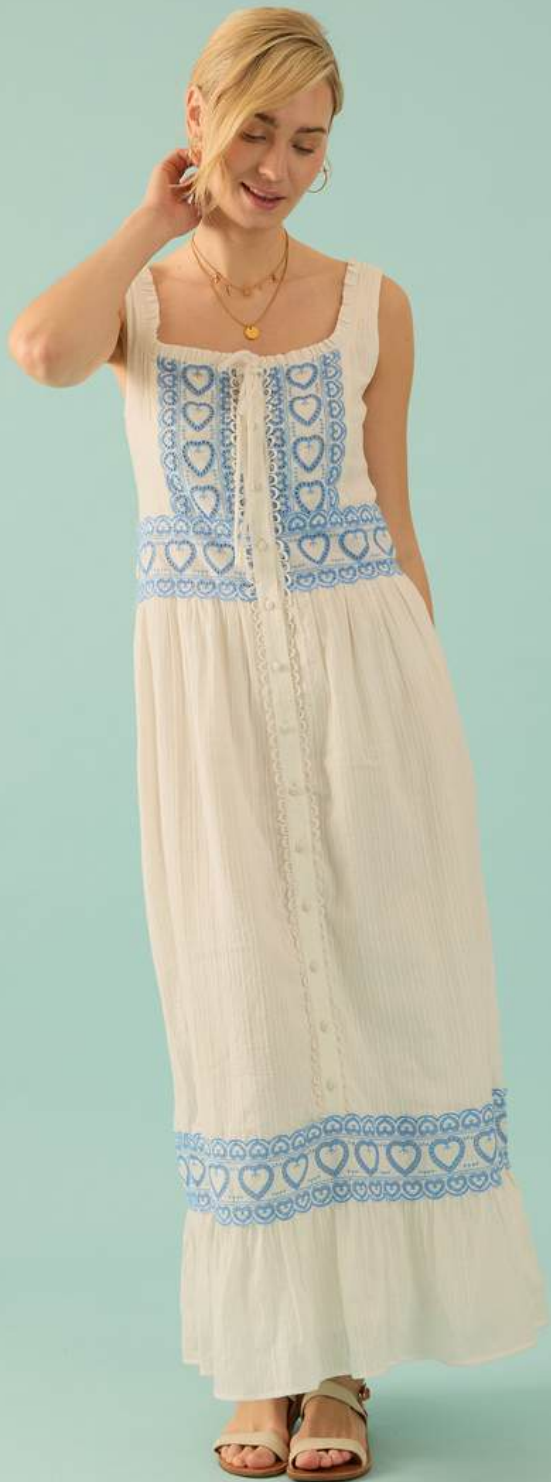
Harri Embroiderery Heart Dress, £79