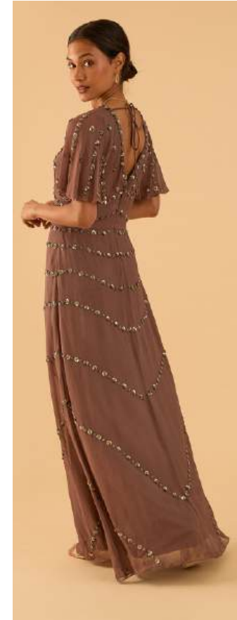
Rose Mink Sequin Maxi Dress, £139