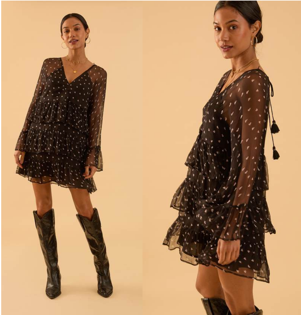
Evie Heart Print Tiered Mini Dress, £89