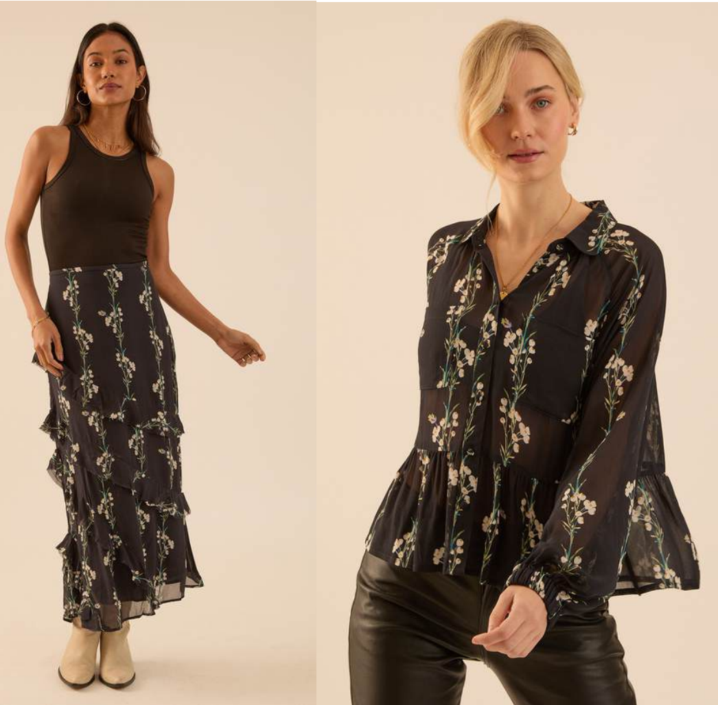
LEFT: Sophia Black Print Frill Detail Midi Skirt, £79 RIGHT: Sophia Black Print Blouse, £59