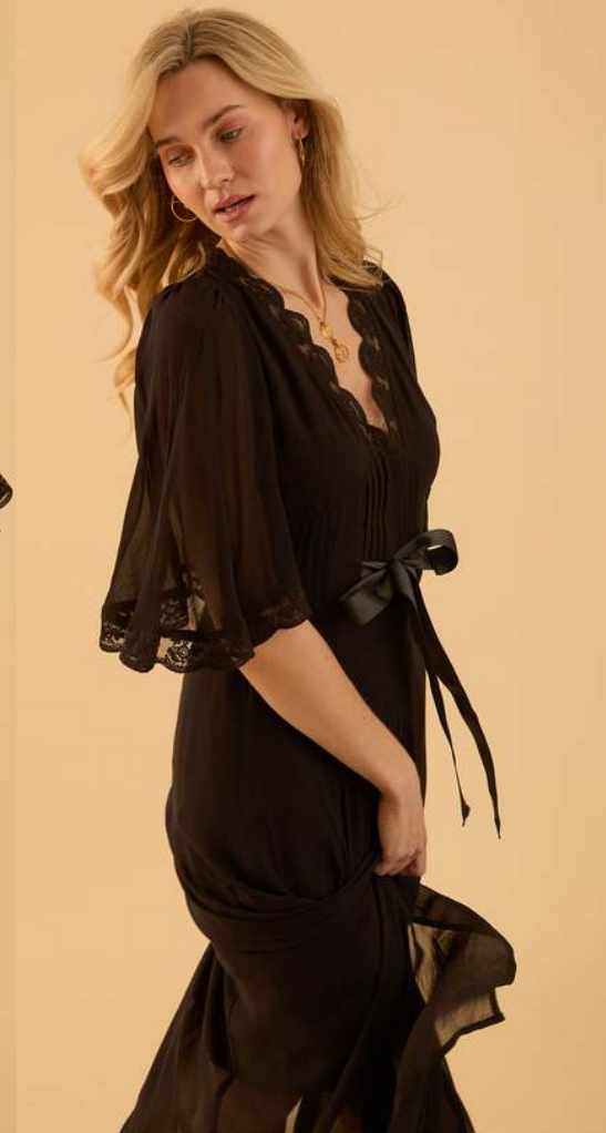
Chloe Black Tie Front Dress, £89