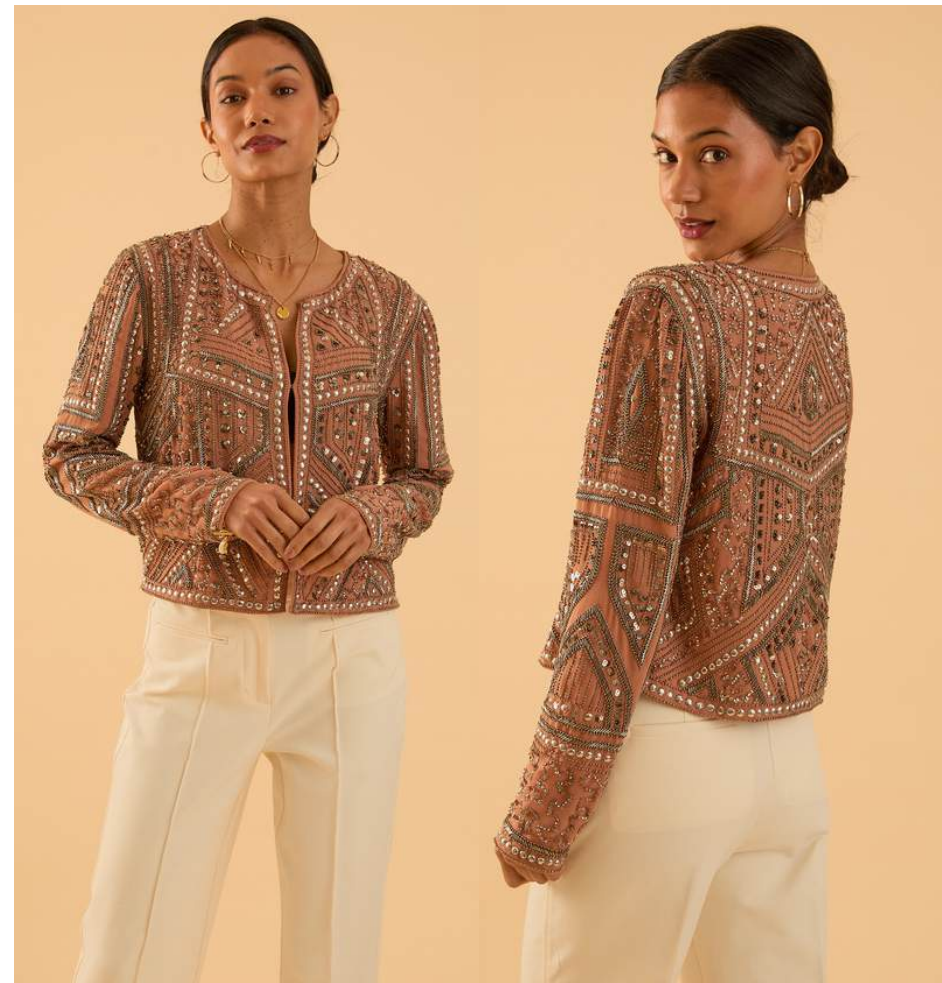
Briar Sequin Jacket: £139