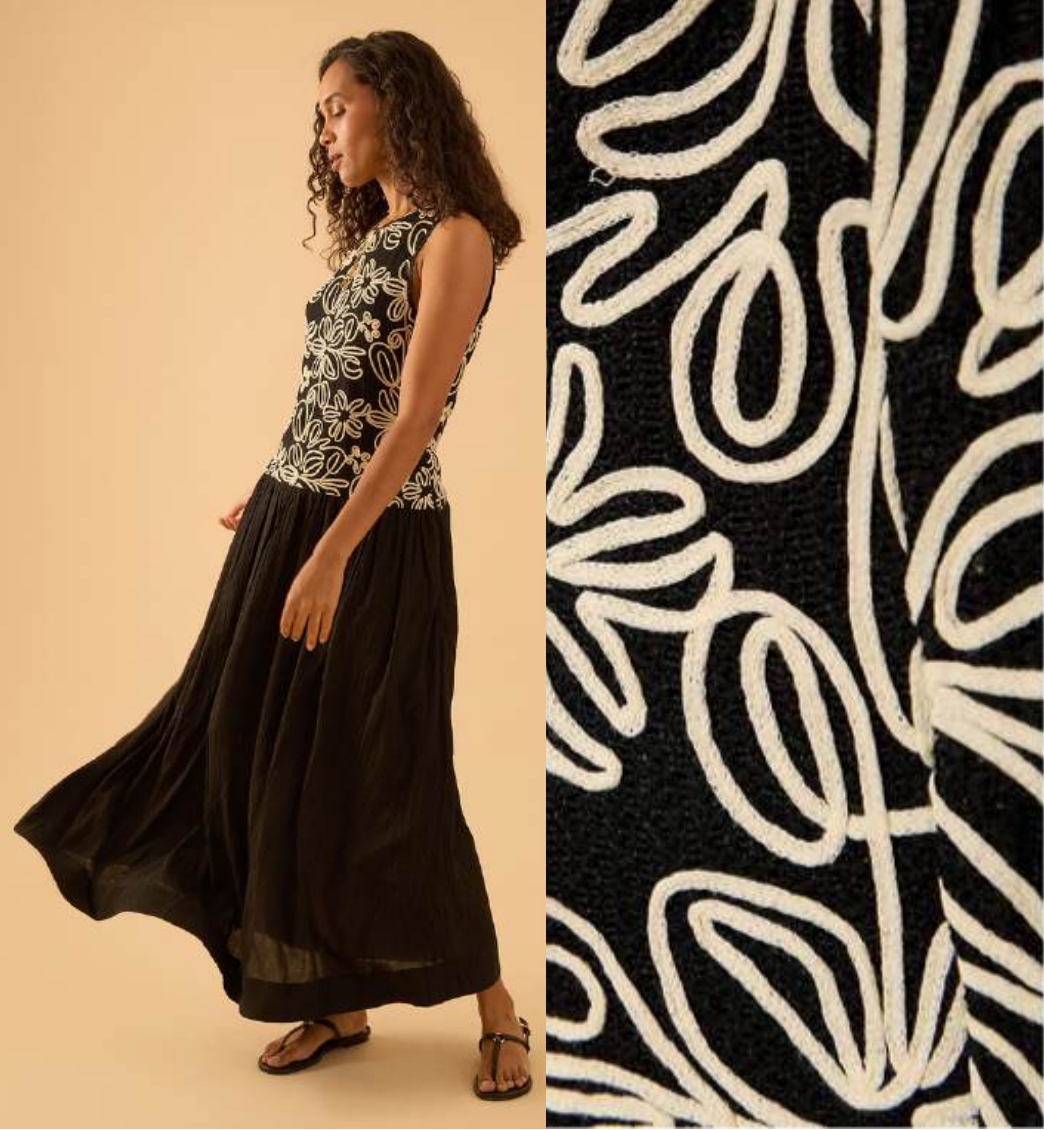
Rhea Black Lace Sleeveless Dress, £79