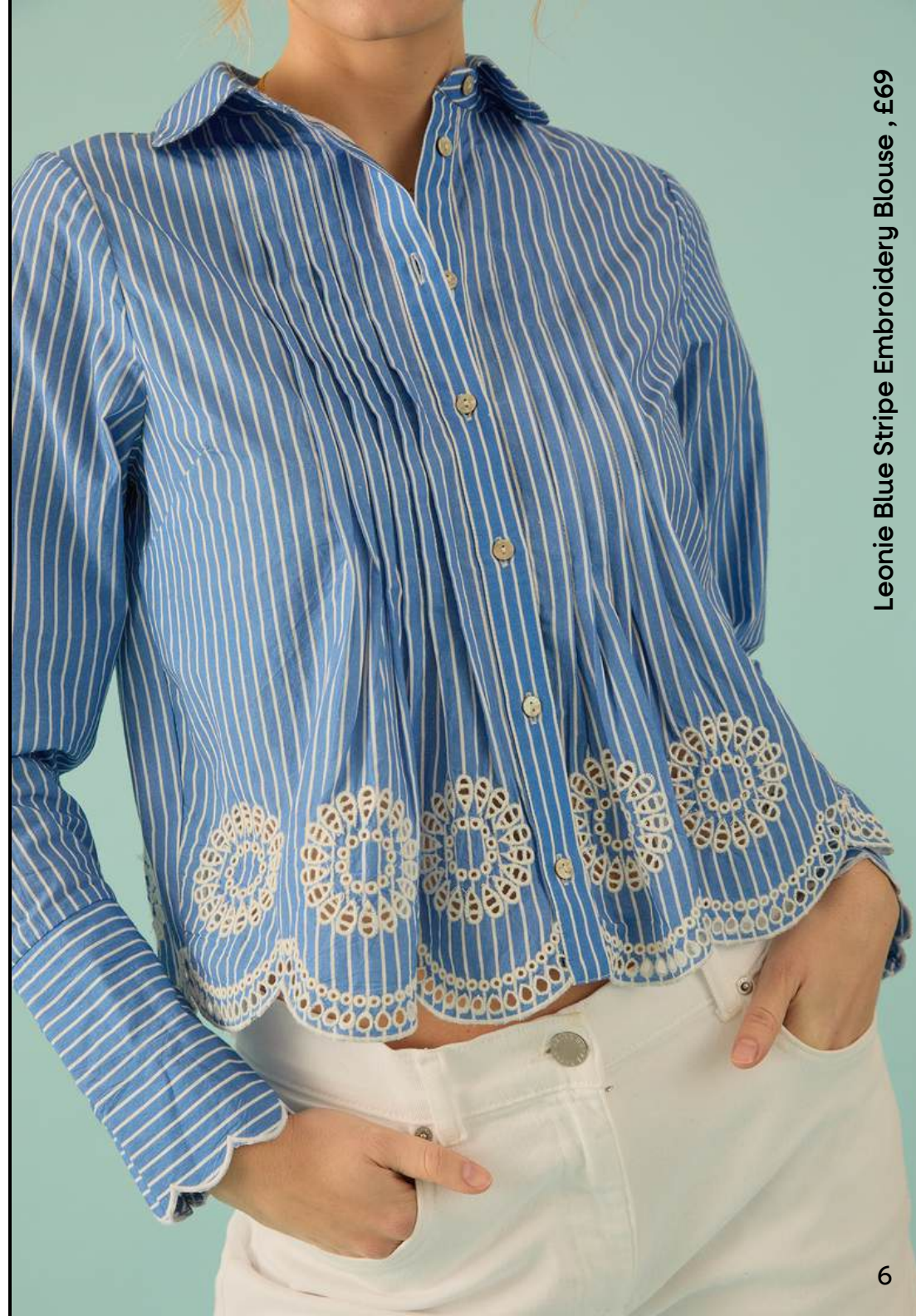
Leonie Blue Stripe Embroidery Blouse , £69