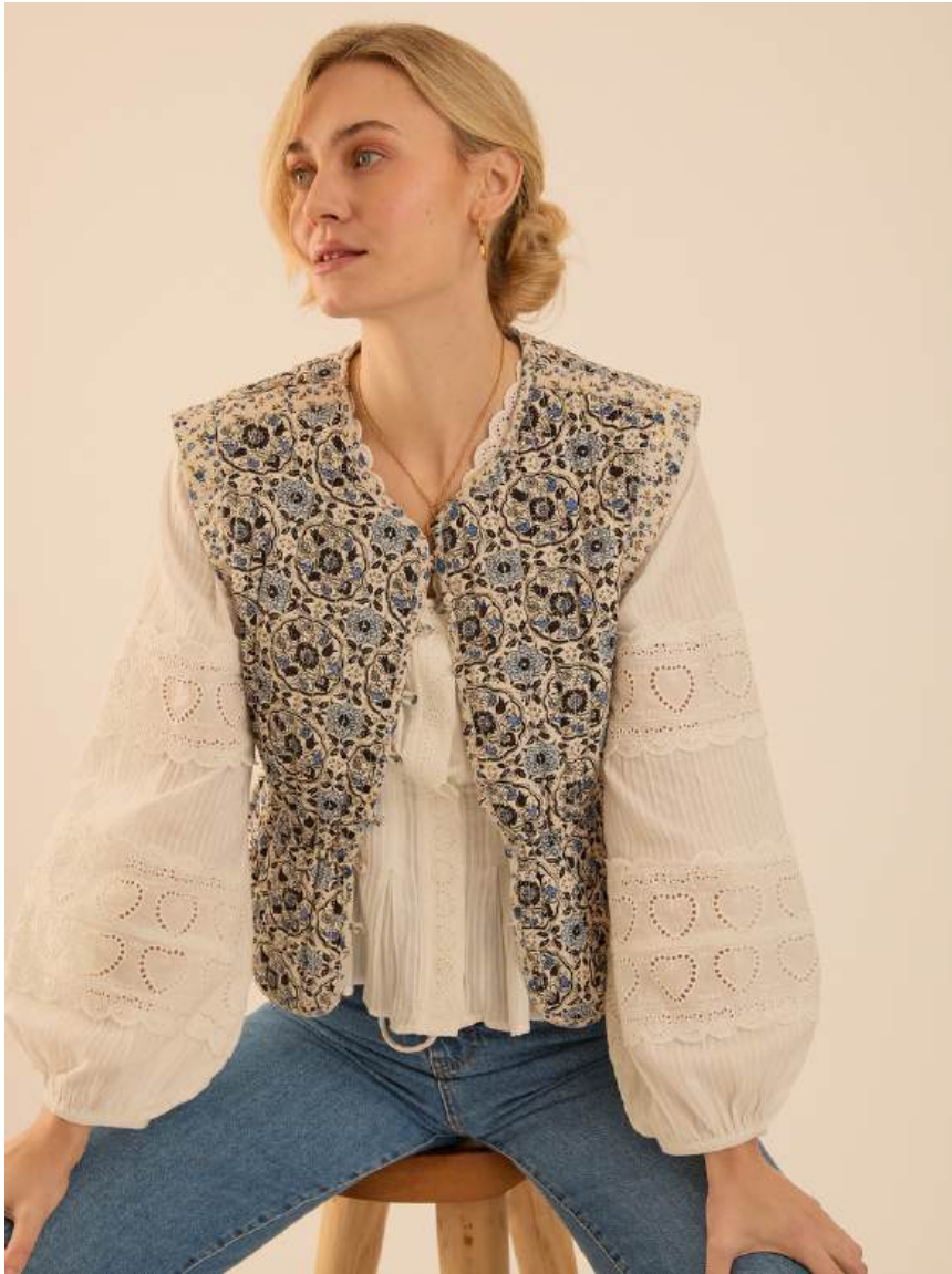
Kate Blue Tile Print Gilet, £69