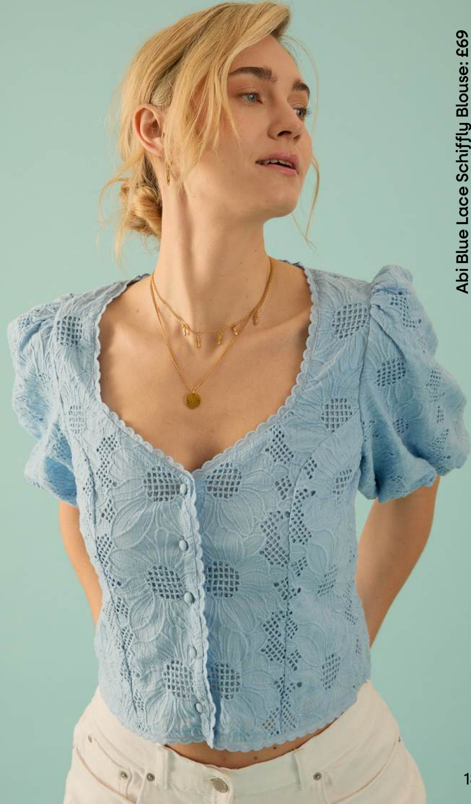
Abi Blue Lace Schiffl Blouse: £69