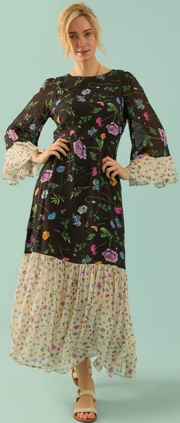
Flora Print Tiered Midi Dress, £99