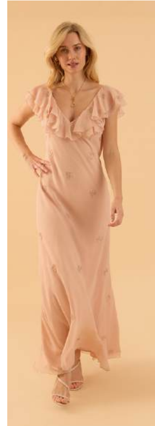
Lily Pink Heart Beaded Maxi Dress £109