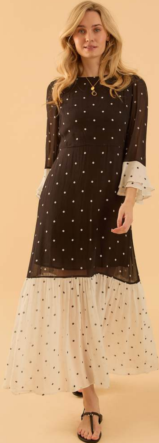
Ella Spot Print Maxi Dress, £99