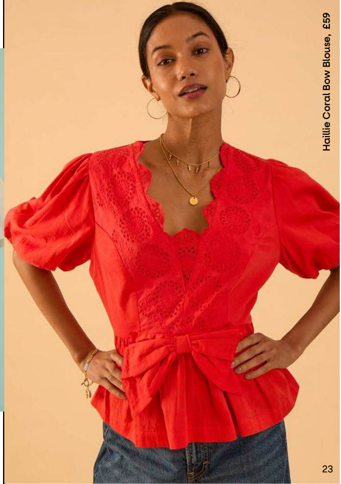
Haillie Coral Bow Blouse, £59