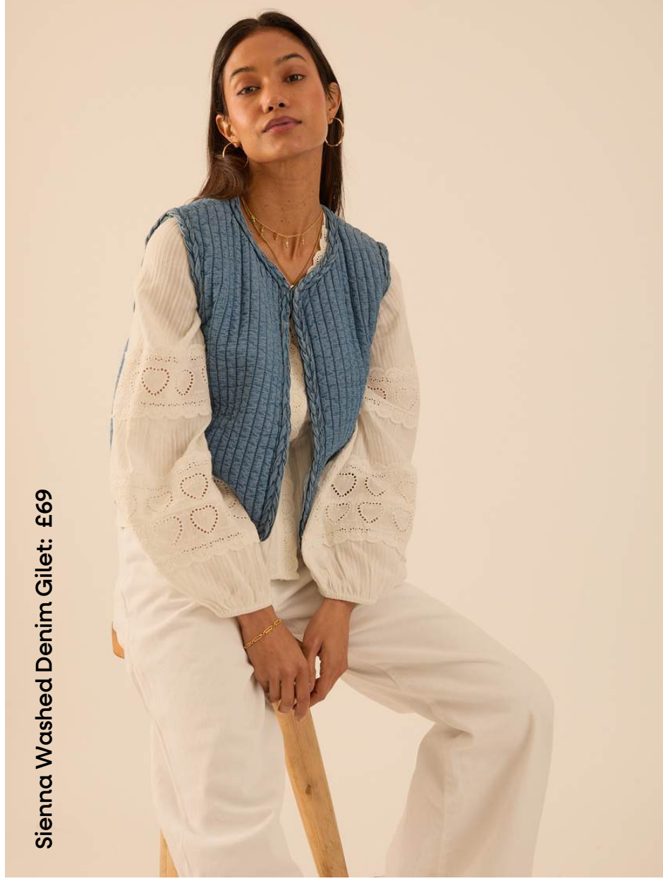
Sienna Washed Denim Gilet: £69