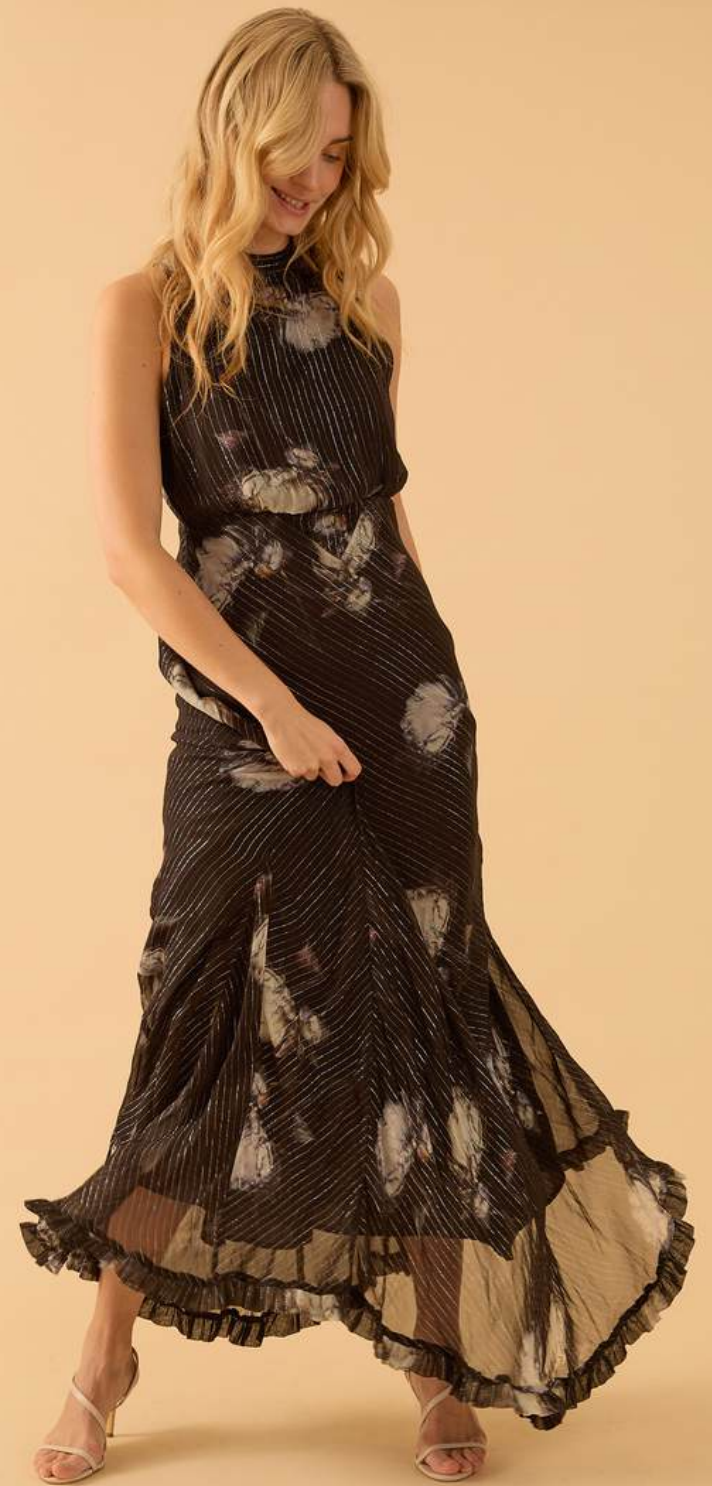
Luna Print Maxi Dress, £119