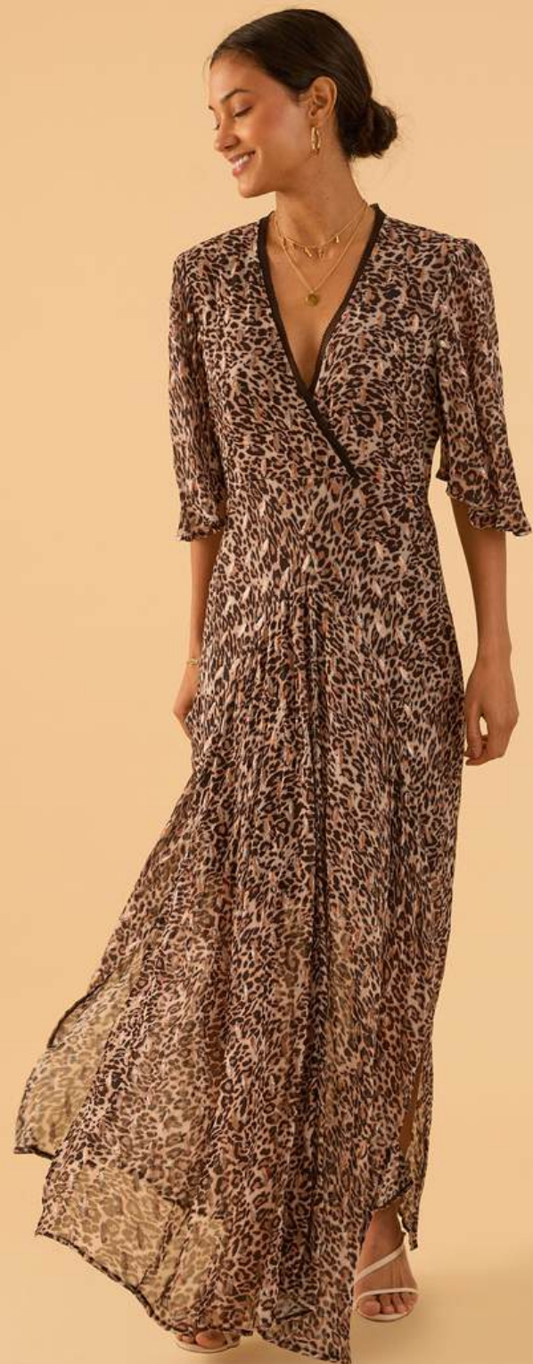
Sienna Leopard Print Maxi Dress : £119