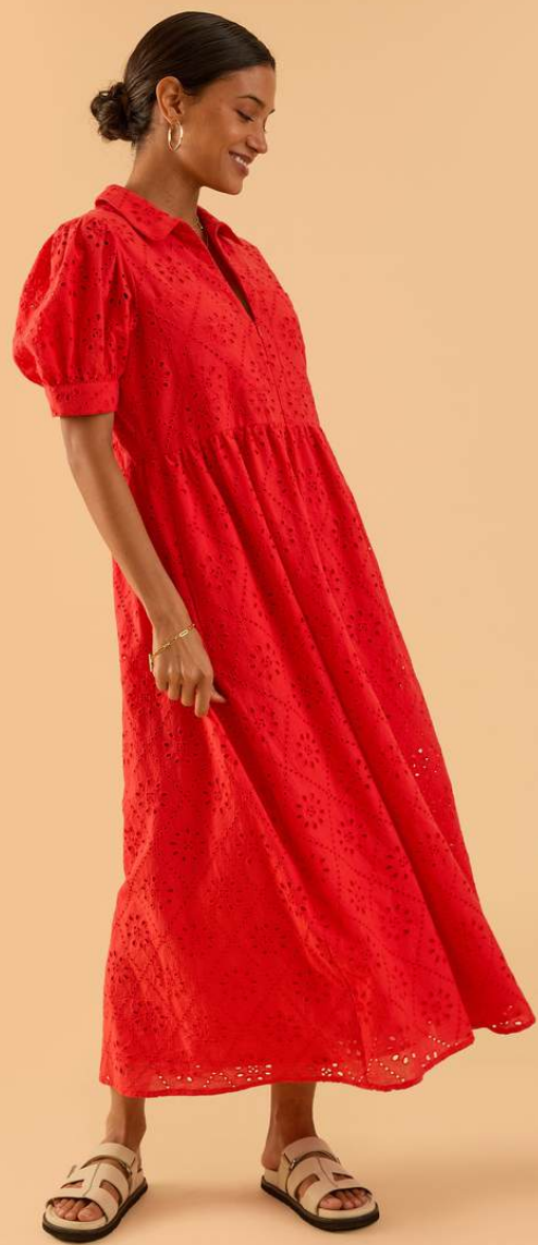
LEFT: Olivia Coral Red Broderie Shirt Dress: £89 RIGHT: Haillie Ivory Bow Blouse, £59