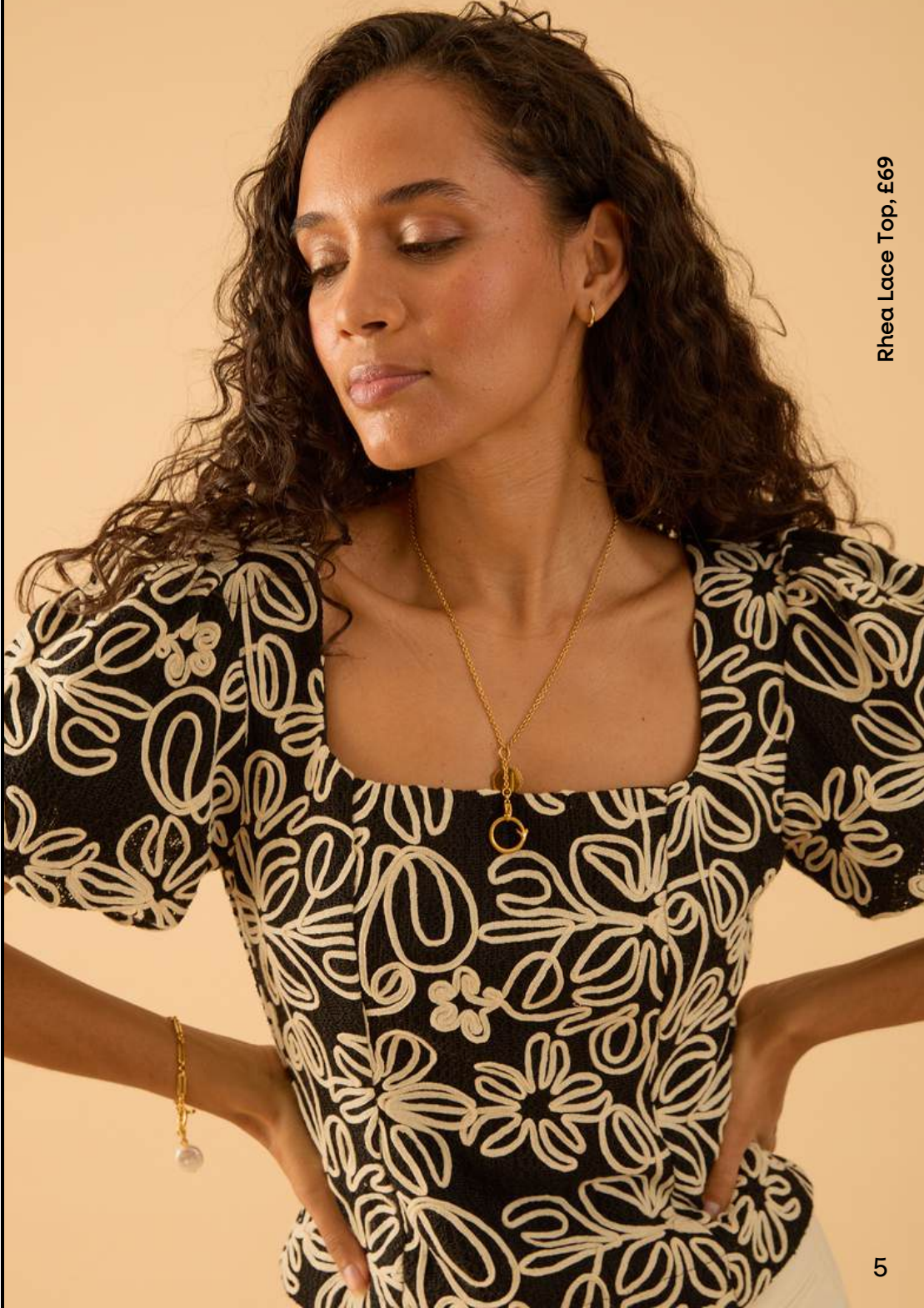
Rhea Lace Top, £69