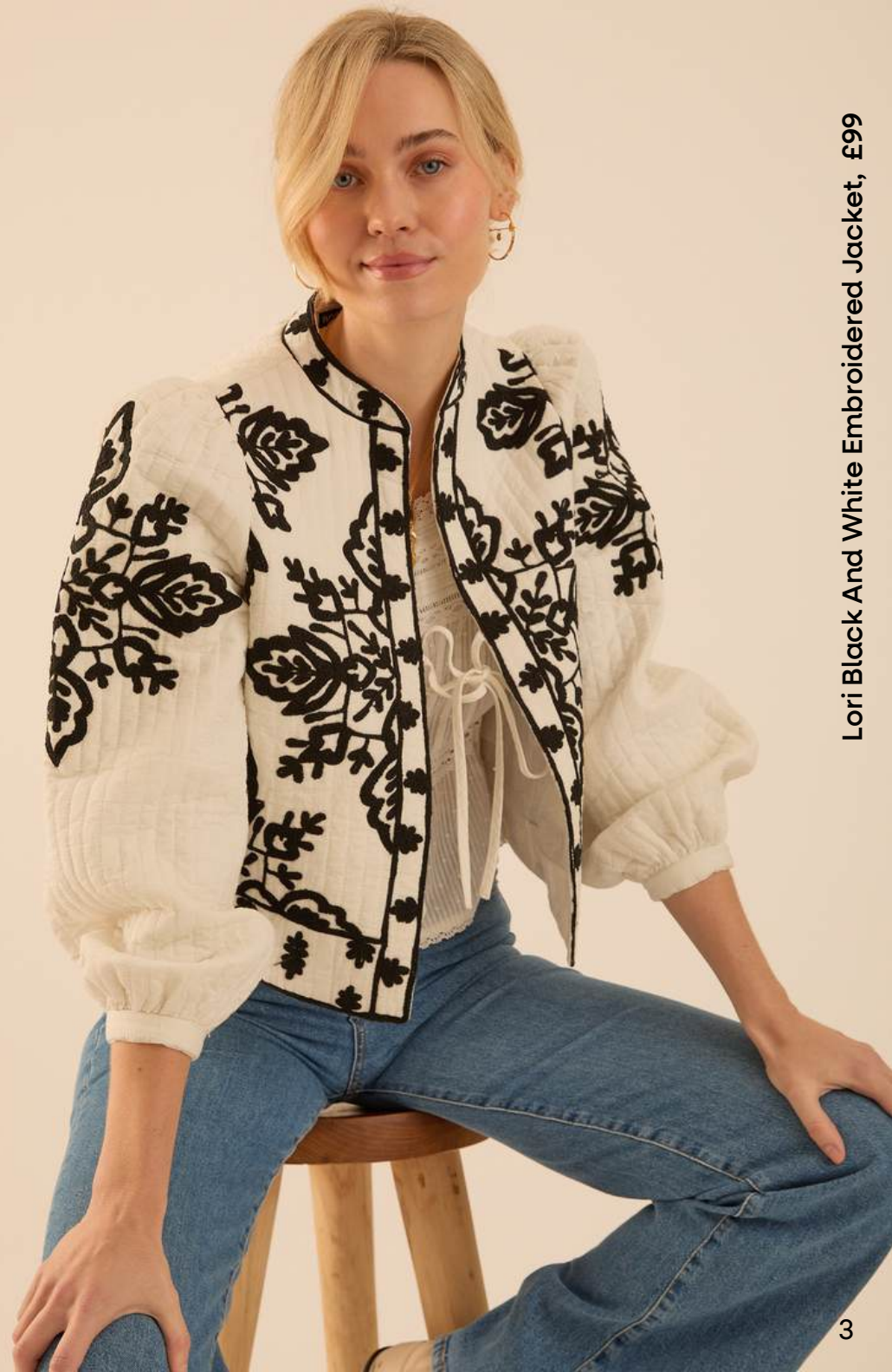
Lori Black And White Embroidered Jacket, £99