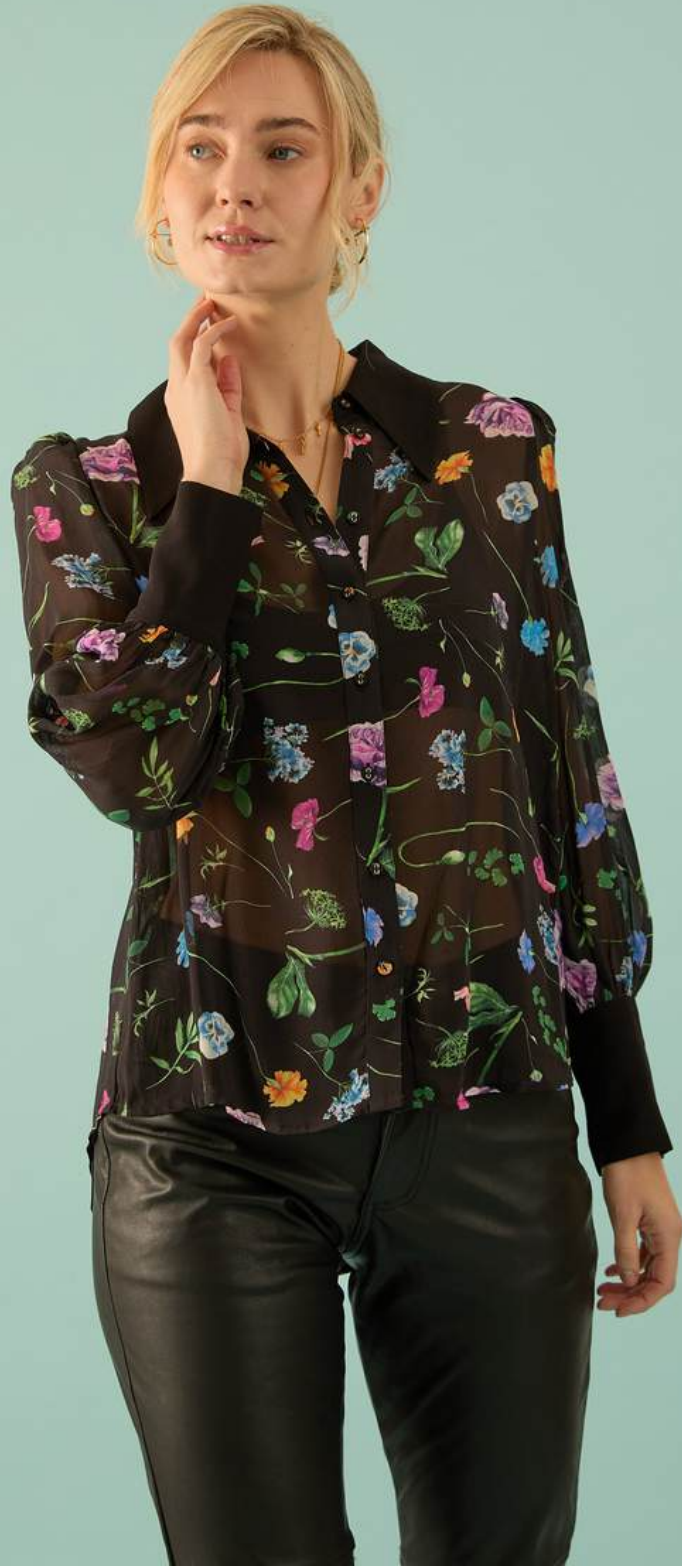
Flora Print Shirt: £99