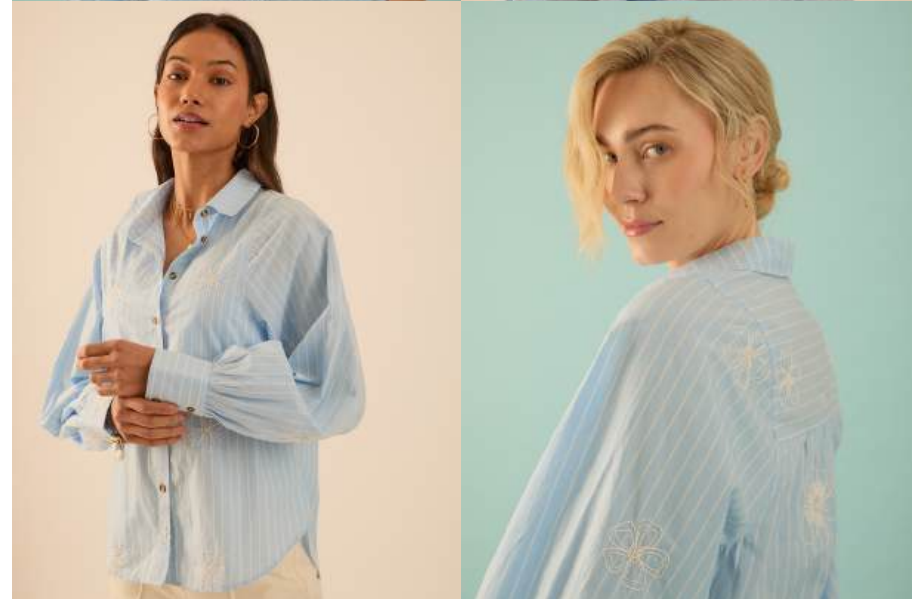
Flo Poplin Blue Stripe Embroidered Blouse, £59