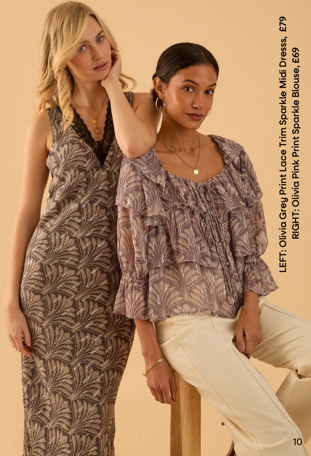
LEFT: Olivia Grey Print Lace Trim Sparkle Midi Dress, £79 RIGHT: Olivia Pink Print Sparkle Blouse, £69