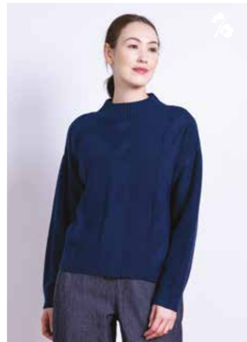
KT7093 / Cable Knit Jumper 80% Organic Cotton, 20% RWS Wool Thunder / Sizes S,M,L