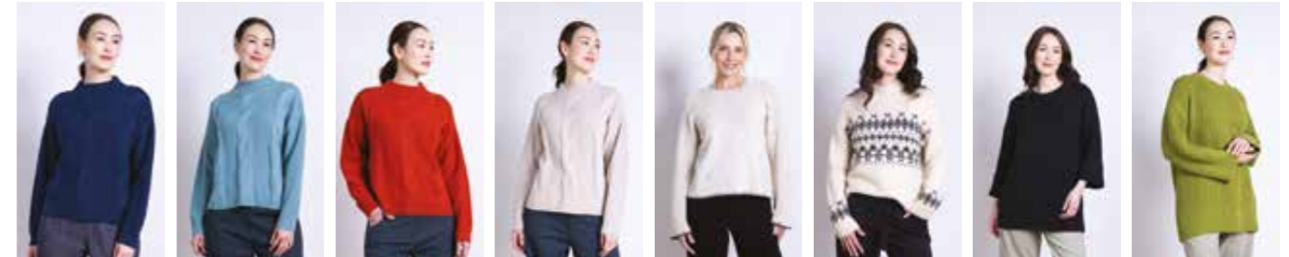
KT7093 / Thunder Pg 14 KT7093 / Arctic Pg 22 KT7093 / Pumpkin Pg 22 KT7093 / Sand Pg 31,46 FC7092 / Ivory Pg 59 RW7089 / Ivory Pg 58 AP7090 / Black Pg 59 AP7090 / Lime Pg 45