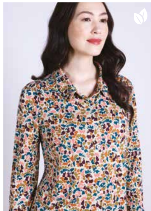
DL4214 / Jersey Shirt 100% Lenzing Ecovero Jersey Ecru / Sizes 8-20