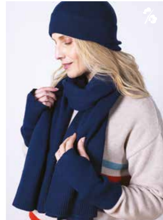
KT0212 / Plain Knitted Hat KT0327 / Plain Knitted Scarf KT0503 / Plain Knitted Fingerless Gloves 80% Organic Cotton, 20% RWS Wool Thunder / One Size