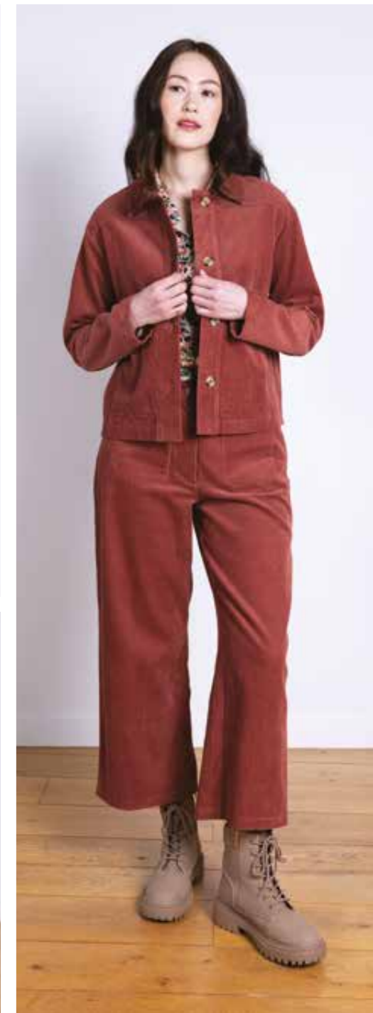
NR6030 / Cord Jacket 100% Cotton Chunky Cord Rose / Sizes 8-20