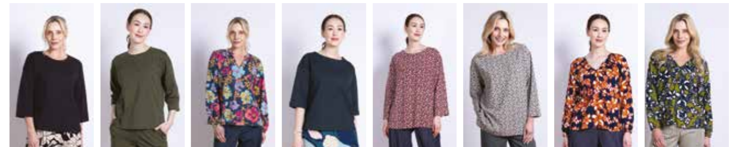
JP4226 / Black Pg 53 JP4226 / Juniper Pg 40 BL4230 / Space Pg 21 HJ4184 / Midnight Pg 42 IV4235 / Scarlet Pg 13 IV4235 / Buff Pg 33 MT4227 / Oxford Pg 11 MT4227 / Pea Pg 38