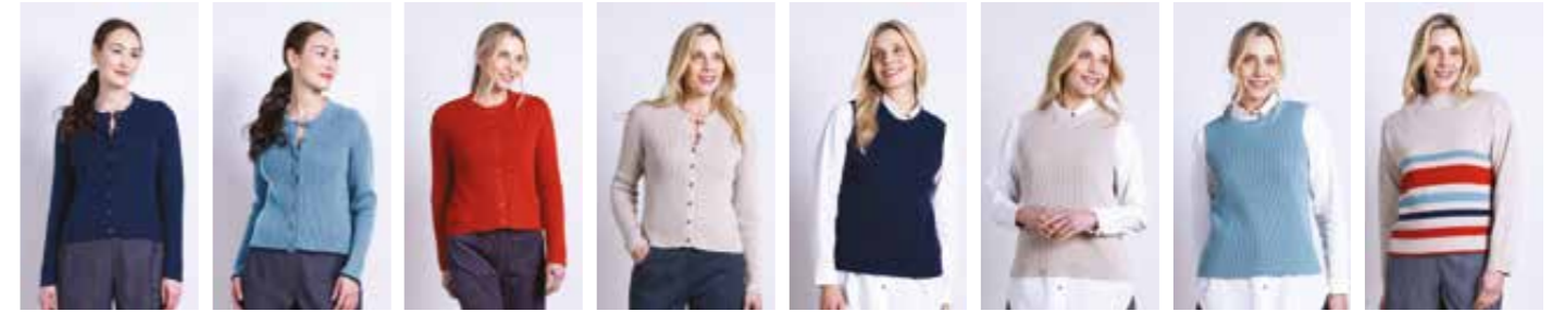
KT7094 / Thunder Pg 11,15 KT7094 / Arctic Pg 21,22 KT7094 / Pumpkin Pg 22 KT7094 / Sand Pg 31,32,46 KT7097 / Thunder Pg 15 KT7097 / Sand Pg 31,47 KT7097 / Arctic Pg 23 KT7098 / Multi Pg 15