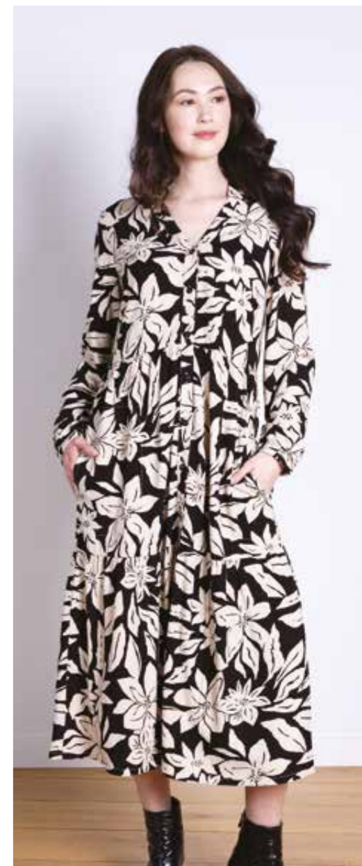
AM2196 / Tiered Midi Shirtdress 100% Viscose Black / Sizes 8-20

OUR HERO PRINT AMARYLLIS IN WOVEN VISCOSE, COMING IN TWO COLOURWAYS, FEATURES IN OUR TIERED SHIRTDRESS AND EFFORTLESSLY COOL WIDE LEG TROUSERS AND SMOCK TOP.