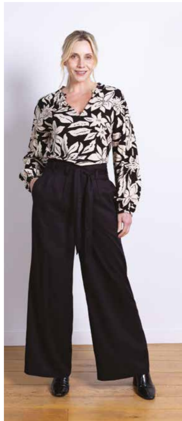
AM4236 / Smock Top 100% Viscose Black / Sizes 8-20