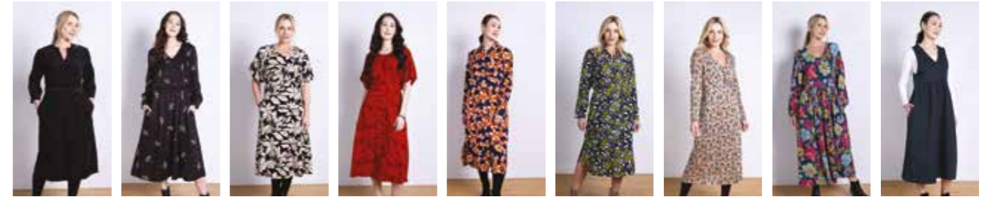
NR2203 / Black Pg 54 EM2205 / Black Pg 57 AM2206 / Black Pg 53 AM2206 / Burgundy Pg 50 MT2204 / Oxford Pg 10 MT2204 / Pea Pg 39 DL2201 / Ecrú Pg 28 BL2200 / Space Pg 20 HJ2198 / Midnight Pg 43