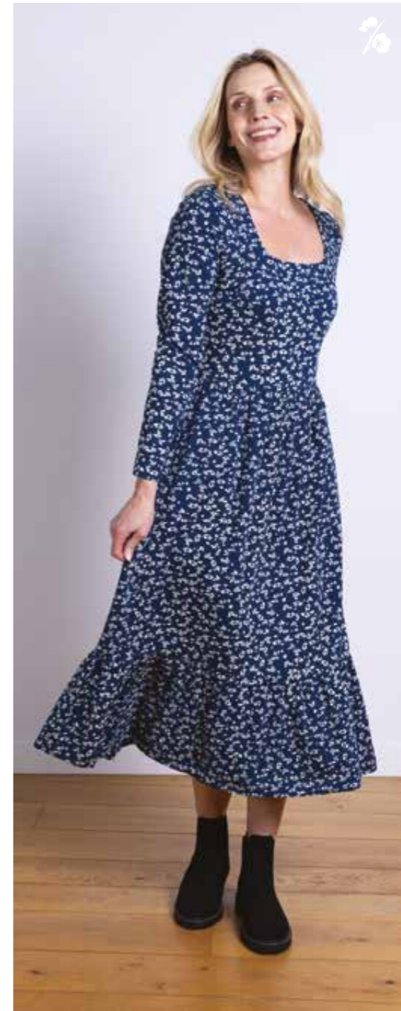
ET2199 / Tiered Dress 100% Organic Cotton Jersey Oxford / Sizes 8-20