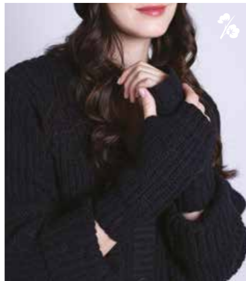
AP0212 / Knitted Hat 83% Organic Cotton, 17% Alpaca Black / One Size