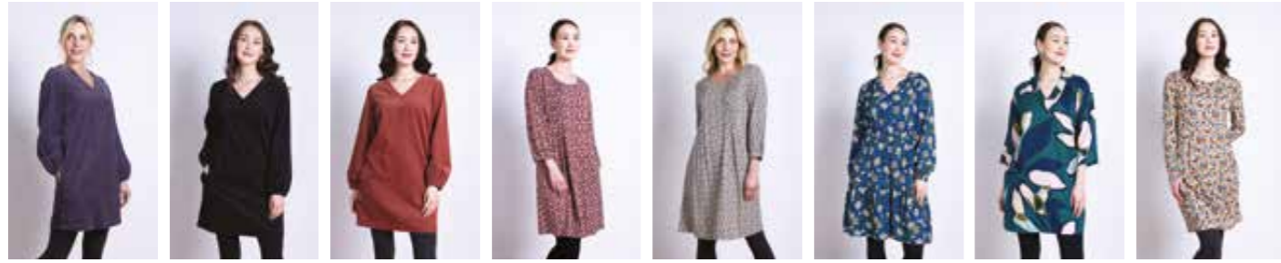
NR3176 / Plum Pg 24 NR3176 / Black Pg 55 NR3176 / Rose Pg 28 IV3179 / Scarlet Pg 12 IV3179 / Buff Pg 33 LC3178 / Oxford Pg 44 SD3169 / Nordic Pg 42 DL3146 / Ecrú Pg 29