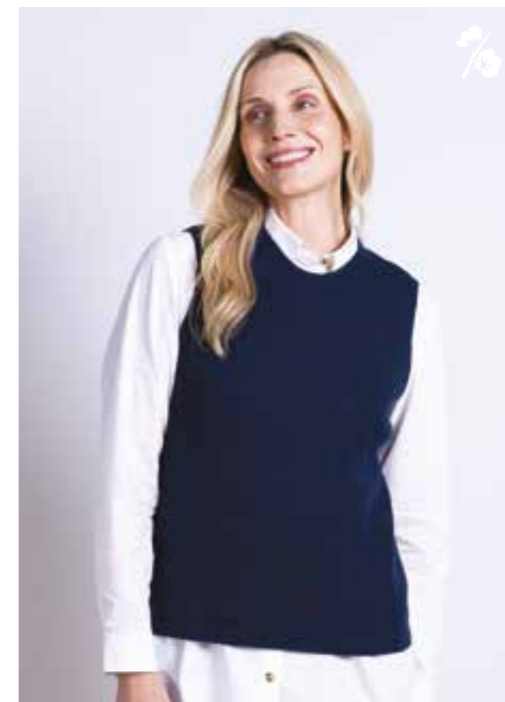
KT7097 / Knitted Vest 80% Organic Cotton, 20% RWS Wool Thunder / Sizes S,M,L