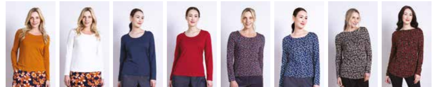
JP4064 / Apricot Pg 10 JP4064 / Ivory Pg 11 JP4064 / Oxford Pg 9,38 JP4064 / Scarlet Pg 15,56 ET4185 / Multi Pg 25 ET4185 / Oxford Pg 9 BP4093 / Alabaster Pg 56 BP4093 / Jam Pg 55