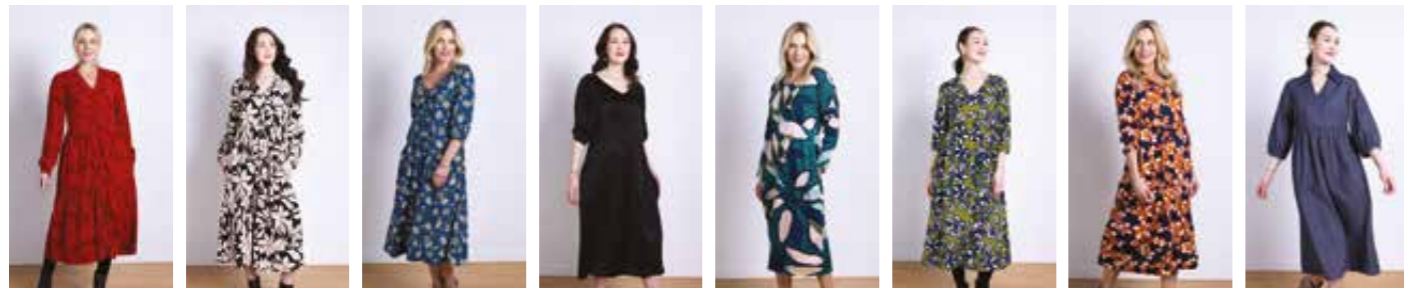
AM2196 / Burgundy Pg 51 AM2196 / Black Pg 53 LC2192 / Oxford Pg 45 VJ2197 / Black Pg 51 SD2190 / Nordic Pg 43 MT2219 / Pea Pg 38 MT2219 / Oxford Pg 10 CH2191 / Chambray Pg 8