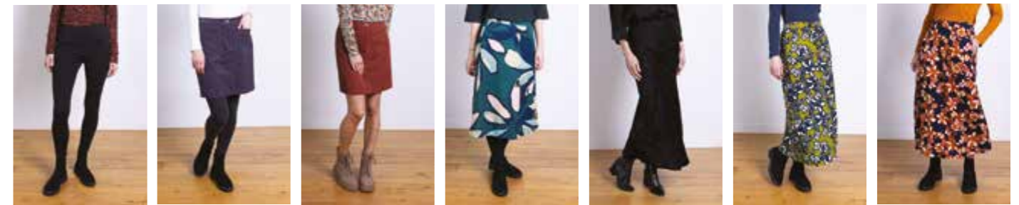
JP1043 / Black Pg 55 NR8051 / Plum Pg 24 NR8051 / Rose Pg 29 SD8061 / Nordic Pg 42 VJ8058 / Black Pg 50 MT8059 / Pea Pg 38 MT8059 / Oxford Pg 10