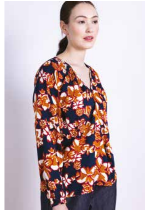
MT4227 / Gathered Neck Top 100% Viscose Twill Oxford / Sizes 8-20