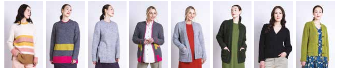
RS7096 / Multi Pg 35 RW7096 / Brights Pg 18 RE7096 / Grey Pg 19 RW7095 / Brights Pg 18 RE7095 / Grey Pg 19 RE7095 / Juniper Pg 40 AP7091 / Black Pg 59 AP7091 / Lime Pg 45