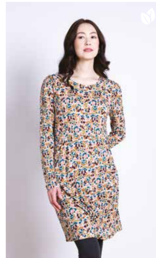
DL3146 / Tunic Dress 100% Lenzing Ecovero Jersey Ecru / Sizes 8-20