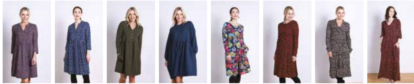
ET3177 / Multi Pg 25 ET3177 / Oxford Pg 8 JP3174 / Juniper Pg 41 MC3170 / Space Pg 12 BL3171 / Space Pg 20 BP3171 / Jam Pg 55 BP2090 / Alabaster Pg 56 BP2193 / Jam Pg 54