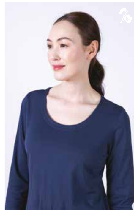
JP4064 / Round Neck Top 100% GOTS Organic Cotton Jersey Oxford / Sizes 8-20