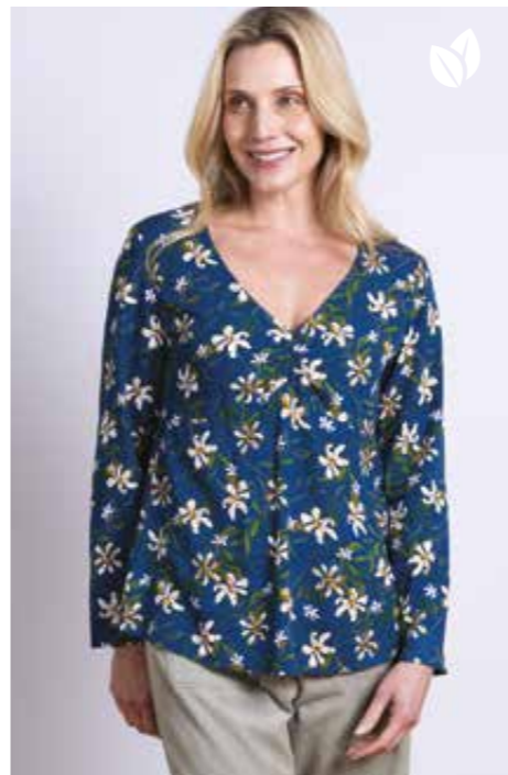
LC4225 / Ruched Front Long Top 100% Woven Ecovero Viscose Oxford / Sizes 8-20