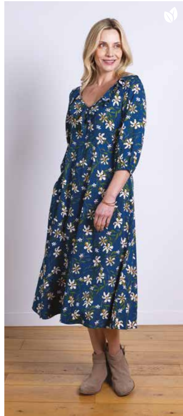
LC2192 / Frill Midi Dress 100% Woven Ecovero Viscose Oxford / Sizes 8-20