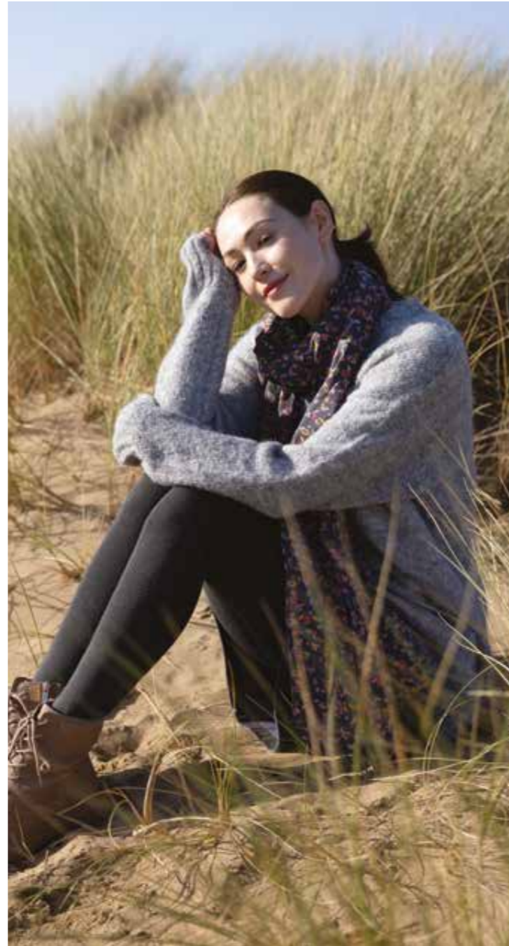
TG0499 / Tights 80% Bamboo, 18% Polyamide, 2% Elastane Anthracite / Sizes S,M,L