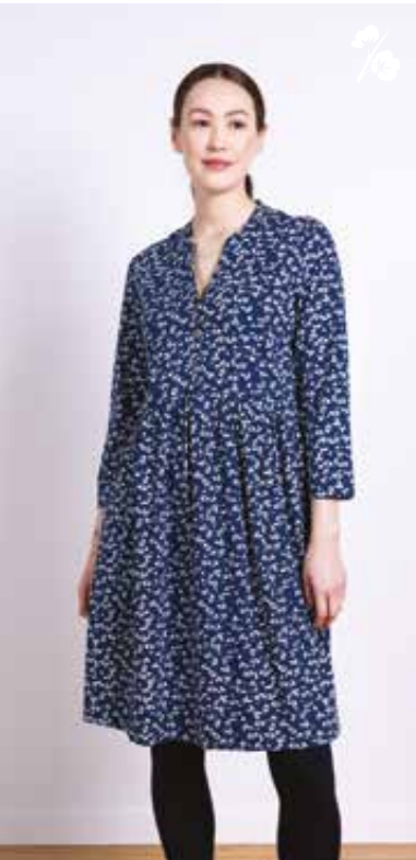
ET3177 / Tunic Dress 100% Organic Cotton Jersey Oxford / Sizes 8-20