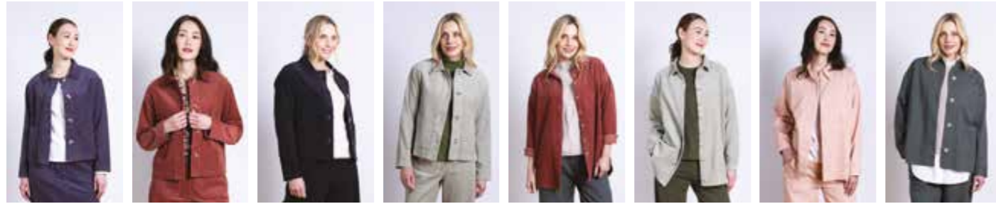
NR6030 / Plum Pg 24 NR6030 / Rose Pg 29 NR6030 / Black Pg 54 NR6030 / Ecrú Pg 40 NR4234 / Rose Pg 28 NR4234 / Ecrú Pg 41 CD6038 / Parfait Pg 31 CD6038 / Buff Pg 33