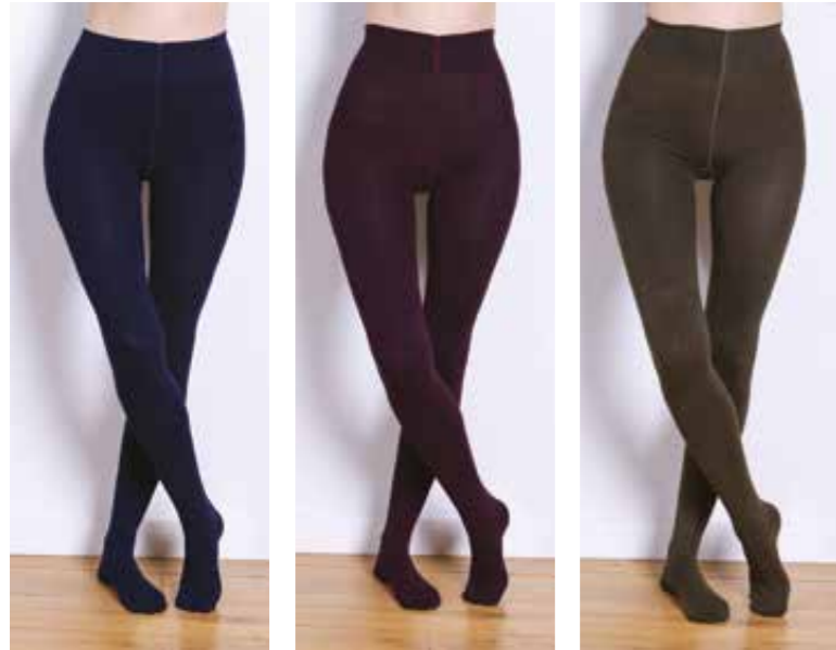
TG0499 / Navy TG0499 / Black Cherry TG0499 / Juniper