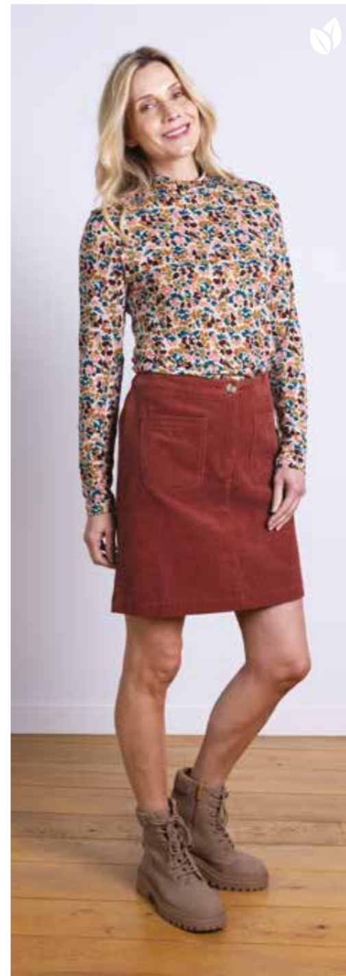
DL4249 / Polo Neck Top 100% Lenzing Ecovero Jersey Ecru / Sizes 8-20