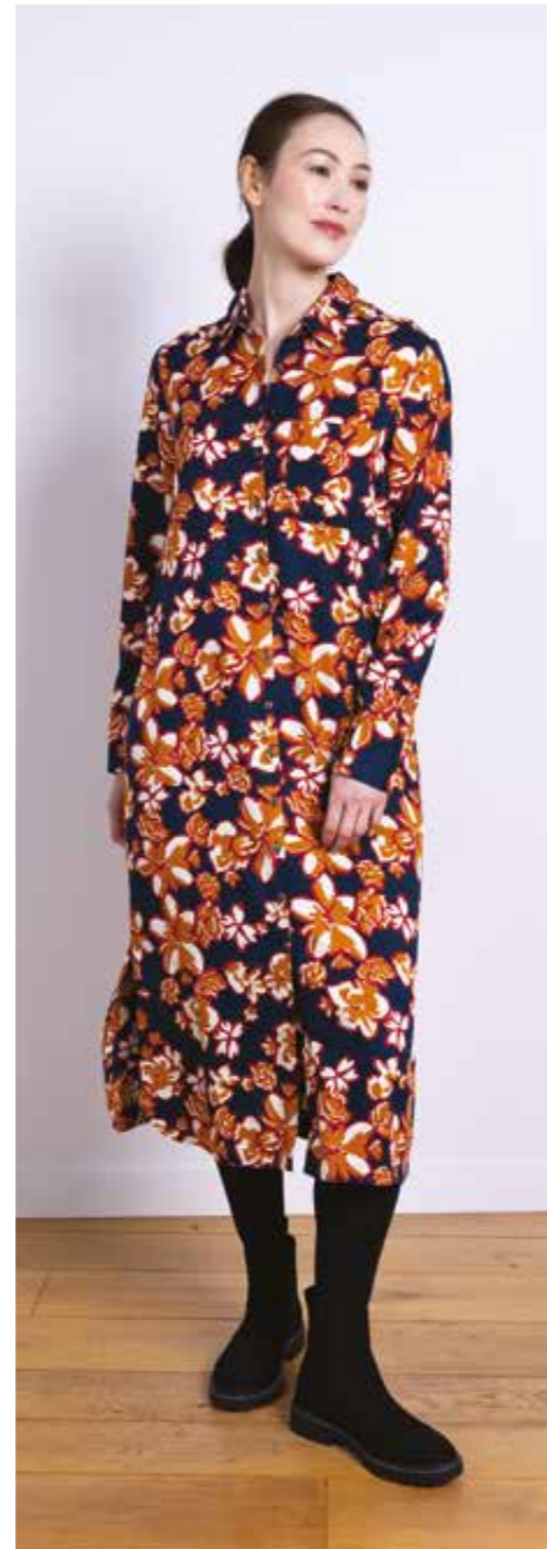
MT2204 / Shirt Dress 100% Viscose Twill Oxford / Sizes 8-20