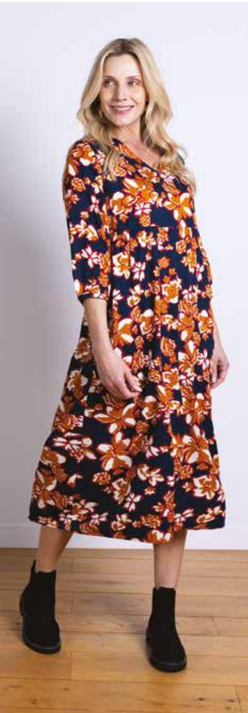
MT2219 / Puff Sleeve Midi Dress 100% Viscose Twill Oxford / Sizes 8-20