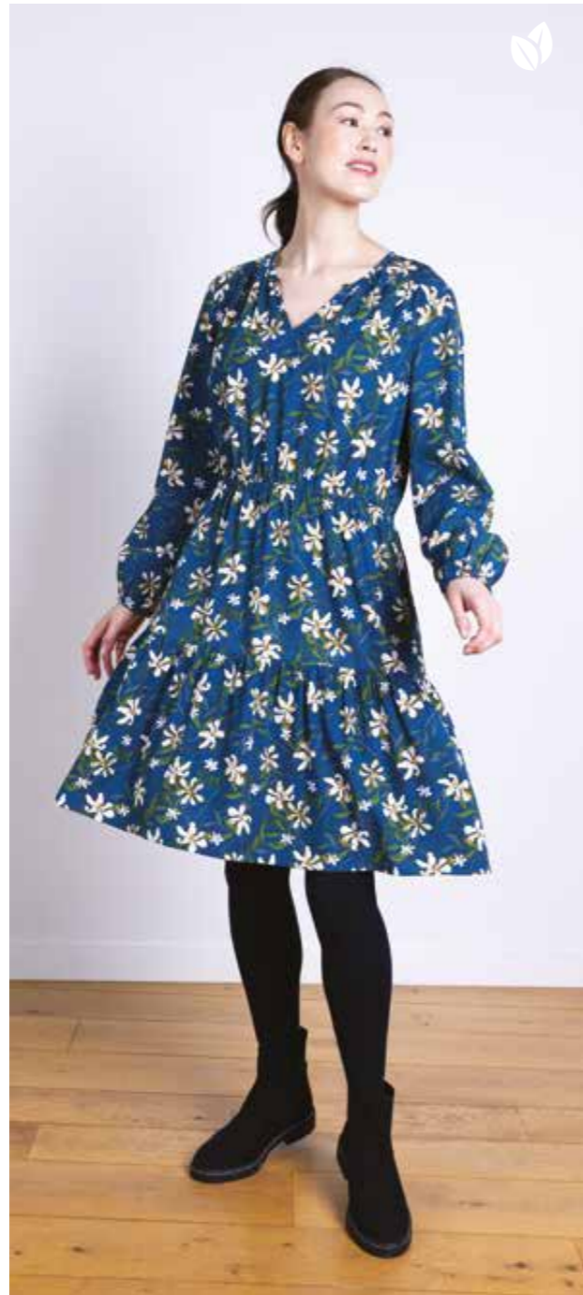
LC3178 / Gathered Tunic Dress 100% Woven Ecovero Viscose Oxford / Sizes 8-20