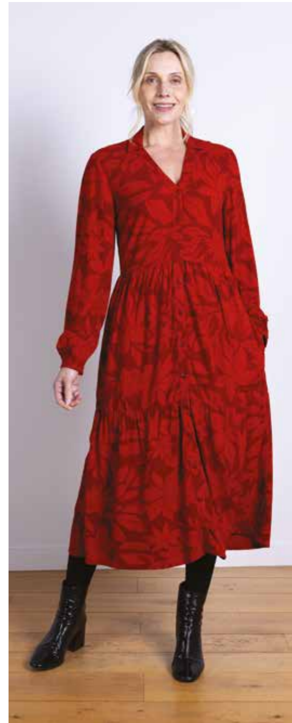
VJ4228 / Jacquard Shirt 100% Viscose Jacquard Black / Sizes 8-20