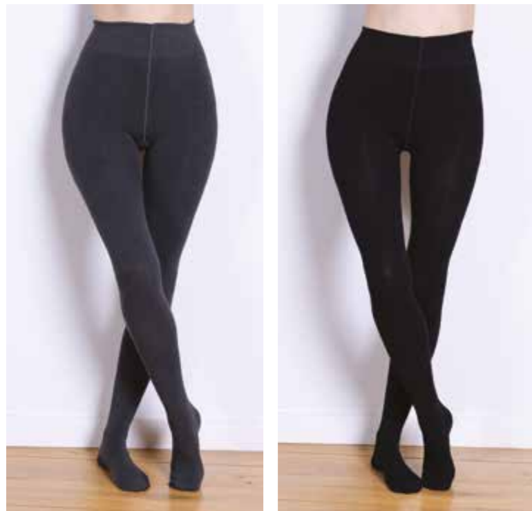
TG0499 / Anthracite TG0499 / Black