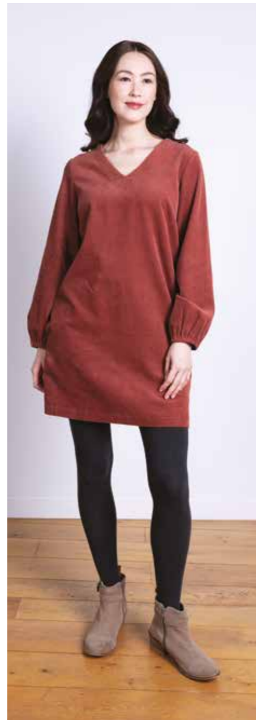
NR3176 / Gathered Cuff Tunic Dress 100% Cotton Chunky Cord Rose / Sizes 8-20