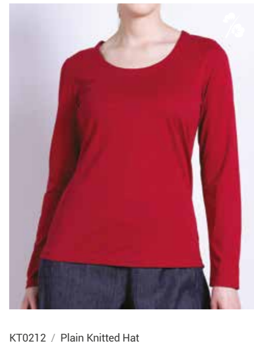
JP4064 / Round Neck Top 100% GOTS Organic Cotton Jersey Scarlet / Sizes 8-20