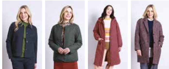
HJ6037 / Midnight Pg 39 QL6036 / Buff Pg 30 QL6522 / Rose Pg 34 QW6524 / Rust Pg 12