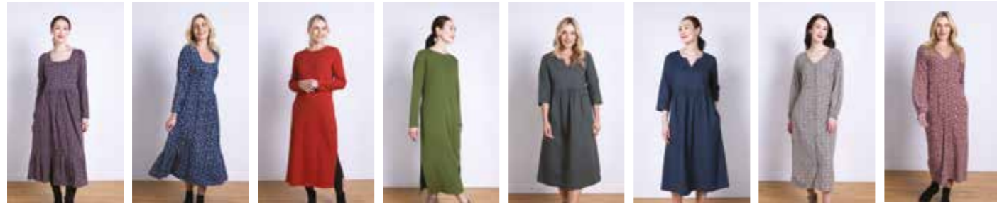
ET2199 / Multi Pg 24 ET2199 / Oxford Pg 9 RJ2194 / Rust Pg 19 RJ2194 / Basil Pg 40 CD2186 / Buff Pg 32 CD2186 / Space Pg 20,47 IV2195 / Buff Pg 32 IV2195 / Scarlet Pg 13