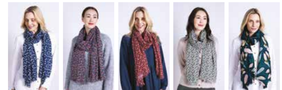
ET0308 / Oxford Pg 8 ET0308 / Multi Pg 25 IV0318 / Scarlet Pg 13 IV0318 / Buff Pg 33 SD0308 / Nordic Pg 43