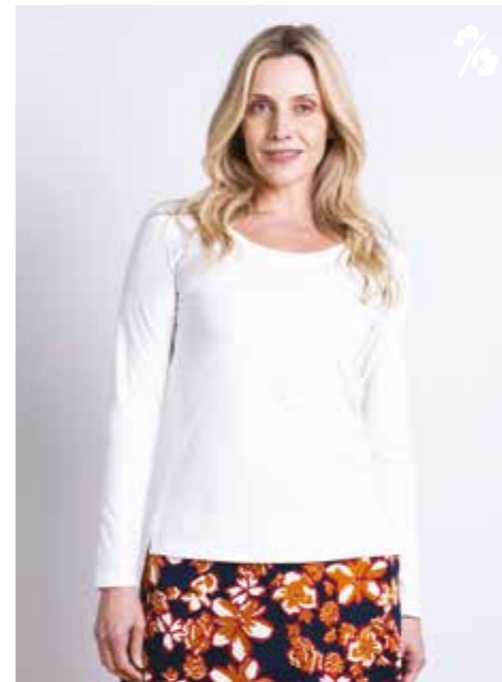
JP4064 / Round Neck Top 100% GOTS Organic Cotton Jersey Ivory / Sizes 8-20