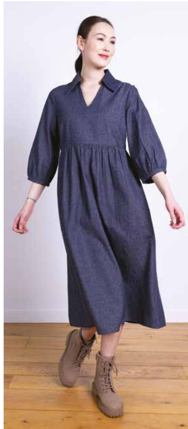
CH2191 / Open Collar Midi Dress 100% Cotton Chambray Chambray / Sizes 8-20