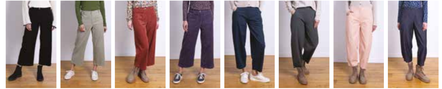
NR1104 / Black Pg 54 NR1104 / Ecrú Pg 41 NR1104 / Rose Pg 29 NR1104 / Plum Pg 25 CD1109 / Space Pg 22,46 CD1109 / Buff Pg 32 CD1109 / Parfait Pg 31 CH1087 / Chambray Pg 9