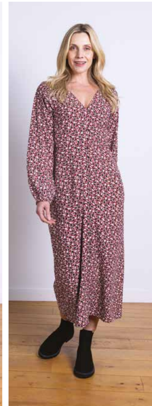
IV2195 / Sweetheart Midi 100% Viscose Scarlet / Sizes 8-20