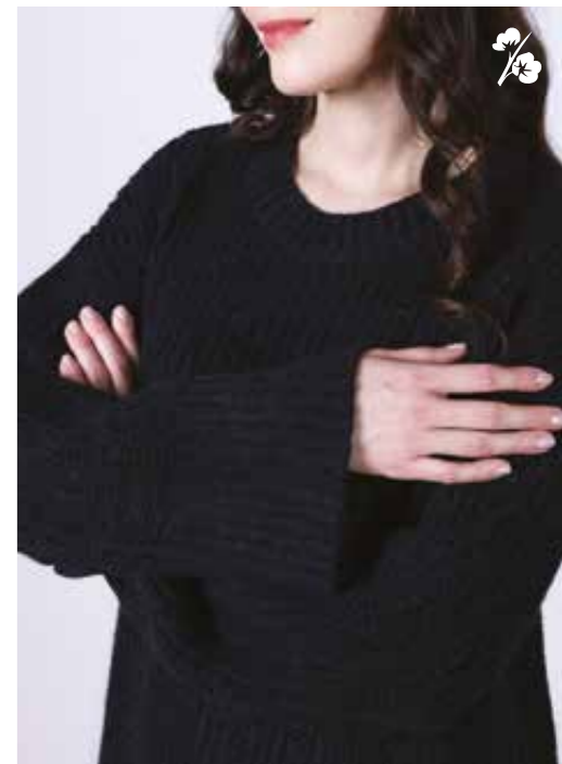
AP7090 / Cosy Round Neck Jumper 83% Organic Cotton, 17% Alpaca Black / Sizes S,M,L