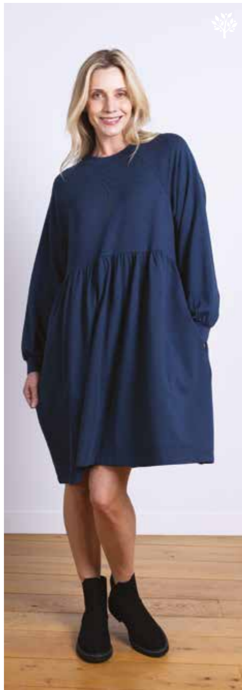
MC3170 / Sweatshirt Tunic Dress 70% Lenzing Modal, 25% Cotton, 5% Elastane Space / Sizes 8-20