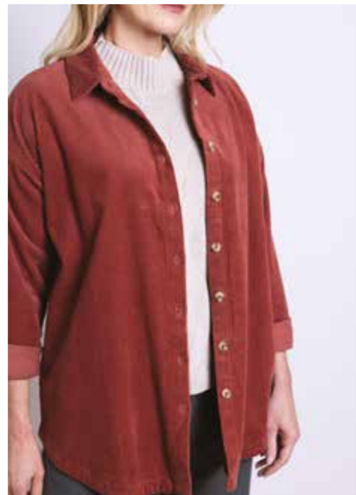
NR4234 / Cord Shirt 100% Cotton Chunky Cord Rose / Sizes 8-20