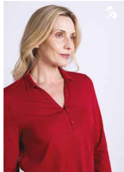
JP4232 / Collared Jersey Top 100% GOTS Organic Cotton Jersey Scarlet / Sizes 8-20