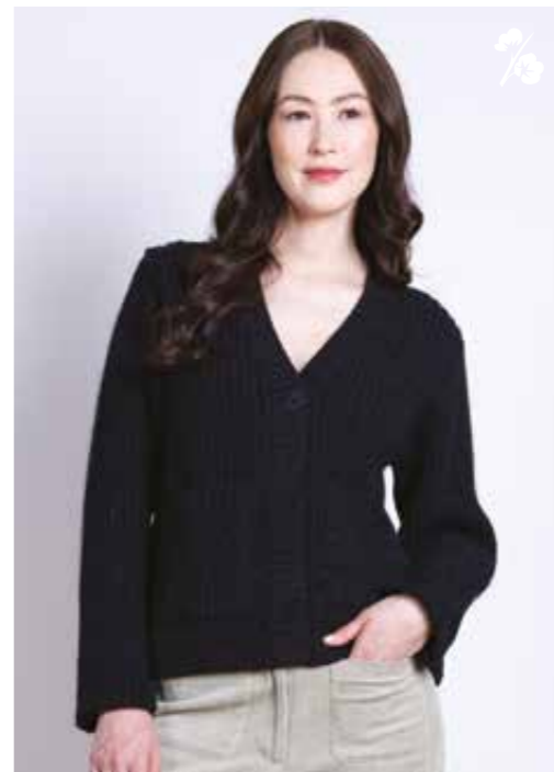
FC7092 / Ribbed Sleeve Jumper 100% Organic Cotton Ivory / Sizes S,M,L