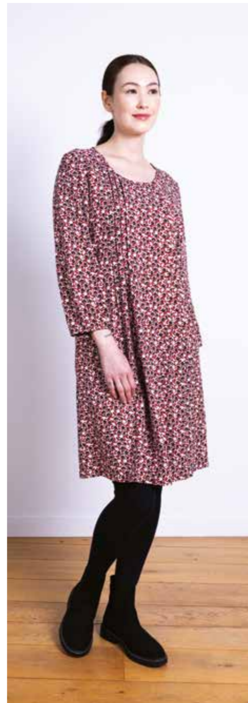
IV3179 / Pintuck Tunic Dress 100% Viscose Scarlet / Sizes 8-20