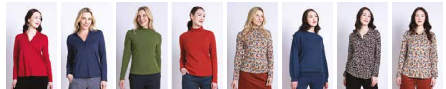
JP4232 / Scarlet Pg 14,56 JP4232 / Oxford Pg 9 RJ4249 / Basil Pg 41 RJ4249 / Rust Pg 19 DL4249 / Ecru Pg 29 MC4223 / Space Pg 13 BP4214 / Alabaster Pg 56 DL4214 / Ecru Pg 28