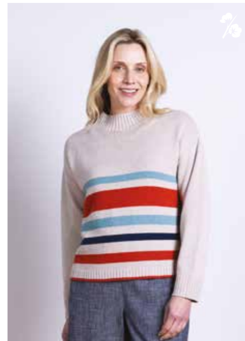
KT7098 / Striped Jumper 80% Organic Cotton, 20% RWS Wool Multi / Sizes S,M,L