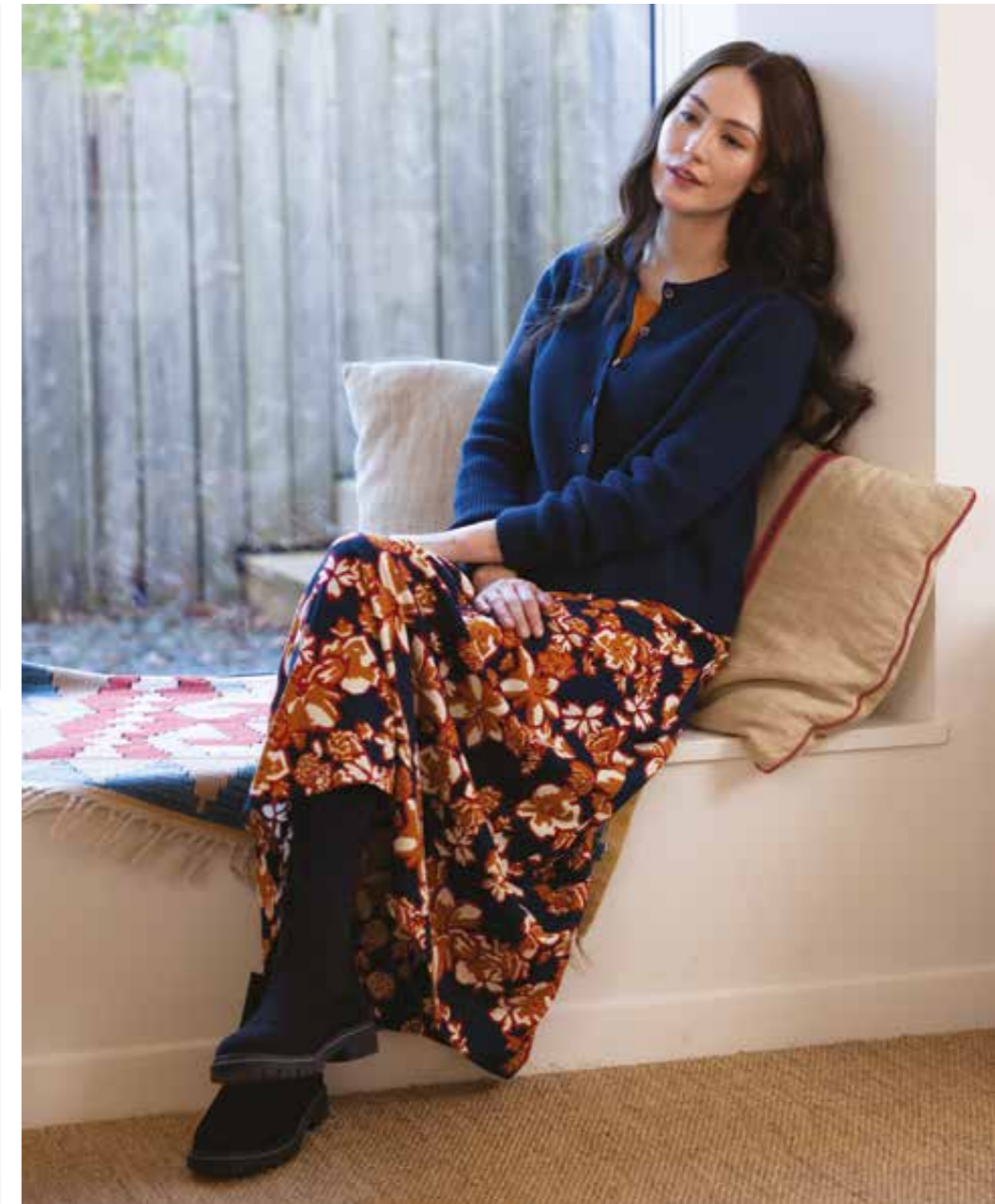
KT7094 / Button Through Cardi 80% Organic Cotton, 20% Wool Thunder / Sizes S,M,L

THIS PRINT PLAYS HOMAGE TO HENRI MATISSE AND HIS PAPER CUT OUT'S WITH THE BOLD AND COLOURFUL NATURE OF THIS DESIGN.