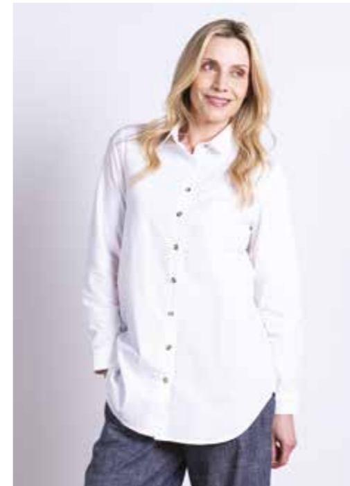
PE4248 / Shirt 100% Cotton Shirting White / Sizes 8-20