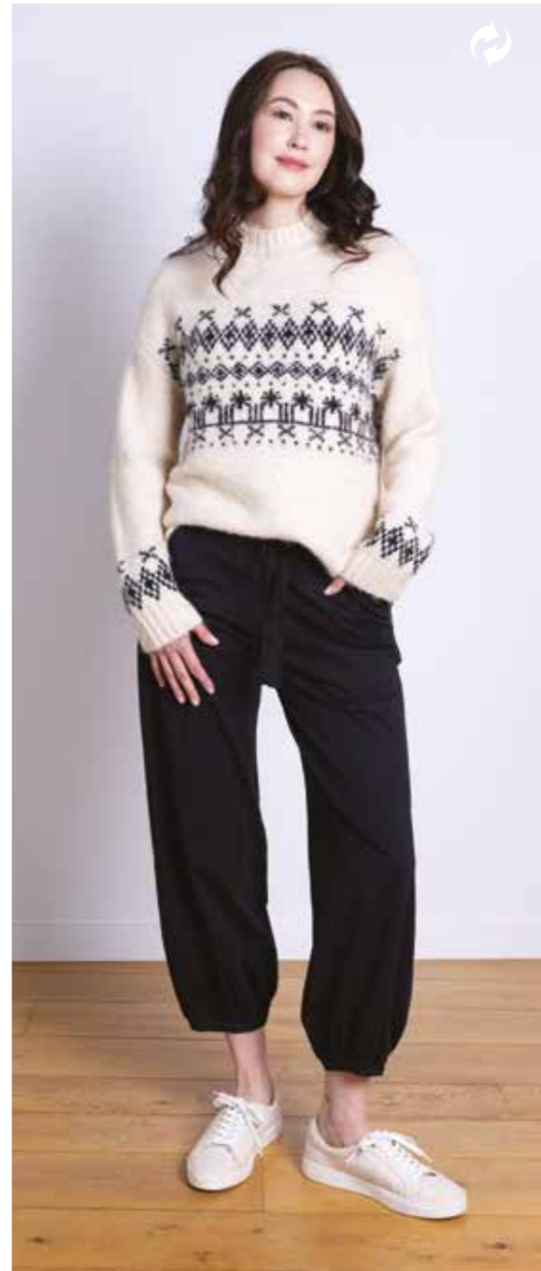
RW7089 / Fairisle Jumper 53% Recycled Polyester, 6% Wool, 30% Polyamide, 10% Polyester, 1% Elastane Ivory / Sizes S,M,L