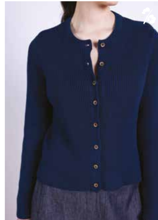
KT7094 / Button Through Cardi 80% Organic Cotton, 20% RWS Wool Thunder / Sizes S,M,L