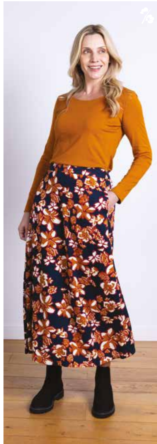
JP4064 / Round Neck Top 100% GOTS Organic Cotton Jersey Apricot / Sizes 8-20