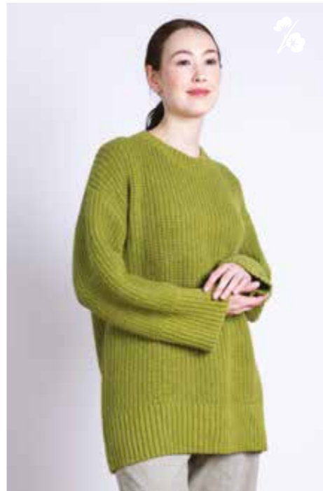
AP7090 / Cosy Round Neck Jumper 83% Organic Cotton, 17% Alpaca Lime / Sizes S,M,L