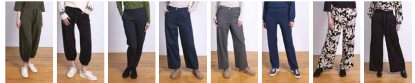
JP1050 / Juniper Pg 40 JP1050 / Black Pg 58 HJ1093 / Midnight Pg 39 CD1088 / Space Pg 21,23,46 CD1088 / Buff Pg 32 MC1091 / Space Pg 13 AM1103 / Black Pg 52 PV1110 / Black Pg 52