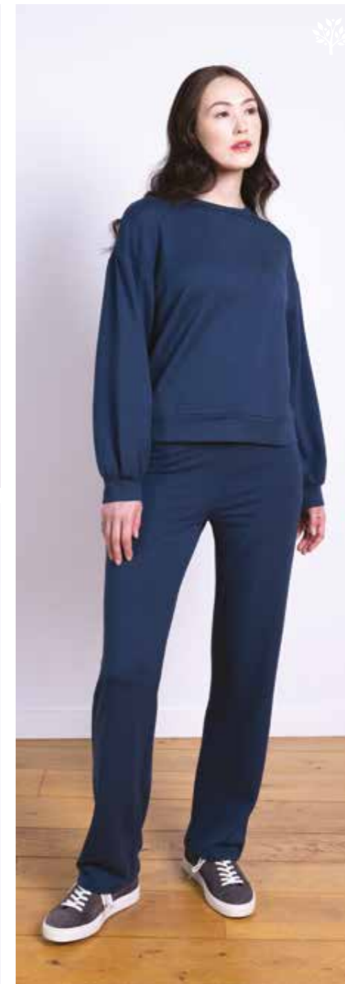
MC4223 / Sweatshirt Top 70% Lenzing Modal, 25% Cotton, 5% Elastane Space / Sizes 8-20