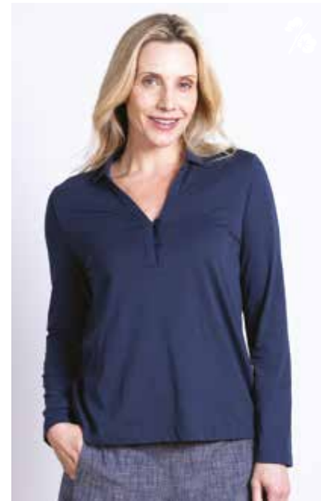
JP4232 / Collared Jersey Top 100% GOTS Organic Cotton Jersey Oxford / Sizes 8-20