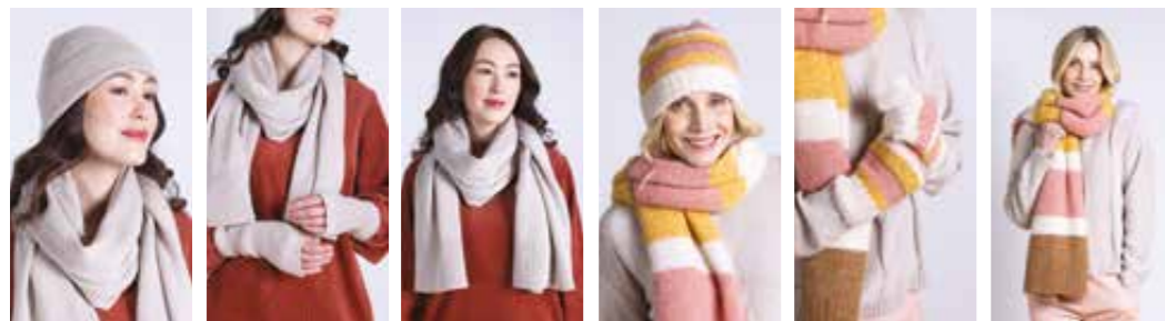
KT0212 / Sand Pg 30 KT0503 / Sand Pg 30 KT0327 / Sand Pg 30 RS0212 / Multi Pg 35 RS0502 / Multi Pg 35 RS0327 / Multi Pg 35