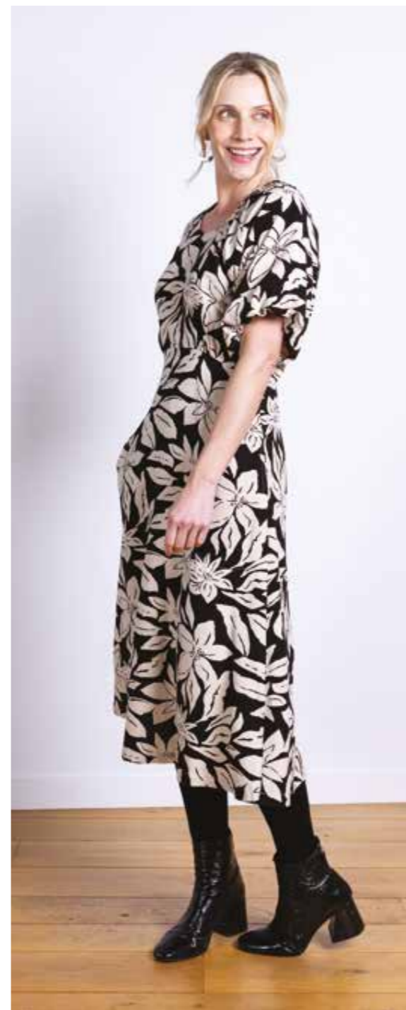
AM2206 / Puff Sleeve Dress 100% Viscose Black / Sizes 8-20