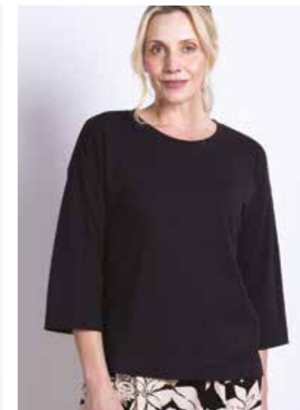
JP4226 / 3/4 Sleeve Jersey Top 95% GOTS Organic Cotton, 5% Elastane Black / Sizes 8-20