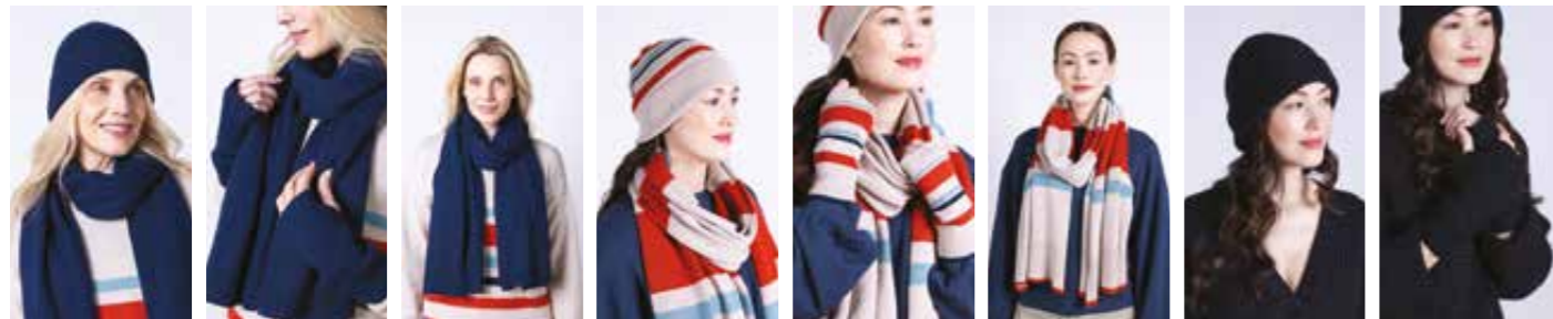
KT0212 / Thunder Pg 15 KT0503 / Thunder Pg 15 KT0327 / Thunder Pg 15 KT0212 / Multi Pg 14 KT0503 / Multi Pg 14 KT0327 / Multi Pg 14 AP0212 / Black Pg 59 AP0503 / Black Pg 59