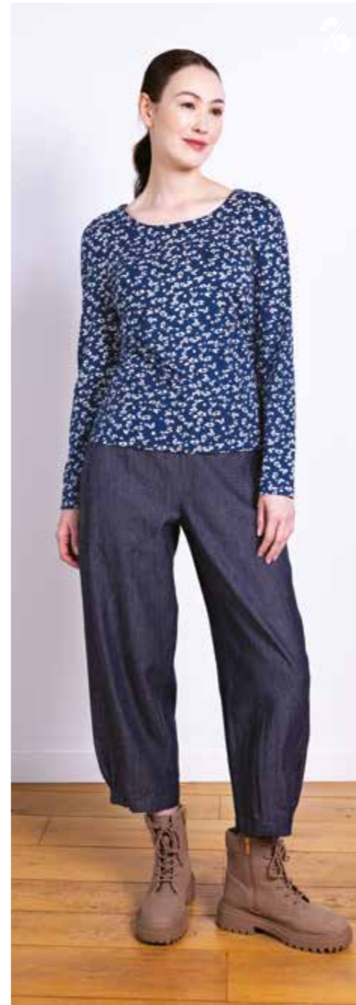
ET4185 / Top 100% Organic Cotton Jersey Oxford / Sizes 8-20