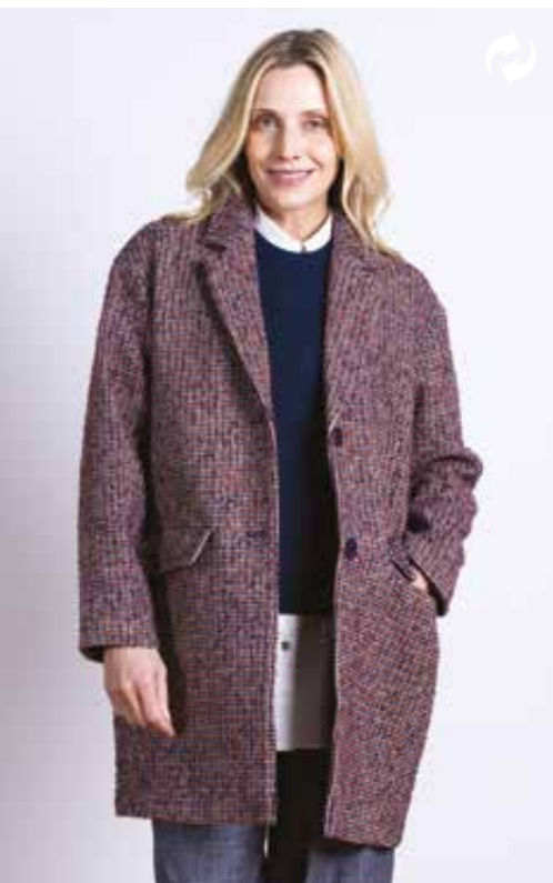
QW6524 / Wool Coat 50% Recycled Polyester, 42% Wool, 5% Alpaca, 3% Others Rust / Sizes 8-20