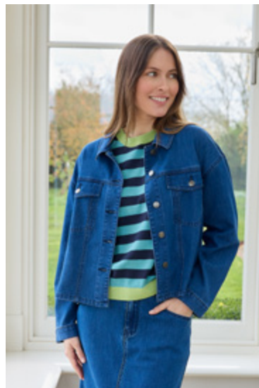
Boxy Tie Front Collar Jacket in White & Cashmere Like Tipped Detail Jumper in Seafoam, Wide Stripe Patch Pocket Shirt in Royal Blue, Cropped Wide Leg Jean in Denim & Fitted V Neck Jumper in Soft Lime, Boxy Collar Jacket in Denim & Cashmere Like Block Stripe Jumper in Seafoam