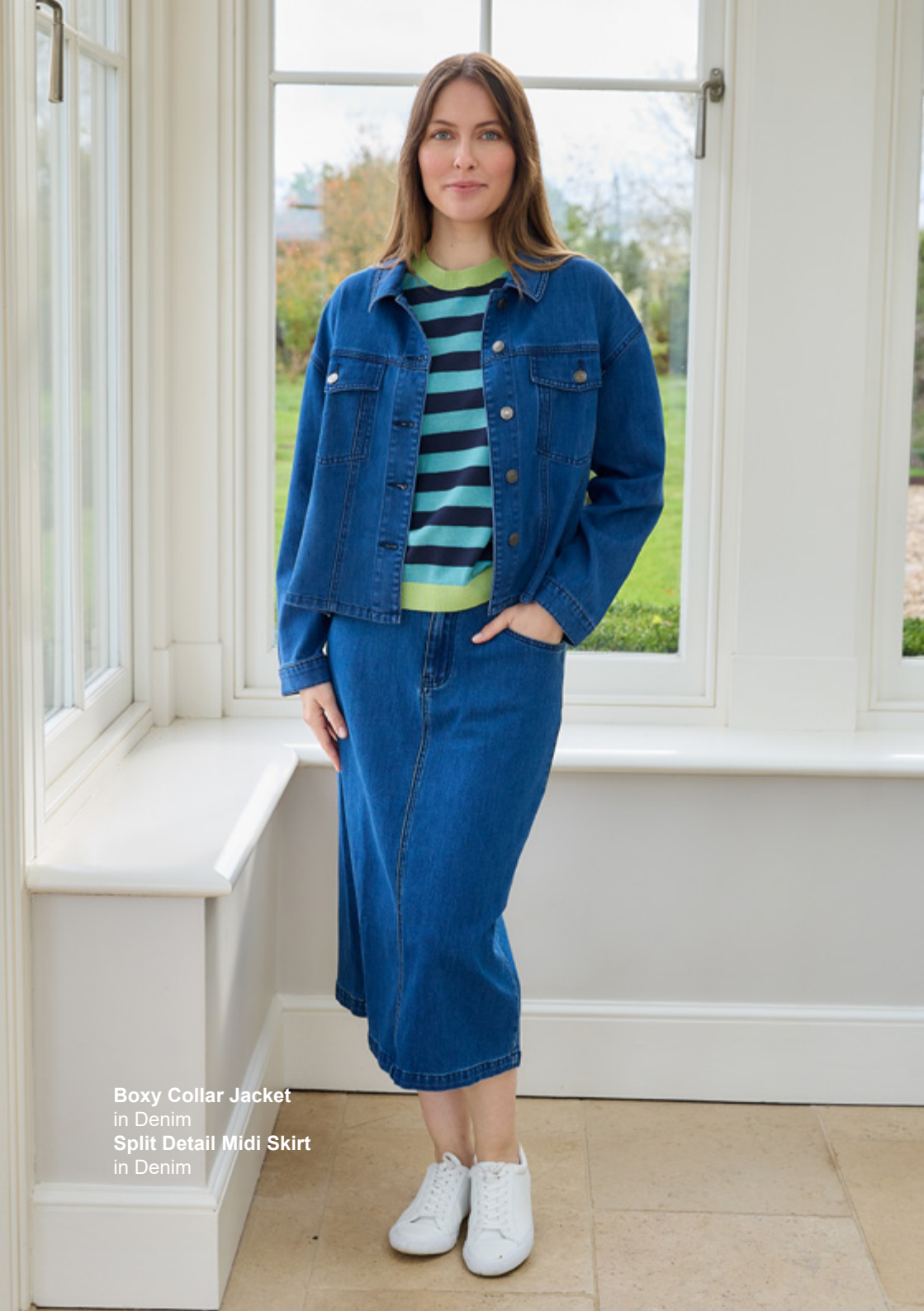
Boxy Collar Jacket in Denim Split Detail Midi Skirt in Denim