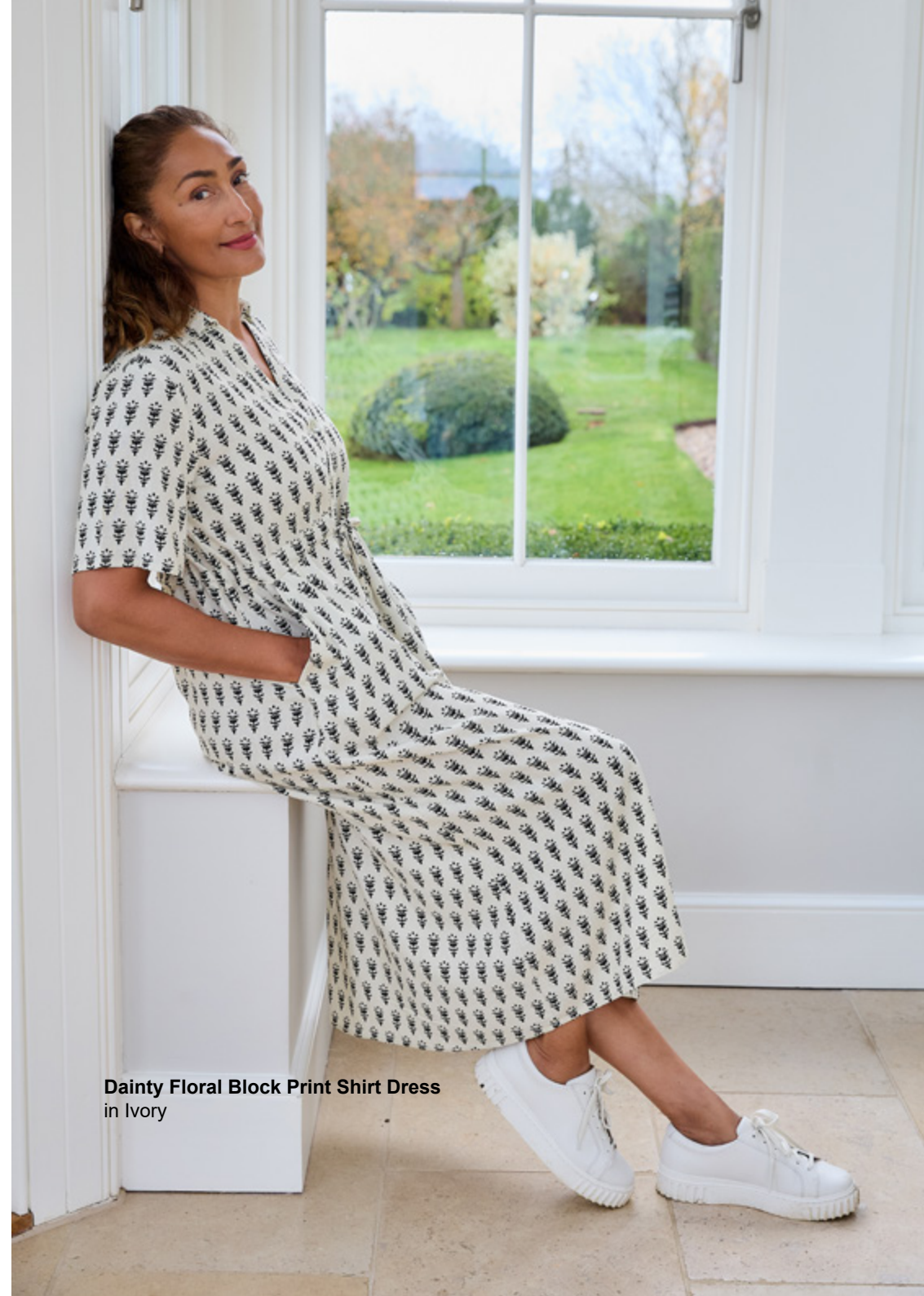
Dainty Floral Block Print Shirt Dress in Ivory