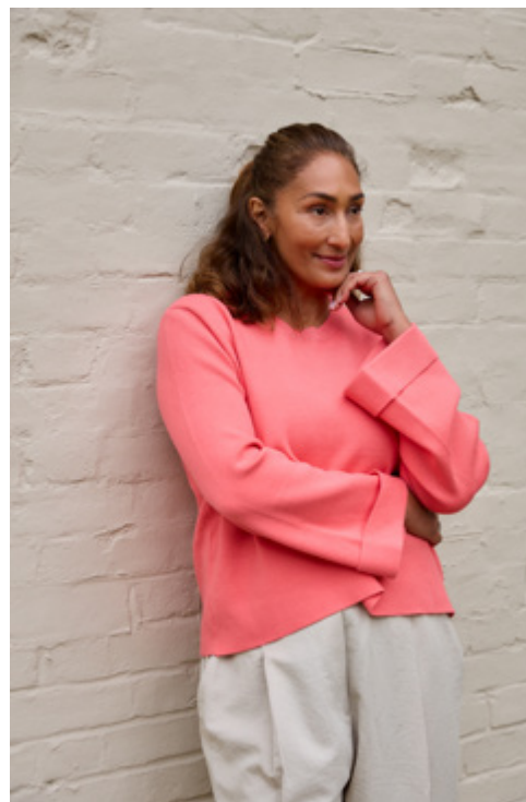
Cashmere Like Bell Sleeve Jumper in Coral