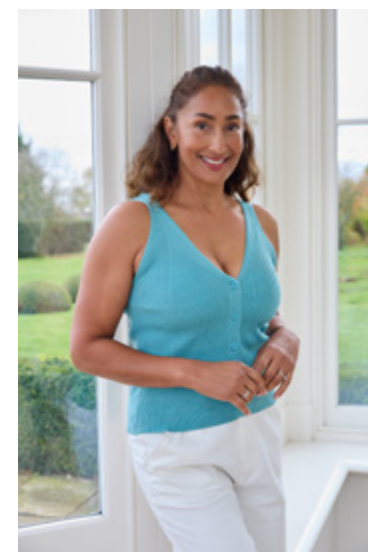
Cashmere Like V Neck Crop Cardigan in Seafoam, Gingham Tie Neck Shirred Blouse in Soft Lime, Cashmere Like Deep Cuff Fitted V Neck Jumper in Soft Lime, Cashmere Like V Neck Button Through Knitted Vest in Seafoam