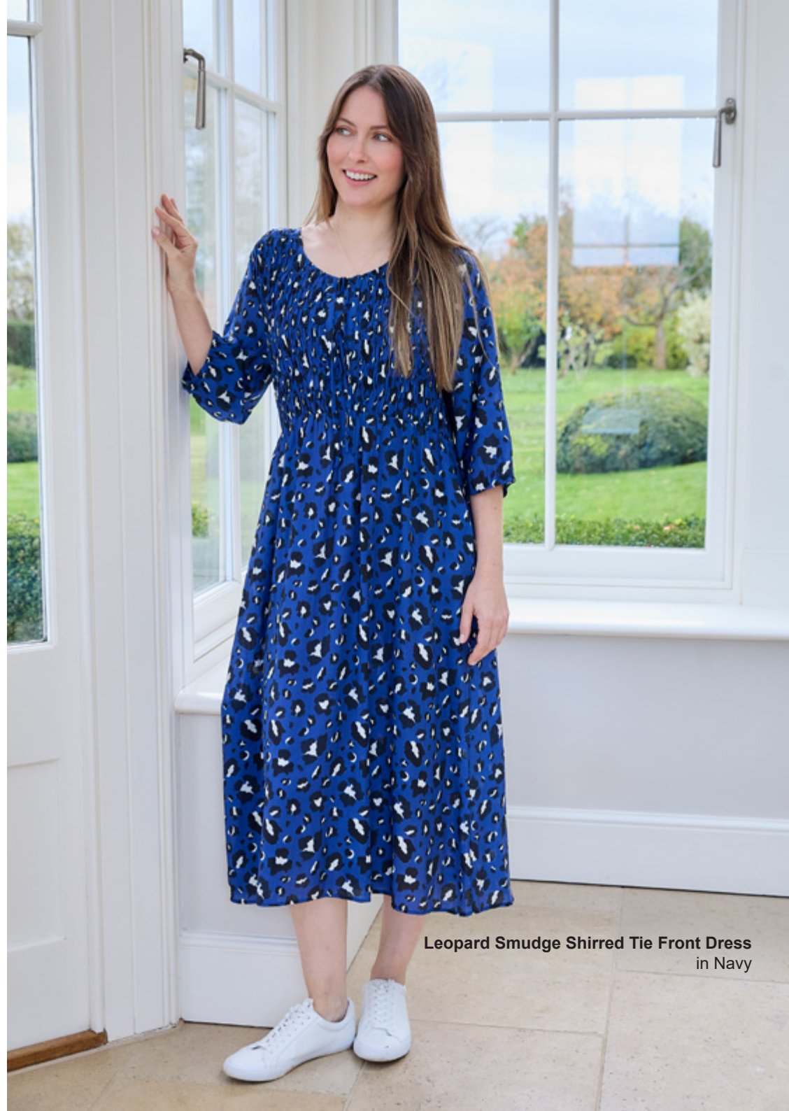
Leopard Smudge Shirred Tie Front Dress in Navy