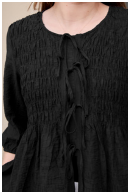
Textured Shirred Body Tie Front Blouse in Black