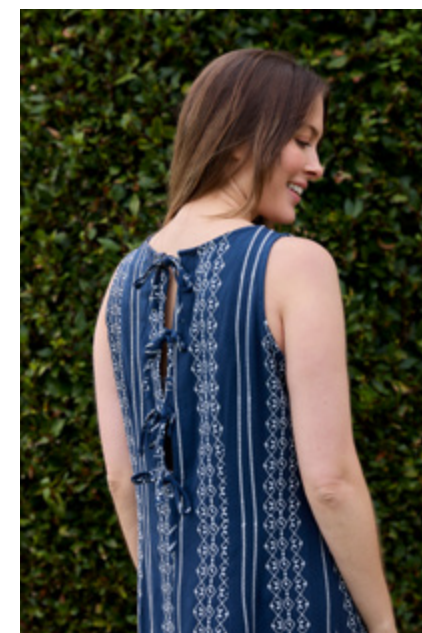
Embroidery Sleeveless Tie Back Dress in Navy