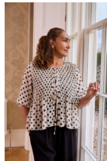
Smudge Spot Button Through Shirt in Black, Dotty Tropical palm Tiered Dress in Ivory, Polka Dot Chiffon Pleated Skirt in Black & Cashmere Like Crew Neck Cropped Cardi in Ivory, Polka Dot Tie Front Blouse in Ivory