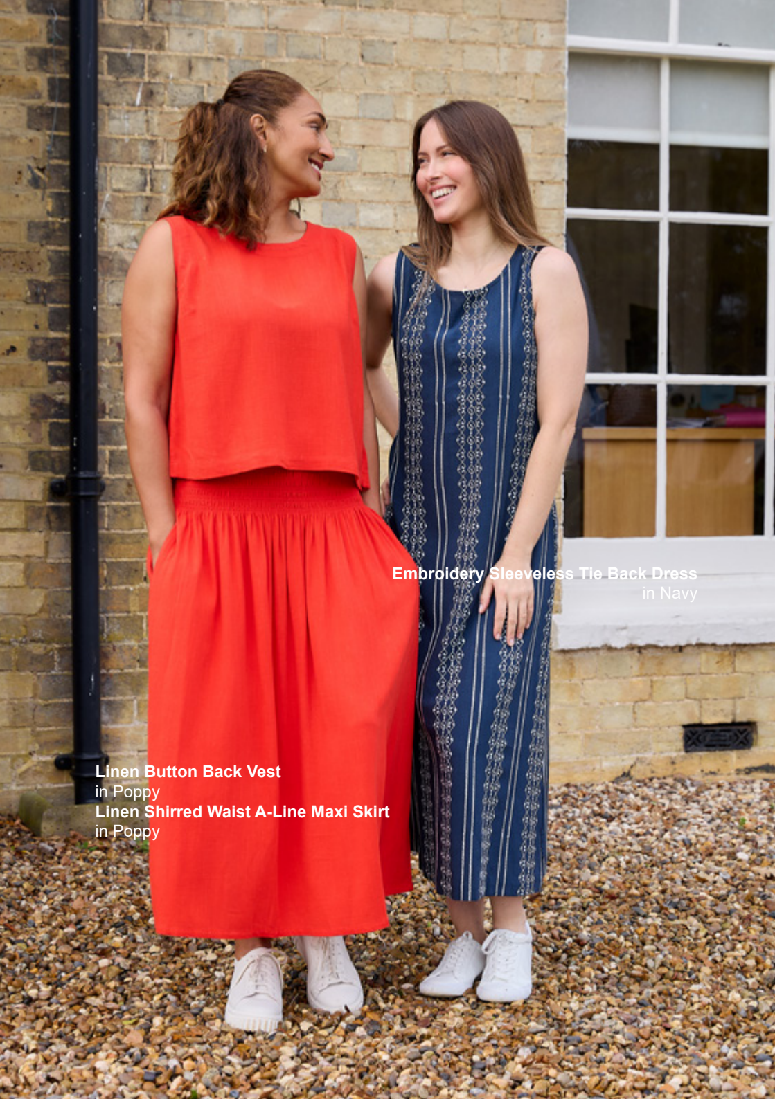
Linen Button Back Vest in Poppy Linen Shirred Waist A-Line Maxi Skirt in Poppy