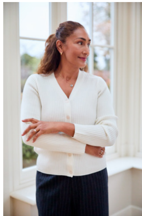
Cashmere Like Rib Fitted Cardigan in Ivory