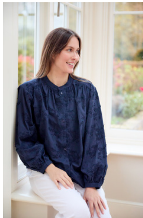
Floral Appliqué Blouse in Navy