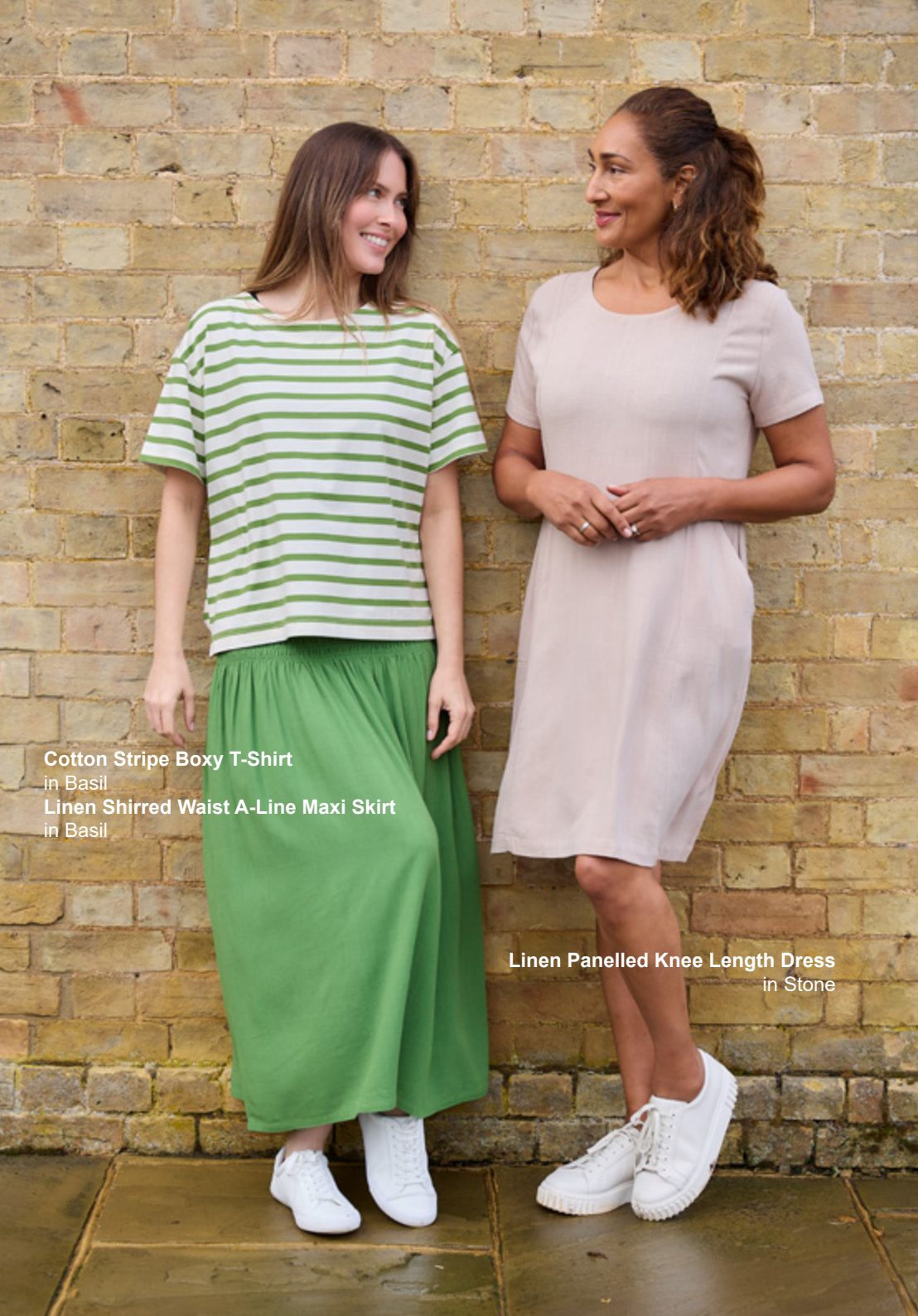
Cotton Stripe Boxy T-Shirt in Basil Linen Shirred Waist A-Line Maxi Skirt in Basil