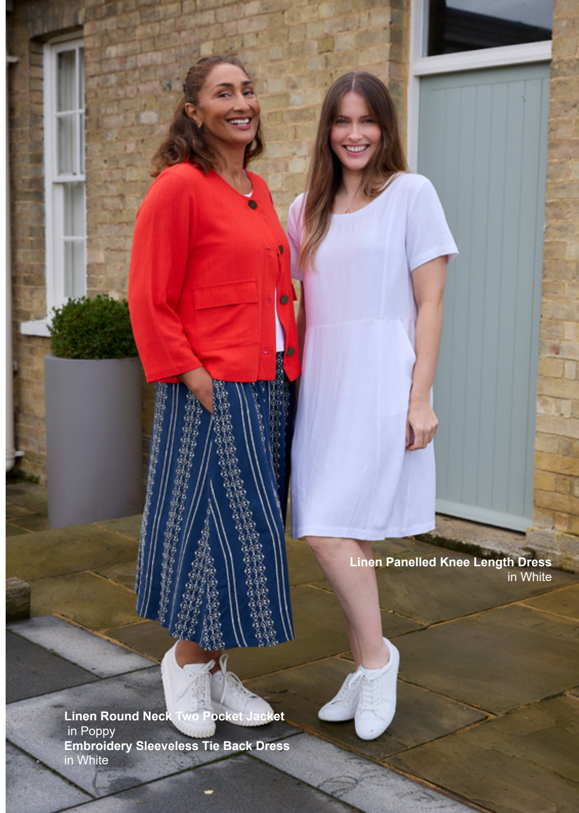
Linen Panelled Knee Length Dress in White