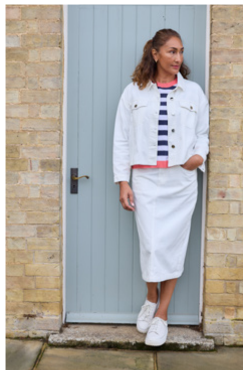
Boxy Collar Jacket in White Split Detail Midi Skirt in White