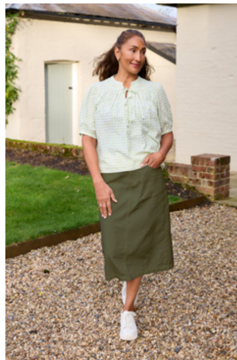
Gingham Tie Neck Shirred Blouse in Soft Lime Split Detail Midi Skirt in Khaki