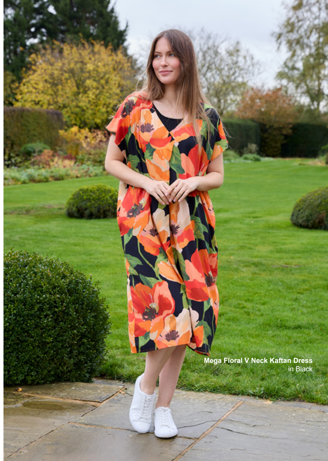
Mega Floral V Neck Kaftan Dress in Black