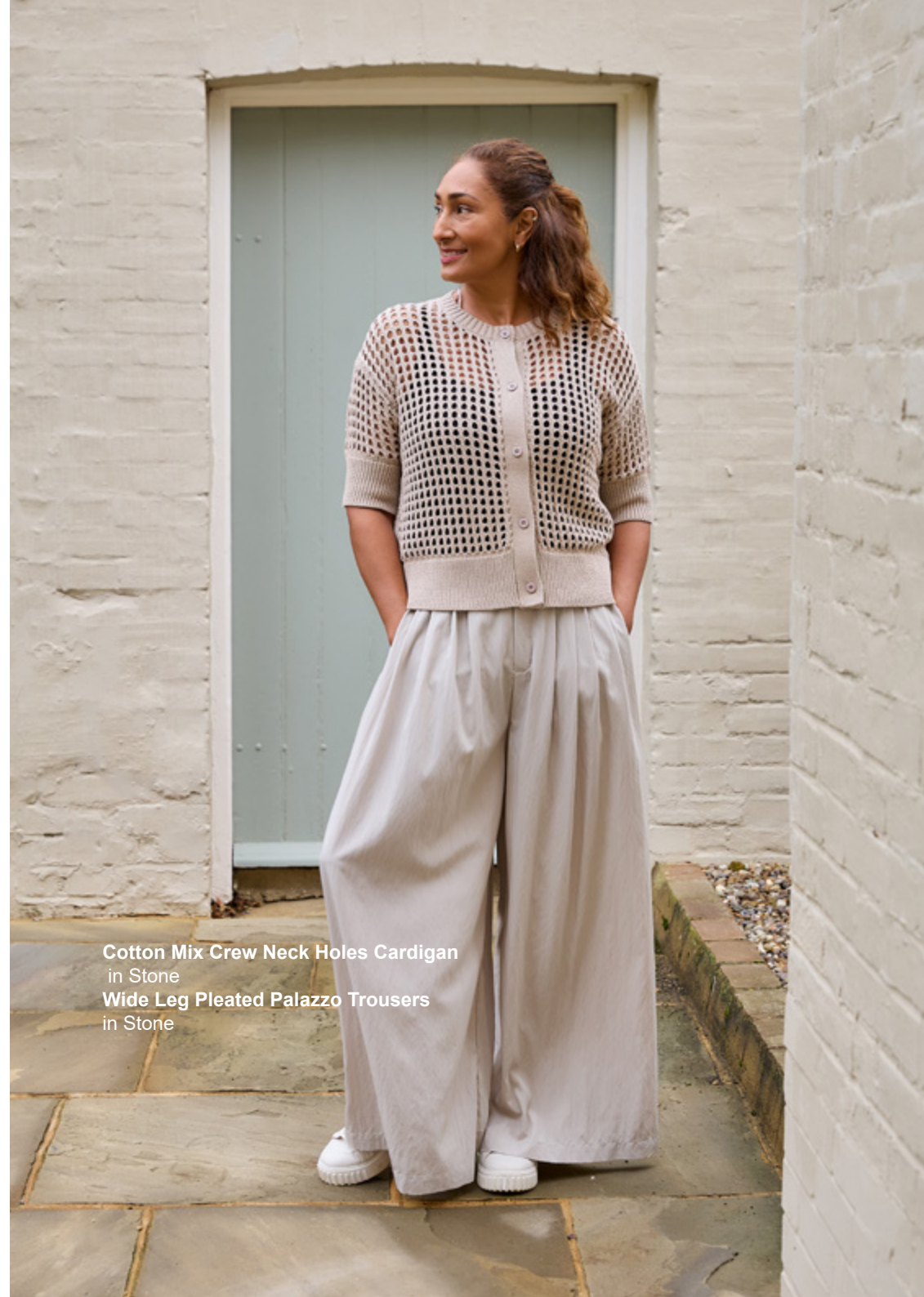
Cotton Mix Crew Neck Holes Cardigan in Stone Wide Leg Pleated Palazzo Trousers in Stone