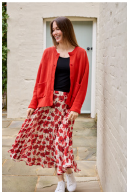
Painterly Poppies Pleated Skirt in Ivory