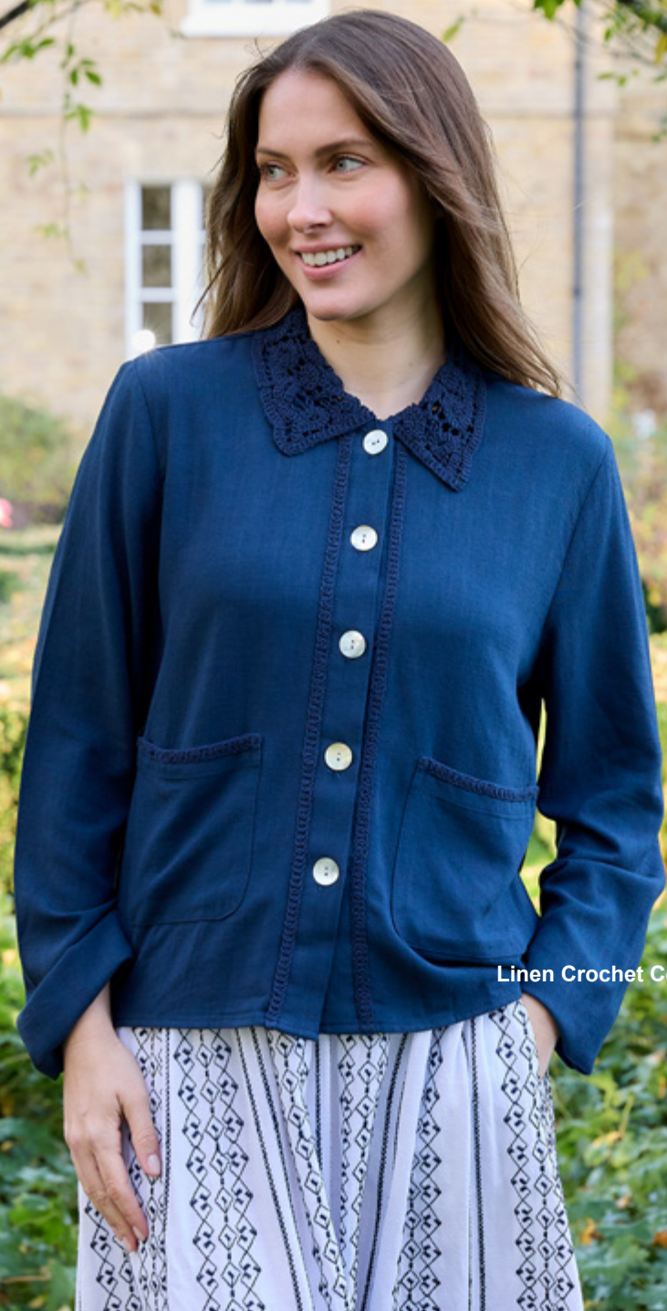
Linen Crochet Collar Jacket in Navy