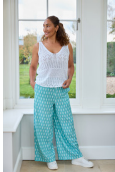
Dainty Floral Block Print Shirt Dress in Seafoam, Dainty Floral Block Print Short Sleeve Shirt in Ivory, Dainty Floral Block Print Palazzo Pant in Ivory & Seafoam & Cotton Mix Pointelle V Neck Vest Top in White