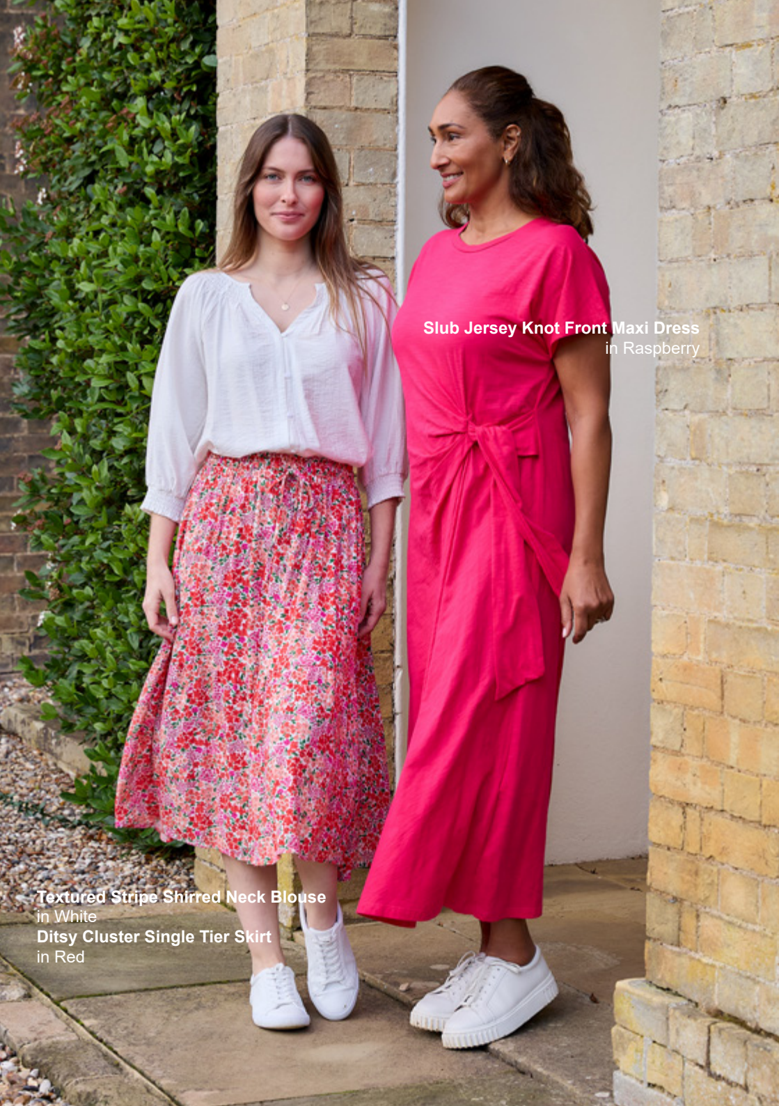
Slub Jersey Knot Front Maxi Dress in Raspberry