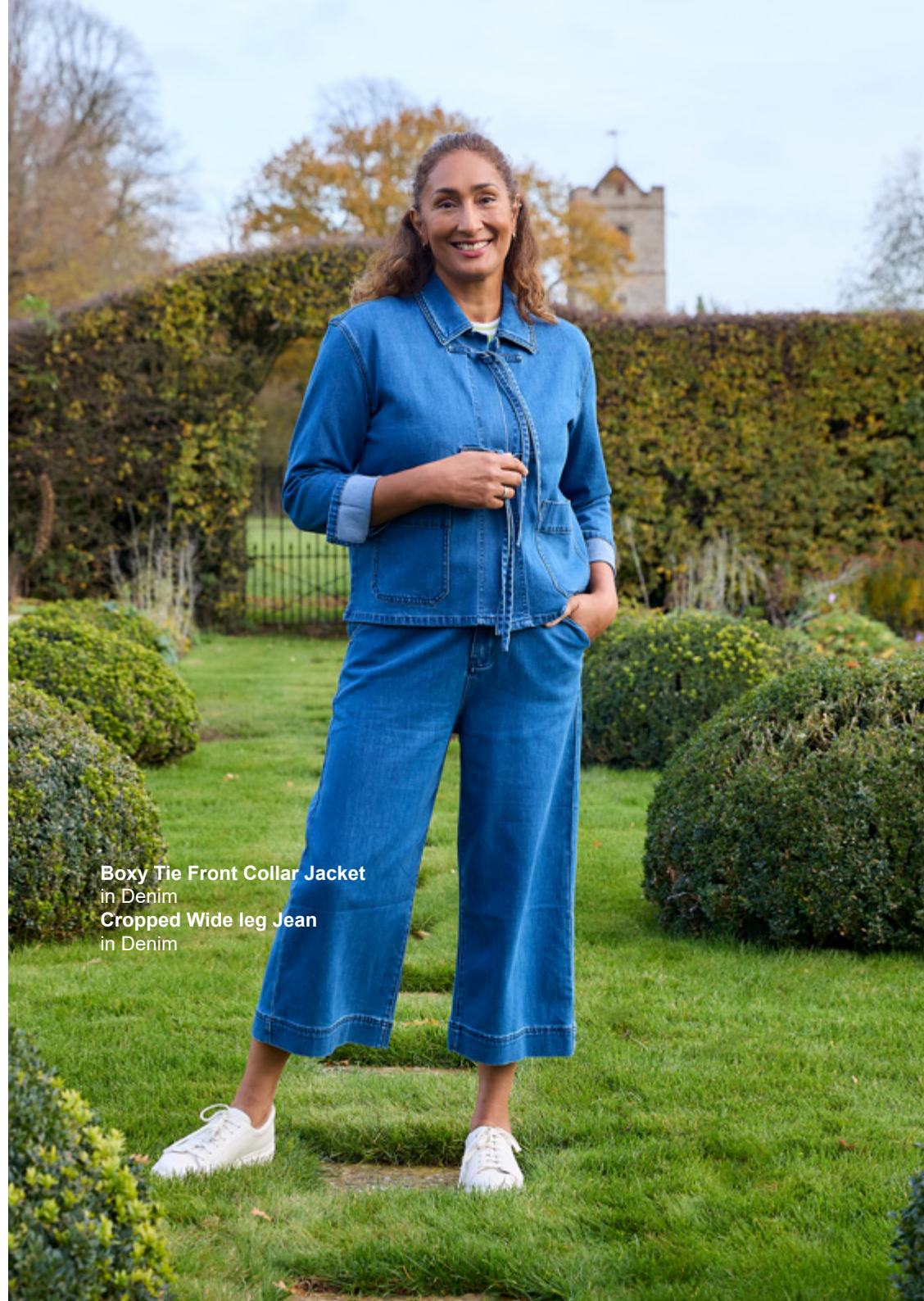
Boxy Tie Front Collar Jacket in Denim Cropped Wide leg Jean in Denim