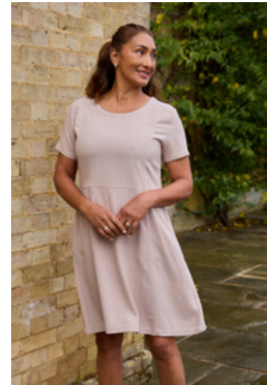
Cotton Mix Block Stripe Sleeveless Jumper in White & Linen Shirred Waist A-Line Maxi Skirt in Stone, Linen Sleeveless Draw-string Waist Dress in Basil, Linen Short Sleeve Boxy Shirt in Basil & Linen Elastic Waist Culottes in Basil, Linen Panelled Knee Length Dress in Stone