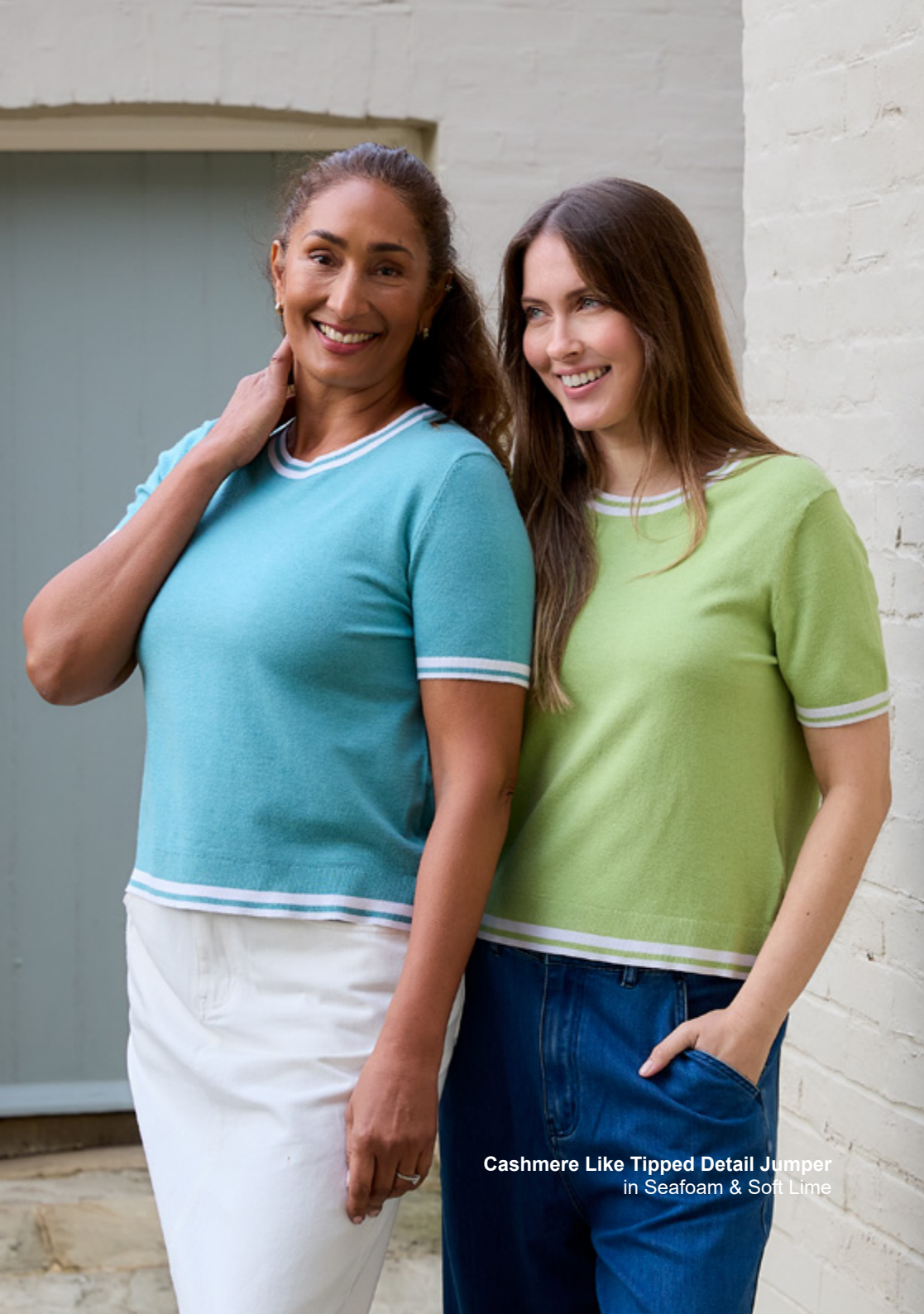
Cashmere Like Tipped Detail Jumper in Seafoam & Soft Lime