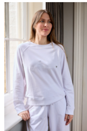
Paris Embroidery Crew Neck Sweatshirt in White, Luxe Jersey Short Sleeve Sweatshirt in Seafoam & Luxe Jersey Straight Leg Trouser in Seafoam, Cotton Stripe Boxy T-Shirt in Navy & Elasticated Cuff Drawstring Joggers in White, Amour Embroidery Crew Neck Sweatshirt in White