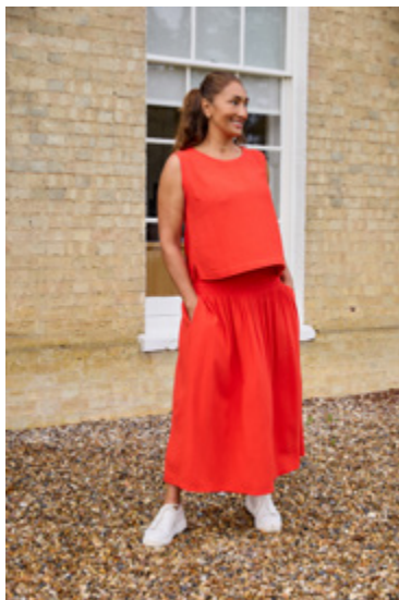
Linen Round Neck Two Pocket Jacket in Poppy, Embroidery Keyhole Back Vest Top in White & Linen Shirred Waist A-Line Maxi Skirt in Stone, Embroidery Sleeveless Tie Back Dress in White, Linen Button Back Vest in Poppy & Linen Shirred Waist A-Line Maxi Skirt in Poppy