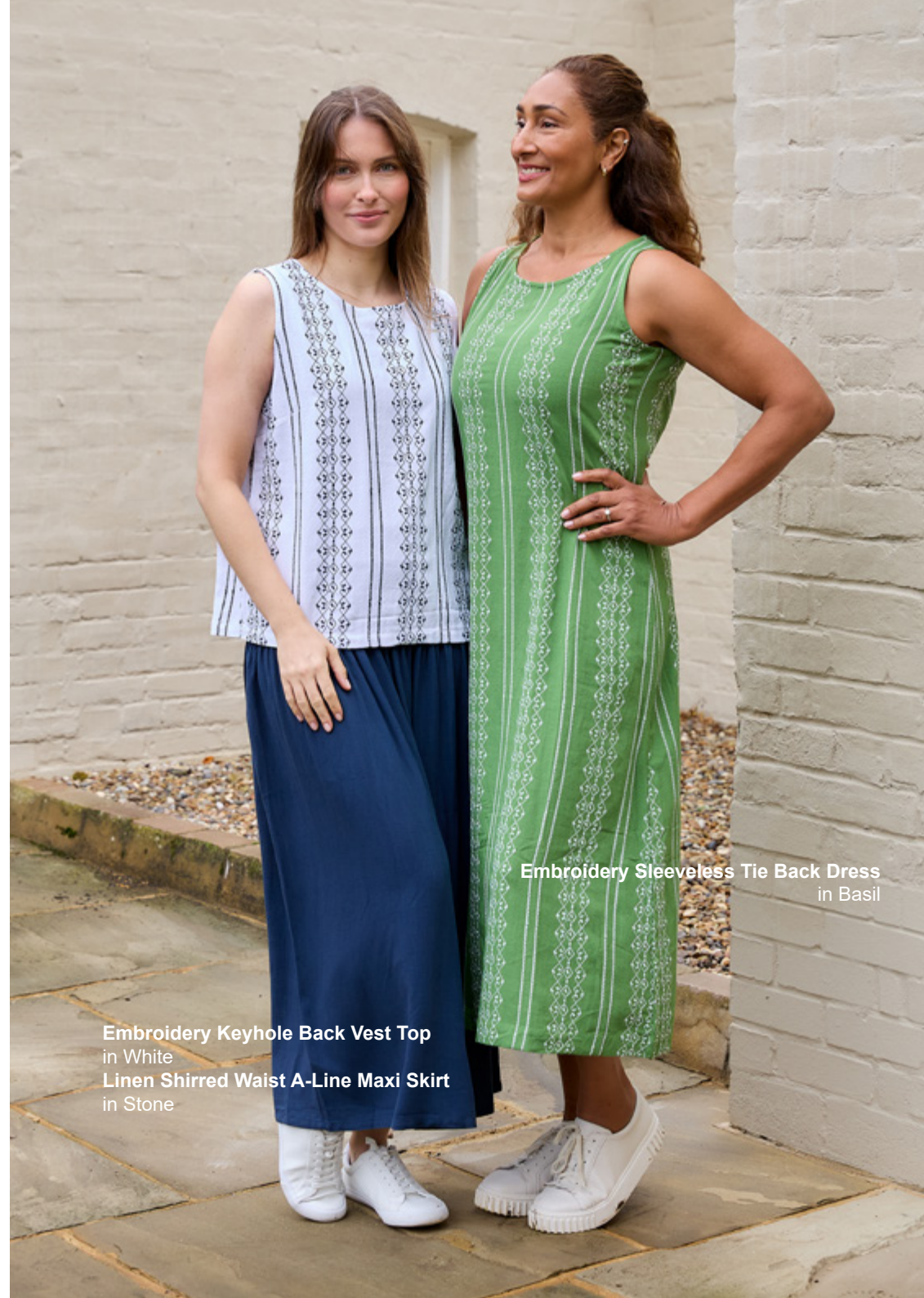
Embroidery Sleeveless Tie Back Dress in Basil