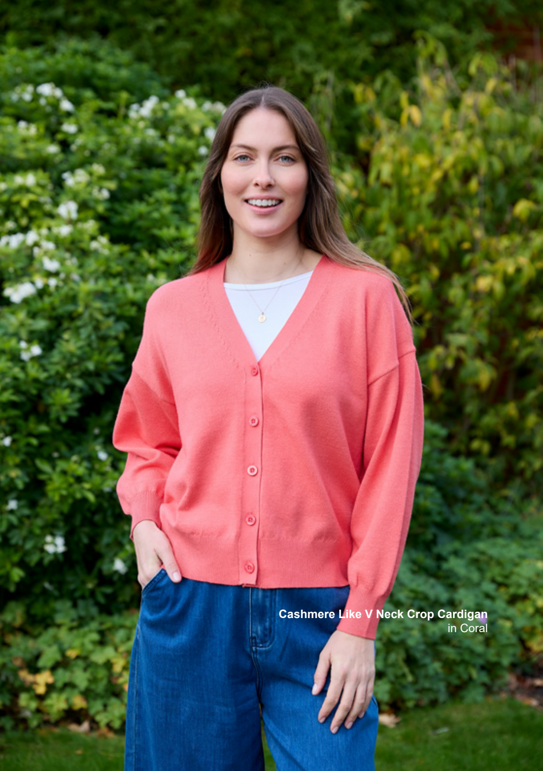
Cashmere Like V Neck Crop Cardigan in Coral