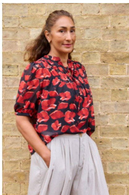
Painterly Poppies Tie Neck Blouse in Black