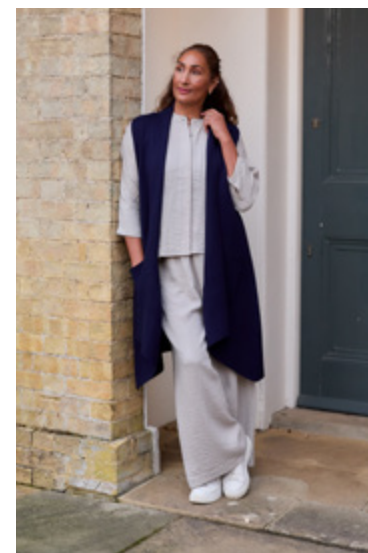
Linen Crochet Collar Jacket in Stone & Wide Leg Pleated Palazzo Pants in Navy, Ripple Drawstring Waist Dress in Stone, Cap Sleeve Button Through Shirt in Stone & Wide Leg Pleated Palazzo Pants in Stone, Ripple Batwing Shirt in Stone & Ripple Elastic Waist Palazzo Pants in Stone & Cashmere Like Roll Collar Gilet in Navy