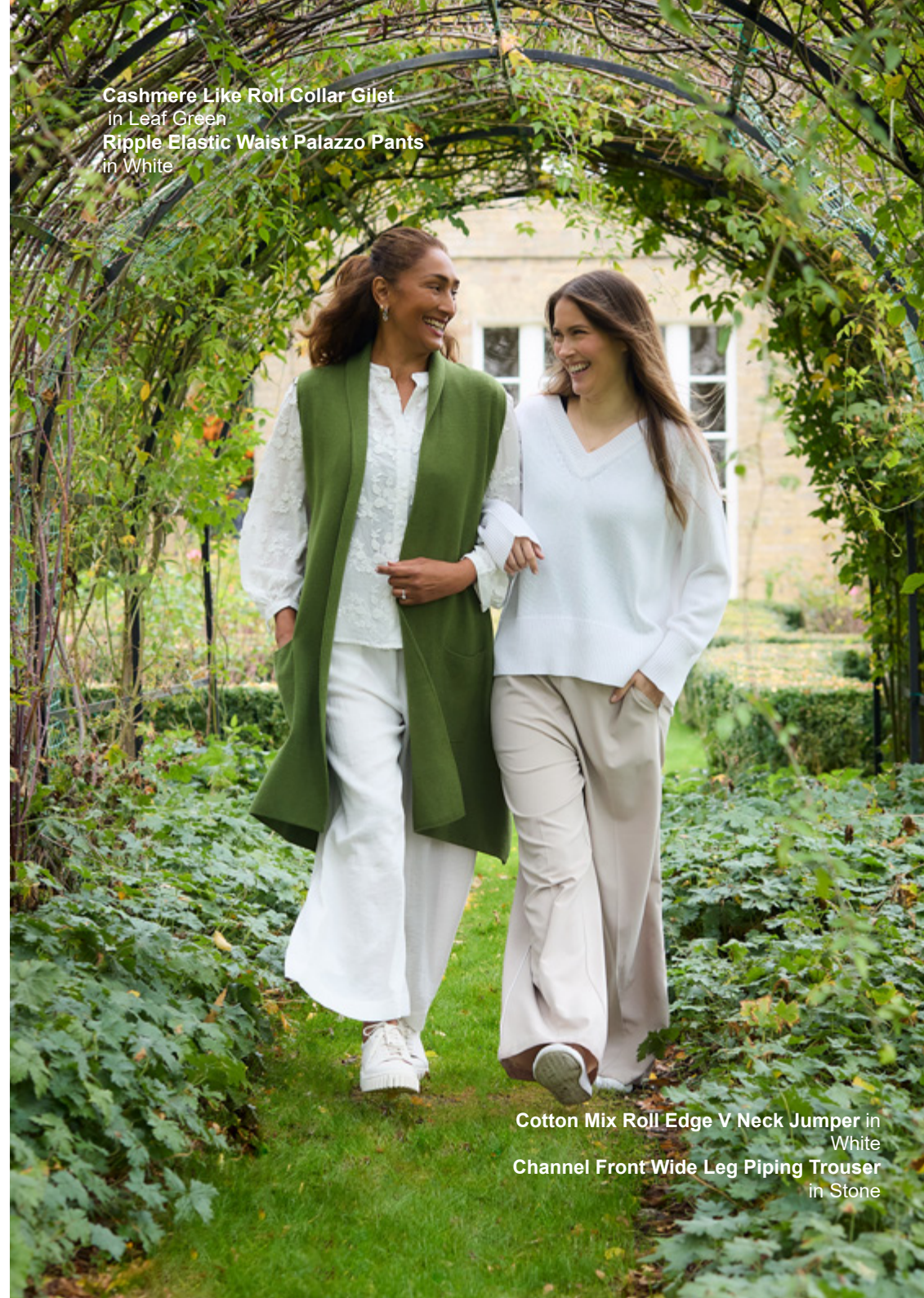
Cotton Mix Roll Edge V Neck Jumper in White Channel Front Wide Leg Piping Trouser in Stone