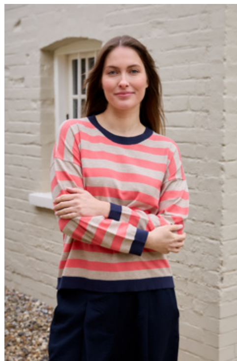
Cashmere Like Block Stripe Jumper in Coral