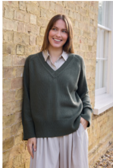
Cotton Mix Pointelle V Neck Vest Top in Khaki, Cotton Mix Block Stripe Sleeveless Jumper in White, Cotton Mix Rib Short Sleeve Raglan Jumper in Stone, Cotton Mix Roll Edge V Neck Jumper in Khaki