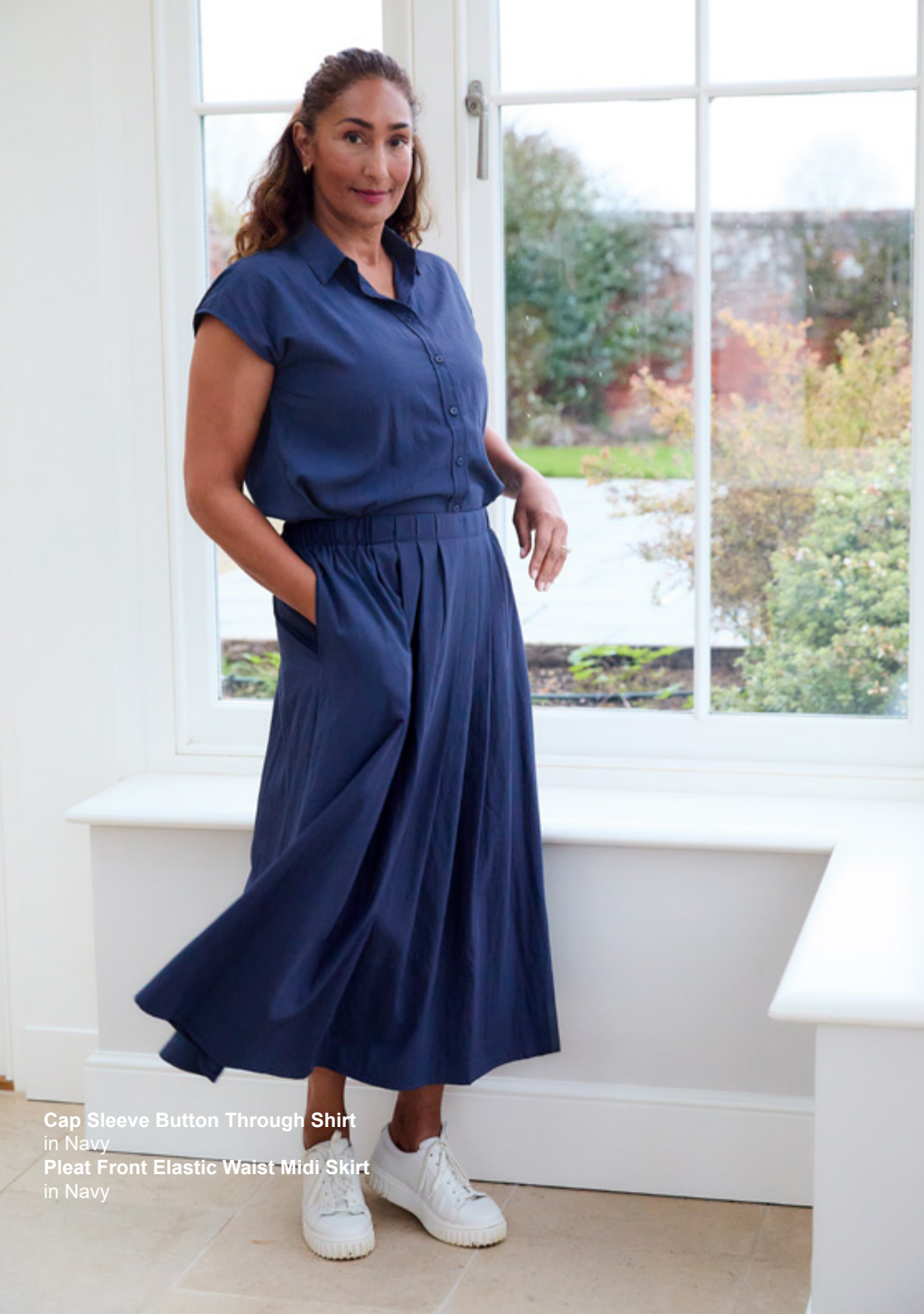
Cap Sleeve Button Through Shirt in Navy Pleat Front Elastic Waist Midi Skirt in Navy