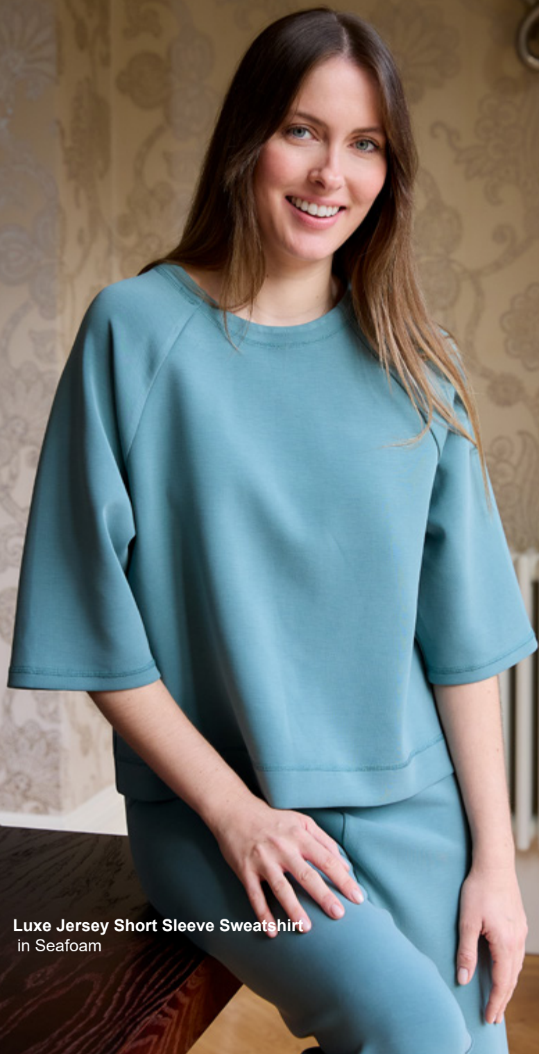
Luxe Jersey Short Sleeve Sweatshirt in Seafoam