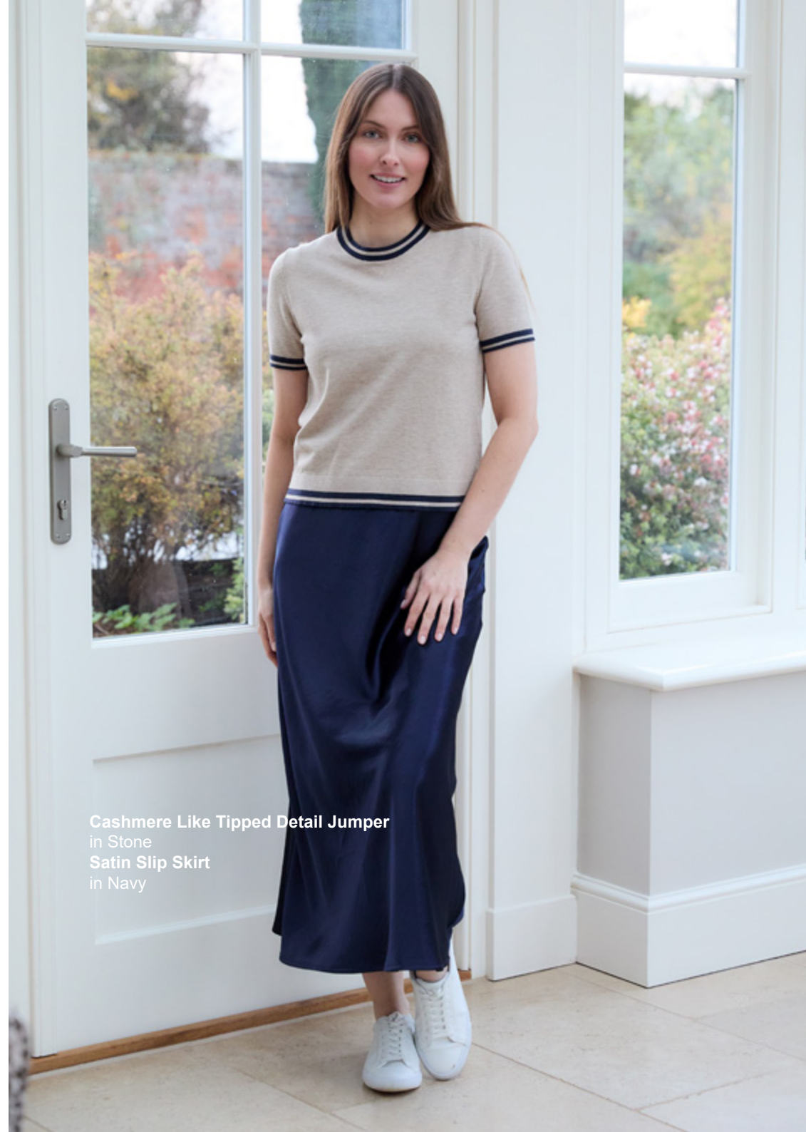
Cashmere Like Tipped Detail Jumper in Stone Satin Slip Skirt in Navy