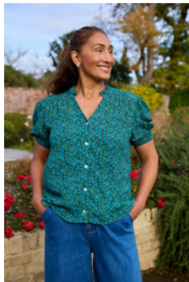
Leopard Smudge Frill Edge Blouse in Navy, Dotty Tropical Palm Tiered Dress in Basil, Smudge Sport Short Sleeve Shirring Dress in Basil, Ditsy Blossom Frill Edge V Neck Blouse in Navy