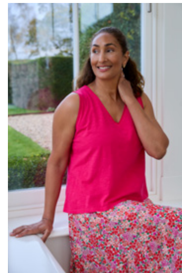
Ditsy Cluster Single Tier Skirt in Red, Ditsy Cluster Drawstring Hem Blouse in Navy, Ditsy Cluster Shirring Shoestring Maxi Dress in Navy, Slub Jersey Raw Edge V-Neck Vest in Raspberry