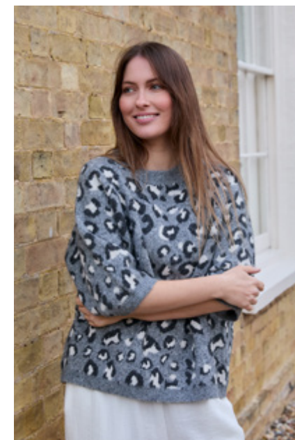
Leo Jacquard Short Sleeve Jumper in Light Grey