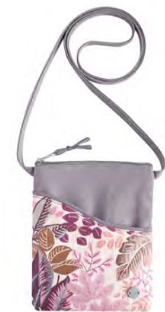
PINK FLORAL JACQUARD SLING BAG JD26SLPK