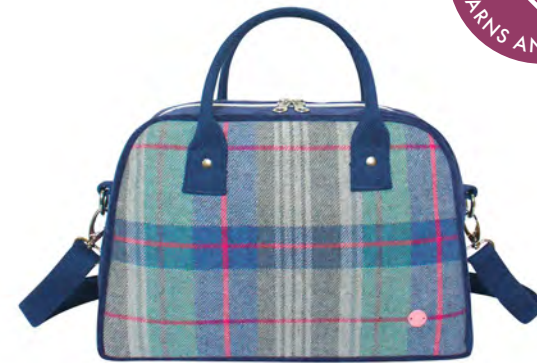
DREM SPRING TWEED TABBY BAG TS26DRDM