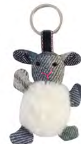
DREM SPRING TWEED SHEEP KEYRING TS26SHKRDM