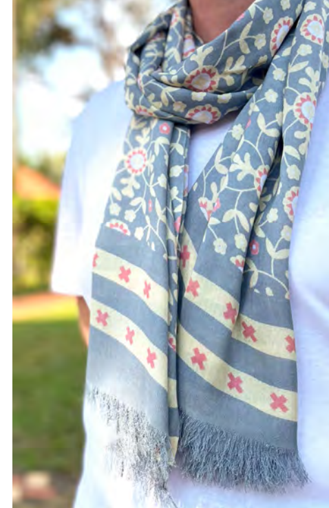
BLUE CITADEL SCARF SCF25CIT

Supremely soft and flowing – in our unique floral print and available in two lovely colourways, ideal for summer outfits.