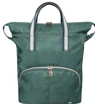
GREEN VOYAGE BACKPACK VOY26BKGN