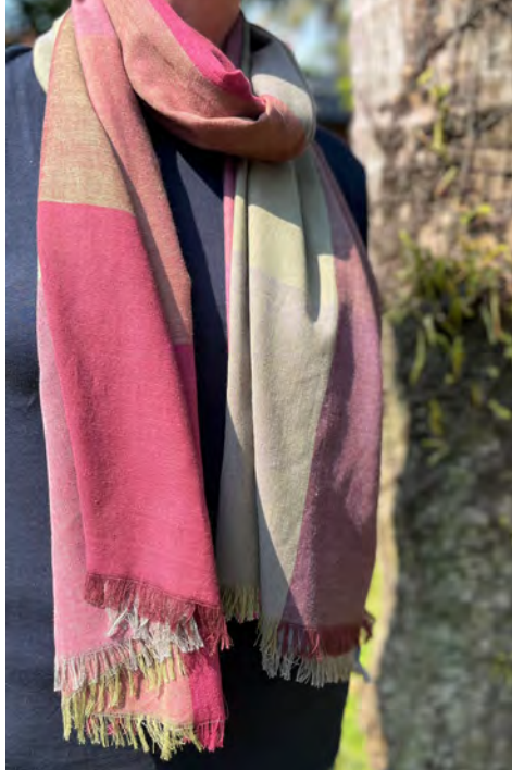
GULLANE COTTON SCARF T26GULSCF