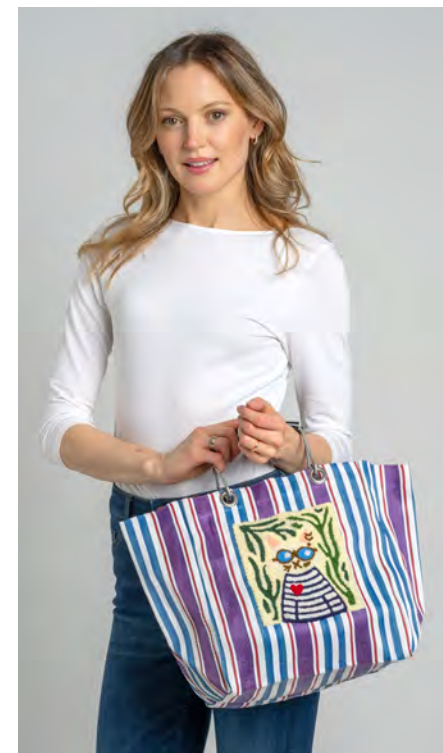
CAT MARKET STRIPE TOTE BAG MKTTTCAT