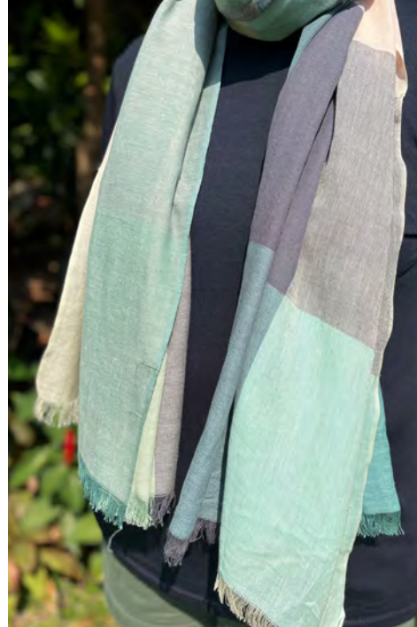
SKYE COTTON SCARF T26SKYSCF