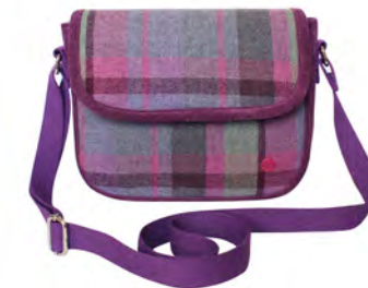
GULLANE SPRING TWEED MILA BAG T26MILGUL