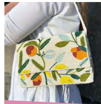
Beaded bags & purses 36