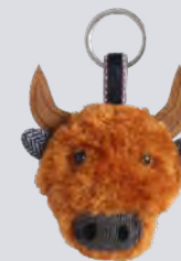
DREM SPRING TWEED COW KEYRING COW26KRDM