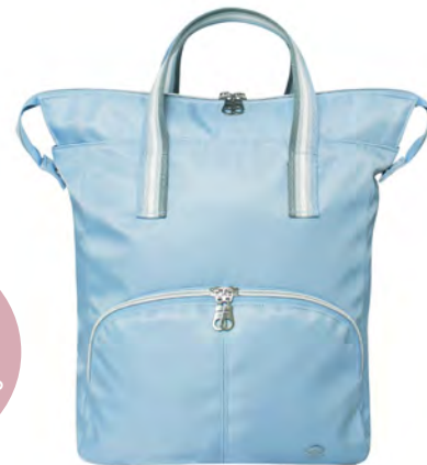
DUSTY BLUE VOYAGE BACKPACK VOY26BKBL