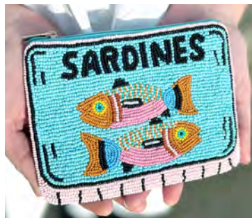
SARDINE BEADED COIN PURSE SS26BPSAR