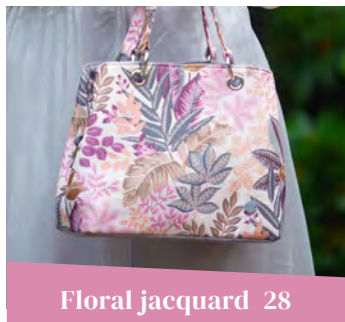
Floral jacquard 28