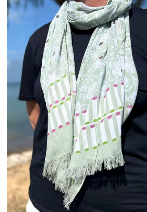
GREEN CITADEL SCARF SCF25GF