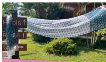
Organza scarves 34