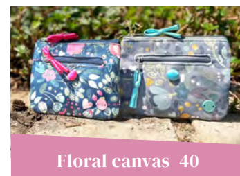
Floral canvas 40