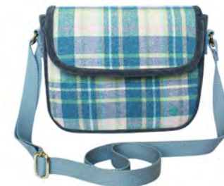
SKYE SPRING TWEED MILA BAG T26MILSKY