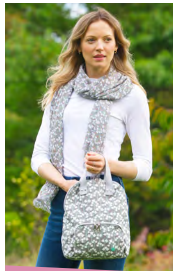
Grey flower 52