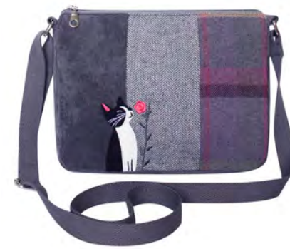
CAT TWEED APPLIQUE CROSS BODY BAG AP26MBCAT