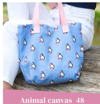
Animal canvas 48