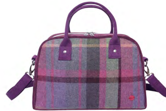
GULLANE SPRING TWEED TABBY BAG TS26DRGUL