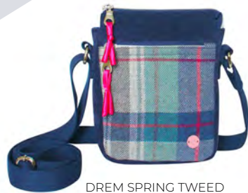
DREM SPRING TWEED PHONE POUCH TS26PHDM