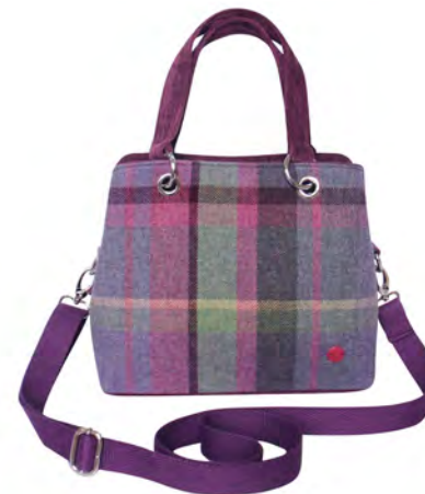
GULLANE SPRING TWEED CAMILLE BAG T26CAMGUL