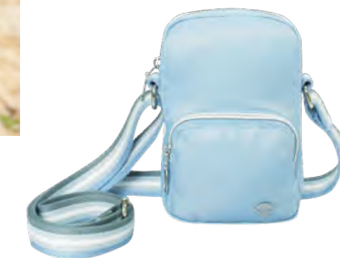
DUSTY BLUE VOYAGE PHONE POUCH VOY26PCHBL