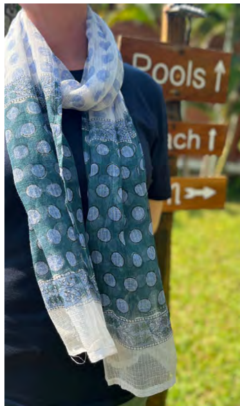
BLUE SUMMER ORGANZA SCARF SS26CHKSBLU