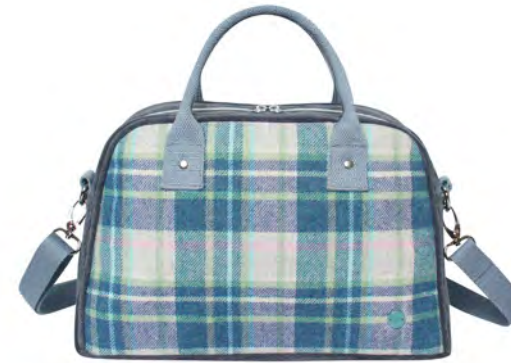
SKYE SPRING TWEED TABBY BAG TS26DRSKY