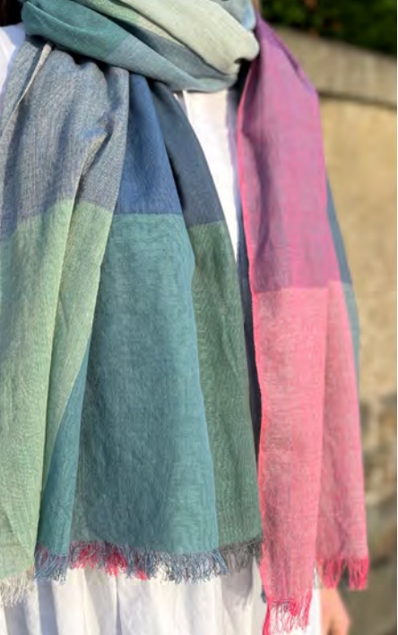
DREM COTTON SCARF T26DMSCF