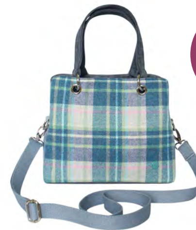
SKYE SPRING TWEED CAMILLE BAG TS26CAMSKY