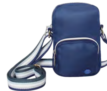
DARK DENIM VOYAGE PHONE POUCH VOY26PCHDM