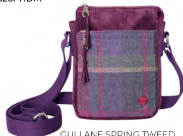
GULLANE SPRING TWEED PHONE POUCH TS26PHGUL