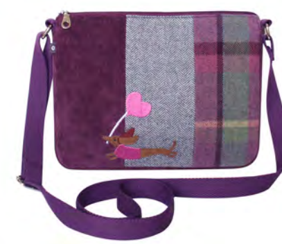
DOG TWEED APPLIQUE CROSS BODY BAG AP26MBDOG