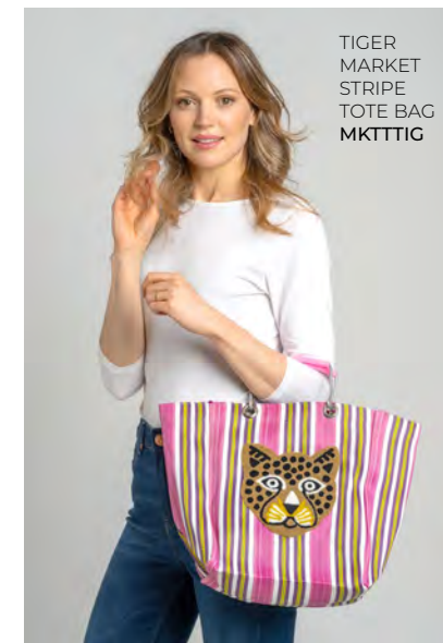
TIGER MARKET STRIPE TOTE BAG MKTTTIG