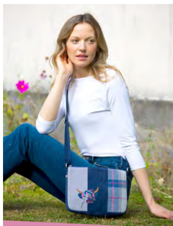
Animal applique 76