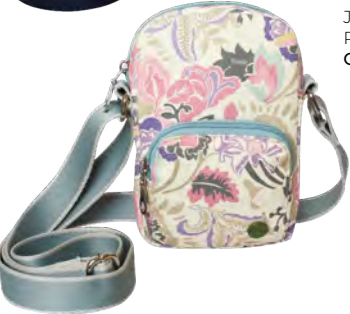
JACOBEBAN CREAM PHONE POUCH CAN26PHCM