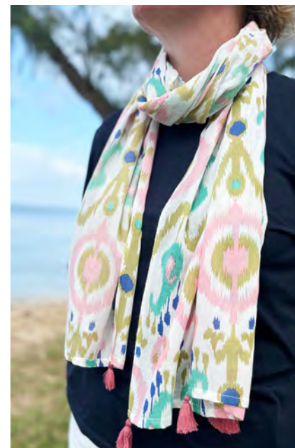
PINK COTTON TASSEL SCARF IKTSCPNK