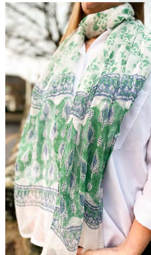
TEAL SUMMER ORGANZA SCARF SS26CHKSTEAL