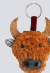
GULLANE SPRING TWEED COW KEYRING COW26KRGUL