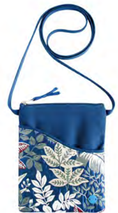
NAVY FLORAL JACQUARD SLING BAG JD26SLNV