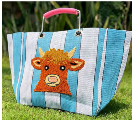
COW MARKET STRIPE TOTE BAG MKTT26COW