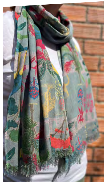
GREY TIGER PRINT SCARF GRTG25SCF