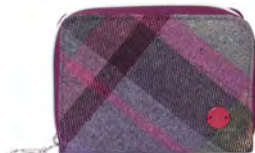
GULLANE SPRING TWEED WALLET TS26WALGUL