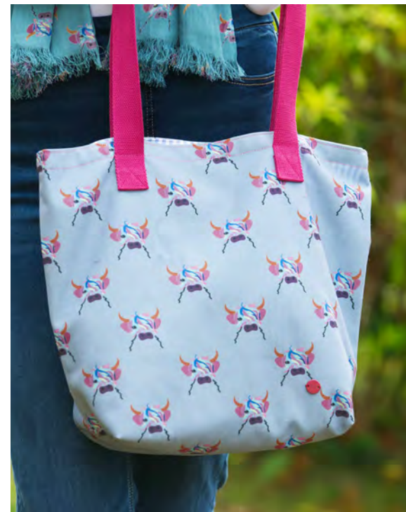
COW ANIMAL PRINT CANVAS TOTE BAG CANCOW26TT

SHEEP ANIMAL PRINT CANVAS TOTE BAG CANSHP26TT