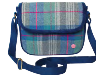
DREM SPRING TWEED MILA BAG T26MILDRM