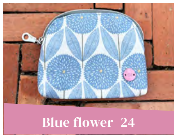
Blue flower 24