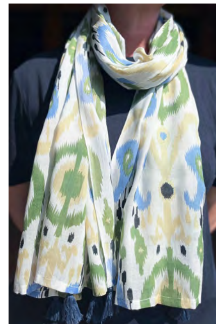
GREEN COTTON TASSEL SCARF IKTSCGRN