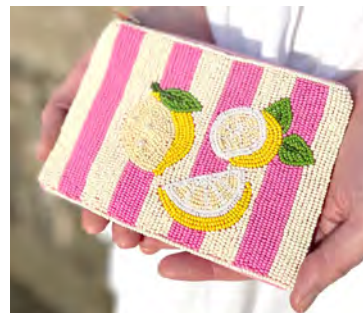
LEMONS BEADED COIN PURSE SS26BPLEM