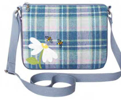
FLOWER TWEED APPLIQUE CROSS BODY BAG AP26MBFL