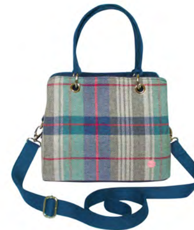
DREM SPRING TWEED CAMILLE BAG T26CAMDM