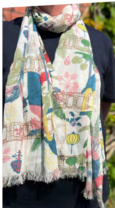
CREAM TIGER PRINT SCARF TOFTG25SCF