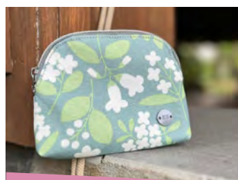
Green flower 58