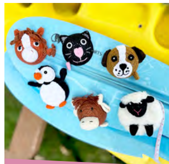
Tape measures 9