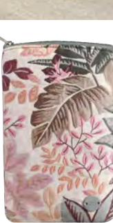
PINK FLORAL JACQUARD EYE GLASSES CASE JD26EYEPK