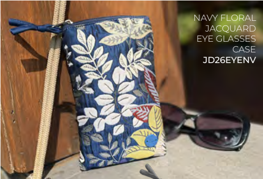
NAVY FLORAL JACQUARD EYE GLASSES CASE JD26EYENV