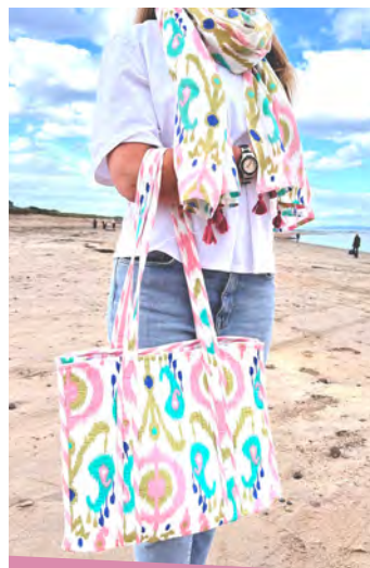
Quilted cotton 12