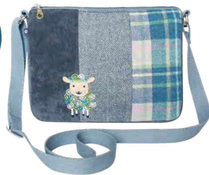
SHEEP TWEED APPLIQUE CROSS BODY BAG AP26MBSH