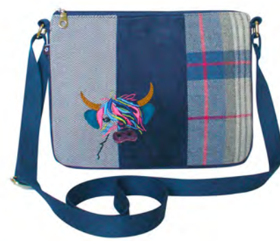
COW TWEED APPLIQUE CROSS BODY BAG AP26MBCOW