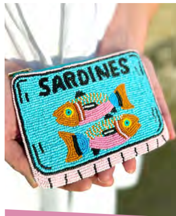
Beaded coin purses 8