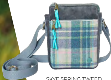
SKYE SPRING TWEED PHONE POUCH TS26PHSKY