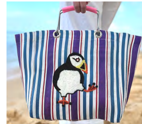
PUFFIN MARKET STRIPE TOTE BAG MKTT26PUF