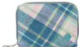
SKYE SPRING TWEED WALLET TS26WALSKY