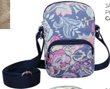
JACOBEBAN BLUE PHONE POUCH CAN26PHBL