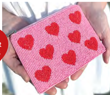
HEARTS BEADED COIN PURSE SS26BPHRT