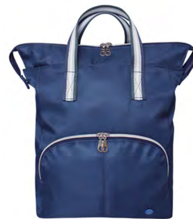
DARK DENIM VOYAGE BACKPACK VOY26BKDM