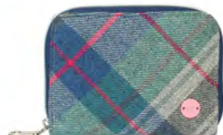
DREM SPRING TWEED WALLET TS26WALDM