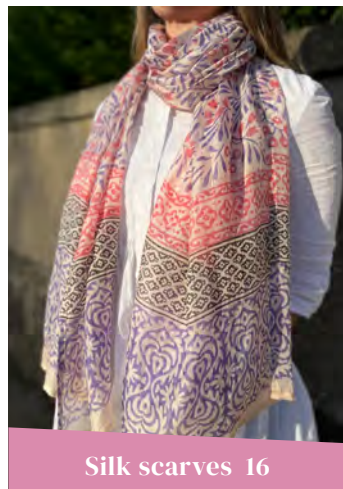
Silk scarves 16