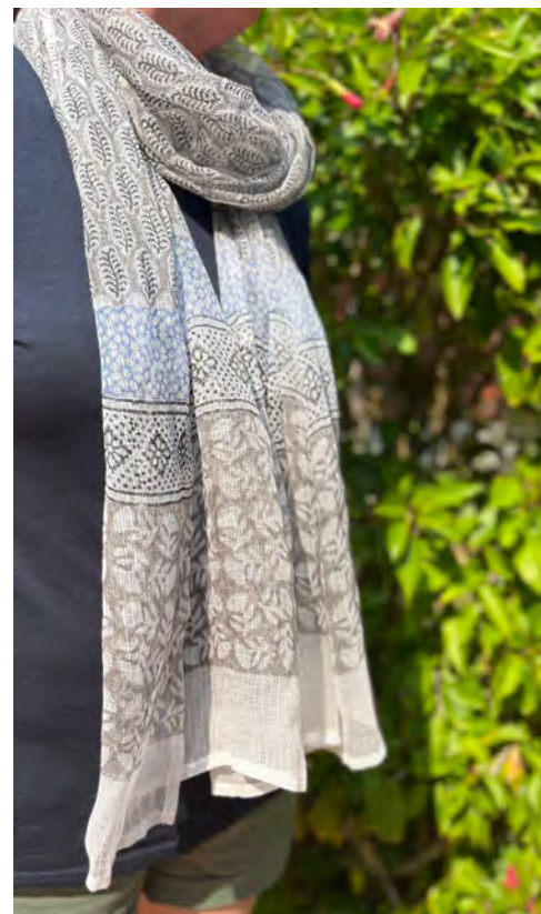
TAUPE SUMMER ORGANZA SCARF SS26CHKSTAUPE