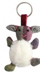
GULLANE SPRING TWEED SHEEP KEYRING TS26SHKRGUL