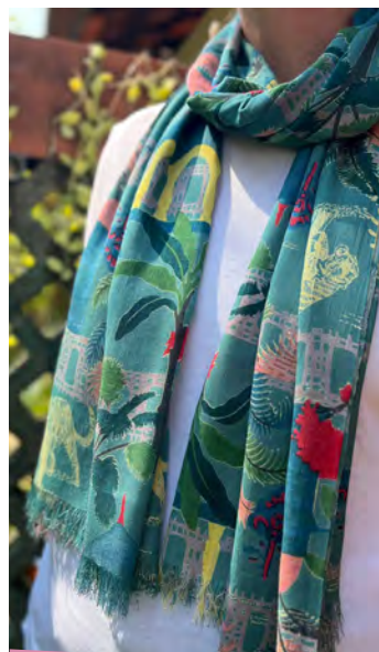
Summer scarves 56