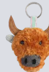
SKYE SPRING TWEED COW KEYRING COW26KRSKY