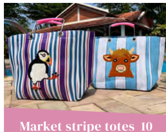
Market stripe totes 10