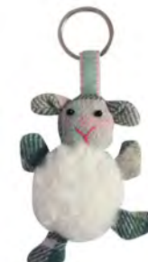
SKYE SPRING TWEED SHEEP KEYRING TS26SHKRSKY