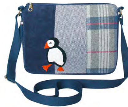
PUFFIN TWEED APPLIQUE CROSS BODY BAG AP26MBPUF