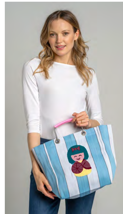
LADY MARKET STRIPE TOTE BAG MKTTDOLL