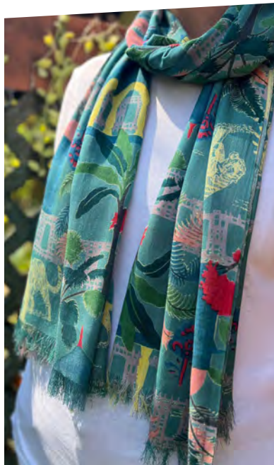
TEAL TIGER PRINT SCARF TELTG25SCF