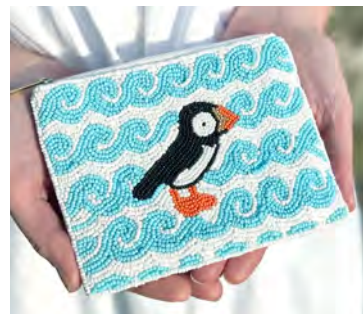
PUFFIN BEADED COIN PURSE SS26BPPUF