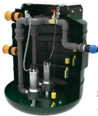
800 L Twin Model