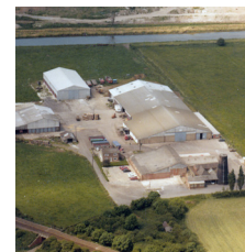
1970's: 70,000 sq ft of warehousing facilities, Brigg, North Lincolnshire.