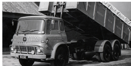
1950's: Thomas Bell & Sons Agricultural Merchants.