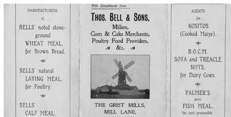
1930's: Millers, Corn & Cake Merchants, Poultry Food Providers.