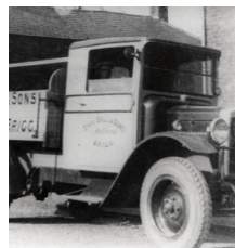
1930's: Thomas Bell & Sons - Millers of Brigg.

We are the largest privately owned fertiliser importer offering a large range of high quality fertilisers. This is all backed up with state of the art blending plant, 150,000 sq ft of undercover storage and 20 of our own fleet of lorries.