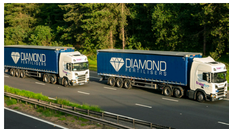
2015: Introduction 20 lorries to increase service levels.