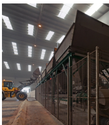
2017: Blending operations at ABP Immingham.