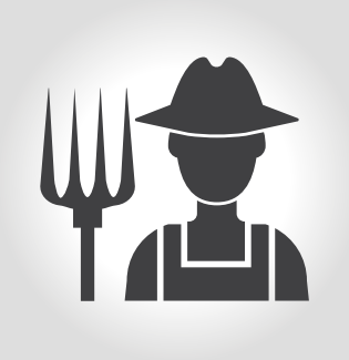
Fuel and Machinery