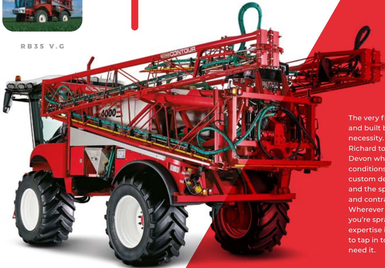
RB35 V.G PANORAMIK 3