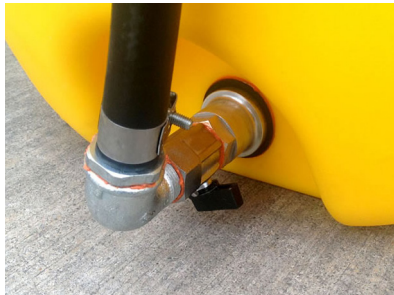
FUEL DISPENSING HOSE