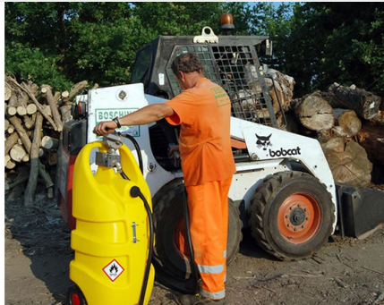
VERSATILE AND EASY TO TRANSPORT / MOVE