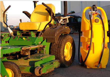
REINFORCED RIBS GIVE GREAT STRENGTH AND RESISTANCE