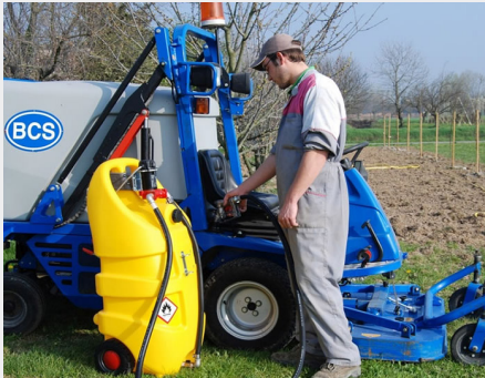
IDEAL FOR RE-FUELING ALL TYPES OF DIESEL ENGINED VEHICLES AND MACHINERY