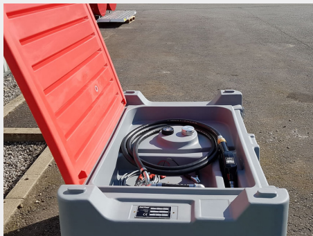
440 LITRE MOBILE DIESEL TANK