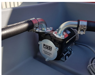
FUEL DISPENSING PUMP