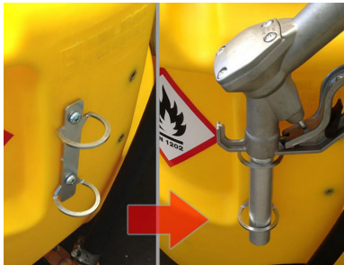
FUEL DISPENSING NOZZLE AND HOLDER