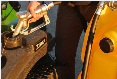
HAND PUMP DISPENSING SYSTEM WITH HOSE AND NOZZLE