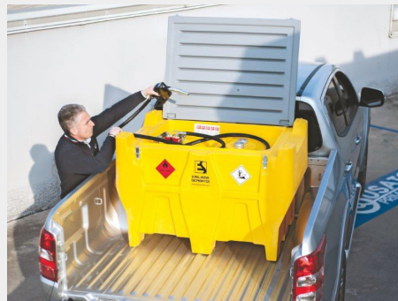
SPECIALY MOULDED MOBILE DIESEL TANK DESIGNED TO FIT AROUND PICK-UP WHEEL ARCHES