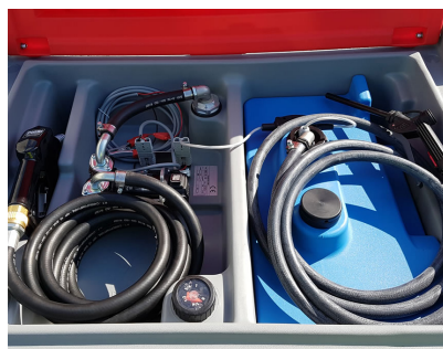
DUAL DIESEL / ADBLUE DISPENSING SYSTEM - (ON 400 + 50L TANKS)