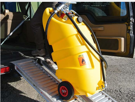
PUNCTURE PROOF WHEELS SUITABLE FOR TRANSPORT ON ANY SURFACE