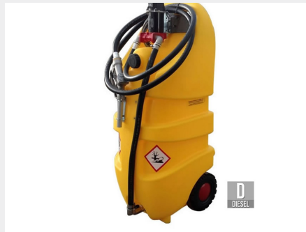
THE PERFECT SOLUTION FOR SMALL SCALE DIESEL STORAGE REQUIREMENTS