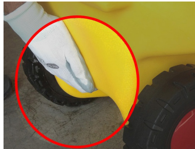
EASY CARRYING HANDLES