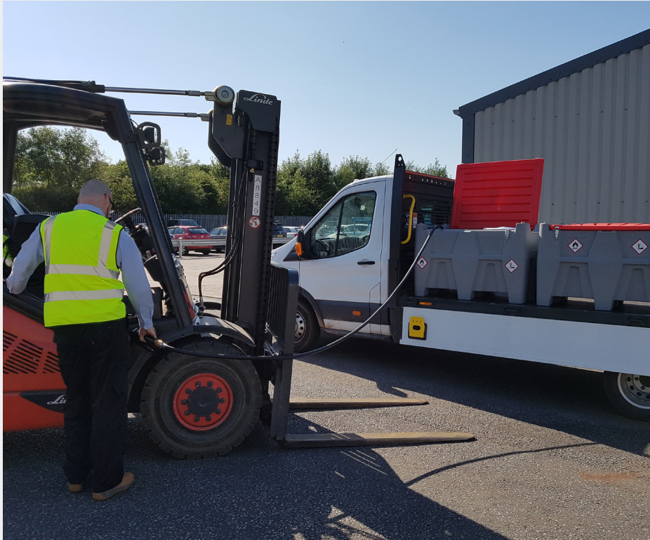
RE-FUEL MACHINERY SAFELY AND EFFICIENTLY

IDEAL FOR TRANSPORTING DIESEL ON THE HIGHWAY AND REFUELLING MACHINERY