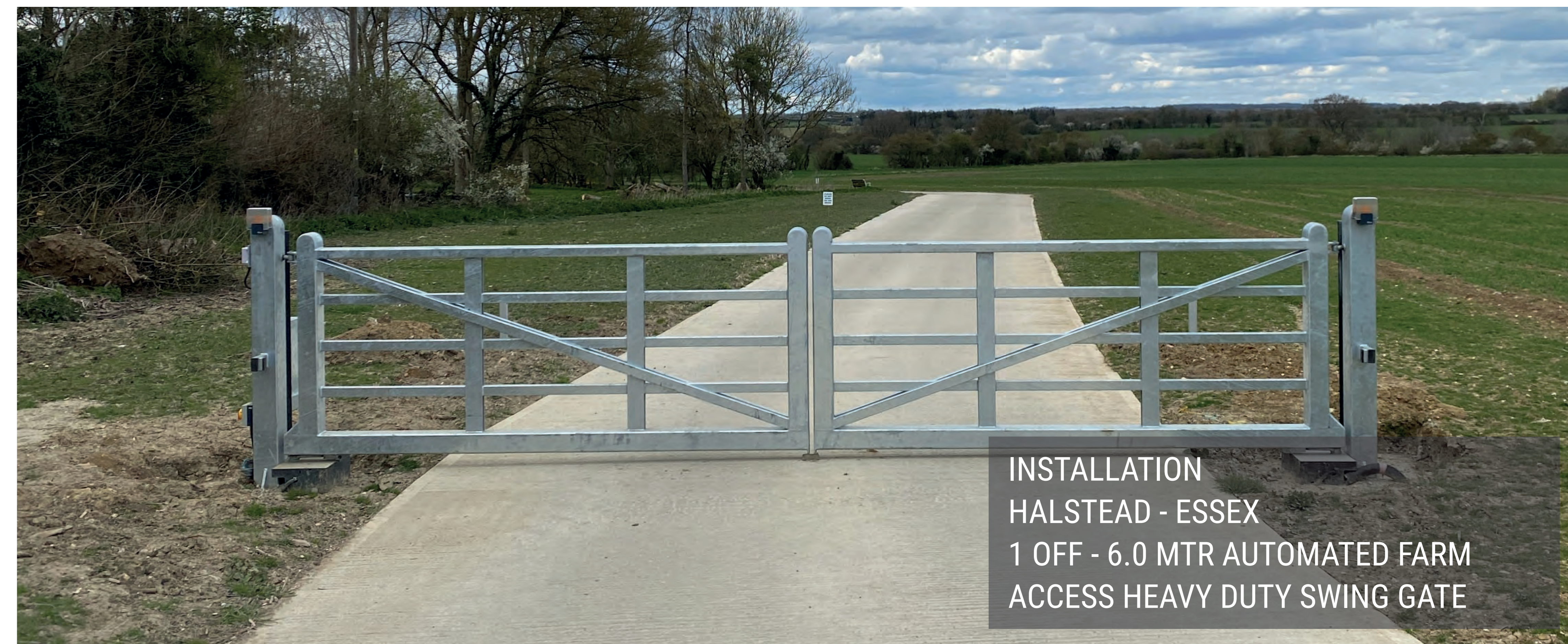
INSTALLATION HALSTEAD - ESSEX 1 OFF - 6.0 MTR AUTOMATED FARM ACCESS HEAVY DUTY SWING GATE