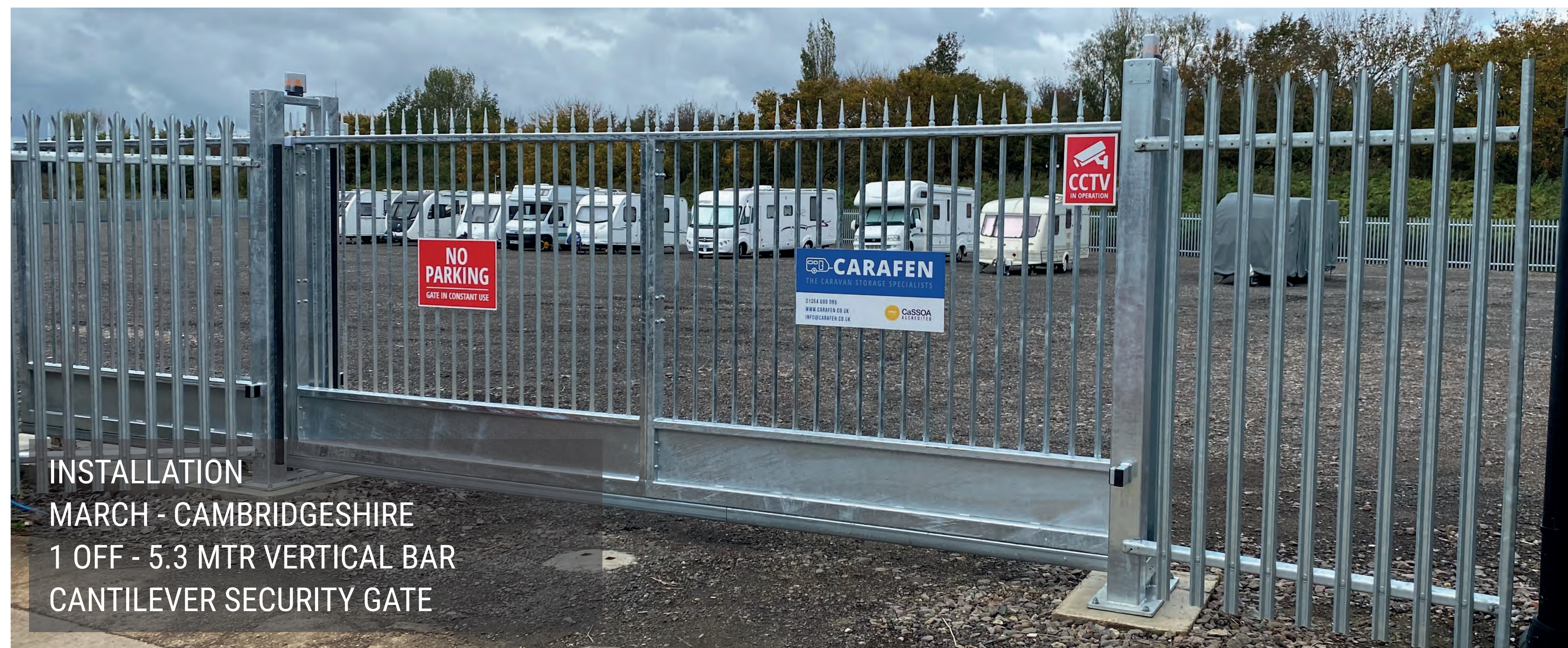
INSTALLATION MARCH - CAMBRIDGESHIRE 1 OFF - 5.3 MTR VERTICAL BAR CANTILEVER SECURITY GATE