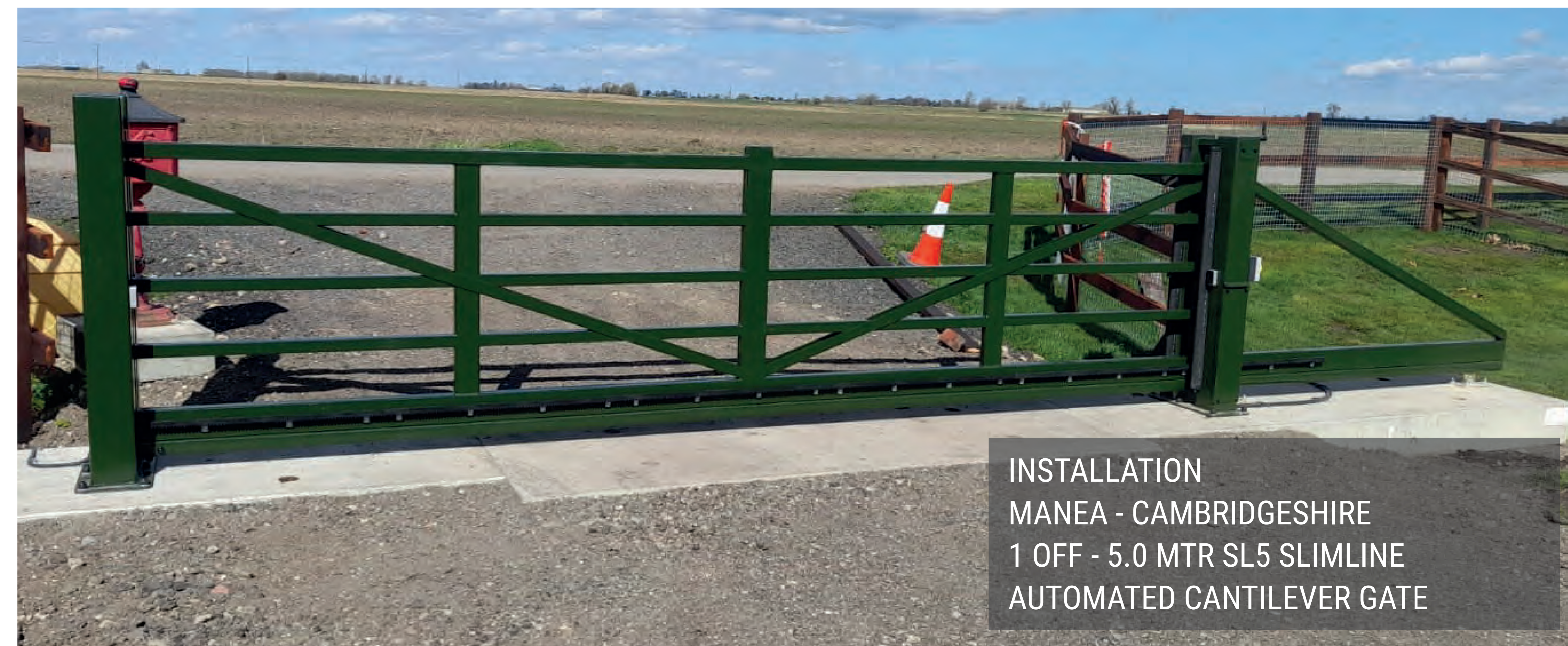
INSTALLATION MANEA - CAMBRIDGESHIRE 1 OFF - 5.0 MTR SL5 SLIMLINE AUTOMATED CANTILEVER GATE