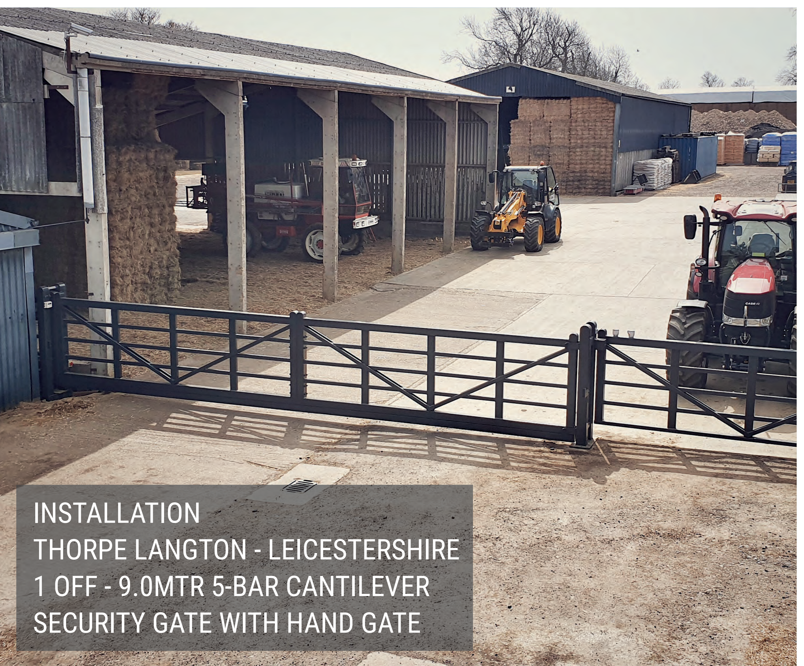
INSTALLATION THORPE LANGTON - LEICESTERSHIRE 1 OFF - 9.0MTR 5-BAR CANTILEVER SECURITY GATE WITH HAND GATE

01354 278506 sales@ukfarmgates.co.uk www.ukfarmgates.co.uk