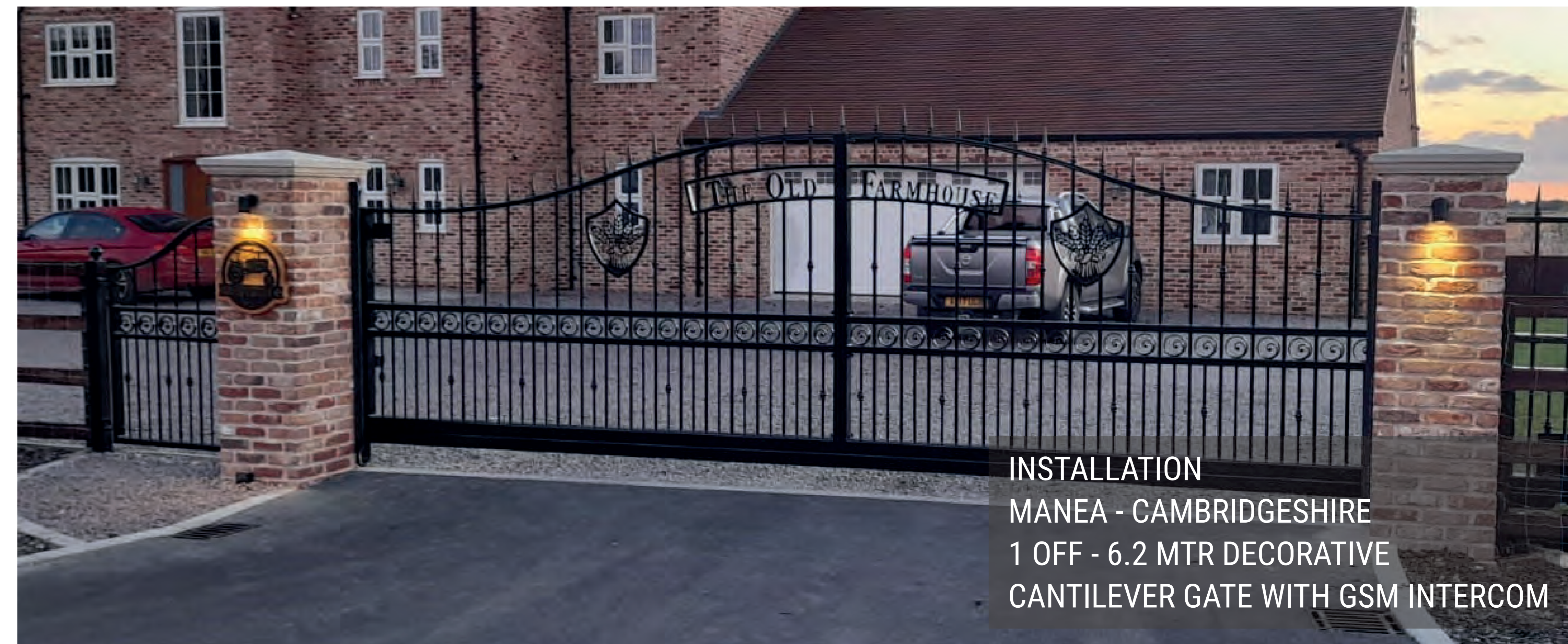
INSTALLATION MANEA - CAMBRIDGESHIRE 1 OFF - 6.2 MTR DECORATIVE CANTILEVER GATE WITH GSM INTERCOM