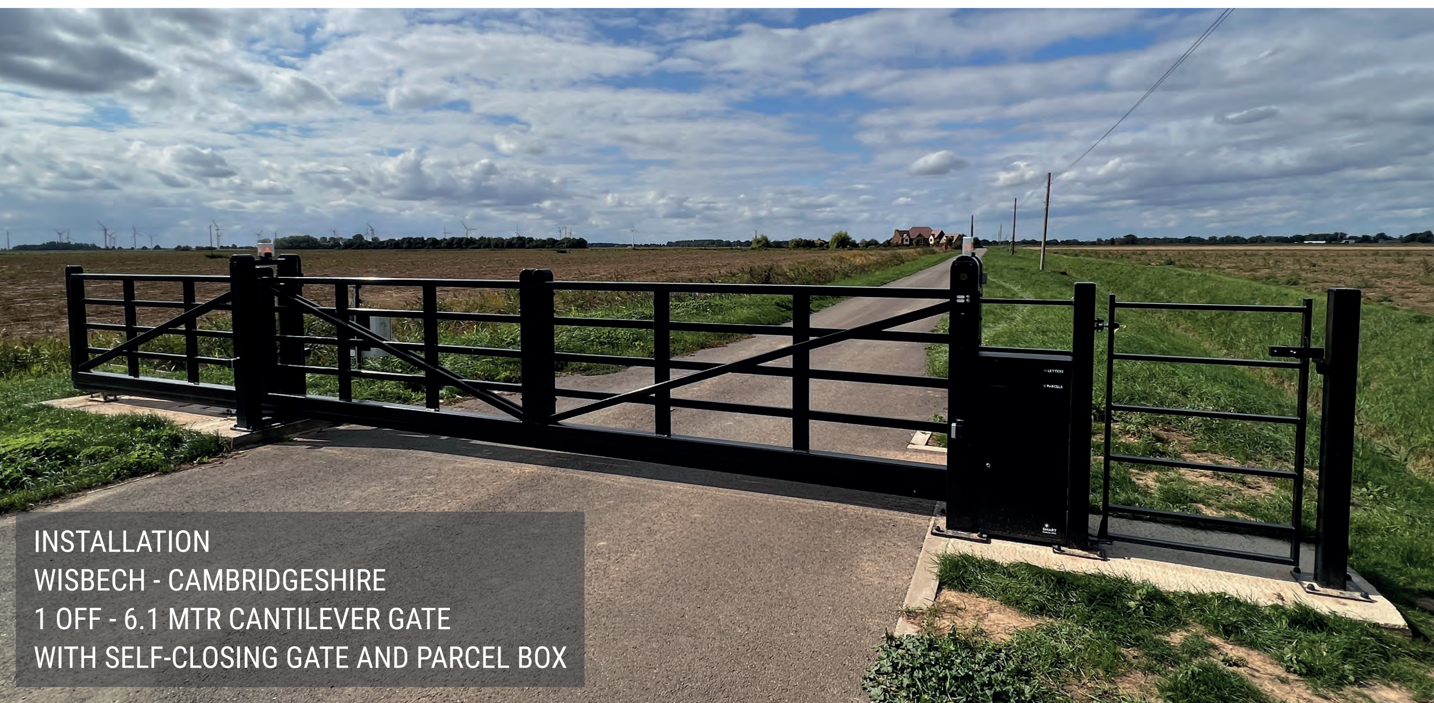
INSTALLATION WISBECH - CAMBRIDGESHIRE 1 OFF - 6.1 MTR CANTILEVER GATE WITH SELF-CLOSING GATE AND PARCEL BOX

Our range of standard five-bar farm style cantilever gates are supplied in 6.1m, 7.5m and 9.0m widths. Custom design straight bar and decorative entrance gates for specific widths and styles are also available at request.