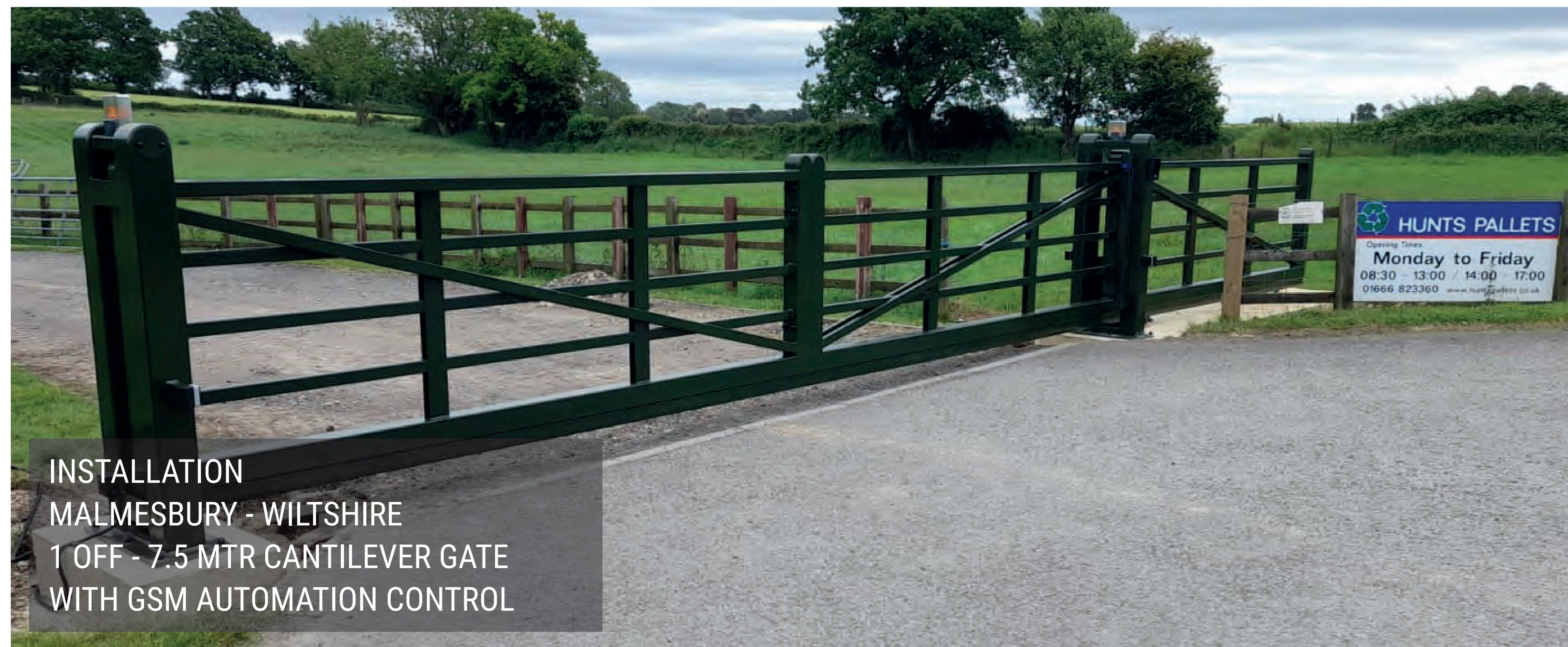
INSTALLATION MALMESBURY - WILTSHIRE 1 OFF - 7.5 MTR CANTILEVER GATE WITH GSM AUTOMATION CONTROL