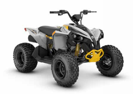
RENEGADE 110 EFI