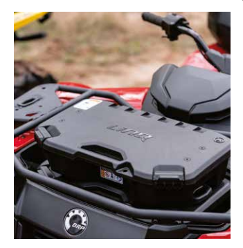
Check out our all accessories at CANAMOFFROAD.COM

This LinQ Tool Kit is the starter kit with essentials that make your ride truly yours.