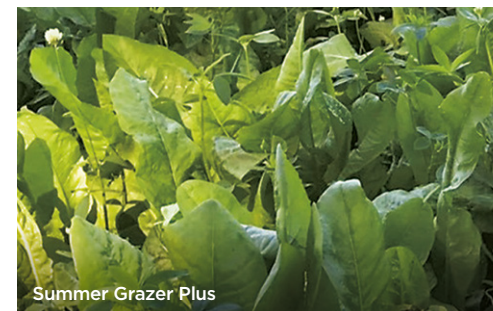
Summer Grazer Plus

A fodder rape, chicory and berseem clover mixture that provides an ideal drought-tolerant break crop for reliable summer grazing.