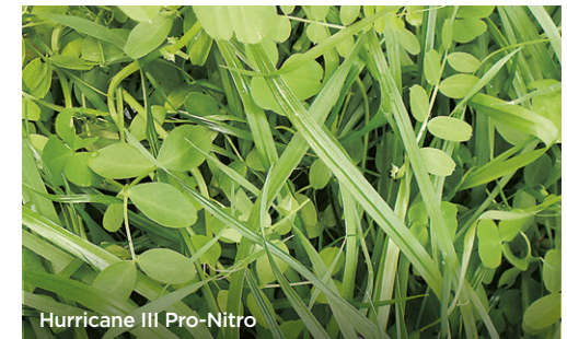
Hurricane III Pro-Nitro

These CNUM2-compliant mixtures boost fertility and give excellent aftermath grazing potential.