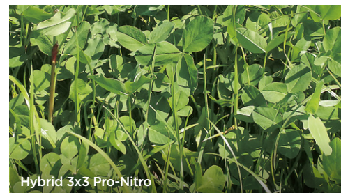
Hybrid 3x3 Pro-Nitro

Hybrid 3x3 and Hybrid 3x3 Pro-Nitro are CNUM2 compliant. All three Hybrid 3x3 mixtures are available as organic versions.