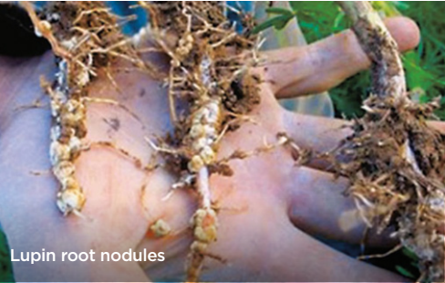
Lupin root nodules

An excellent nectar source for pollinators with a long flowering window, designed to do two flowering cycles with the yellow trefoil coming to flower in year two. Enhances soil structure and reduces nutrient leaching.