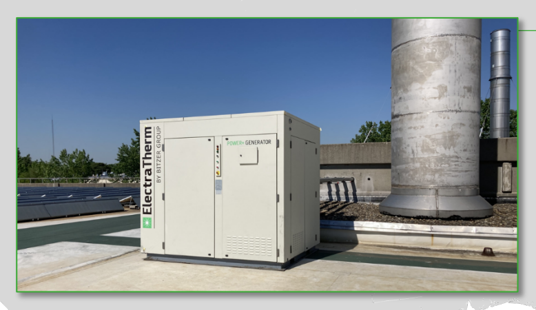
Waste Water Treatment Plant / Staten Island, NY