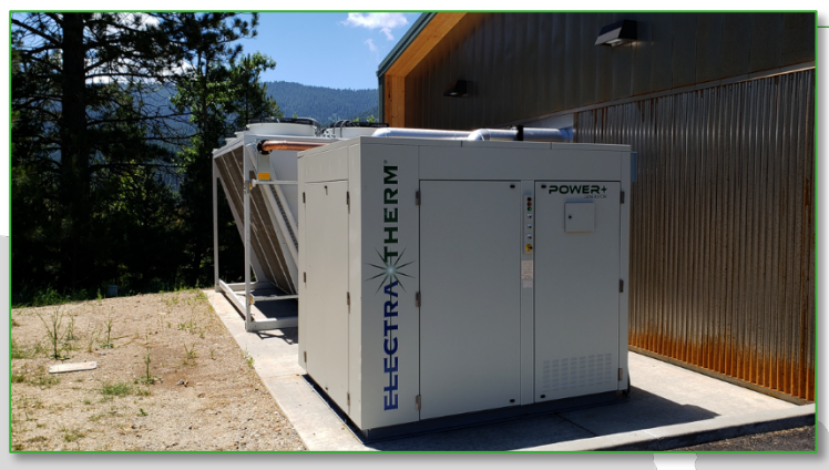
Wisewood / Quincy, CA