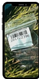
Barcode tracking for each sample: integrated with each lab