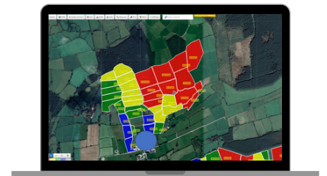
Cloud based platform presenting individual farm and programme level data