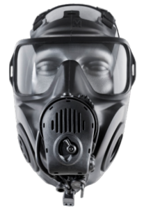
FM53™ | M53A1™