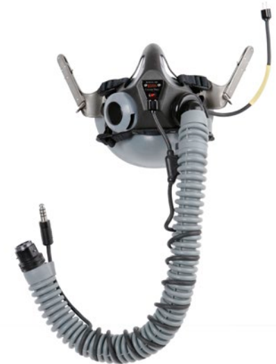
Gentex MBU-20A/P Oxygen Mask

Designed for PBG and non-PBG equipped aircraft. Qualified and flown by the majority of non-U.S. militaries flying Gentex and ALPHA fixed wing helmet systems. The HA/LP comes in configurations to support various aircraft and services, see pages 49-50 for information about common configuration options.