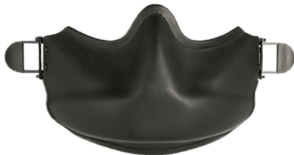
Gentex HGU-56/P & 84/P Maxillofacial Shield

The Gentex and ALPHA Maxillofacial Shields (MFS) safeguard the lower face from rotor wash, flying debris and windblast during helicopter operations. An optional upgrade to Gentex HGU-56/P, HGU-84/P, or SPH-5® Rotary Wing Helmet Systems; ALPHA 900 Cross Platform Helmet Systems; and the ALPHA Eagle Helmet System, the MFS significantly enhances communications clarity by reducing wind noise across the boom microphone.