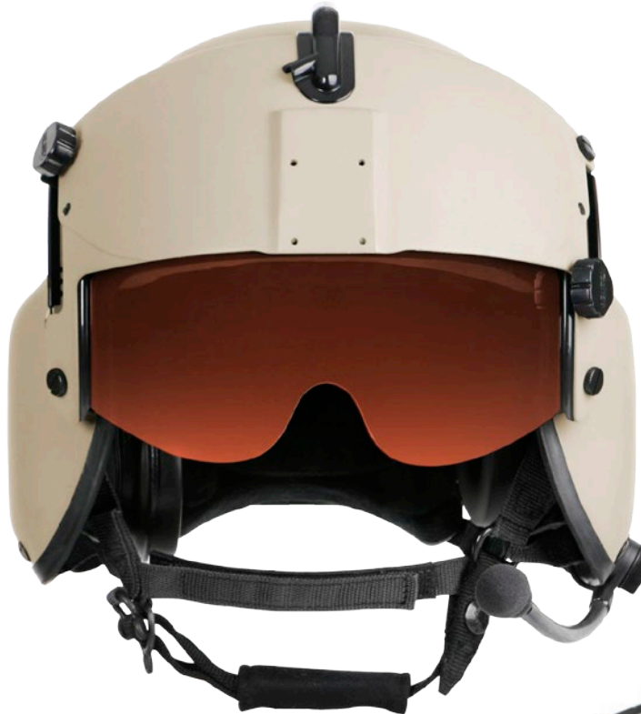
Gentex Dazzle Laser Defense Visor (Night Version) integrated in a Gentex HGU-56/P Rotary Wing Helmet System

To combat the emerging laser threats that may be encountered by pilots during critical phases of flight, Gentex developed Dazzle Laser Defense Eyewear. The laser glare-reduction lenses used in the eyewear are available in day and night versions, and designed to maintain see-through color perception while providing necessary protection from green and blue commercial lasers. Laser protection is achieved through the use of special optical absorbing dye and lens coating technologies. Dazzle Eyewear is available in visor formats for Gentex rotary wing helmets, and flight-helmet compatible spectacles that are compatible with additional headborne equipment, such as Helmet Mounted Displays and Night Vision Goggles.