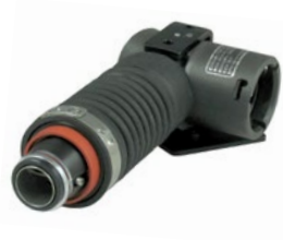
Gentex B1-B Connector

Assures positive locking and prevents flailing during ejection; attaches to an aircrew's parachute harness.