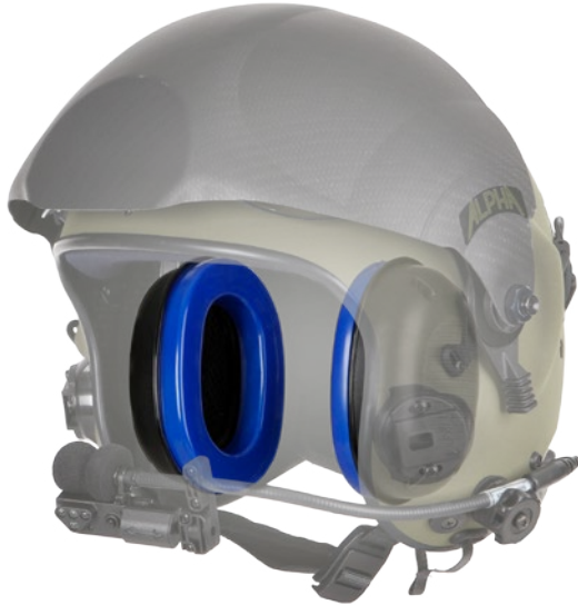
ALPHA 900 equipped with AHNR Technology