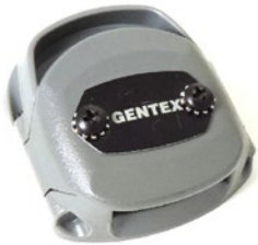
Gentex R2 Rotatable Bayonet Receiver

The lightweight, advanced design of Gentex bayonet receivers allow for easy attachment and fitting of oxygen masks that both rotate and hinge.