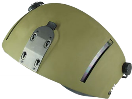
Gentex ANVIS Quick Disconnect NVG Mount

To help ensure pilot safety and performance while using Night Vision Goggles (NVG), Gentex offers NVG mounts for many of their most common helmet system platforms.