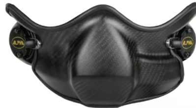
ALPHA Eagle Maxillofacial Shield