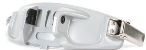
Gentex Banana Bar NVG Mount

Designed to provide a permanent NVG mounting platform to visor housings.