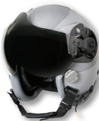
Gentex 190A Fixed Wing Helmet System

Innovative system for Panavia Tornado aircrew provides safe nighttime ejection when flying Night Vision Goggles (NVGs). German and Italian Air Force Qualified.