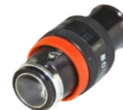
Gentex Quick Disconnect Assemblies

For B-1 Bomber aircrew. Dovetail mounts on left or the right side of the torso.