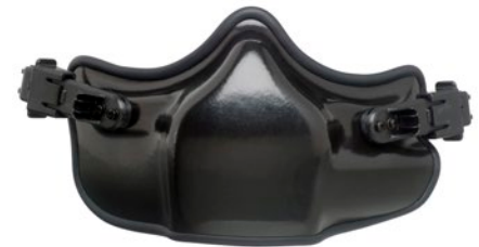
ALPHA 900 Series Maxillofacial Shield