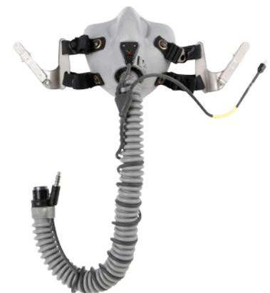
Gentex MBU-12/P Oxygen Mask

HA/LP variant designed specifically for Russian aircraft platforms.