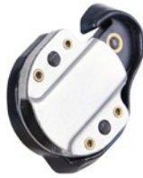
Gentex Anti-Snag Bayonet Receiver

Standard on U.S. Air Force HGU-55/P helmet systems, the R2 Bayonet Receiver is the most versatile bayonet receiver available providing over 30 degrees of rotation to optimize oxygen mask fit in a shorter period of time with less technician effort. The R2 Receiver can be worn and hinged on either side of the helmet for easy access with a gloved hand. The perfect “plug-and-play” replacement for current bayonet receivers without modification to the helmet shell.