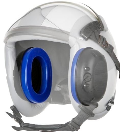
Gentex HGU-55P equipped with AHNR Technology