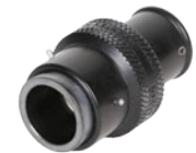
Gentex 3-Pin Connector

Mates with oxygen mask assembly hoses and disconnects from a MS22058 connector between 12 and 20 lbs.; pin provided for attachment of strain relief cord.