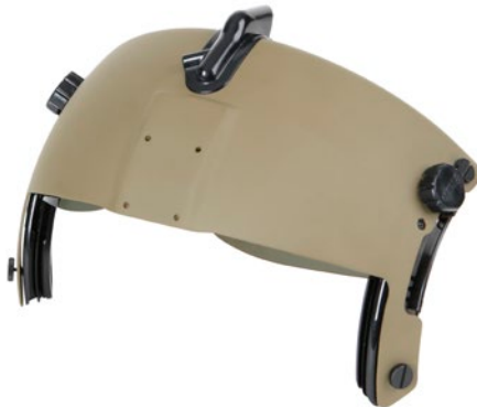
Gentex Standard ANVIS NVG Mount

Allows the quick attachment and easy disconnect of NVGs from visor housings.