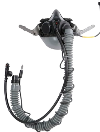
Gentex MiG & Sukhoi-HA/LP Oxygen Mask

Worn by EFA pilots, the Gentex EFA/ACS mask is an integral component of the Gentex Air Combat Fixed Wing Helmet System (ACS), providing PBG capability while reducing the probability of GLOC. Mask bayonets are designed to not only secure the mask to the helmet, but also supply the ACS helmet bladder with pressure for automatic mask tensioning at high-G.