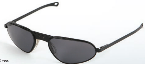
Gentex Dazzle Laser Defense Spectacles (Day Version)