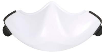
Gentex SPH-5 Maxillofacial Shield