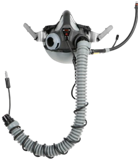
Gentex MBU-20/P Oxygen Mask

The MBU-20/P Oxygen Mask is an integral component of the Gentex HGU-55/P Fixed Wing Helmet System, providing pressure breathing for G (PBG) capability to tactical aircrew, while reducing the probability of G-induced loss of consciousness (GLOC). Issued to all U.S. F-15, F-16, and F-22 fighter pilots, this exceptional unit offers a lightweight, low-profile design with advanced, performance enhancing capabilities. Separate inhalation and exhalation valves minimize breathing resistance, while automatic mask tensioning during high-G maneuvers can be achieved through the use of the Gentex HGU-55/P COMBAT EDGE Kit.