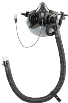
Gentex EFA/ACS Oxygen Mask

U.S. Navy configured oxygen mask providing optimal PPB sealing and +600 KEAS windblast protection. Typically flown with a Gentex HGU-68/P Fixed Wing Helmet System.