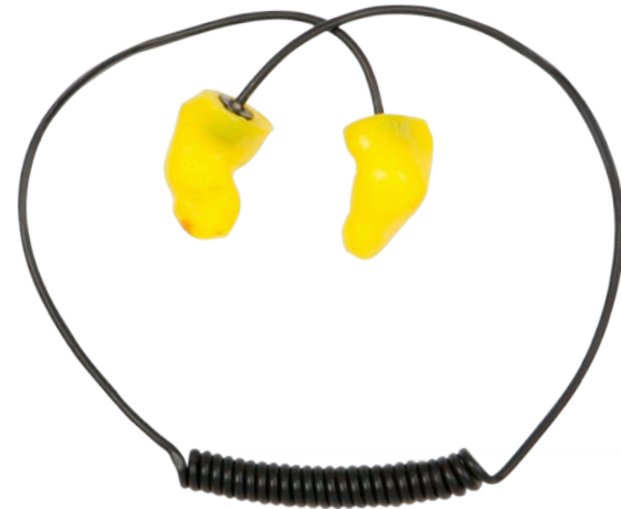
Gentex LPCCE with passive tether

Gentex Ear Seals are compatible with Gentex and ALPHA Helmets and use Comply ear seal technology to deliver increased mission effectiveness. The patented high attenuation foam reduces noise by 9 dB around 1KHz and by 3 dB below 200 Hz, providing advanced hearing protection and clarity in communication by enhancing passive attenuation. The extremely soft viscoelastic memory foam also reduces irritation and fatigue, remaining comfortable during extended missions; increases conformability around eyeglasses and facial features, which ensures a more complete seal minimizing acoustic leaks; provides a secure fit, which reduces pilot workload as less helmet adjustments are necessary; and limits the amount of movement when using NVGs.