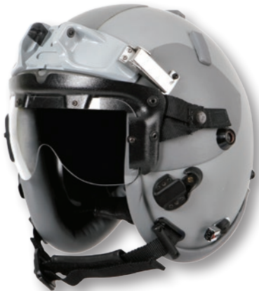
Gentex HGU-55/IG Fixed Wing Helmet System

Complementing the U.S. Air Force standard, the Gentex HGU-55/P Helmet System, Gentex provides a full line of fixed wing helmet systems to meet the needs of global air forces.