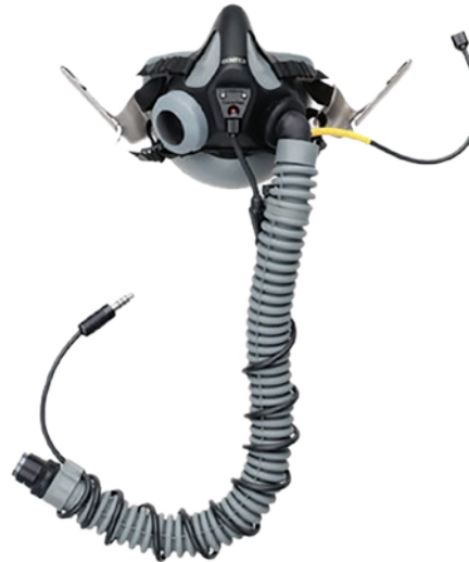
Gentex High Altitude/ Low Profile (HA/LP) Oxygen Mask

The MBU-20/P Oxygen Mask is an integral component of the Gentex HGU-55/P Fixed Wing Helmet System, providing pressure breathing for G (PBG) capability to tactical aircrew, while reducing the probability of G-induced loss of consciousness (GLOC). Issued to all U.S. F-15, F-16, and F-22 fighter pilots, this exceptional unit offers a lightweight, low-profile design with advanced, performance enhancing capabilities. Separate inhalation and exhalation valves minimize breathing resistance, while automatic mask tensioning during high-G maneuvers can be achieved through the use of the Gentex HGU-55/P COMBAT EDGE Kit.