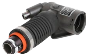
Gentex CRU-60/P Connector

PBG capability reduces probability of GLOC during high performance flight.