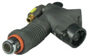
Gentex CRU-94/P Integrated Terminal Block Connector

Our oxygen connectors are built to meet or exceed rigorous U.S. Military Specifications and are the popular choice throughout the world.