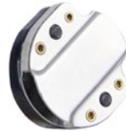
Gentex Lightweight Bayonet Receiver

Reduces potential for snags from parachute risers or shroud lines during aircraft ejection or manual bailout.