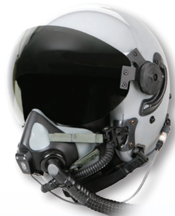
Gentex Air Combat Fixed Wing Helmet System (ACS)

Meets HGU-55/P specifications with a mission-configurable, hard-mounted dual visor kit. Built and Qualified for Canadian Air Force.