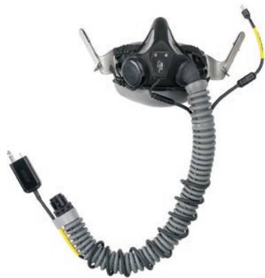
Gentex MBU-23/P Oxygen Mask

U.S. Navy configured oxygen mask providing optimal PPB sealing and +600 KEAS windblast protection. Typically flown with a Gentex HGU-68/P Fixed Wing Helmet System.