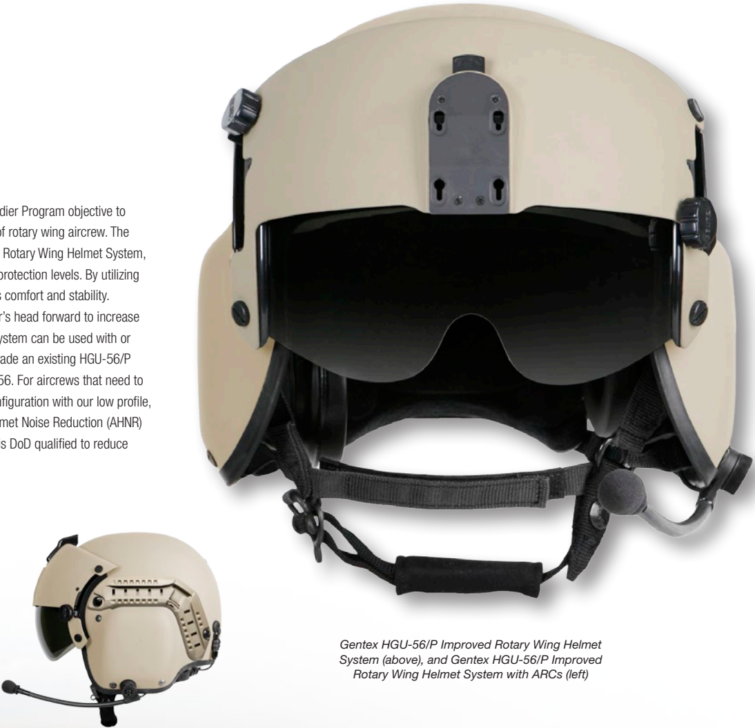
Gentex HGU-56/P Improved Rotary Wing Helmet System (above), and Gentex HGU-56/P Improved Rotary Wing Helmet System with ARCs (left)