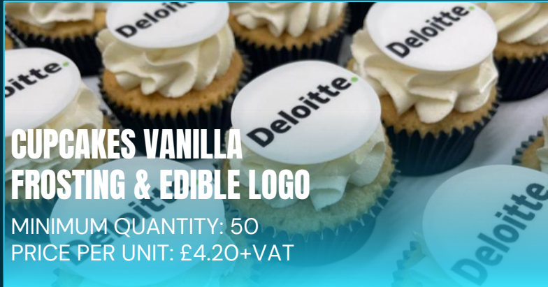
CUPCAKES VANILLA FROSTING & EDIBLE LOGO

MINIMUM QUANTITY: 50 PRICE PER UNIT: £4.20+VAT