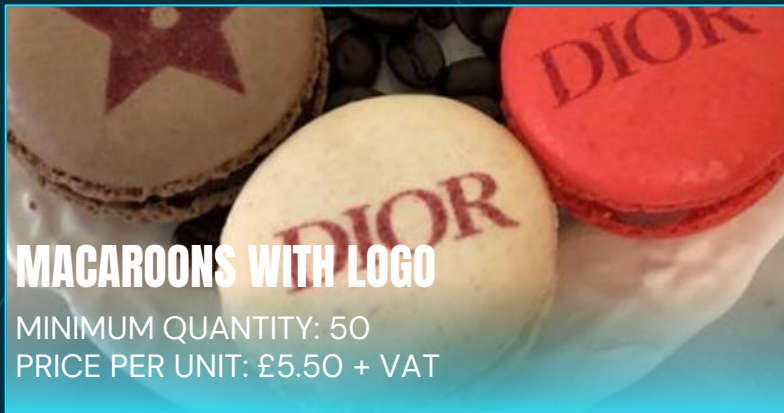
MACAROONS WITH LOGO

MINIMUM QUANTITY: 50 PRICE PER UNIT: £5.50 + VAT