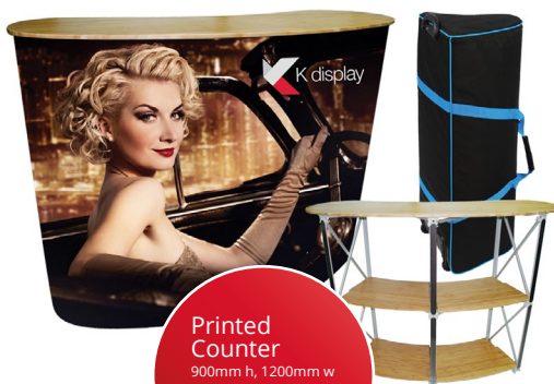
Printed Counter 900mm h, 1200mm w £299+vat