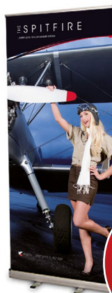
Printed Pull Up 850mm w, 2000mm h £79+vat