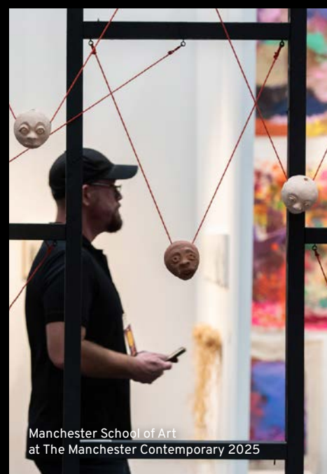
Manchester School of Art at The Manchester Contemporary 2025