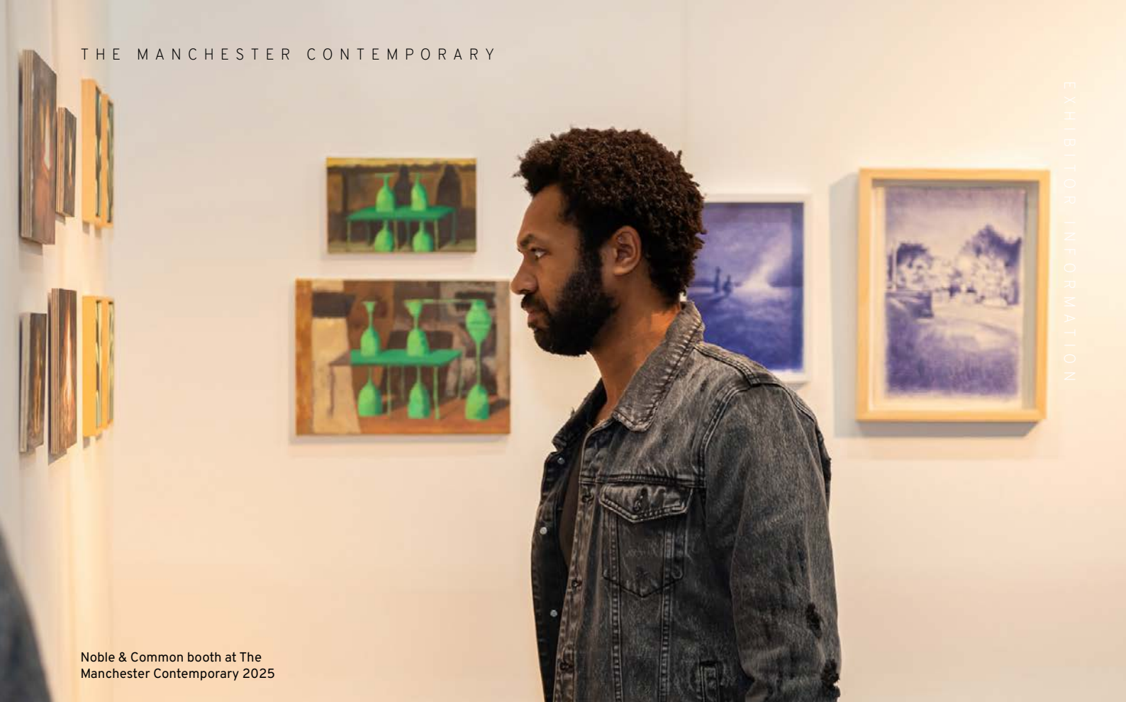
Noble & Common booth at The Manchester Contemporary 2025