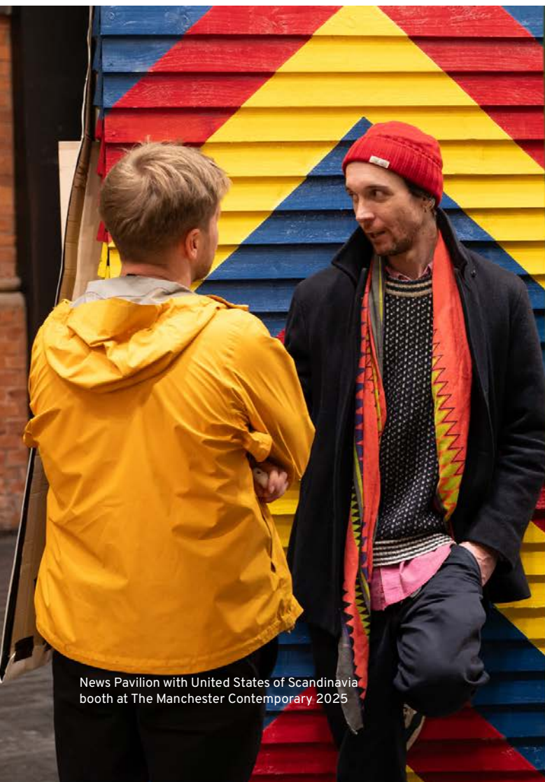
News Pavilion with United States of Scandinavia booth at The Manchester Contemporary 2025