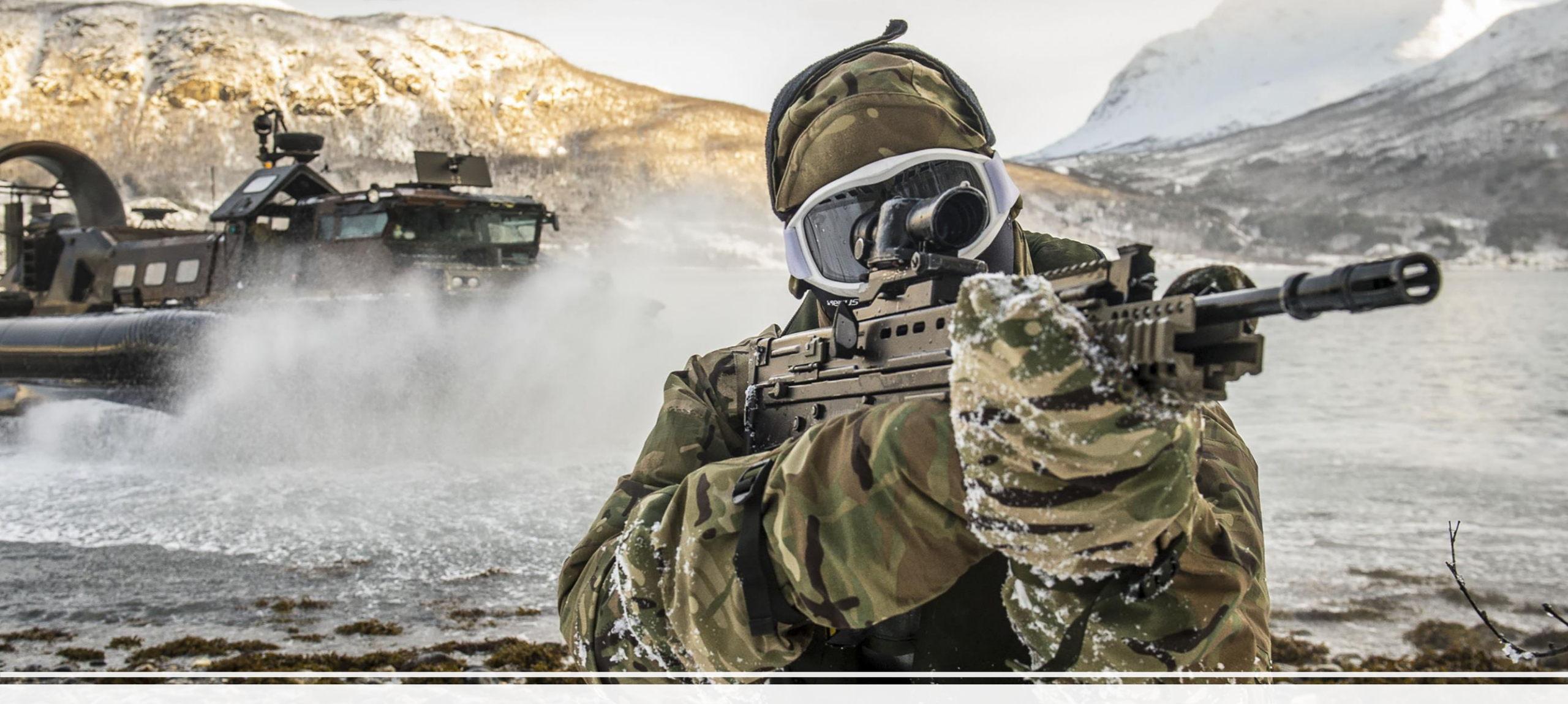
TACTICAL – UNIQUE OPERATING ENVIRONMENT