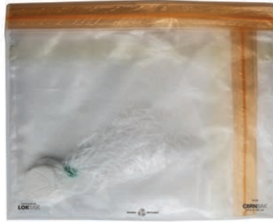
Double Bagged Trace PEL