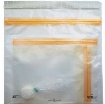
Triple Bagged PEL...Vanishes