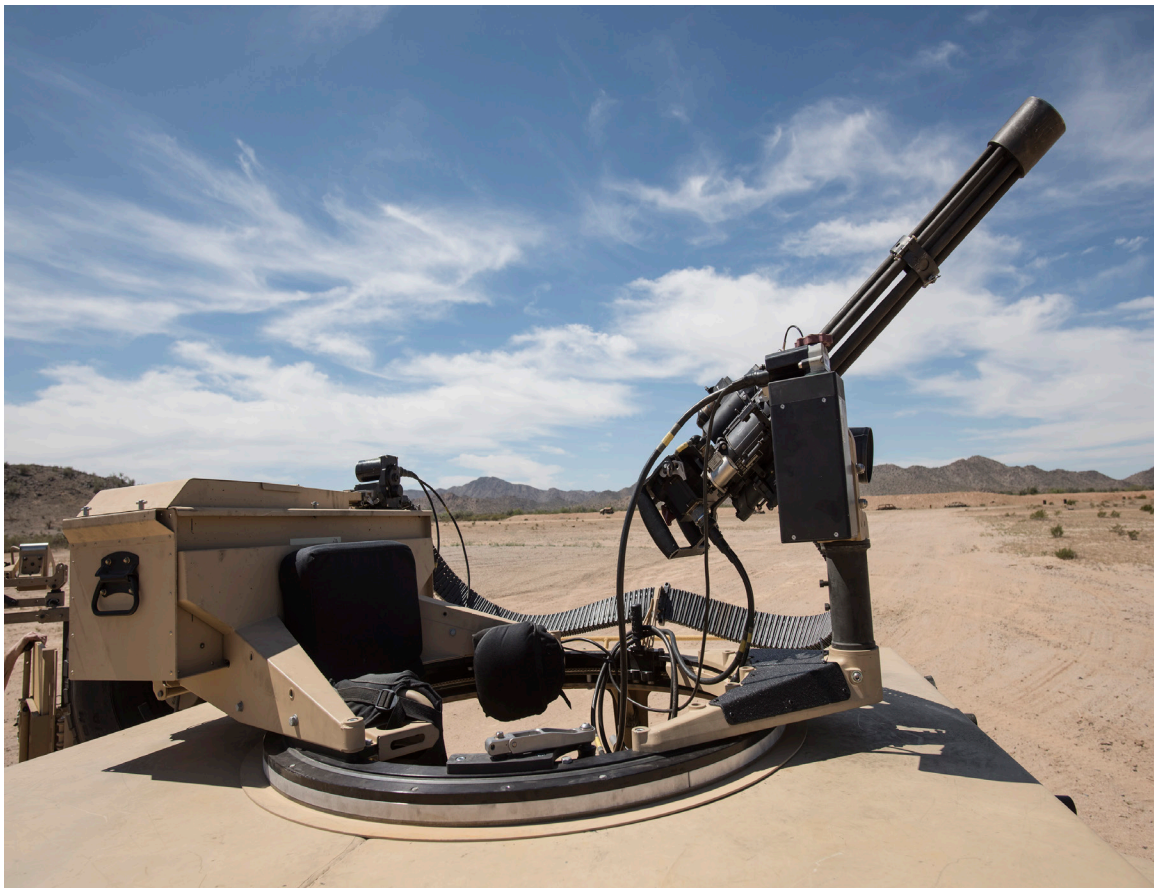
MMC system mounted with M134D