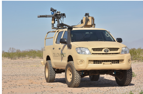
MMC system installed on a Hilux