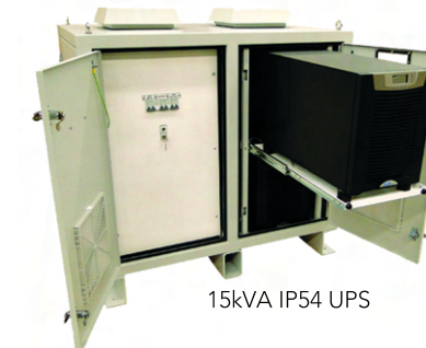
15kVA IP54 UPS