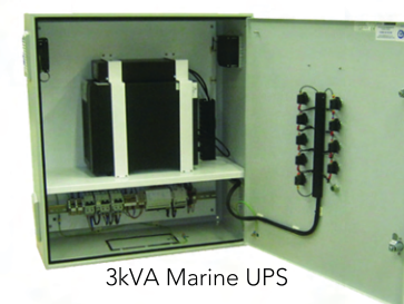
3kVA Marine UPS