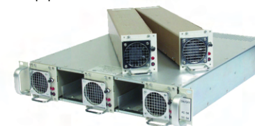
Astor N+1 DC PSU

Applications: radar, communications, control.