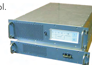
6kVA Ship UPS