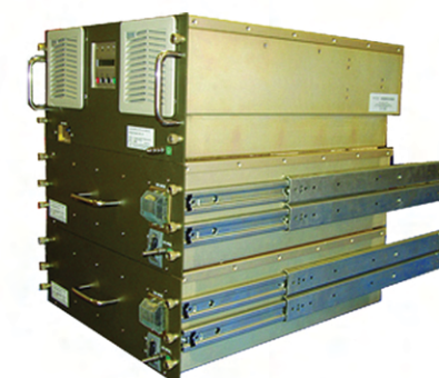
7kVA Vehicle UPS