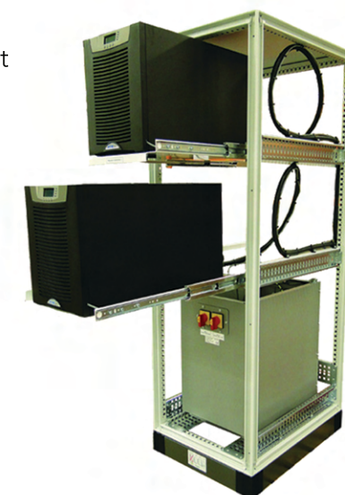
10kVA N+1 Converter