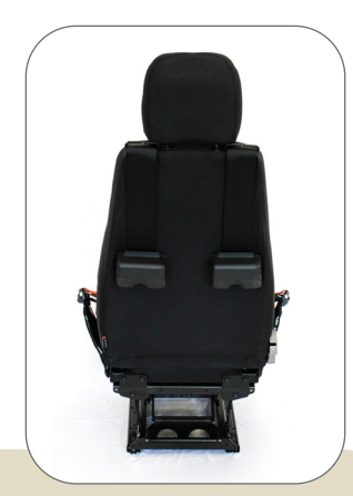
Fully integrated 4 or 5-point harness