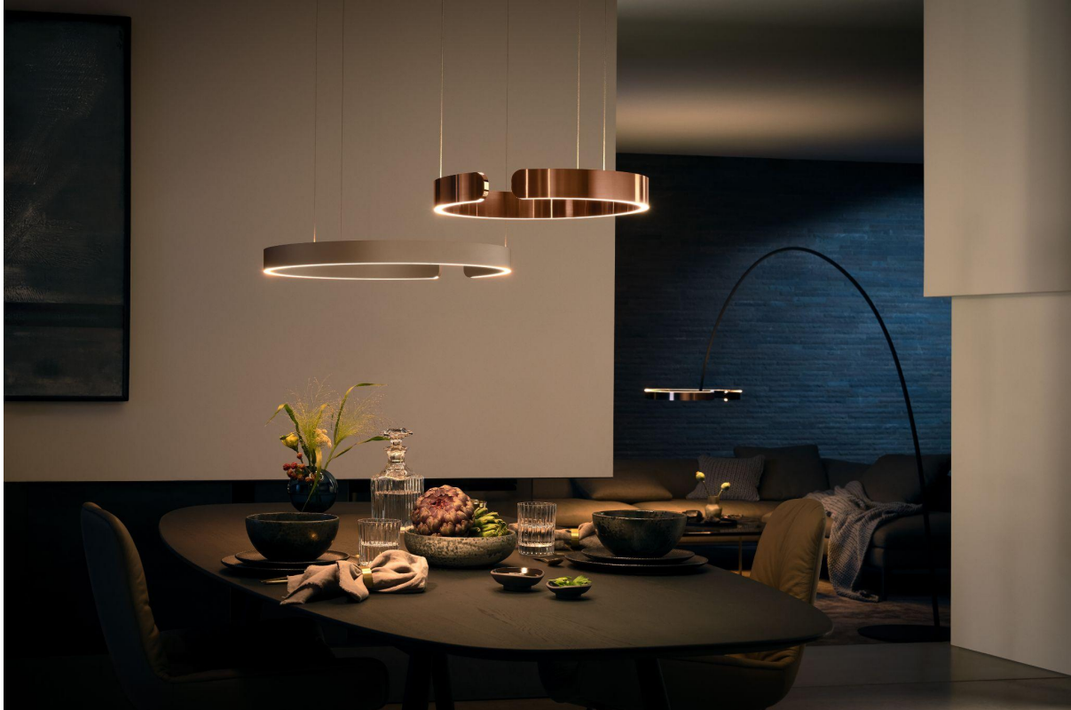
First-time exhibitor OCCHIO will showcase The Mito Collection in the Contemporary Section at Design Shanghai 2021.

The Kitchen & Bathroom section continues to showcase top-tier brands including Versace Ceramics , LAUFEN , SieMatic , Villeroy & Boch , Kohler , Stosa , Porcelanosa and AXOR . Mega Home will present MisuraEmme , Glas Italia , Agape , Dada and Living Italy will showcase Veneta Cucine , Vimar , Alta Corte , Targetti , Erre Erre Diffusion and Gruppo Tosco Marmi .