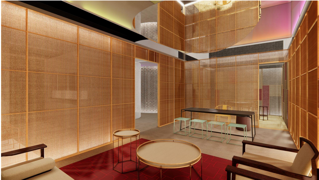
Shang Xia's curated stand 'Tea Space' for Design Shanghai 2021