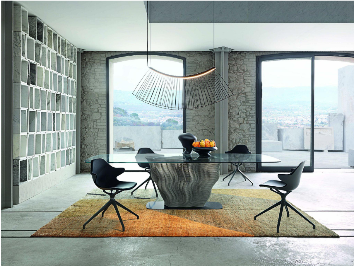
Roche Bobois will launch a brand new contemporary furniture collection, CORAIL, at Design Shanghai's Contemporary Section.