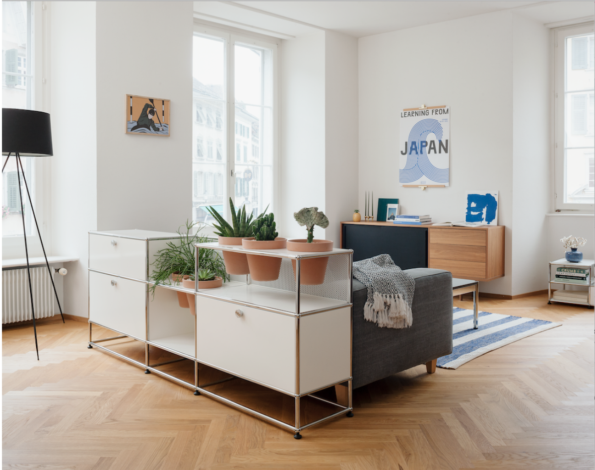
USM Haller will showcase its collection 'World of Plants' Collection for the first time at Design Shanghai 2021