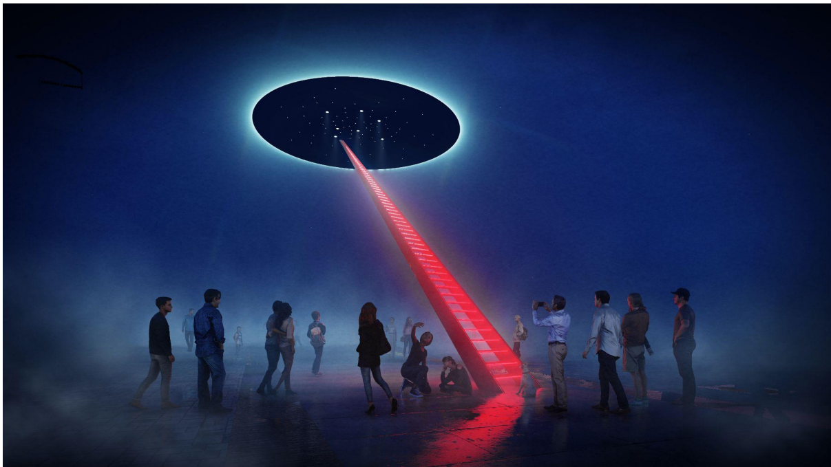
TOUCH by ORIA, an Installation at Design Shanghai 2021