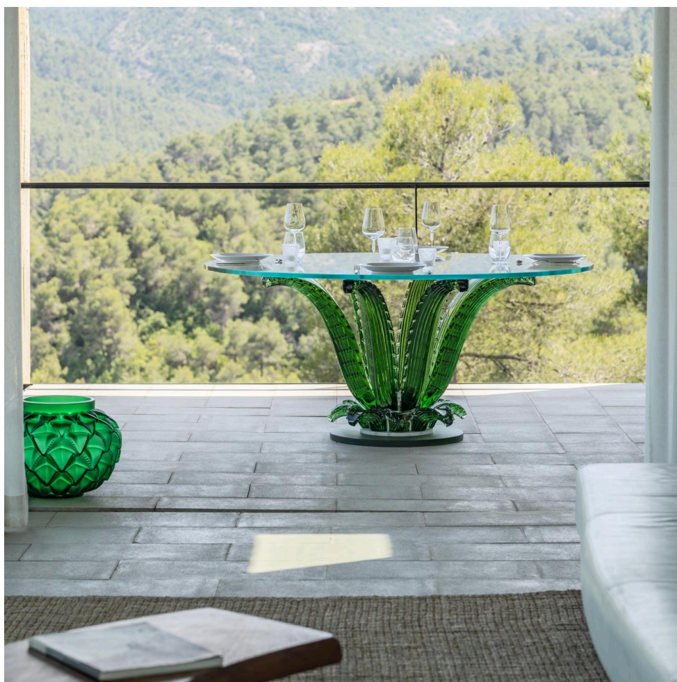
Lalique, Cactus Table (Hall 1)