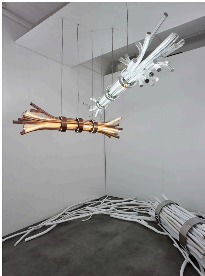
Sans Souci (Hall 1)

Kitchen and Bathroom Hall 2 presents the highest-end innovative design solutions, demonstrating quality innovation across components, materials, equipment and effective space optimization. Highlight exhibitors include the Israeli pioneer in quartz surfaces Caesarstone , German luxurious kitchen architecture brand Poggenpohl , Spanish ceramic tiles manufacturer Porcelanosa , German kitchen manufacturer SieMatic , Swiss bathroom solution brand Laufen , German-Swiss kitchen equipment manufacturer Liebherr , German bathroom and dining ceramics brand Villeroy & Boch , German kitchen supplier Leicht , Swedish home appliances manufacturer ASKO , and French sanitaryware manufacturer SFA . SieMatic will be launching three new products, the Mondial Series, New S2 Series and Grey Cabin. The Mondial series' interplay of materials, shapes and colours combines the simplicity of geometric forms with the opulence of expressive materials within the kitchen, the S2 series spotlights elegant, minimalistic furniture elements and the Grey Cabin allows the aesthetic and functional benefits of the carcasses to take centre stage.