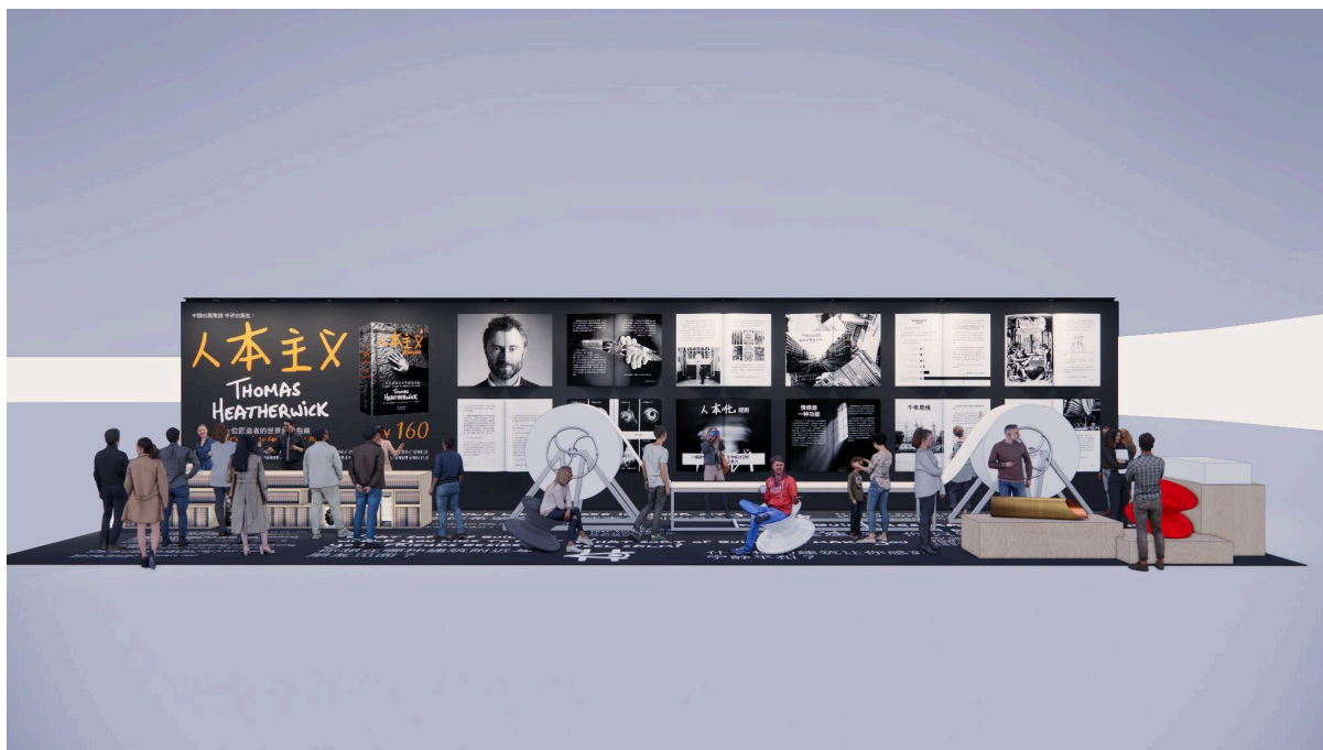
Above: Thomas Heatherwick's Humanised Scroll Stand (Hall 1)