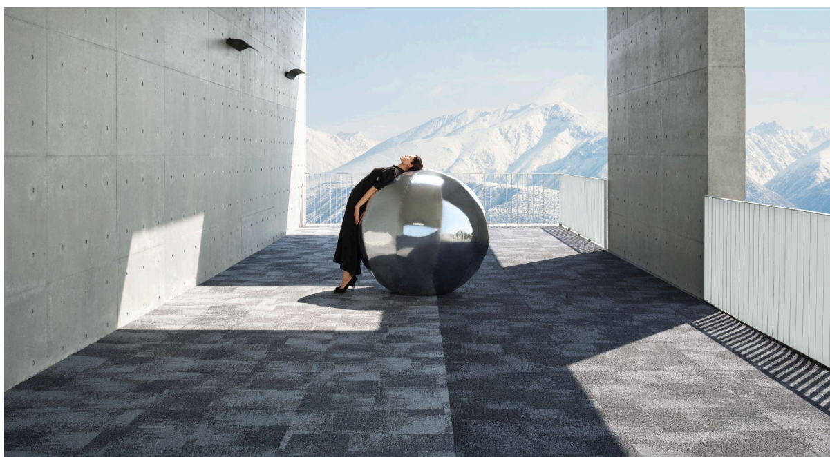
Anker (Hall 4)

Four Halls Delivering a World of Design - Placing a Global Spotlight on Acclaimed Brands and Product Launches