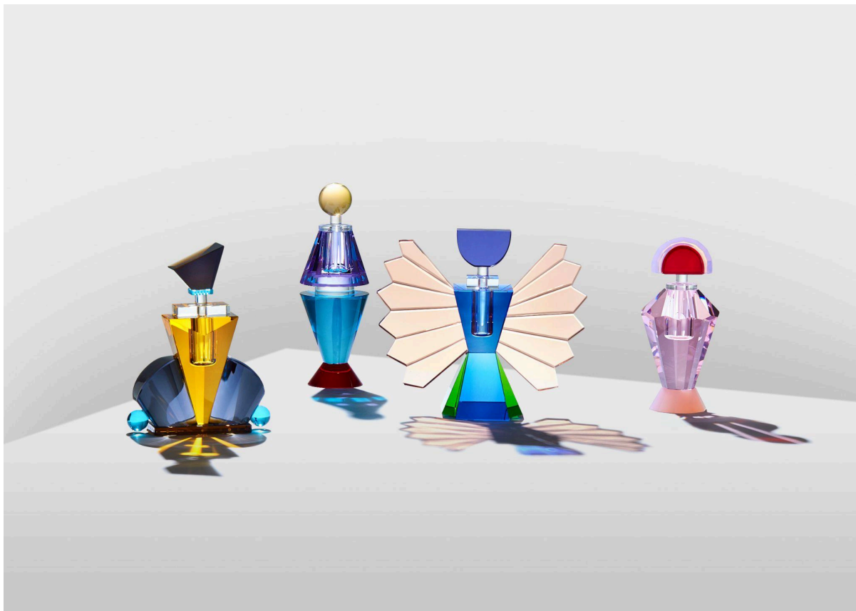
Reflections Copenhagen, Naughty Mirage Collection (Hall 3)

within hall 3 showcasing for the first time at Design Shanghai include BAOBAB , Holmegaard , LA ROCHÈRE , Chalk Paint and Sandriver .