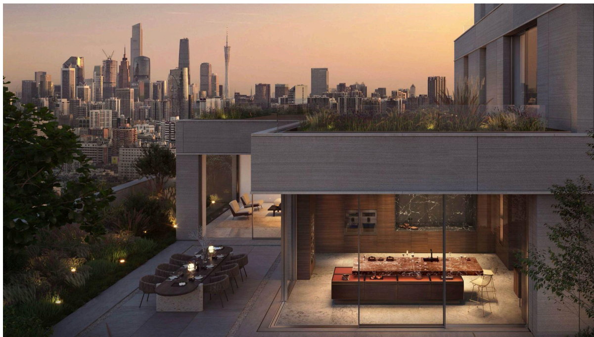
Poggenpohl, +MODO Collection (Hall 2)

designing brand Epolys . Exhibitors showcasing for the first time at the event in this hall include SFA, Basistem and Schueco .