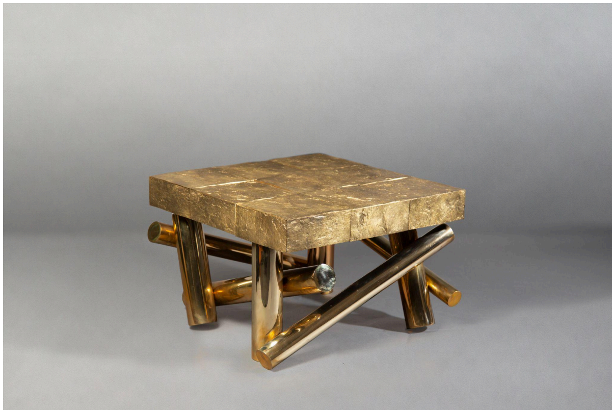
Adrian Choi Design Studio

Leading collectible galleries will showcase works from multiple categories including painting, sculpture, installation art, and photography. Exhibitor highlights for the 2024 show will include: Adrian Choi Design Studio , specialising in contemporary design with a focus on craftsmanship and design; Sailing Space , dedicated to engaging with contemporary art through professional expertise; ISLE Gallery , which focuses on emerging forces in contemporary art and strives to present forward-looking artistic language; and Yanshan Art Museum in Jingdezhen , founded by contemporary ceramic artist Li Yanxun.