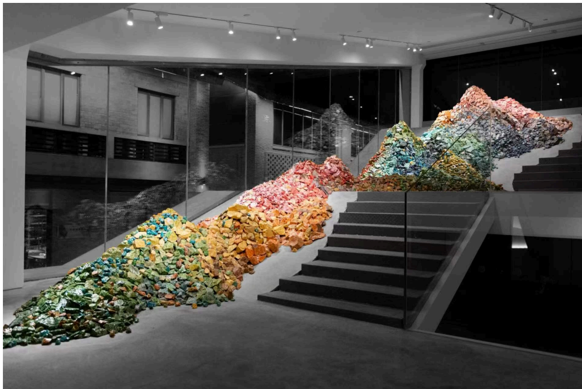
Yanshan Art Museum in Jingdezhen

Design Shanghai Announces 'Design Shanghai Collectible' The intersection between art and design